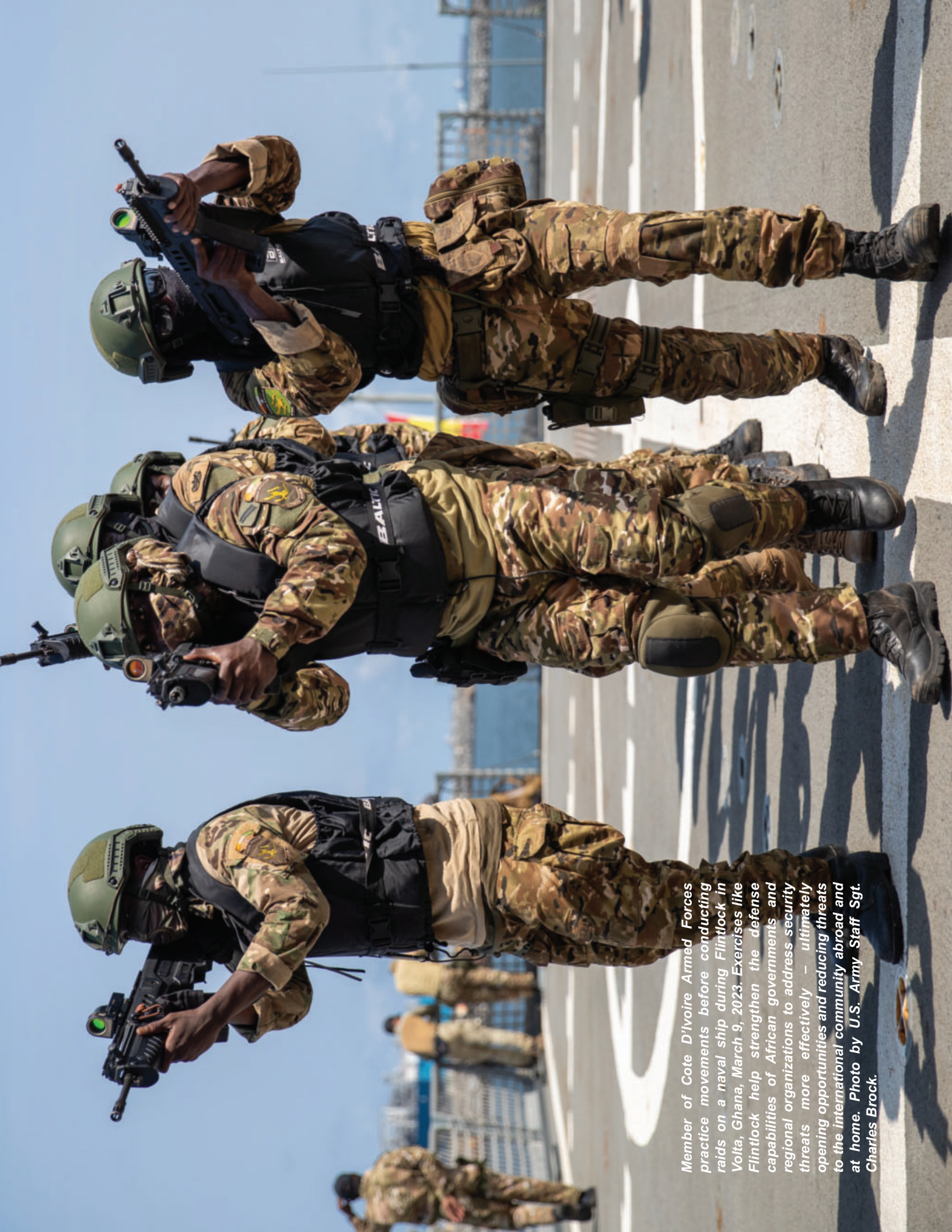
Member of Cote D'Ivoire Armed Forces practice movements before conducting raids on a naval ship during Flintlock in Volta, Ghana, March 9, 2023. Exercises like Flintlock help strengthen the defense capabilities of African governments and regional organizations to address security threats more effectively – ultimately opening opportunities and reducing threats to the international community abroad and at home.