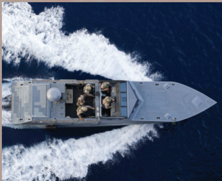
A combatant craft assault craft (CCA) assigned to special boat team 20 steams alongside the Expeditionary Sea Base USS Hershel “Woody” Williams (ESB 4) in the Mediterranean Sea, May 26, 2021. Hershel “Woody” Williams is on a scheduled deployment in the U.S. Sixth Fleet area of operations in support of U.S. national interest and security in Europe and Africa.

SBT-20’s success ties into every facet of an operational command such as “training, equipping, and manning,” said the SBT-20 Command Master Chief. “The SBT-20 Task Group is a great example of this, the Battle ‘E’ award confirms and reinforces the command’s ‘Brilliant on the Basics’ approach to excellence,” he said. “The command’s