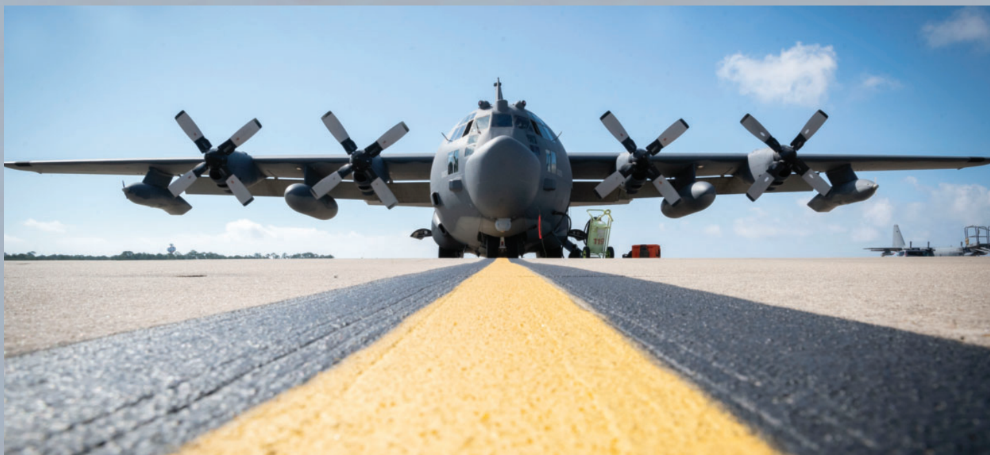
The MC-130H Combat Talon II used for the airframe’s final flight under the 492nd Special Operations Wing is photographed before take-off at Hurlburt Field, Florida, May 31, 2022. Combat Talon IIs first arrived at Hurlburt June 29, 1992, and after acceptance testing, began official flying operations Oct. 17, 1992.

89-0283: This aircraft was the fourth of four Talons that opened OEF as a Rhino Raider in 2001. Rhino LZ was the first combat airfield seizure in Afghanistan in 2001. Additionally, 0283 conducted the exfil of Hamid Karzai on November 4, 2001. This aircraft also conducted a BLU-82 drop on Masir-e-Sharif and participated in the 2008 Colombia hostage rescue.