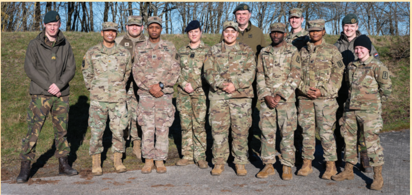
U.S. Army Preventive Medicine Specialists, assigned to the 71st Medical Detachment, 421st Multi-Functional Medical Battalion, and Preventive Medicine Specialists from Royal Netherlands Army pose for a photo after the multinational preventative medicine pre-deployment training event at U.S. Army Garrison Baumholder, Germany, Feb. 7, 2023. This training focused on increasing interoperability between the two countries as they prepare for Flintlock 2023.