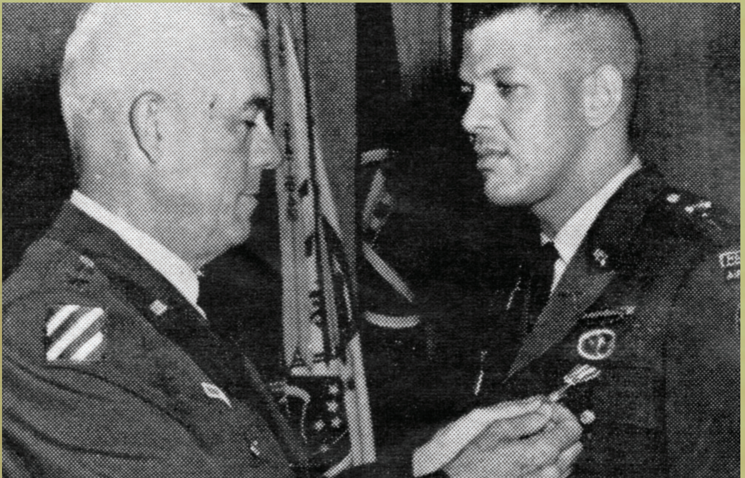
Capt. Paris Davis is awarded a Silver Star on Dec. 15, 1965. Davis received the award for his actions during a battle in Bong Son, Republic of Vietnam, June 17-18, 1965.

Davis retired as a colonel after serving more than 25 years in the Army. In 2019, he was inducted into the U.S. Army Ranger Hall of Fame.