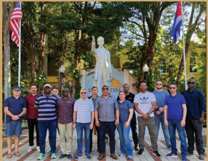
The students of the Countering Violent Extremism course participate in the field studies program which includes a tour of the Ybor City Historic District, Feb 6, 2023. While learning about the local history of Tampa, Florida, they create lasting relationships with other fellow classmates.

“As we prepare to go overseas, this course has