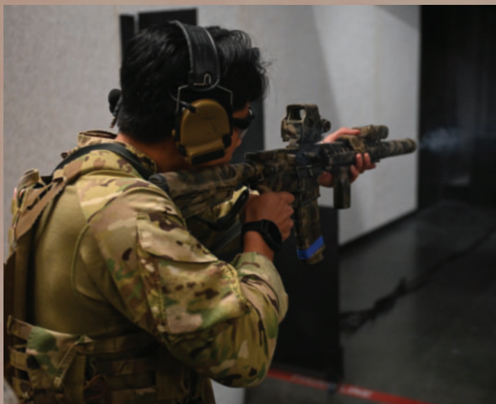
His Royal Highness Prince Abdul Mateen of Brunei fires an M4 carbine rifle during a visit to West Coast-based Naval Special Warfare units.