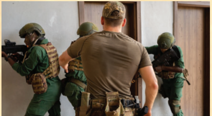
Ivorian Special Forces Soldiers conduct building clearance training, led and instructed by Netherland Special Forces, in a shoot house during Flintlock 23 near Abidjan, Côte d'Ivoire, March 2, 2023.