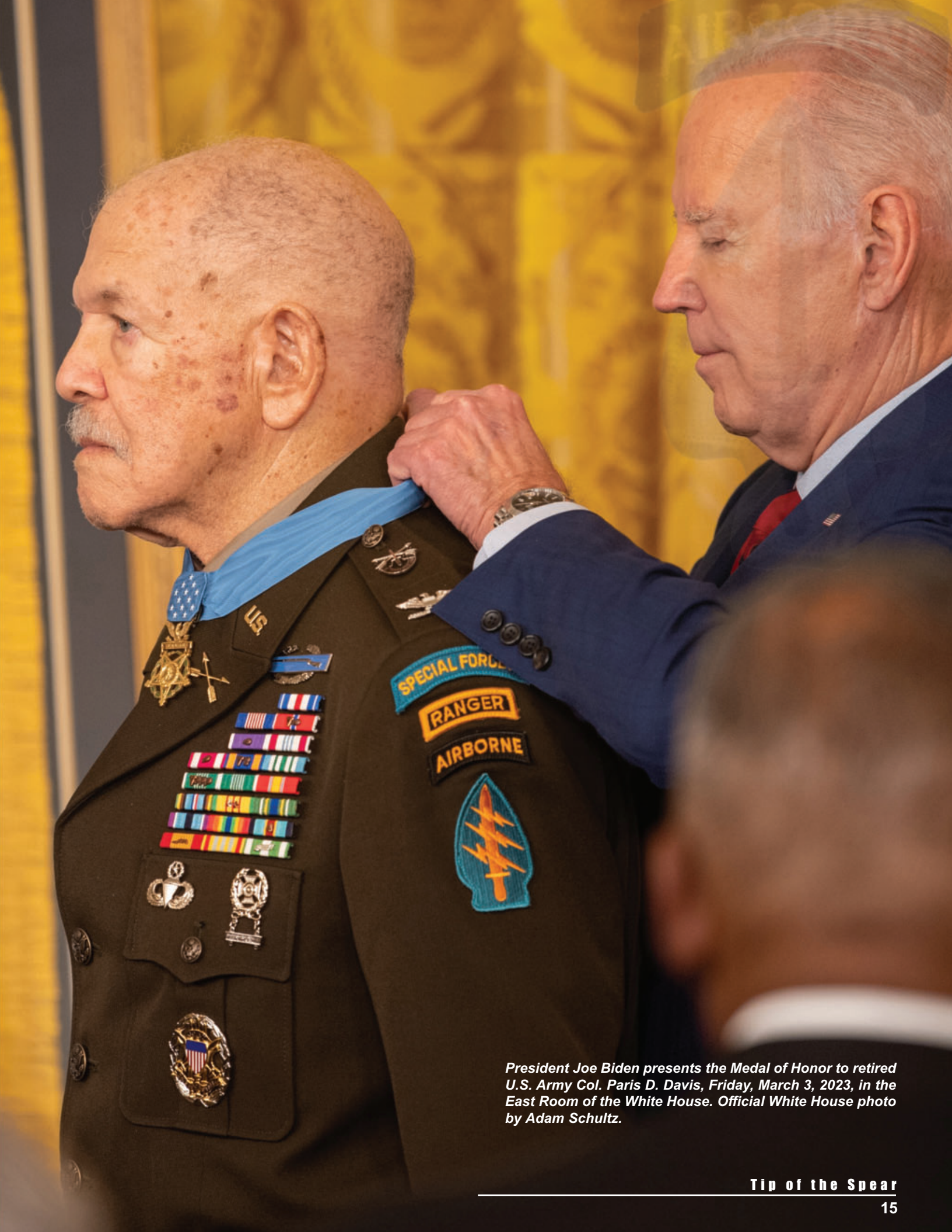
President Joe Biden presents the Medal of Honor to retired U.S. Army Col. Paris D. Davis, Friday, March 3, 2023, in the East Room of the White House.