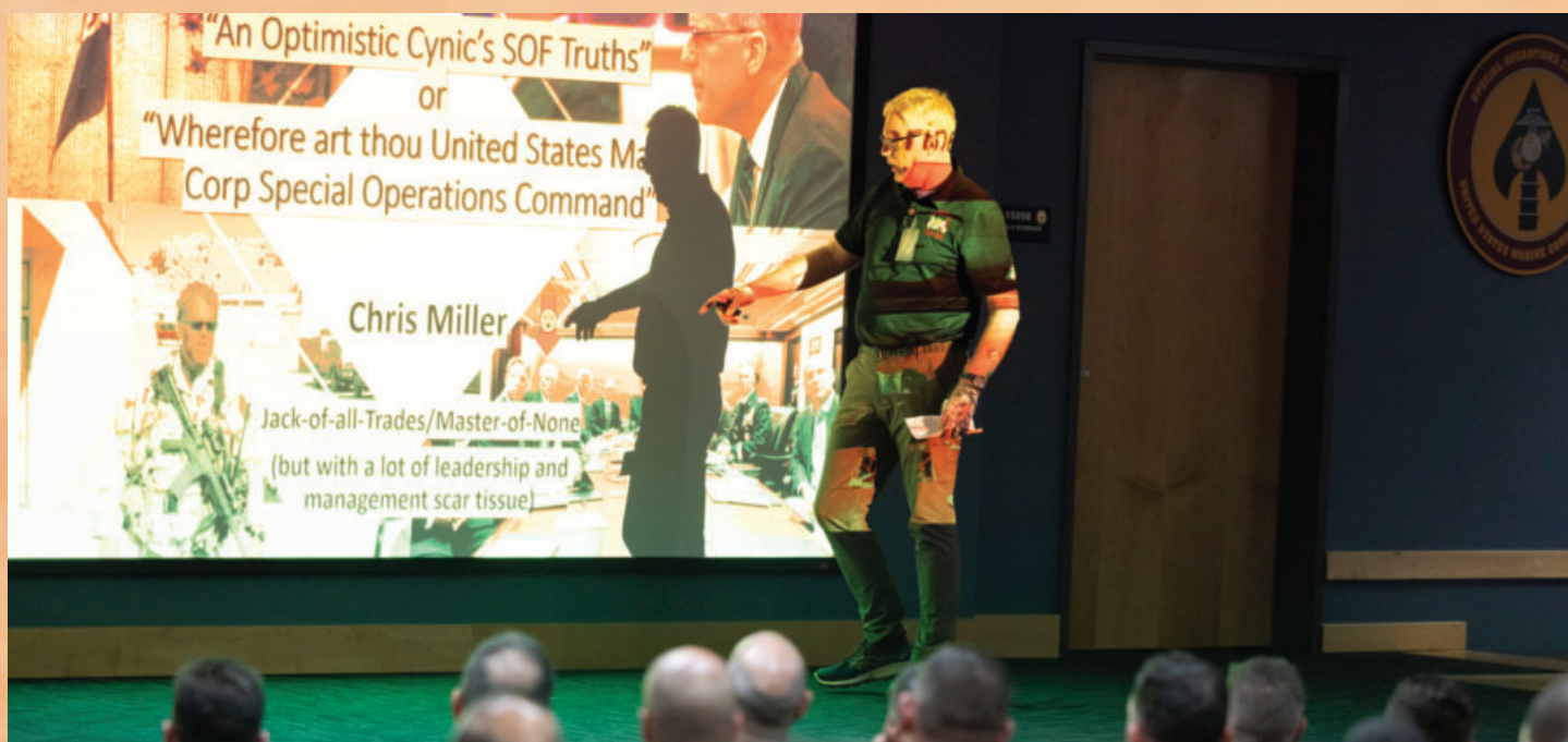
Christopher C. Miller, former Acting Secretary of Defense, visits Marine Forces Special Operations Command as part of the Cognitive Raider Education Series on Camp Lejeune, North Carolina, Mar. 24, 2023. Miller shared his views on organizational dynamics and what winning looks like for special operations forces.

While MARSOC continues to examine, improve, and validate its training to provide high-performing MARSO, the command also began an annual educational symposium to advance critical and creative thinking around topics vital to the future operating environment. The inaugural Cognitive Raider Symposium took place in 2019 when Marine Raiders partnered with the Naval Postgraduate School’s Defense Analysis Department to examine irregular warfare. Since the first symposium, MARSOC partnered with NPS on subsequent themes covering great power competition and enterprise-level agility as