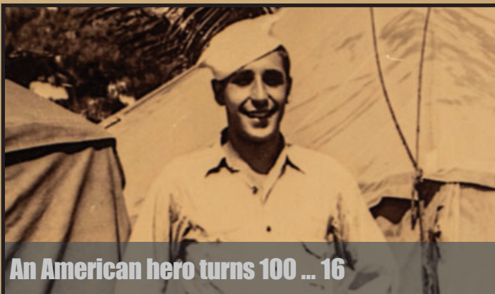
An American hero turns 100 ... 16