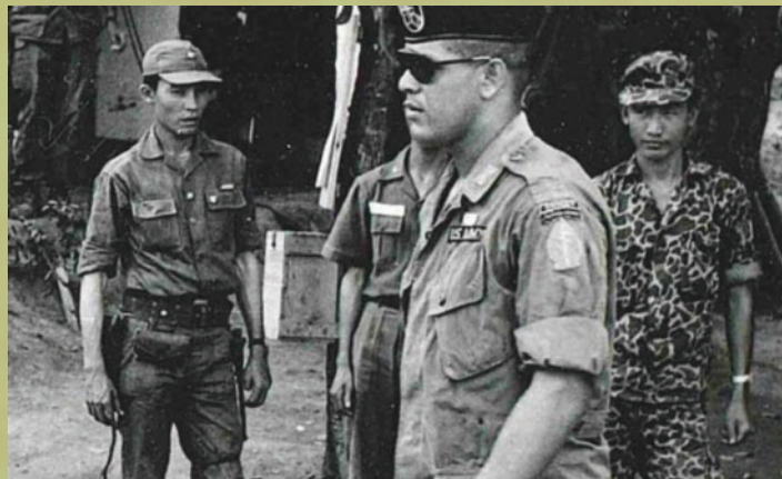
Capt. Paris Davis, while in Vietnam, 1965.

On one late night patrol, Davis could hear snoring out in the shrubs. He searched and searched and eventually snuck up on an enemy soldier asleep on guard duty. After capturing him, the team found another unsuspecting soldier sleeping.