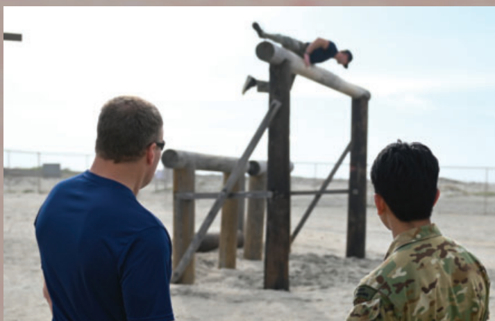
His Royal Highness Prince Abdul Mateen of Brunei, right, and a service member assigned to Naval Special Warfare Basic Training Command watch an obstacle course demonstration during a visit to West Coast-based Naval Special Warfare units.

The tour also included a visit to the NSWG-1 combat training tank where naval commandos train to conduct high-risk aquatic evolutions. The force is placing a renewed emphasis on missions that only NSW can do on, and high-risk aquatic evolutions equips and prepares NSW Sailors to