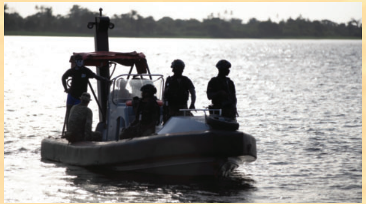
Flintlock African partners maneuver towards a beach intended for an upcoming raid during Flintlock in Volta, Ghana, March 13, 2023. Flintlock is U.S. Africa Command's premier and largest annual special operations exercise that strengthens key partner nations throughout Africa, in partnership with other international special operations forces.