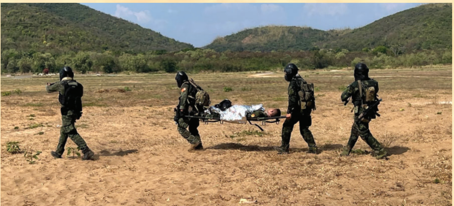
Royal Thai Navy Special Warfare operators rehearse a medical evacuation during Flash Torch 2023-1, a joint combined training exercise built upon the two forces' long-standing relationships and interoperability in the Indo-Pacific, Sattahip, Thailand Feb. 13, 2023.

The upcoming Cobra Gold 2023 exercise is the 42nd iteration and is set for a full-scale revival since the pandemic. The Thailand and U.S. co-sponsored exercise is conducted annually in the Kingdom of Thailand and will be held from Feb. 27 – Mar. 10, 2023, with seven full participants (Thailand, U.S., Japan, Indonesia, Republic of Korea, Singapore, Malaysia), three limited participants (Australia, India, China) and ten Multinational Planning Augment Team participants.