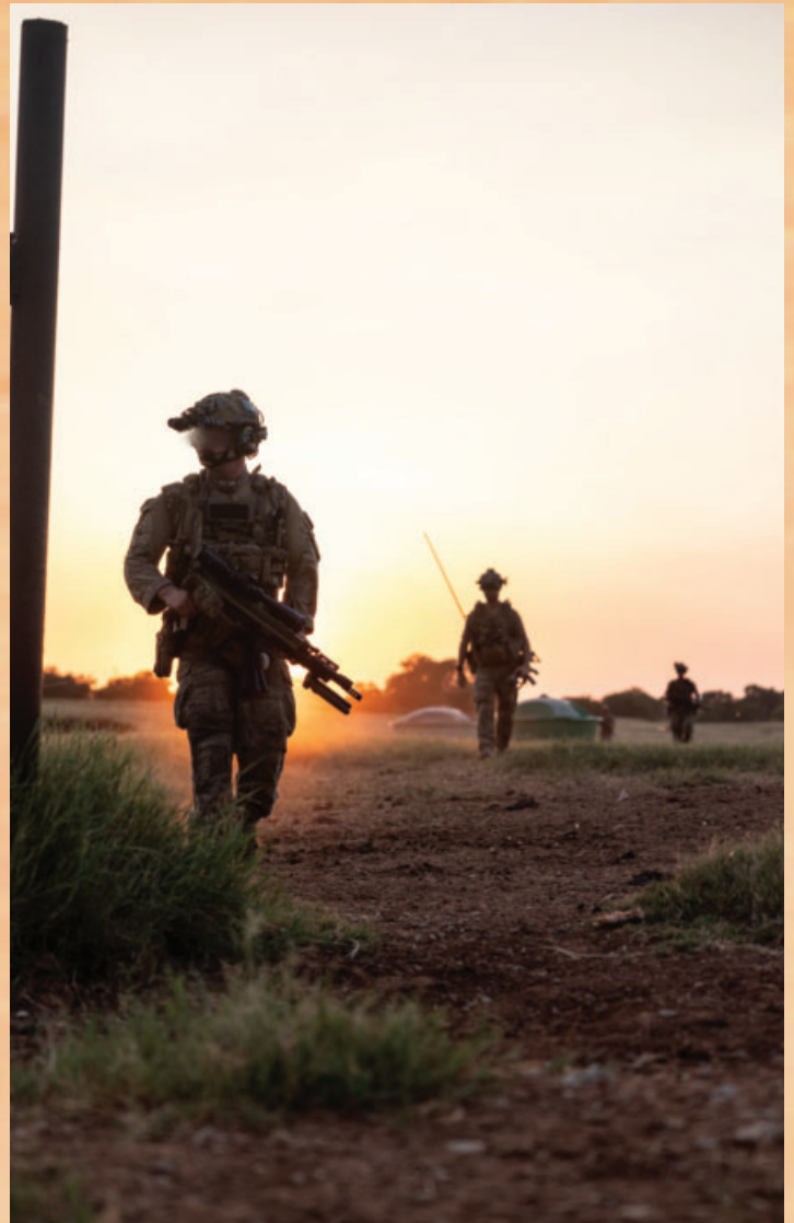
Explosive ordnance disposal technicians with Marine Forces Special Operations Command and Air Force Special Operations Command conduct a patrol alongside critical skills operators during a training event June 24, 2022.