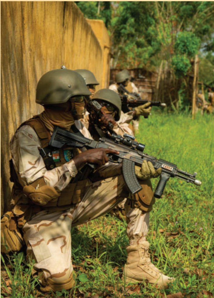
Niger Soldiers pull security on a simulated village during Flintlock near Abidjan, Cote d'Ivoire, March 4, 2023. Multinational headquarters operations will test and strengthen participants' ability to collectively address regional security challenges through a comprehensive scenario involving command and control of simulated participants at various outstations.