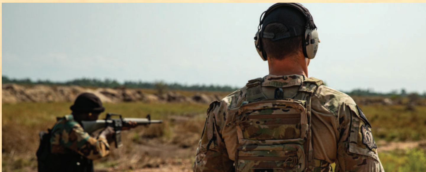
A U.S. Marine Corps Marine observes the firing technique of a member of Ghana's Armed Forces during Flintlock in Accra, Ghana, March 8, 2023. Flintlock is an exercise focused on improving military interoperability and fostering cross-border collaboration.

U.S. Africa Command sponsored exercises bolster partnerships between African, U.S., and other international military and law enforcement organizations, increasing interoperability during crises and operations to increase security and stability in the region.