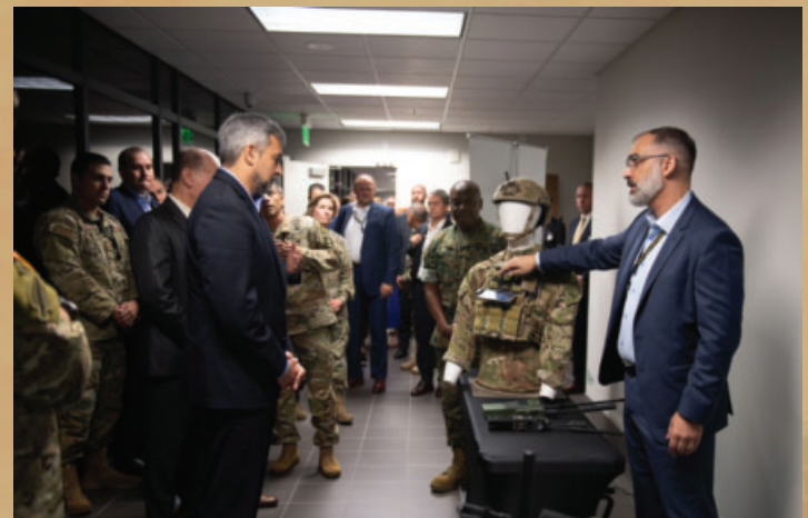
Paraguayan President Mario Abdo Benítez receives a briefing on Special Operations Forces equipment at U.S. special operations command headquarters, MacDill Air Force Base, Fla., March 30, 2023.

Paraguay also has a State Sponsorship Program relationship with Massachusetts. The state’s Army and Air National Guard have completed more than 100 exchanges with their South American defense counterparts.