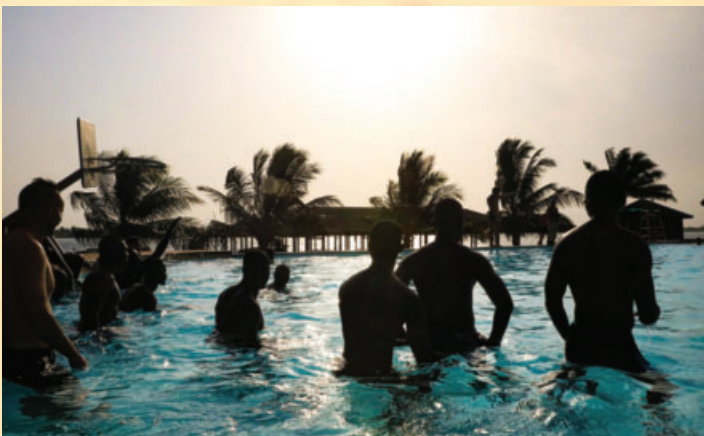
Special Operations Forces from the Ghanaian Special Boat Service (SBS) await instruction for the phase of their swim Flintlock swim examination, in Volta, Ghana, March 2, 2023. These exercises and engagements highlight and improve joint force capabilities across all domains and strengthen relationships with partners in Africa and worldwide.