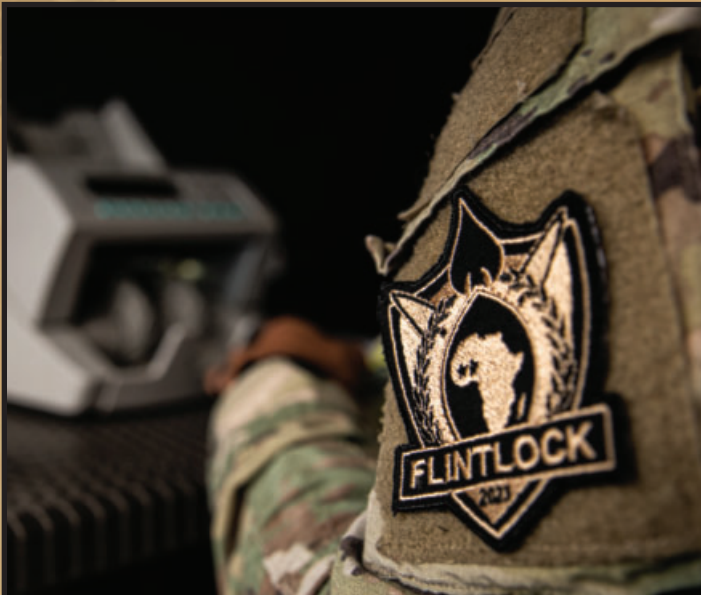
AFRICOM's SOF exercise kicks off in Ghana, Cote d'Ivoire ... 8