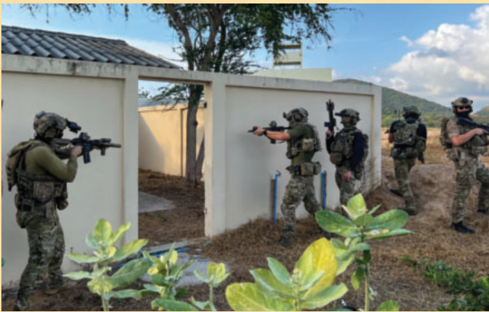
U.S. Naval Special Warfare operators rehearse a direct-action mission during Flash Torch 2023-1, a joint combined training exercise built upon the two forces' long-standing relationships and interoperability in the Indo-Pacific near Sattahip, Thailand, Feb. 12, 2023.

Thai training sessions together, and even the exchanging of patches, memorabilia and sharing the history of each other's units and cultures – those deep personal connections are strengthened and forge a stronger shared interest of community.”