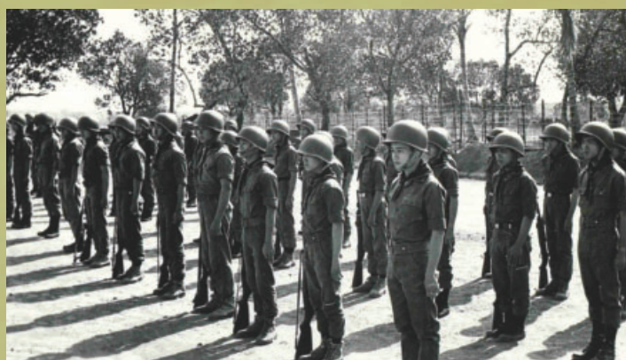
Soldiers assigned to the 883rd Regional Forces stand in formation during training led by Capt. Paris Davis, 5th Special Forces Group (Airborne), 1st Special Forces at Camp Bong Son, Vietnam, 1965.

That tenacious appetite for knowledge led him to Southern University in Baton Rouge, Louisiana, where he studied political science and sociology.