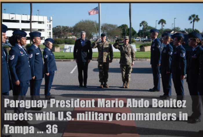
Paraguay President Mario Abdo Benitez meets with U.S. military commanders in Tampa ... 36