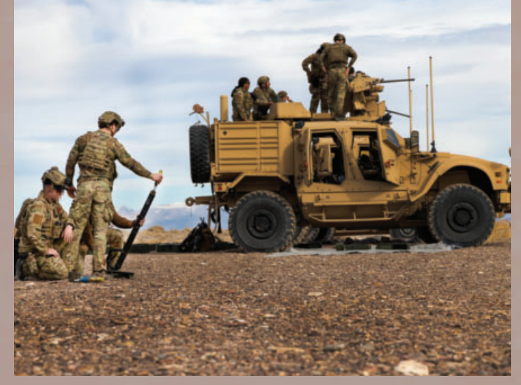
East Coast-based Naval Special Warfare Operators (SEALs) fire a M224 mortar during Exercise Dragon Trident 1 at Fallon, Nevada, Jan. 30, 2024. This joint exercise gave SEALs and 9th Security Forces Airmen from Beale Air Force Base an opportunity to train on various weapons systems, increasing their efficiency and lethality.

On the second day of training, Beale Airmen went to the firing range to train on the M-249 light machine gun, M-240 machine gun, M-4 carbine and P320-M18 pistol. They also utilized the Common Remotely Operated Weapon Station (CROWS) system inside Mine Resistant Ambush Protected