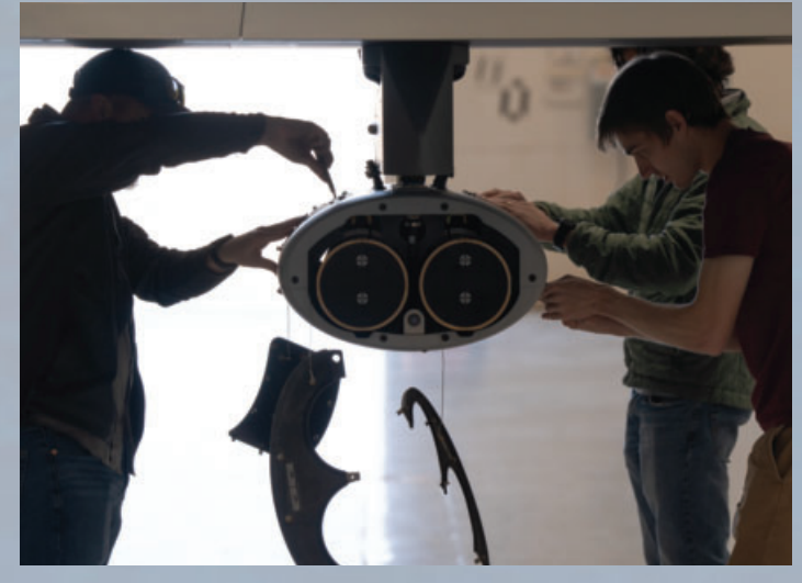
Altius employees perform pre-flight checks on a dual launch pod attached to an MQ-9 Reaper before an Airborne Adaptive Enterprise (A2E) demonstration at Cannon Air Force Base, N.M., Nov. 28, 2023. Adaptive Airborne Enterprise will utilize large and small uncrewed aircraft systems at scale, including a mix of attritable and expendable systems with modular payloads.

By collaboratively pathfinding alongside defense industry partners and innovative Air Commandos, A2E will transform the current AFSOC MQ-9 enterprise into the robust UAS architecture required to deliver specialized airpower to current and future fights: any place, anytime, anywhere.