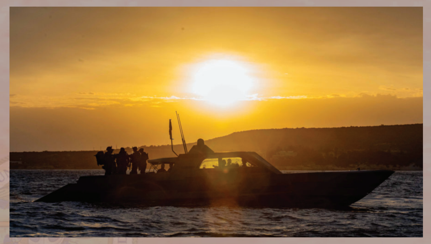
East Coast-based U.S. Naval Special Warfare Operators (SEALs) and Special Warfare Combatant-Craft Crewmen (SWCC) conduct maritime training with Cypriot Underwater Demolition Command (MYK) forces near Limassol, Cyprus on Jan. 25, 2024.