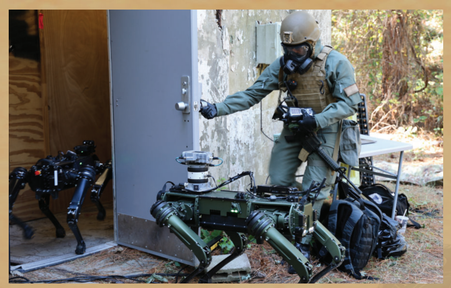
A service member participates in a simulated CBRN training scenario during RDAX Dragon Spear 2023. The service member wears the uniform integrated protection ensemble family of systems general purpose (UIPE FOS GP) suit and M50 joint service general purpose mask (JSGPM) and uses robot dogs equipped with CBRN sensors.

The RDAX Dragon Spear experiment offered a unique environment for JPEO-CBRND developers to work directly with and get feedback from the joint force——the men and women who will one day rely on these technologies to protect them and their battle buddies from some of the scariest threats imaginable. Ultimately, RDAX Dragon Spear reinforced the JPEO-CBRND's role as the Department's lead for advanced development and rapid delivery of critical CBRN capabilities to the warfighter.