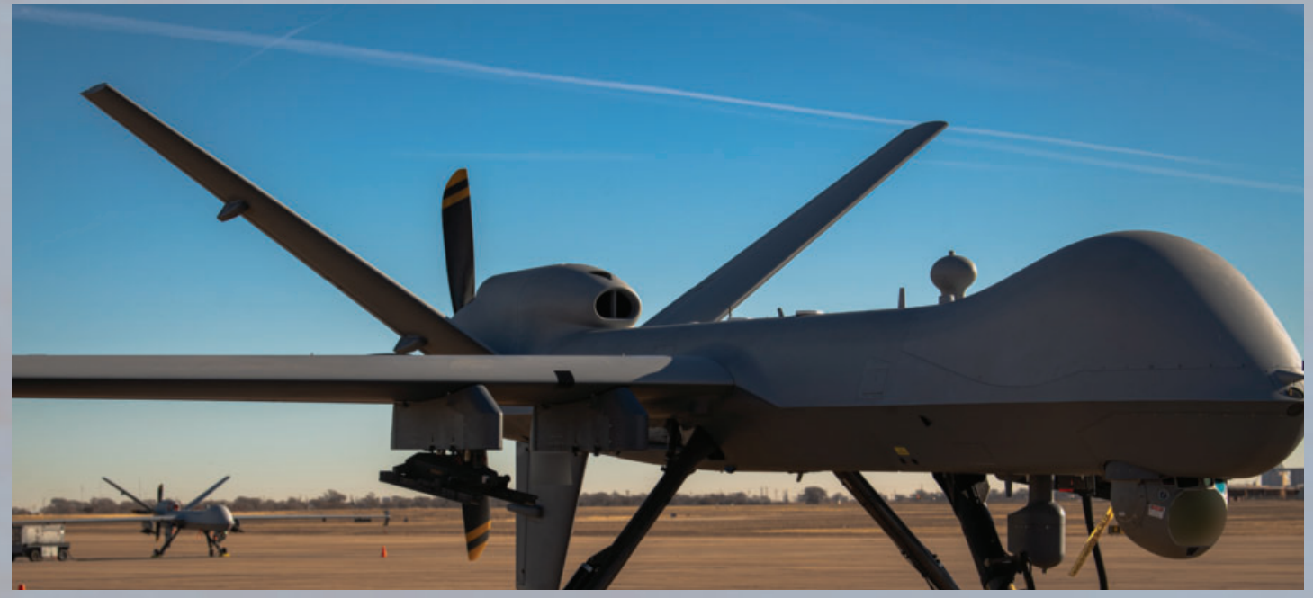
Two MQ-9A Reaper remotely piloted aircraft operated by the 3rd Special Operations Squadron undergo pre-flight checks before an experimental multi-aircraft control flight for the Adaptive Airborne Enterprise (A2E) at Cannon Air Force Base, N.M., Dec. 6, 2023. MQ-9 units will leverage multiple platforms and later incorporate autonomy to deliver capabilities to special operations forces and the joint force across the spectrum of operations. This photo has been edited for security purposes by blurring out aircraft information.

A2E is broken into five phases, with the first three phases currently underway.