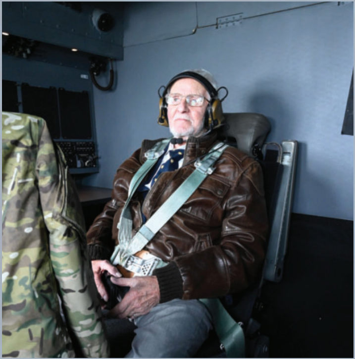
The 352nd Special Operations Wing hosted World War II Chindit veterans, their families and representatives of the Chindit Society, in a celebration of Air Commando heritage as well as the camaraderie between U.S. and U.K. special operations forces, RAF Mildenhall, United Kingdom, Jan. 24, 2024.

The 352 SOW and the Chindit Society look to continue their strong partnership through events such as Chindit Reunions, the Wing's Formal Dining Out, and other collaborations between the U.S. and the U.K.