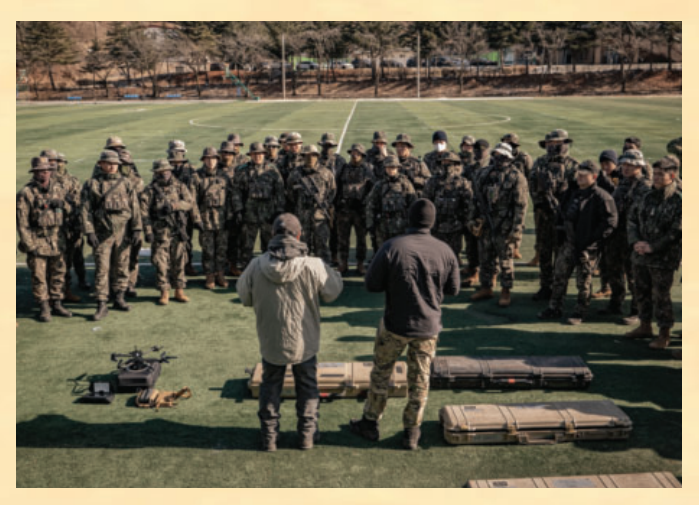
U.S. Navy's Naval Special Warfare Command facilitators (center) prepare to demonstrate the capabilities of various weapons and reconnaissance aides during a combined training event with Republic of Korea Army soldiers assigned to the 701st Brigade at Paju, ROK, on Jan. 26, 2024. The combined team later participated in a special reconnaissance field exercise, helping individuals practically apply the skills they learned.

Training iterations like these build trust and confidence between ROK and U.S. SOF personnel should they ever need to respond to mutual defense requirements. During both teams' training