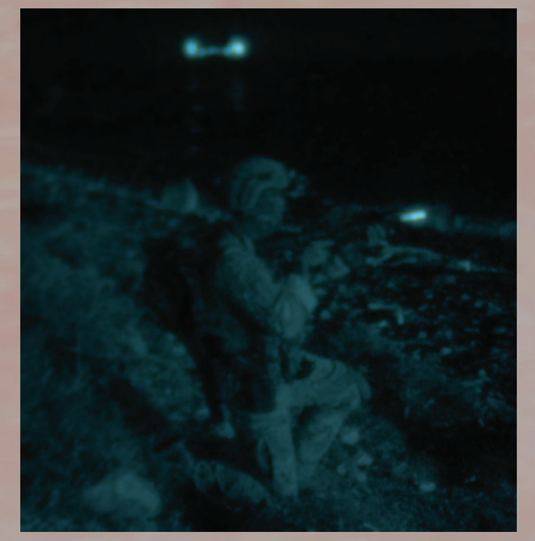
East Coast-based U.S. Naval Special Warfare Operators (SEALs) and Special Warfare Combatant-Craft Crewmen (SWCC) conduct over the beach training with Cypriot Underwater Demolition Command (MYK) forces near Limassol, Cyprus on Feb. 1, 2024.

Naval Special Warfare Group TWO produces, supports, and deploys the world's premier maritime special operations forces to conduct fullspectrum operations and integrated deterrence in support of U.S. national objectives.