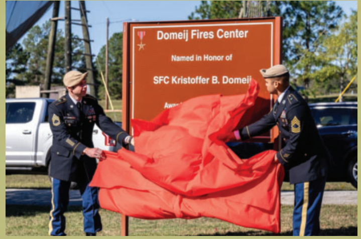
Rangers Fires Supporters with the 75th Ranger Regiment unveil the sign for the Domeij Fires Center. After four years of planning, collaboration, design, and renovation, the U.S. Army's 75th Ranger Regiment cut the ribbon on the Domeij Fires Center on Nov. 2, 2023, marking its grand opening.

"The rest of the joint force was on the ropes," he