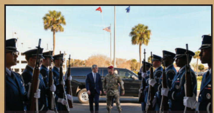
USSOCOM hosts NATO secretary general during visit with SOF members ... 34

Top Army's generals for cyber, space and special operations convene for Triad partnership ... 10