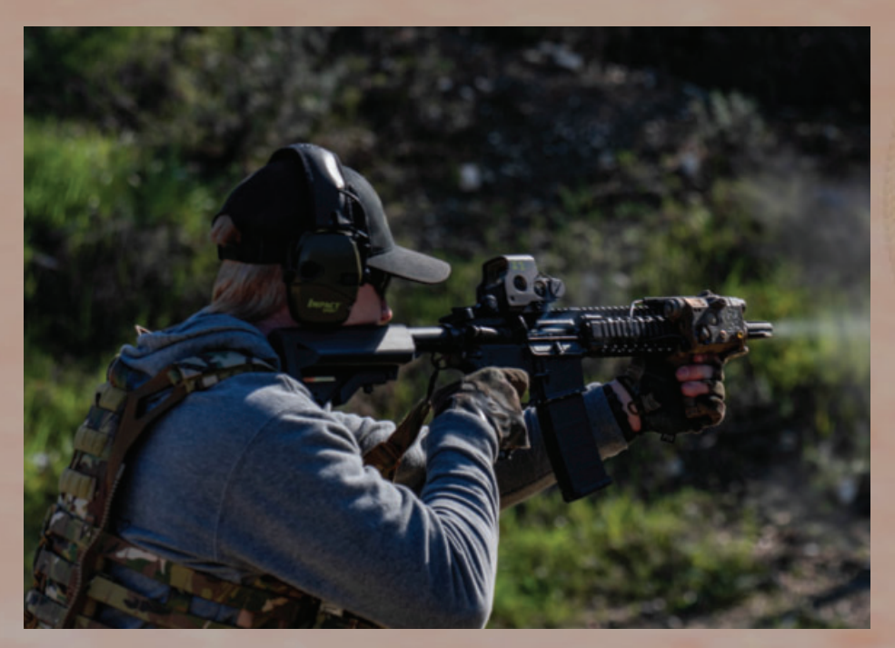
East Coast-based U.S. Naval Special Warfare Operators (SEALs) and Special Warfare Combatant-Craft Crewmen (SWCC) conduct live fire weapons training with Cypriot Underwater Demolition Command (MYK) forces near Limassol, Cyprus on Jan. 29, 2024. This training strengthens the relationship between U.S. Special Operations Command Europe and its Allies and partners throughout Europe, reinforcing the United States commitment to the region.

any aggression will be met with a swift, unyielding response."