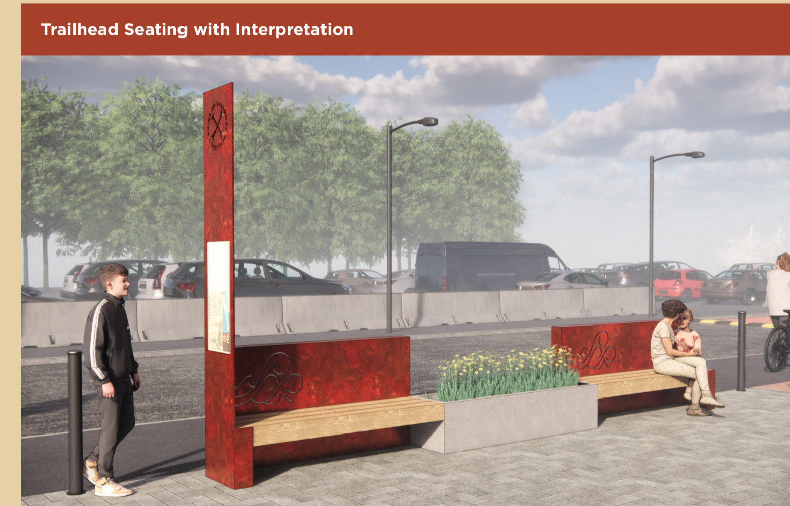
Trailhead Seating with Interpretation

The route will be marked from there with fingerposts and interpretive signage, all featuring the eye-catching coast path logo and a distinctive palette of colours and materials.