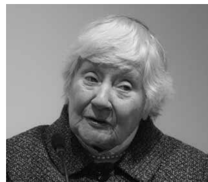
Baroness Williams of Crosby (Shirley Catlin, 1948) speaking at the Somerville Winter Meeting

Marigold Robins published in 2016 Twenty First Century Town: The Service Town , and sent a copy to the library. Marigold writes: 'It discusses how present town layouts are out-of-date. They prevent the installation of many useful services: the provision of family care services such as child care, for old/disabled people, of automatic transport for people and goods (no drones) – all within 100m of every dwelling in the town. But nobody challenges town layout. Look at Bicester, a "new" town still being built. The usual suburb layout with few local facilities and needing a car/bus/roads to get anywhere useful. Time and space waste. Time for a new kind of town.'