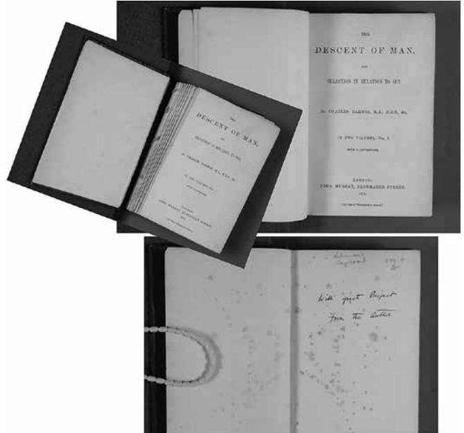
Darwin's Descent of Man