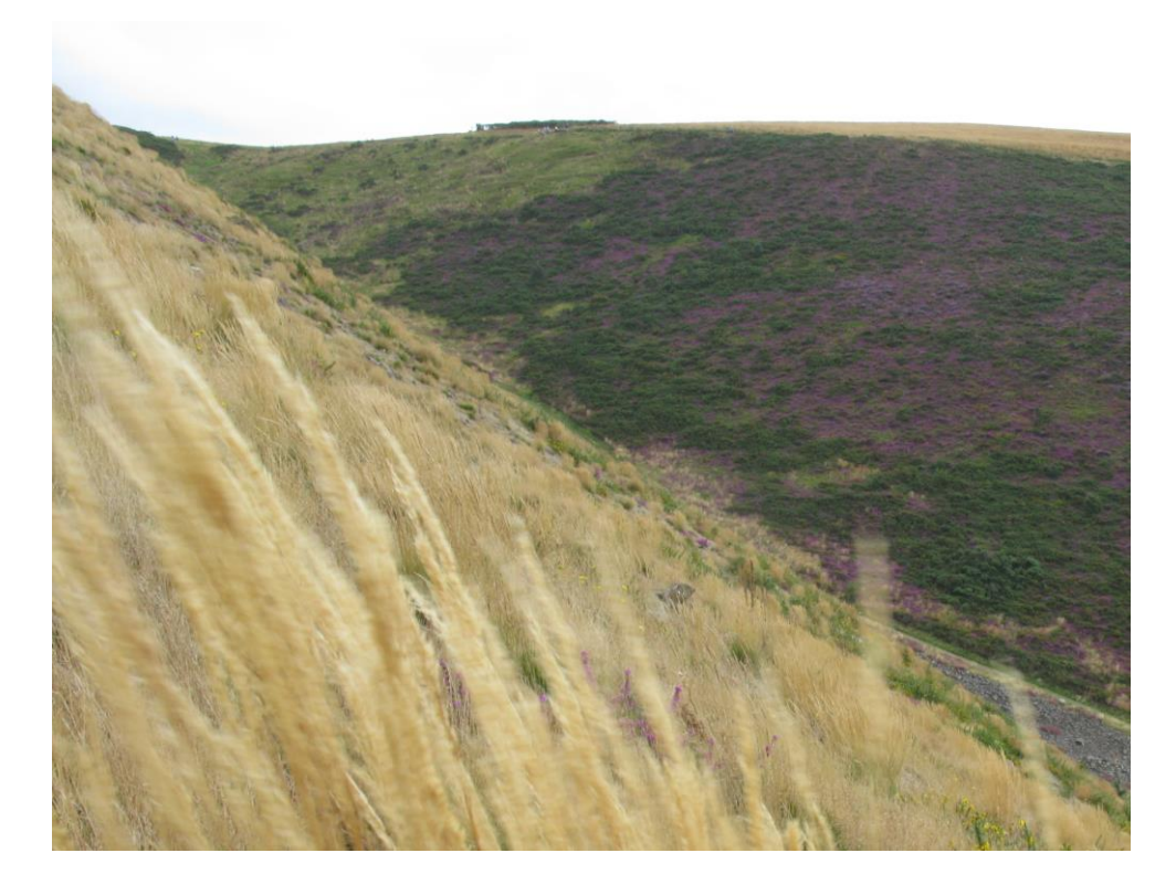
Swathes of Agrostis curtisii at Hurlestone Point (2008).