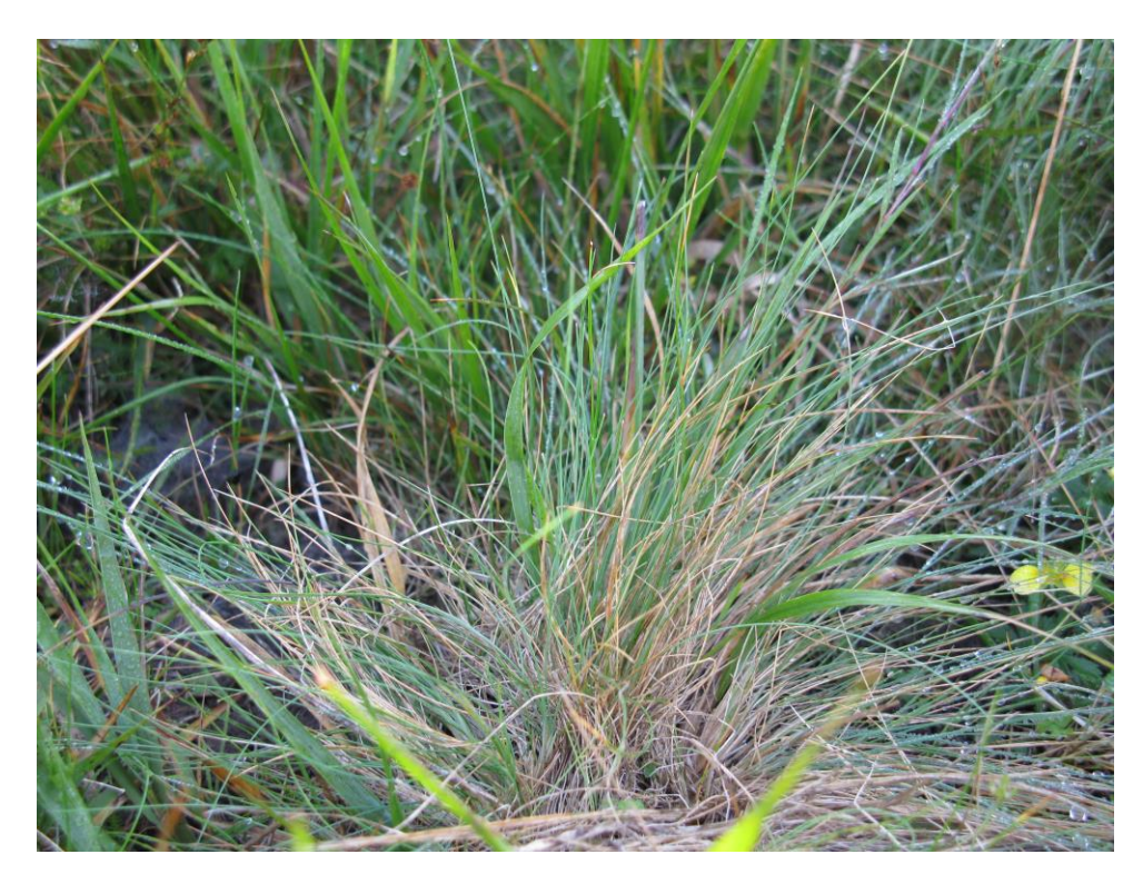
Agrostis curtisii on Black Down, Mendip (2008).