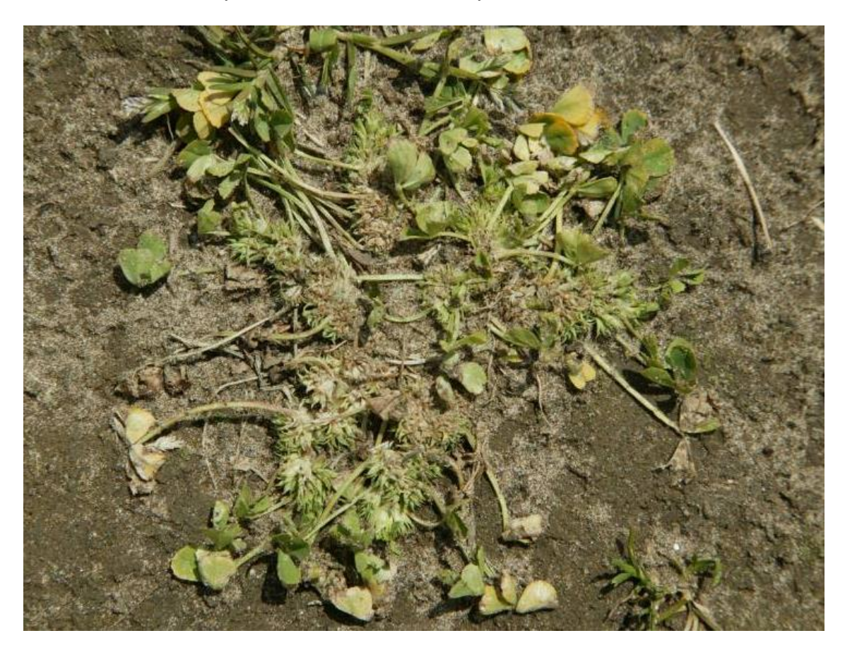
Trifolium suffocatum at Weston-super-Mare Sea Lawns (2011).