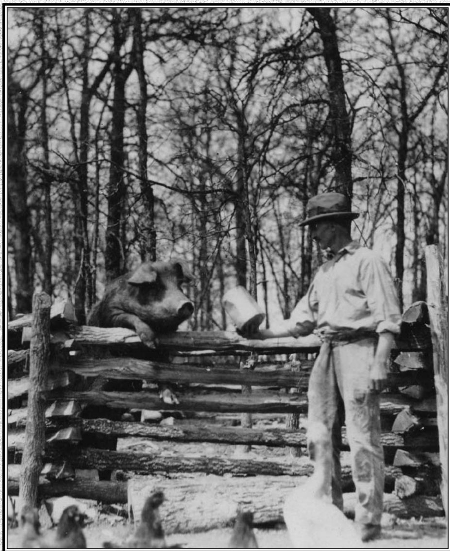
Man Feeding Pig