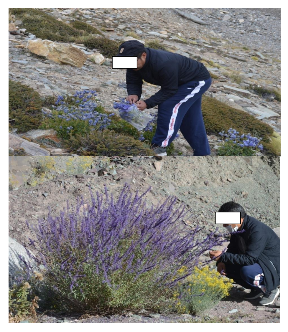
Fig.2. Collection of herbarium specimen and raw drug from different location