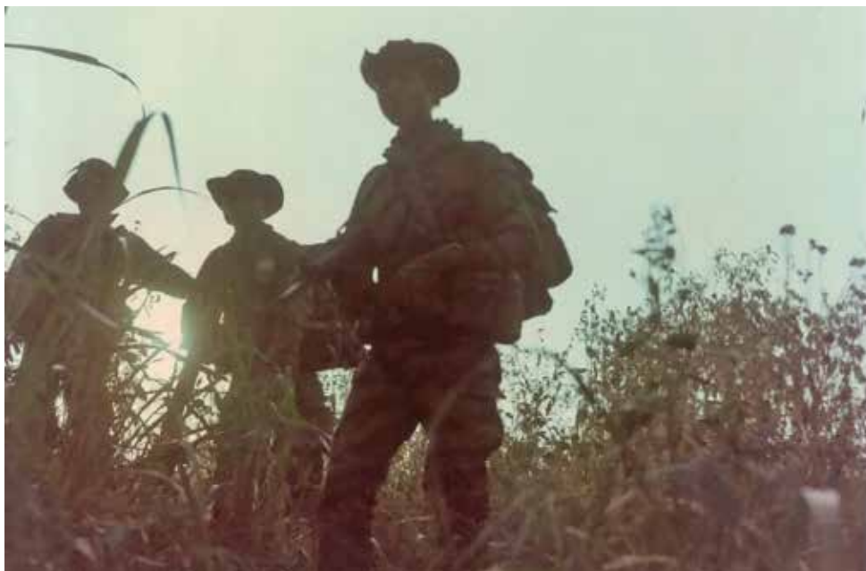
CIDG soldiers.

Those Border Rangers who survived the onslaught and subsequent executions and were not able to flee to Cambodia were taken prisoner and sent by the NVA to “re-education”/concentration camps only to suffer the depravity of lack of food and medicine,