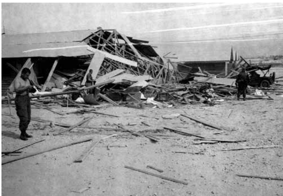
Damage at FOB 4 after the attack.