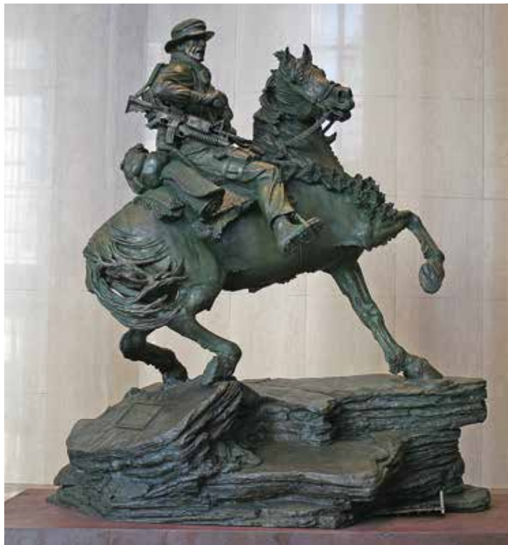
The sculpture The Horse Soldier is dedicated to the United States Special Forces and commemorates the servicemen who fought in the early days of Operation Enduring Freedom. It was created by sculptor Douwe Blumberg. Photo credit: "America's Response Monument-De Oppresso Liber.jpg" by Douwe Blumberg is licensed under CC BY 3.0