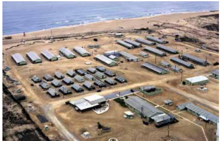
At top of page and directly above, FOB 4 three years after attack — layout is similar to original.