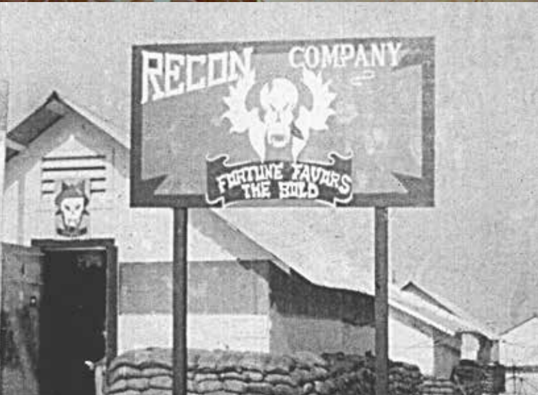
FOB 4, CCN, the site of the assault.