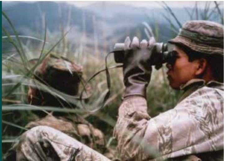
"Montagnards in field"