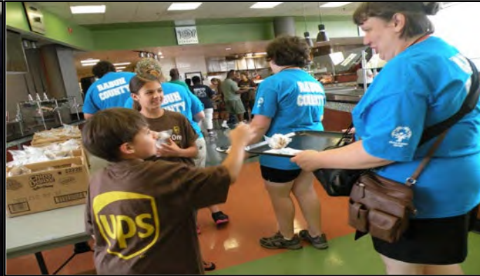
UPS provides financial support to help SOGA serve more athletes at state games and year-round. UPS employees and their families volunteer to serve meals at State Summer Games each year.