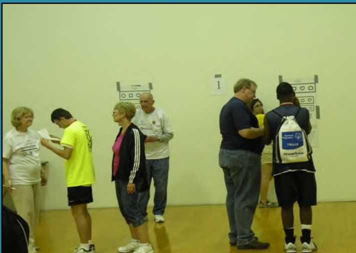
The Special Olympics Healthy Athletes Initiative includes several disciplines: Fit Feet, FUNfitness, Health Promotion, Healthy Hearing, Opening Eyes and Special Smiles.