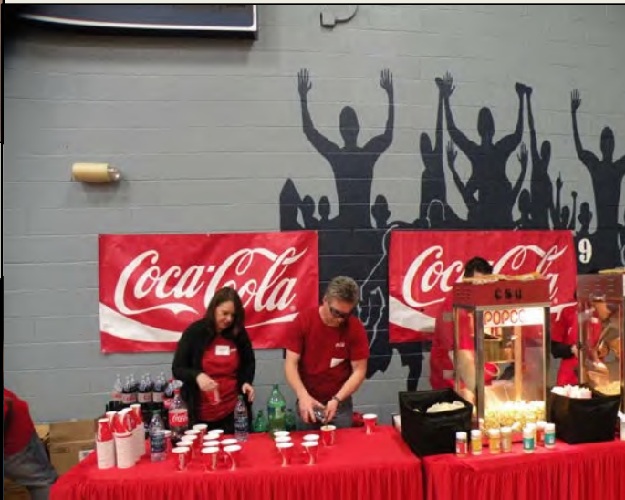
The Coca-Cola Company generously supports Special Olympics Georgia through monetary and product donations. It also provides hands-on volunteer assistance during our state competitions and hosts various events for our athletes.

Without our sponsors and dedicated partners, we would not be able to provide sports opportunities for the athletes. Sponsors helped more athletes than ever before achieve goals by helping cover expenses of sports training and competition.