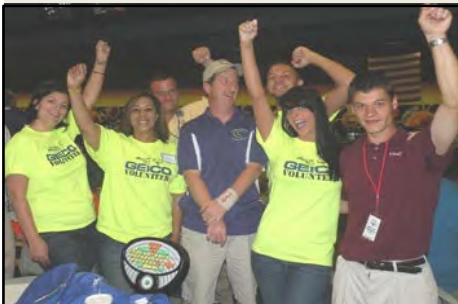
Every March, GEICO hosts a Road Race and/or Walk to benefit SOGA, raising more than $700,000 cumulatively.