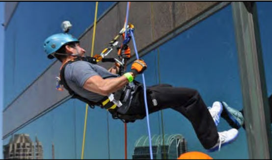
Over the Edge raised $186,000 and featured 125 brave souls who rappelled down a 20-story building.