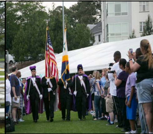
At each State Games, Knights of Columbus members present colors for SOGA at Opening.