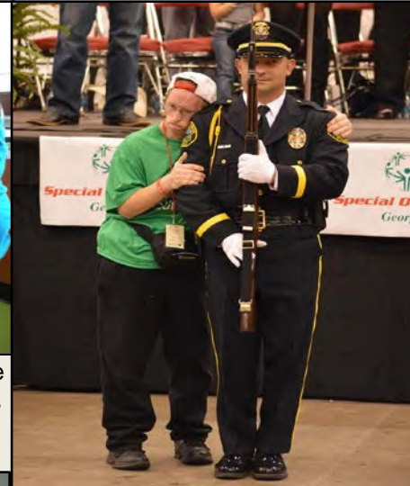
The Law Enforcement Torch Run involves more than 1,000 officers who take part in a 1,000-mile, two week relay to pass the "Flame of Hope" across the state.