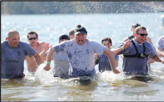
The Polar Plunge raised $106,074 from folks not being afraid of the chilly waters of Lake Lanier.