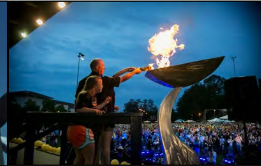
The Law Enforcement Torch Run remains SOGA's largest fundraising effort.