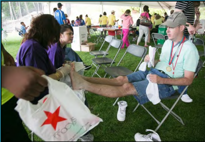
The Special Olympics Healthy Athletes Program provides health education and preventative services, identifies potential health problems and provides referrals.