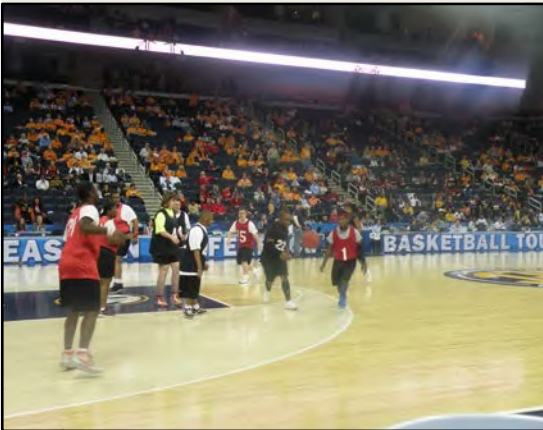
SEC fans at the Women's Basketball Tournament cheered for Rockdale athletes at half-time game.