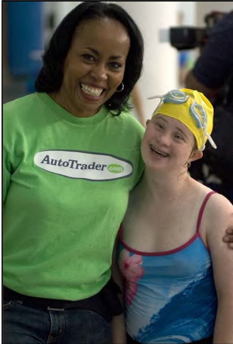
AutoTrader.com has been a generous supporter of SOGA for 10 years through year-round financial and volunteer support.