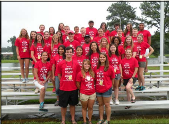
Each year, youth partners learn leadership skills and take on projects to help foster respect in schools.