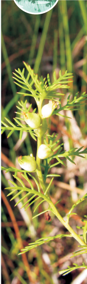
Comb-leaved Mermaid-Weed with fruits