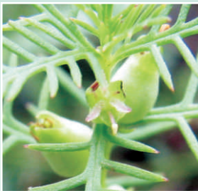
Comb-leaved Mermaid-Weed flowers and fruit