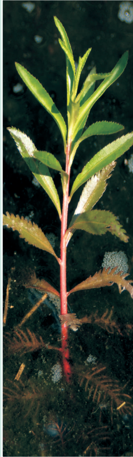
Marsh Mermaid-Weed

Leaves growing above the water are deeply dissected (comb-like or pectinate), 1.5-3 cm.