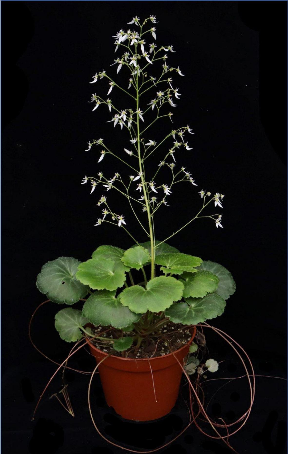
S. stolonifera 'Bian Huan'