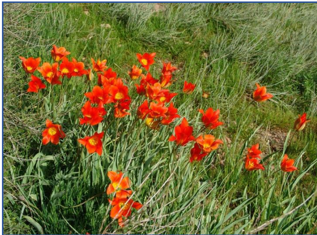
Left, Fig.18 T. jansii , red form