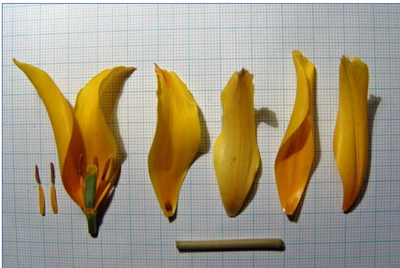
Fig.14 Flower parts of T. jansii