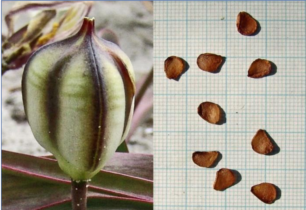
Fig.12 Seedpods and seed of T. lazkovii