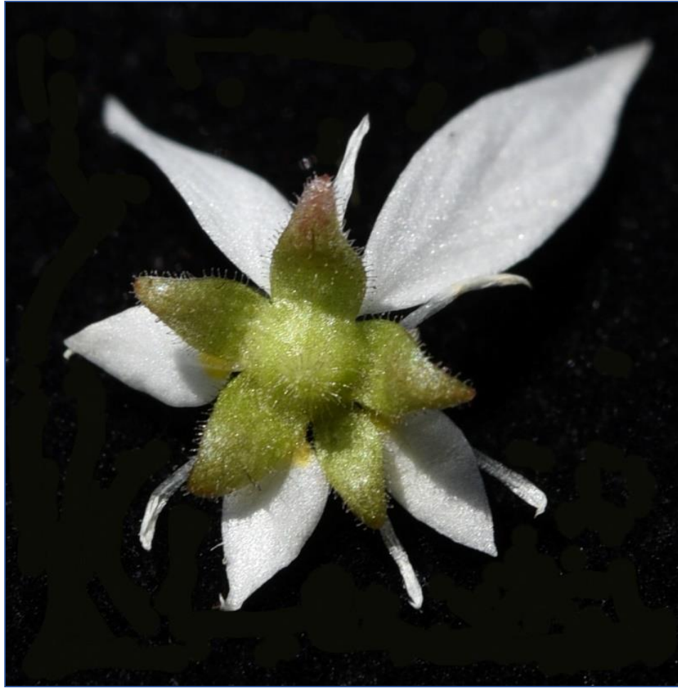
S. stolonifera 'Yin Yuanbao' flower back view