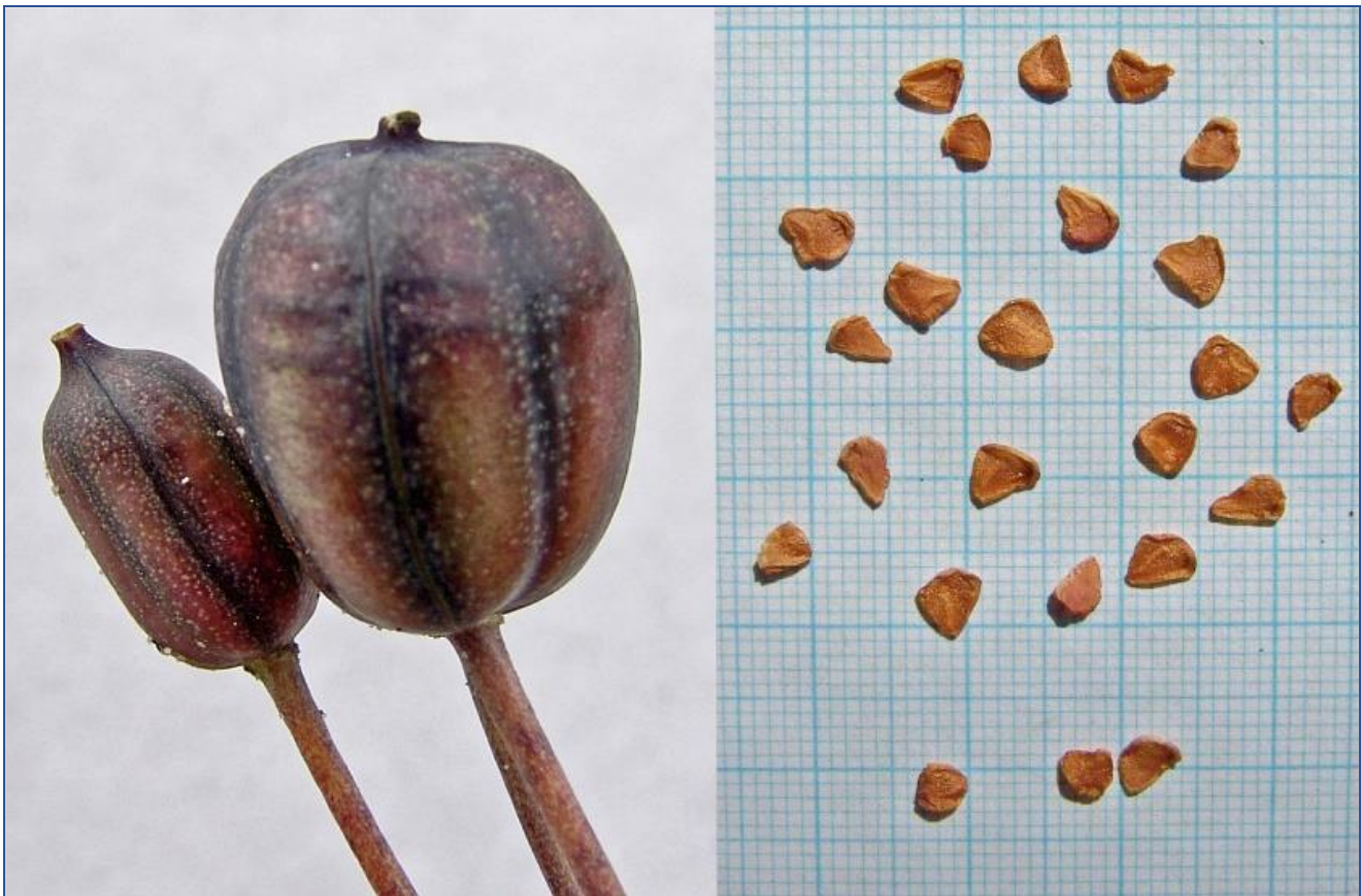
Fig.7 Seedpods and seed of T. kujukense