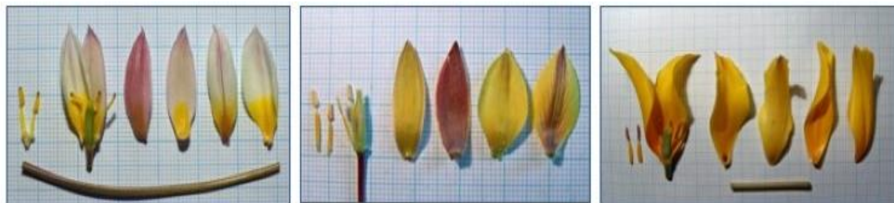
Left to right, flower parts of T. kujukense , T. laskovii , and T. jansii