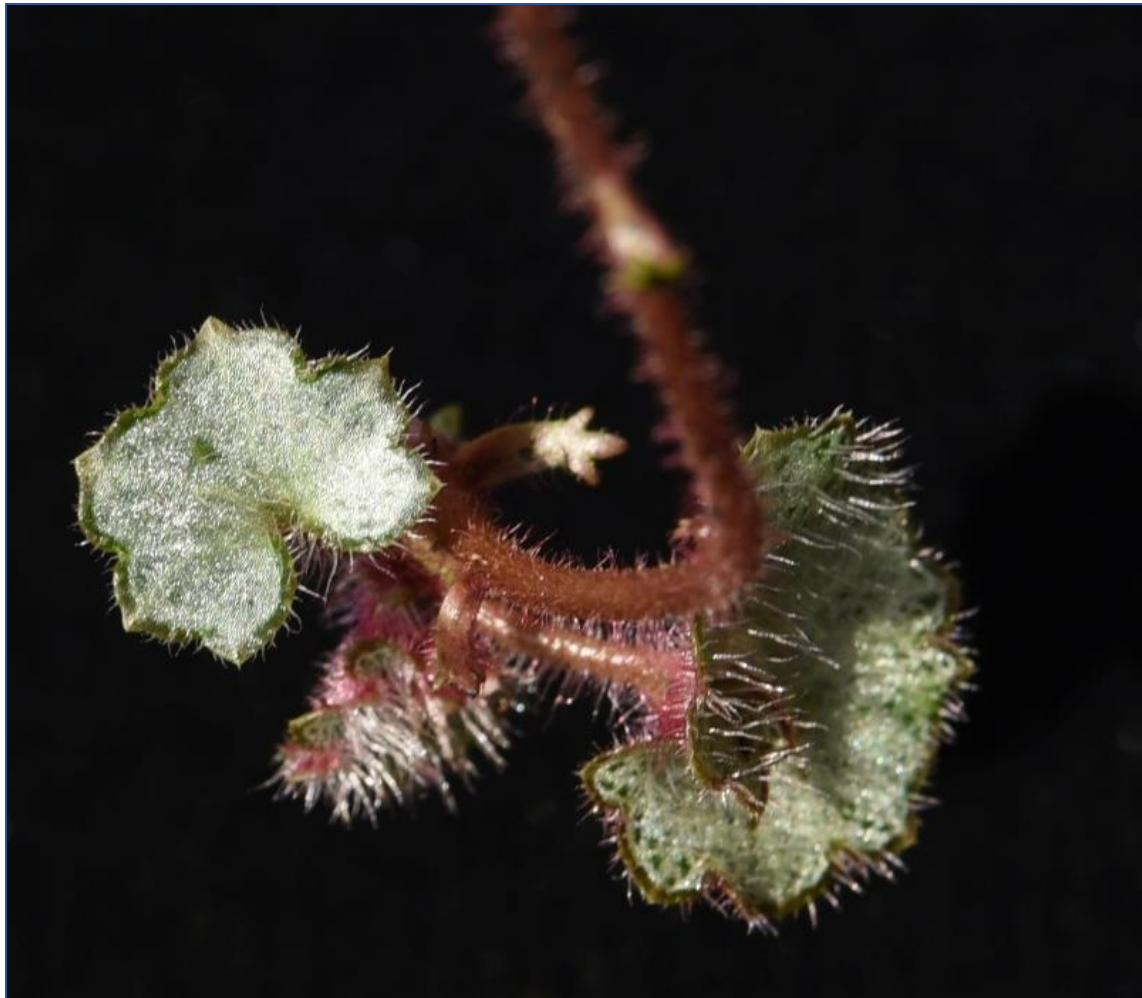
S. stolonifera 'Yin Yuanbao' stolon plantlet