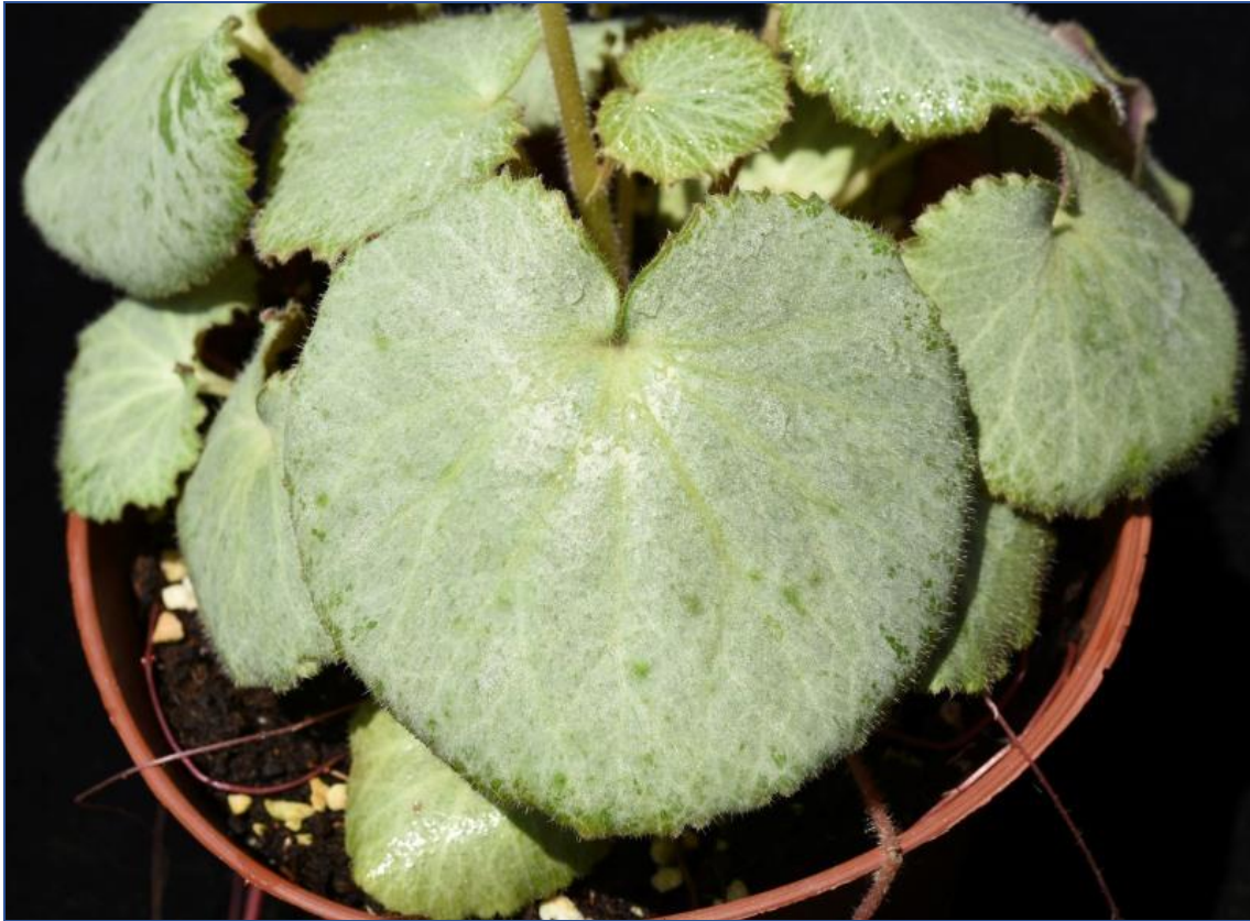
S. stolonifera 'Yin Yuanbao' leaf-blade

Saxifraga stolonifera is a member of Saxifraga section IRREGULARES