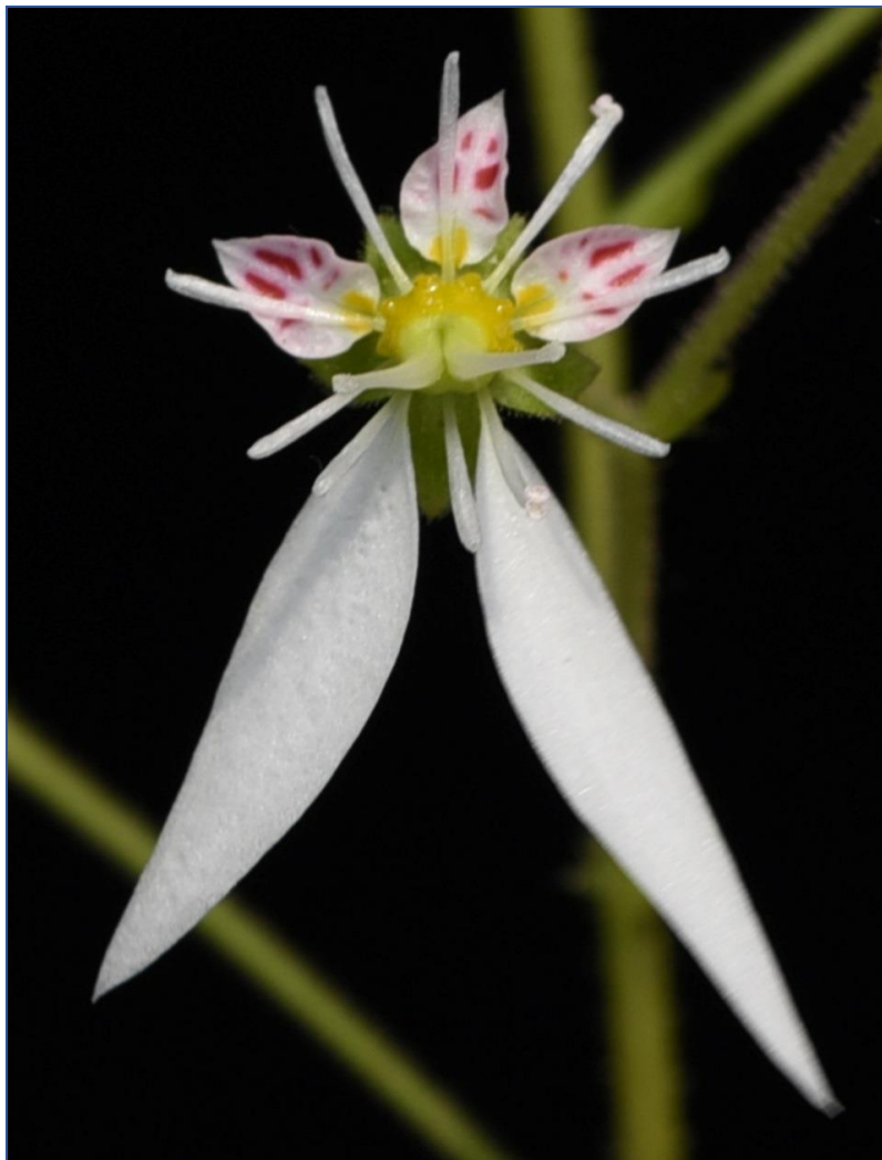
S. stolonifera 'Bian Huan' flower