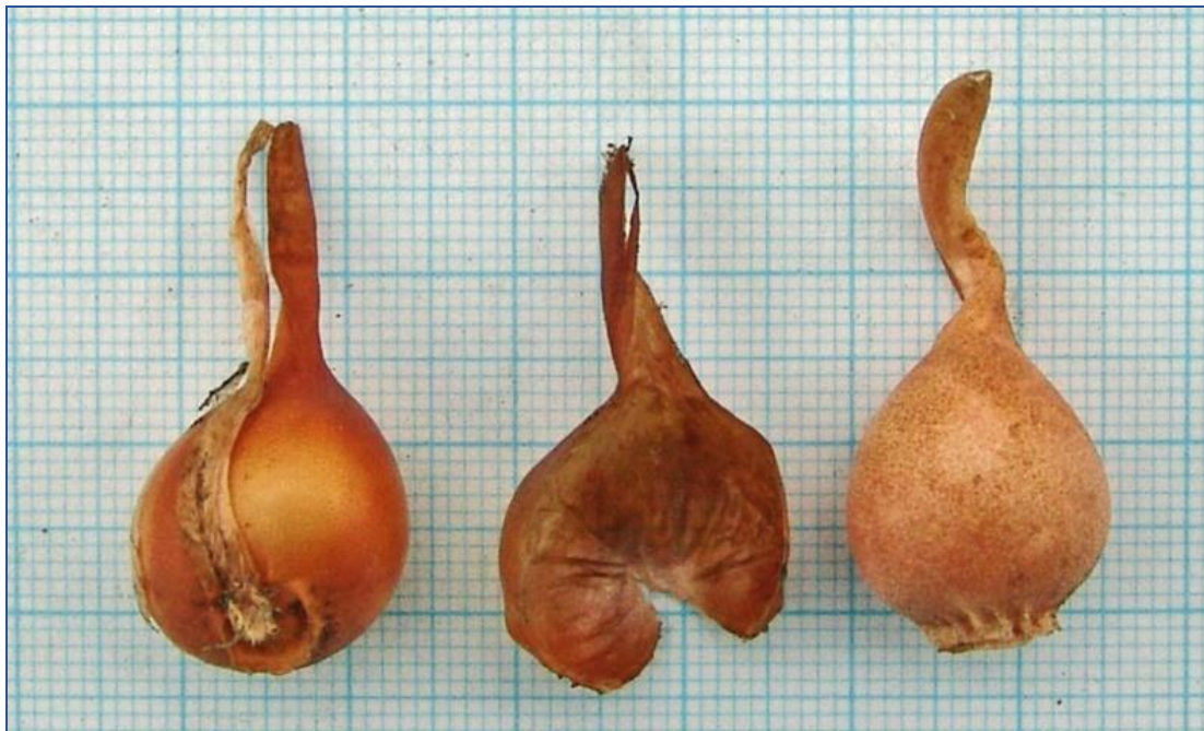
Fig.10 Bulbs of T. lazkovii