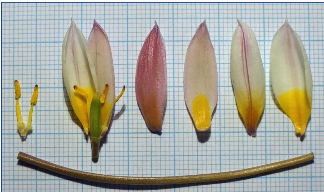
Fig.6 Flower parts of T. kujukense