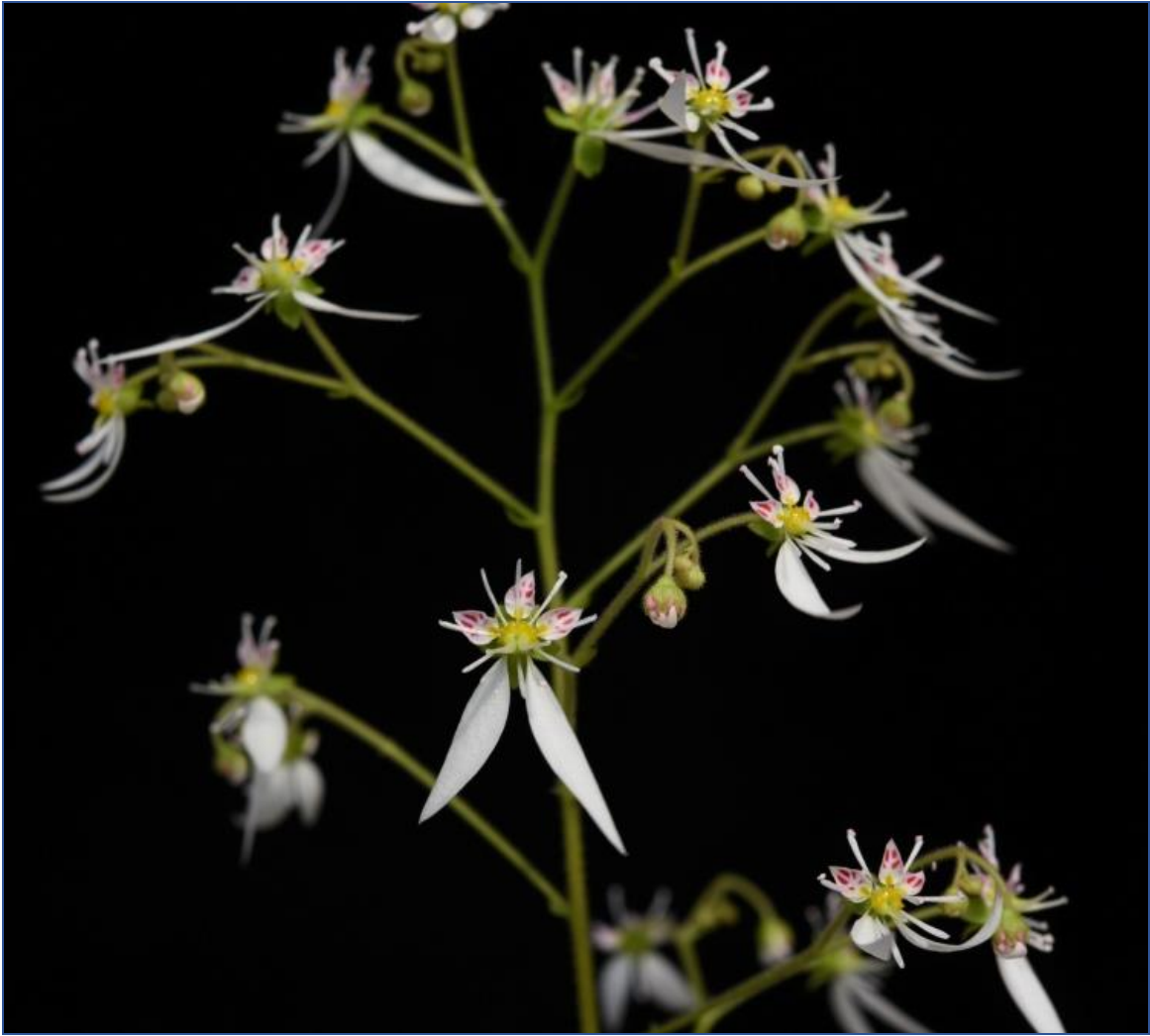
S. stolonifera 'Bian Huan'