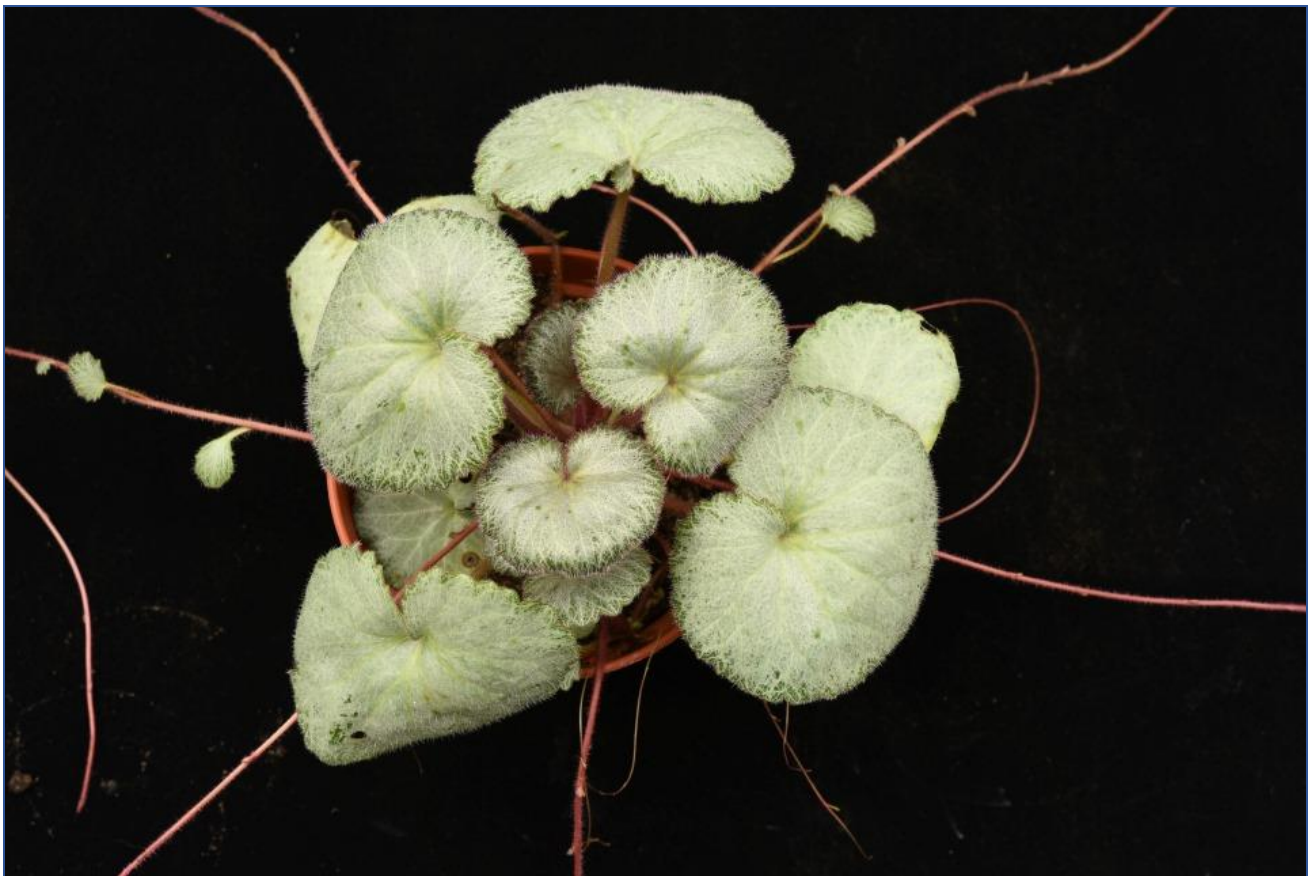
S. stolonifera 'Yin Yuanbao' plant with elongated stolons