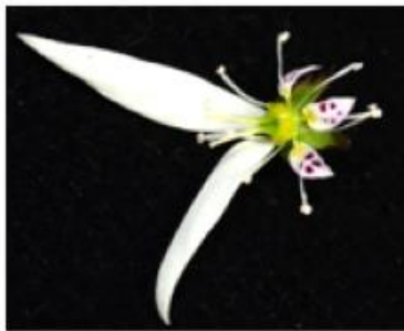
S. 'Tianmu Enci'

Saxifraga stolonifera 'Xue Wen and 'Tianmu Enci'