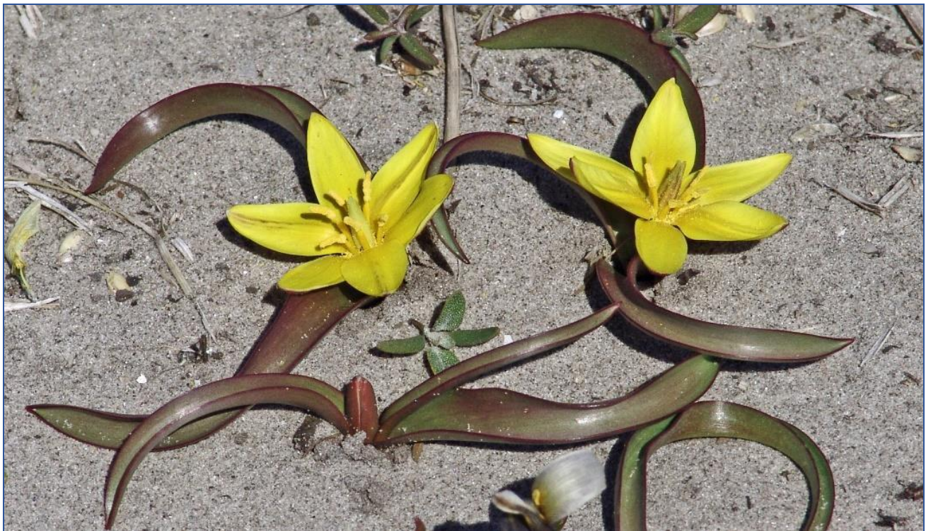
Fig.9 T. lazkovii in cultivation

In 2007 the first author received from S. Hoekstra a number of pots of young plants which had been raised from seed collected in the alpine zone of NW Kyrgyzstan which was undetermined. Once these flowered, they showed characteristics of both T. dasystemon and T. tarda (Table 2) common in the NE of Kyrgyzstan.