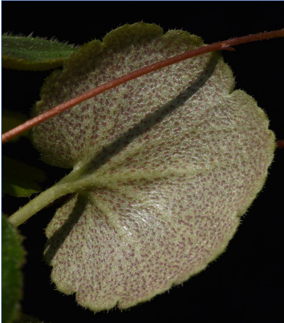
S. stolonifera 'Bian Huan' - young leaf above, older leaf, below