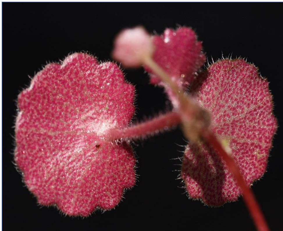
S. stolonifera 'Yin Yuanbao' back view of leaf-blade of plantlet