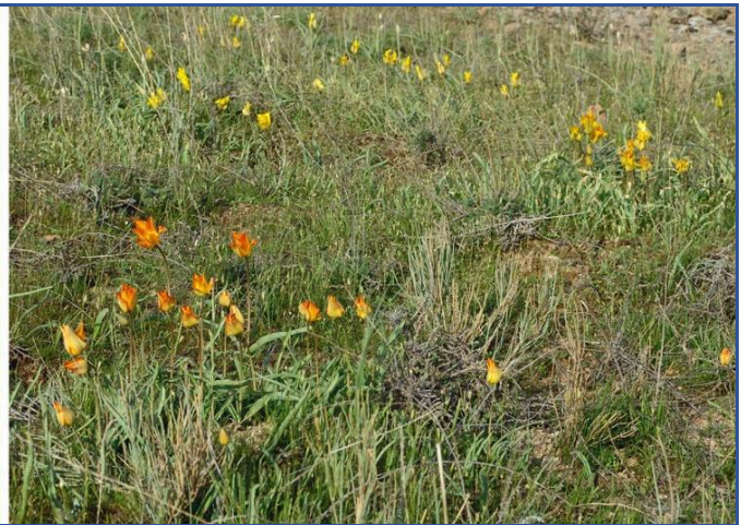
Right, Fig.19 T. jansii , population with mixed colours