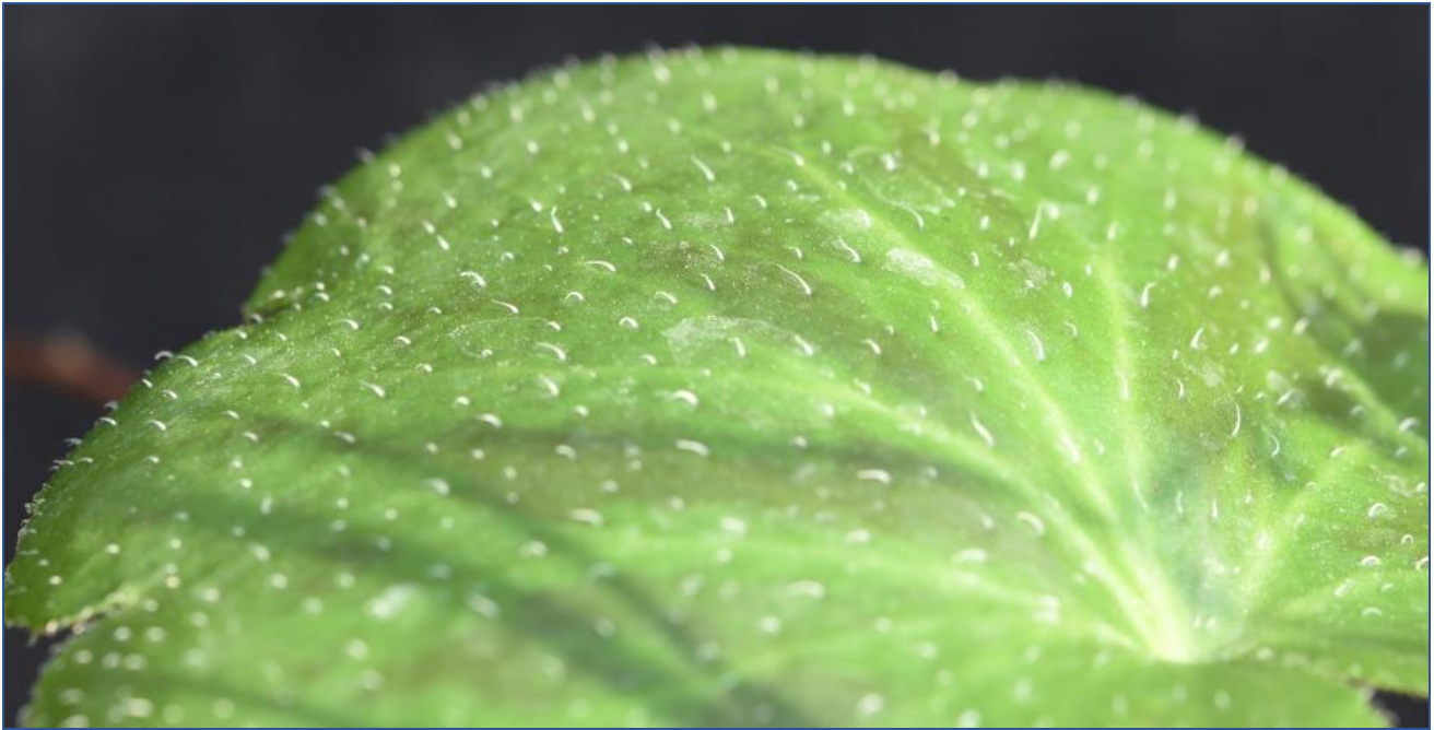
S. stolonifera 'Bian Huan' leaf-blade showing hairs