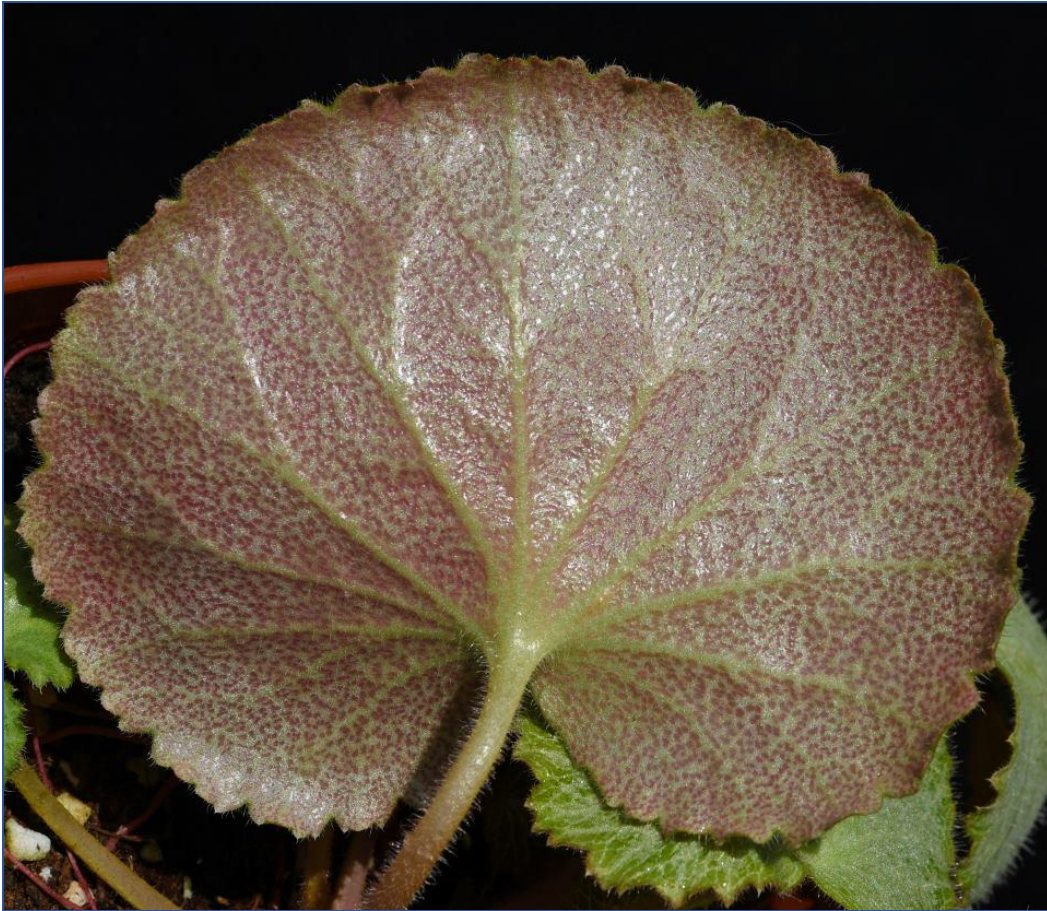
S. stolonifera 'Yin Yuanbao' leaf back]