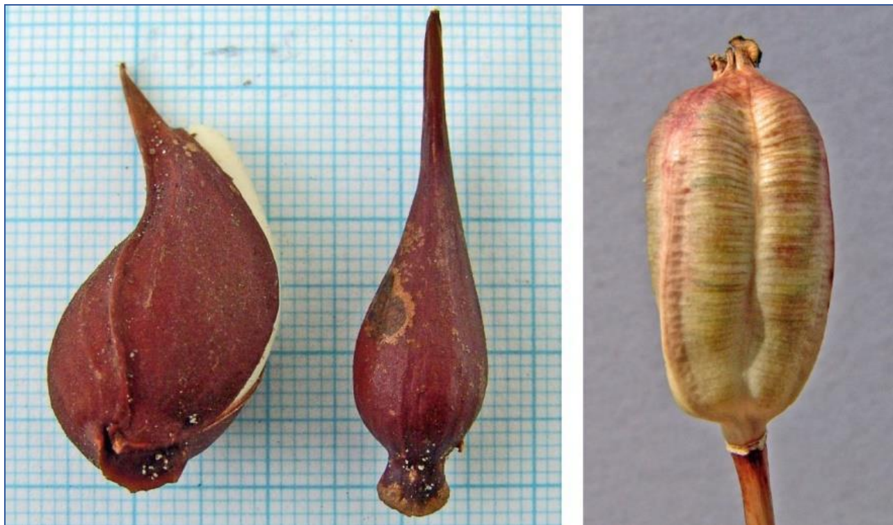
Fig.13 Bulbs and seedpod of T. jansii