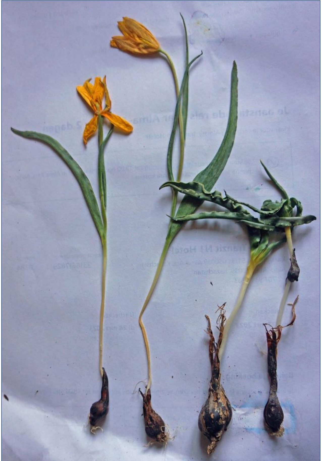
Fig.16 On the left T. jansii and on the right T. kolpakowskiana