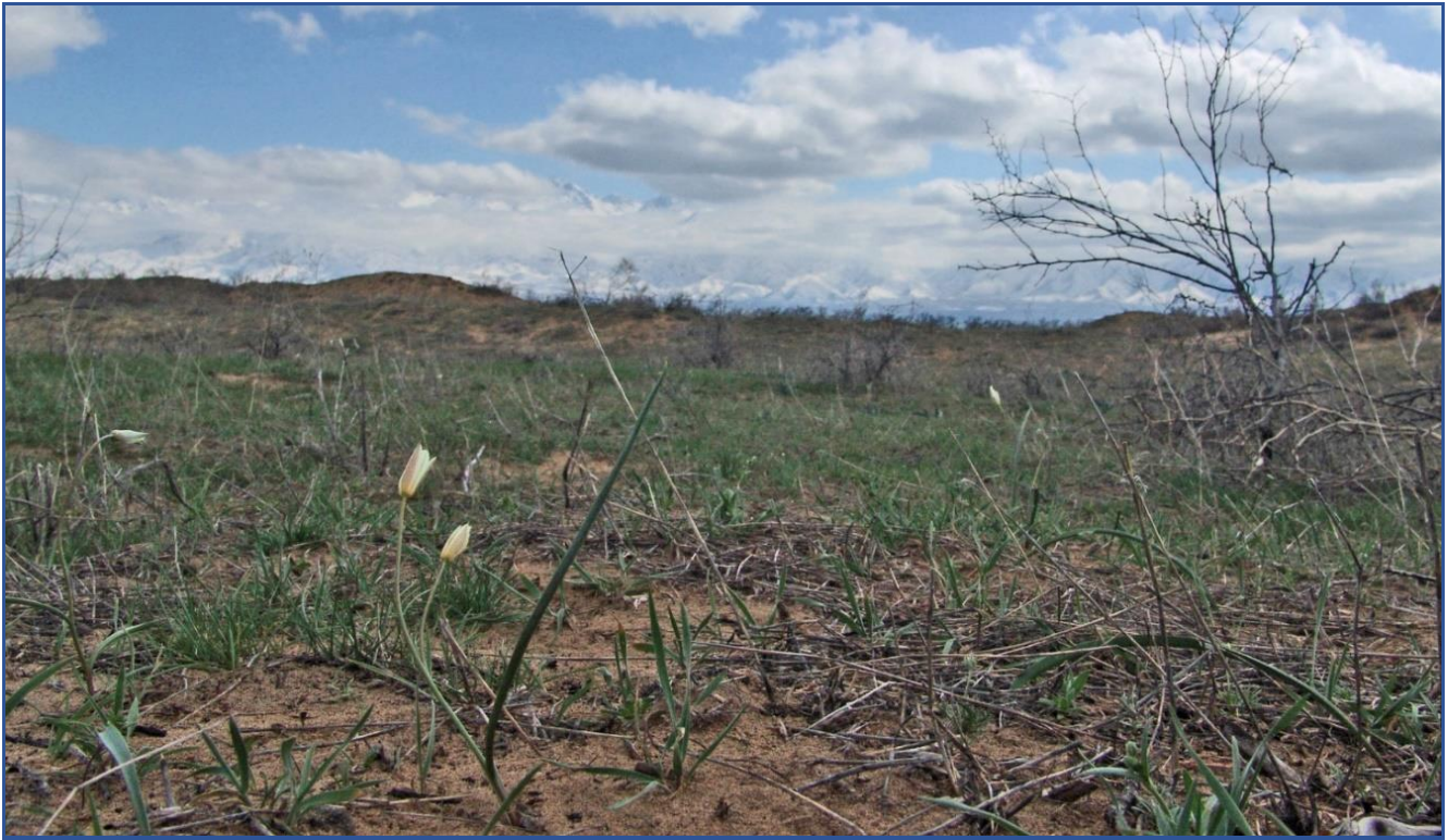
Fig.1 Tulips in the Mujun-Kum desert

Fig.1 shows a picture of tulips in Kazakhstan's Mujun Kum desert, these are locally called T. binutans and are generally plants with 1 or 2 flowers that look about the same in nature. In culture, however, you get a very different picture of these tulips in morphology and DNA weight, for instance. The species in Fig.2 is a form of T. orthopoda ; the tulip in Fig.3 is a form of T. bifloriformis ; and in Fig.4 is a plant that comes close to T. binutans . All these species have a great variety of forms which makes determination extra difficult.