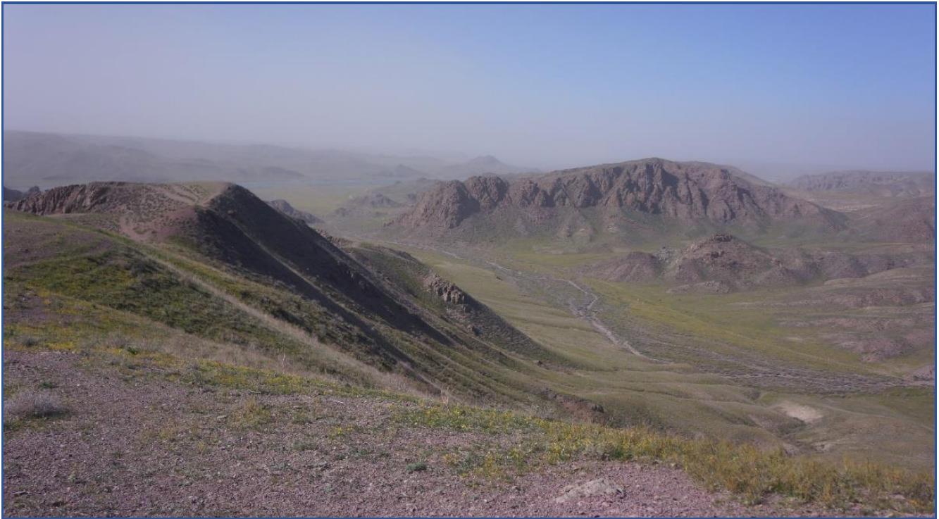
Fig.15 view on the Ili River valley with, in front, T. talievii Vved. ( buhseana ) and Gagea spec.