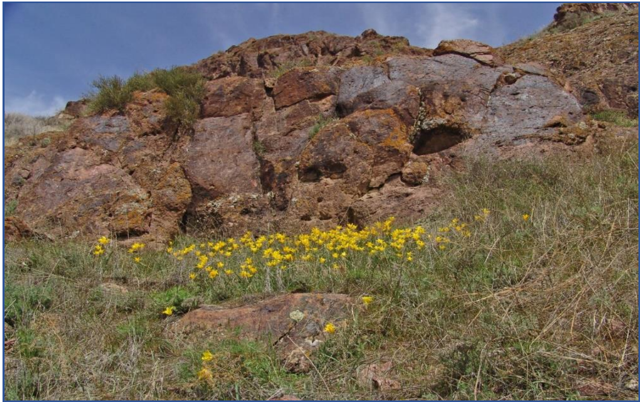
Fig.17 T. jansii , yellow form, at the type location