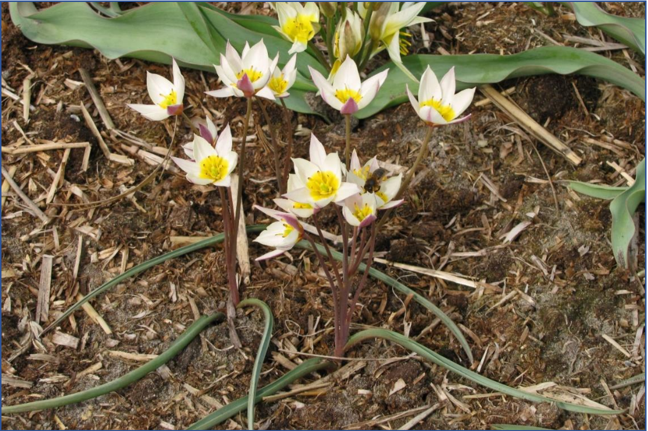
Fig.8 T. kujukense in cultivation, with in the background a form of T. bifloriformis . Compare the flower with the bee in it for the size of the flowers.