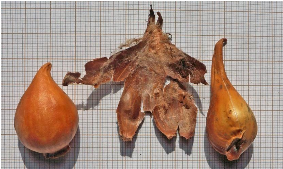
Fig.5 Bulb of T. kujukense

In nature, these Biflora/Turkestanica species are difficult to distinguish from each other but in culture they are easily distinguishable when grown under the same conditions. For example, T. kujukense is much smaller than the Biflora tulips like T. orthopoda and bifloriformis they grow with in nature, and they have a bulb with a grey-brown bulb tunic which is typical of the Turkestanica species group. They are most similar to the desert species T. sogdiana but T. kujukense is a mountain tulip and has a higher DNA amount per nucleus.