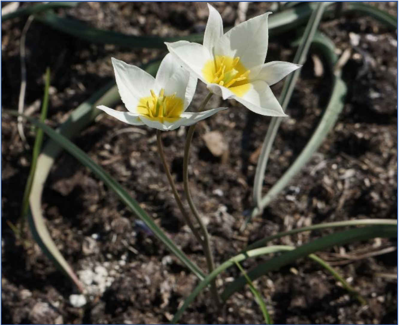
Fig.4 T. binutans cf ex Mujun-Kum in cultivation.