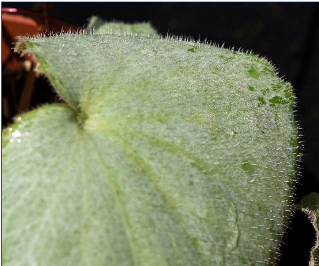
S. stolonifera 'Yin Yuanbao' leaf-blade showing hairs