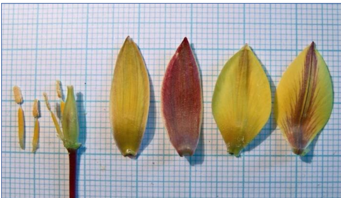
Fig.11 Flower parts of T. lazkovii