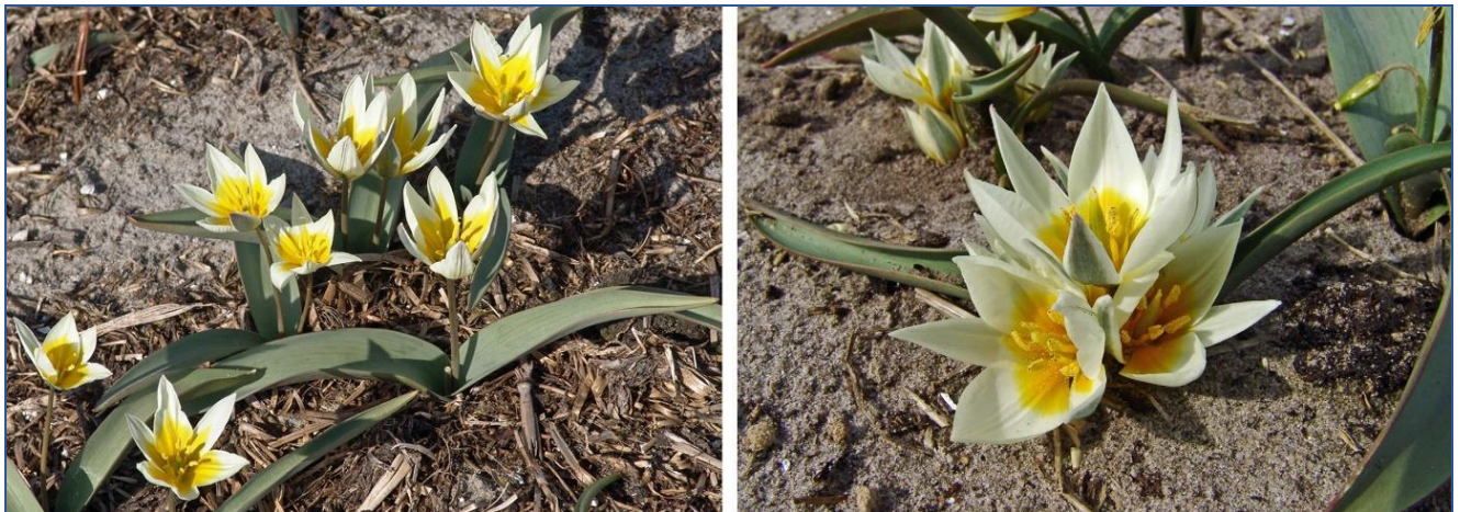
Fig.1 shows a picture of tulips in Kazakhstan's Mujun Kum desert, these are locally called T. binutans and are generally plants with 1 or 2 flowers that look about the same in nature. In culture, however, you get a very different picture of these tulips in morphology and DNA weight, for instance. The species in Fig.2 is a form of T. orthopoda ; the tulip in Fig.3 is a form of T. bifloriformis ; and in Fig.4 is a plant that comes close to T. binutans . All these species have a great variety of forms which makes determination extra difficult.

Left, Fig.2 T. orthopoda cf ex Mujun-Kum in cultivation.