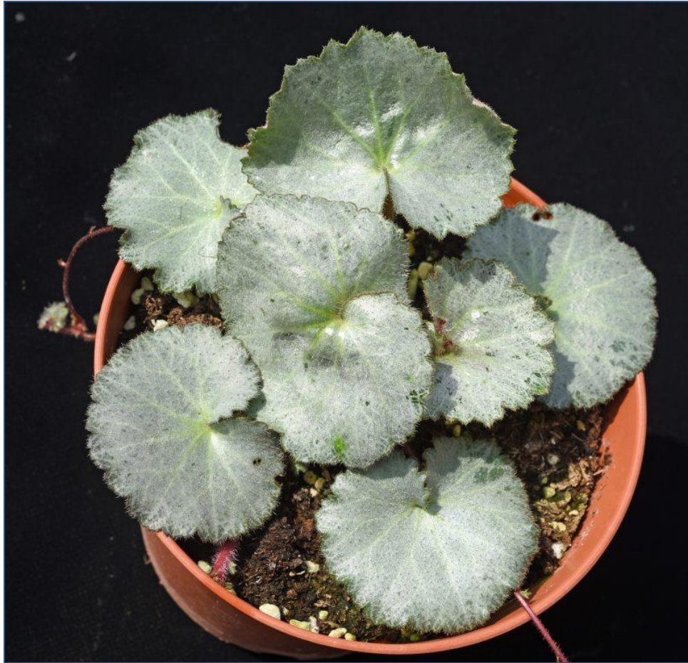
S. stolonifera 'Yin Yuanbao' plant at early stage before flowering