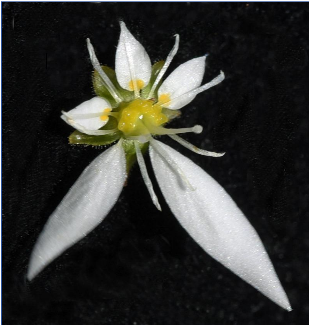
S. stolonifera 'Yin Yuanbao' flower front view

"Yin Yuanbao" (银元宝 in Chinese characters), a silver ingot used as currency in ancient China.