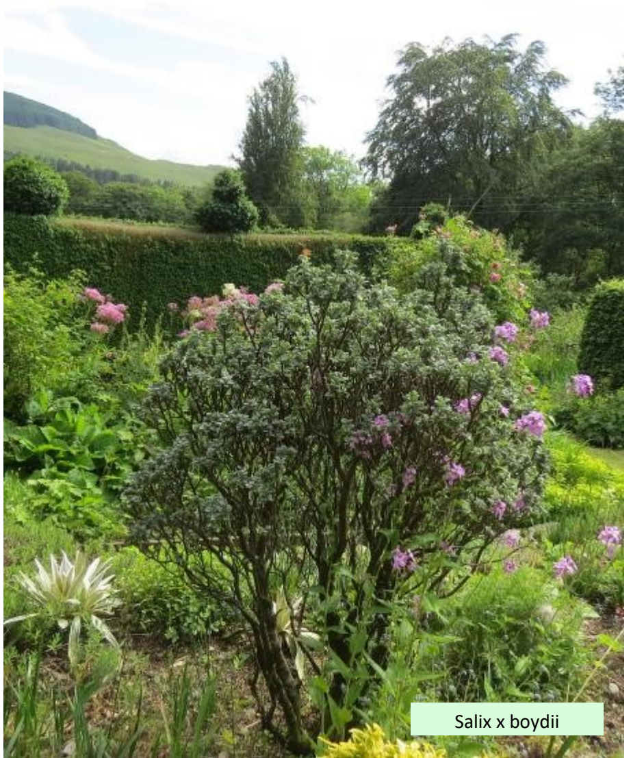
Salix x boydii