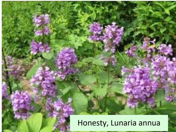
Honesty, Lunaria annua