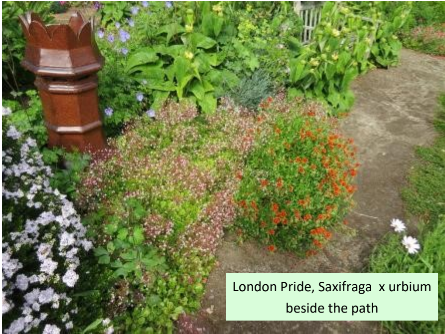
London Pride, Saxifraga x urbium beside the path