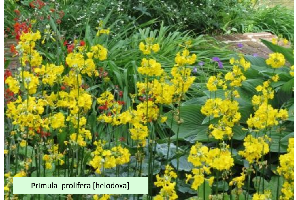
Primula prolifera [helodoxa]