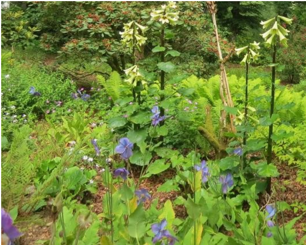
Meconopsis betonicifolia thrives in the cool beside Cardiocrinums