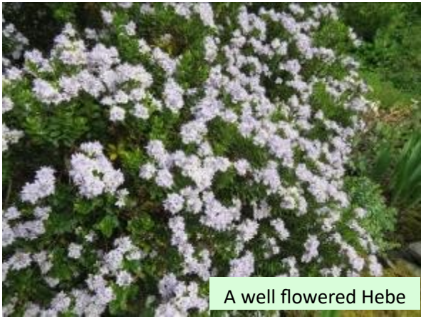
A well flowered Hebe