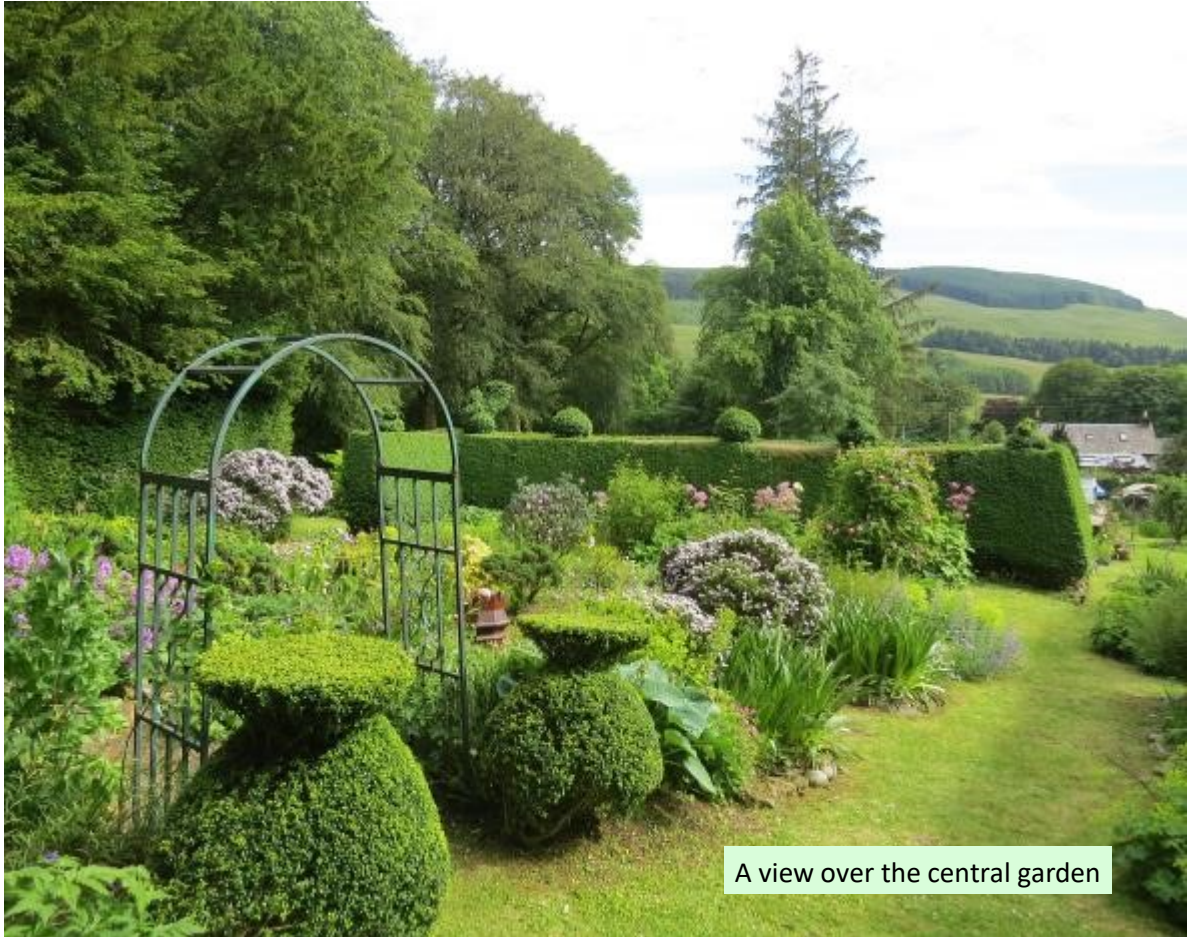
A view over the central garden