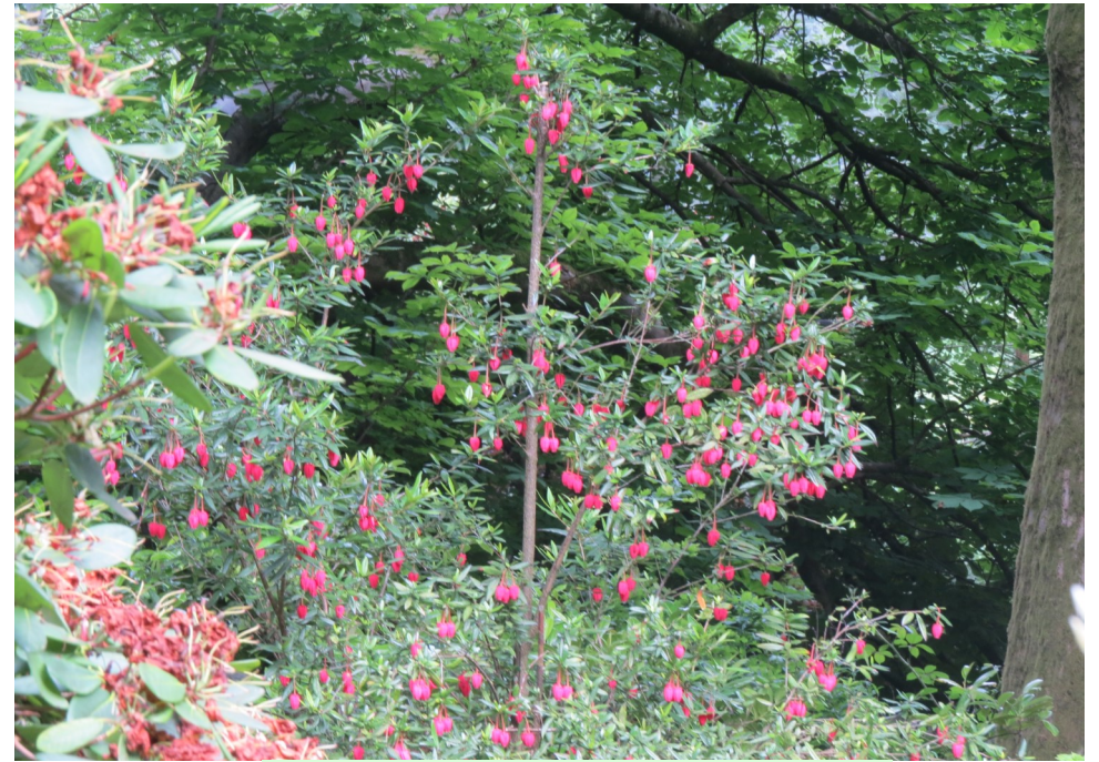
Crinodendron hookerianum from Chile