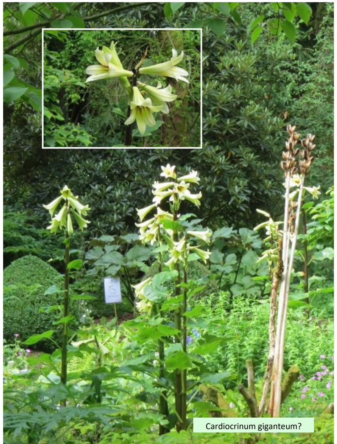
Cardiocrinum giganteum ?