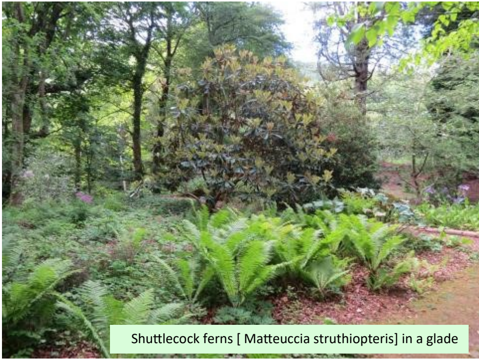
Shuttlecock ferns [ Matteuccia struthiopteris ] in a glade