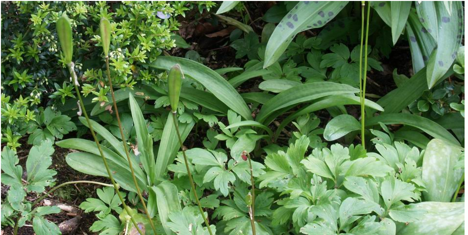
Dactylorhiza 'Eskimo Nell'

I divide them as the flowers are fading because I can greatly increase the stock by removing the new bulbs and replanting the stem complete with fading flowers and old bulb which will grow yet more offsets before it dies back completely. I have showed this before and here is a box that I planted the old stems in last August showing all these extra plants that I have stimulated the plant to produce.