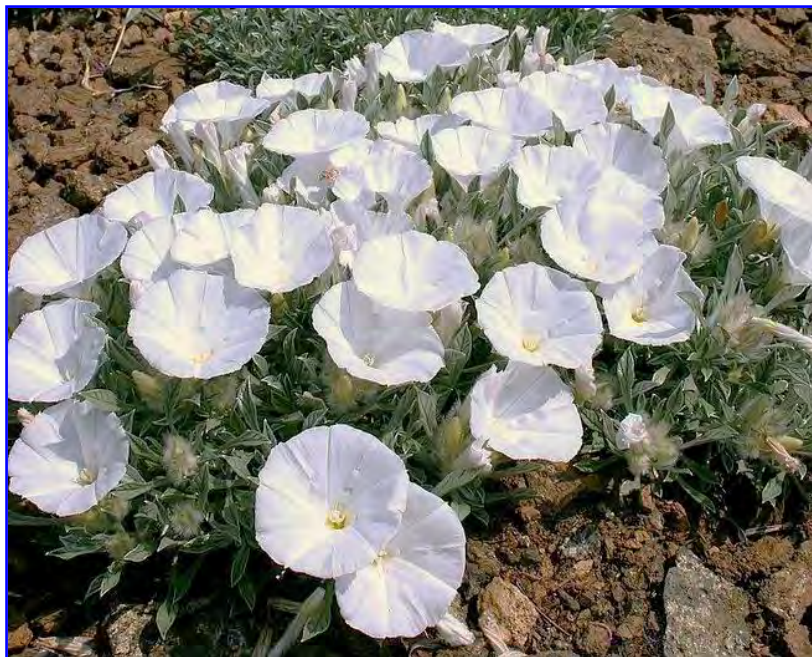
Convolvulus compactus , Beauty slope ZZ

Writing about Turkish Convolvulus species begs a remark about very distinctive dwarf Convolvulus phrygius .