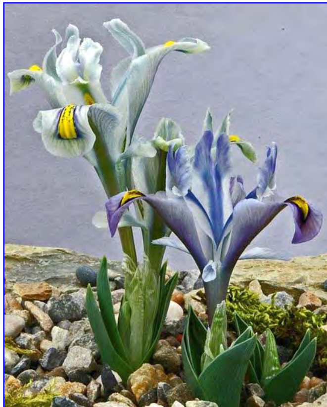
Iris hymenopatha ssp. leptoneura

The leaves of subspecies leptoneura are much broader, up to nearly 2 cm and without the prominent veins below. It is distributed in northwest Iran and eastern Iraq. The bract and bracteole are, in both subspecies, very different from those of the other members of the group, being very thin, soft, silvery transparent and much longer than in the other species.