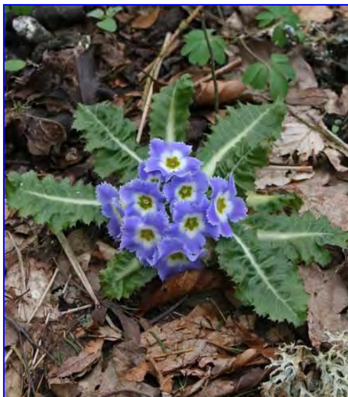
P. sonchifolia at Cluny