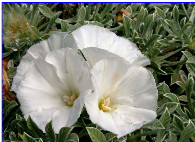
C. compactus , detail

Synonyms: Convolvulus cochlearis Griseb., Convolvulus compactus Boiss., Convolvulus parnassicus Boiss. & Orph., Convolvulus suendermannii Bornm.