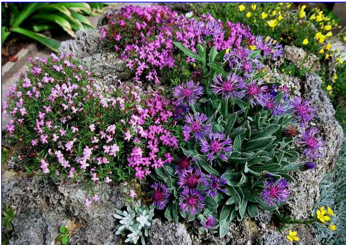
Three shrubby Violas in tufa in the garden of Vlastimil Pilous

There is a holy trinity of three European shrubby species waiting for broader cultivation. English plantsman Roger Bevan was first man who visited all of them at their natural habitat in 1930s. Czech grower Vlastimil Pilous did the same 60 years later and you can see all the sisters in one tufa outcrop together with Bulgarian form of Centaurea triumfetii in Vlastimil's connoisseur's garden in Northern Bohemia. Macedonian Viola kosaninii is on left side Spanish Viola cazorlensis is in the middle (back) and Greek Viola delphinantha is on right. Cultivation in holes of tufa is not difficult and also planting in narrow crevices with north east exposure is good policy. All are crevice dwellers, but V. cazorlensis grows in open stony soil too. Their base stems are short and woody and there is bunch of wiry stems with unusual pink flowers.