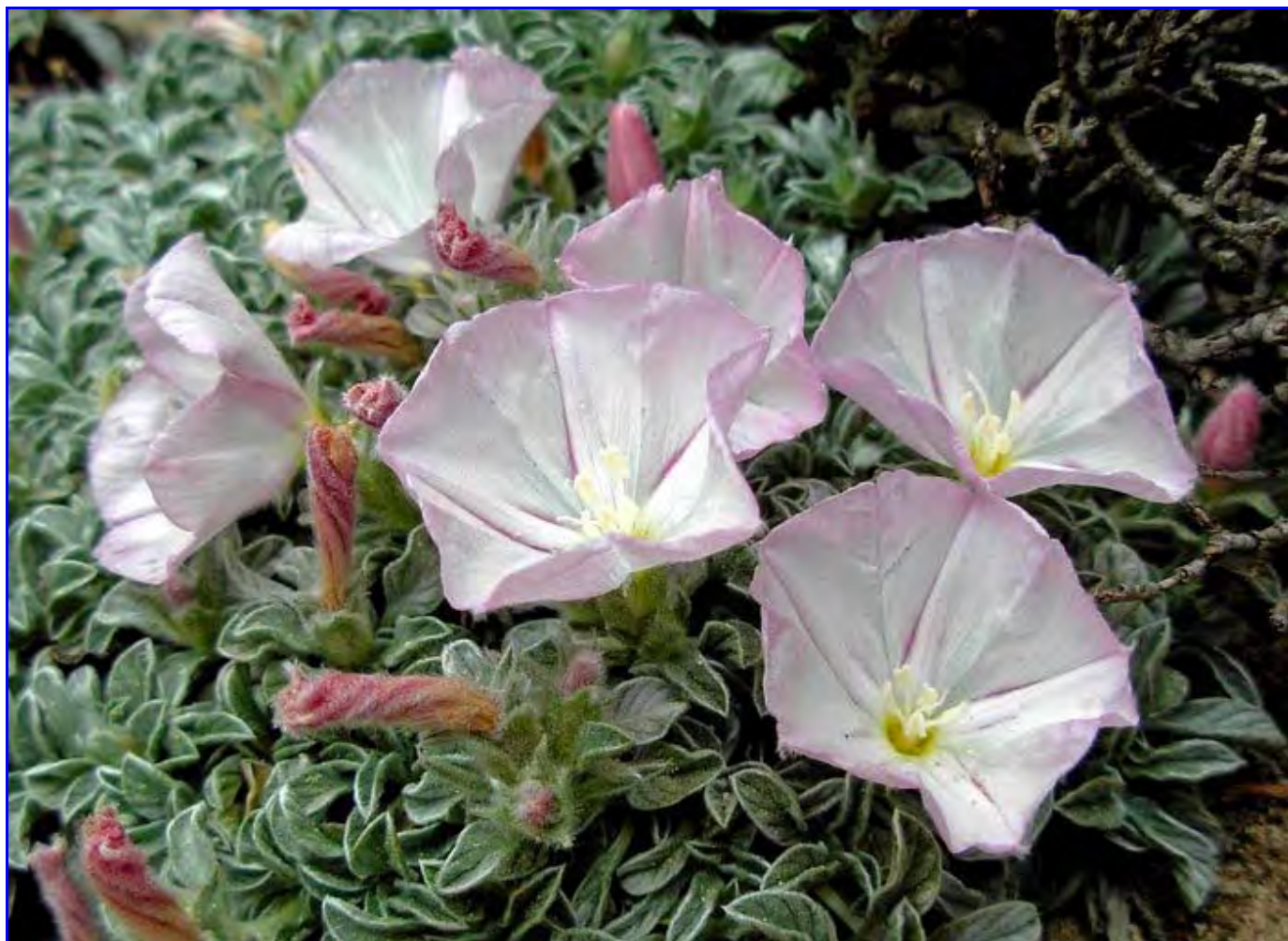
Convolvulus boissieri ssp. boissieri , Sierra Cazorla,

experience not possible in Central Europe, it is a plant especially for the alpine- house. Propagation by cuttings, taken in late summer to early winter, is difficult.