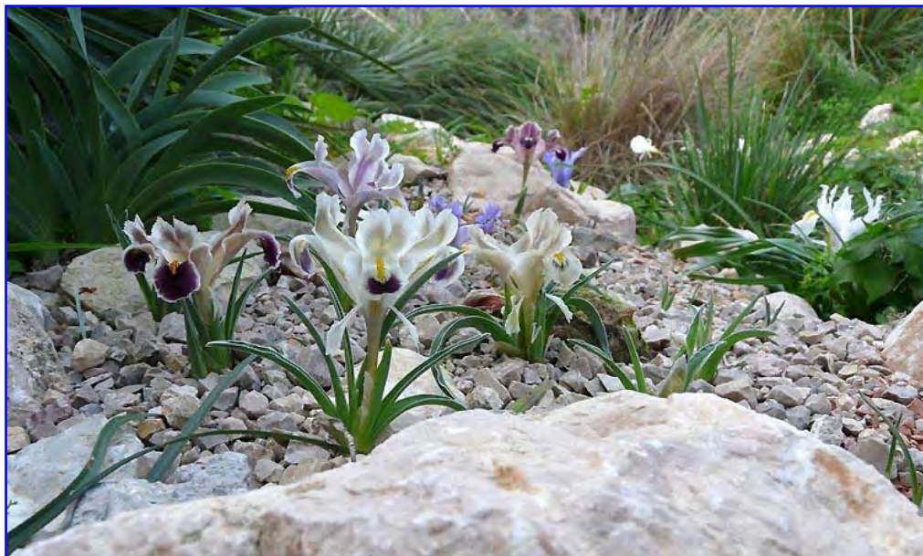
Iris persica , Iris stenophylla allisonii , Iris planifolia and Iris planifolia var. alba : Juno Iris in the Mallorcan garden of Hans Achilles