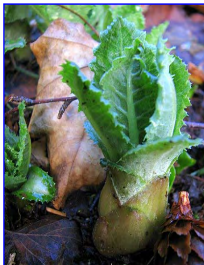
Primula sonchifolia – emerging foliage P. sonchifolia ssp. emeishanensis