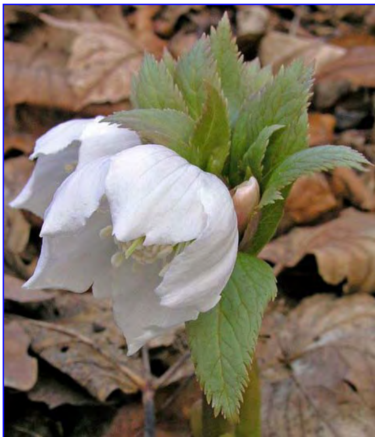
Helleborus thibetanus , white form

This perennial species is about 30 cm tall. Plant has lovely bell shaped flowers or sepals (one or two per stem) up to 6 cm in diameter. They are white to red- pink and blooming period is short: one or two weeks.