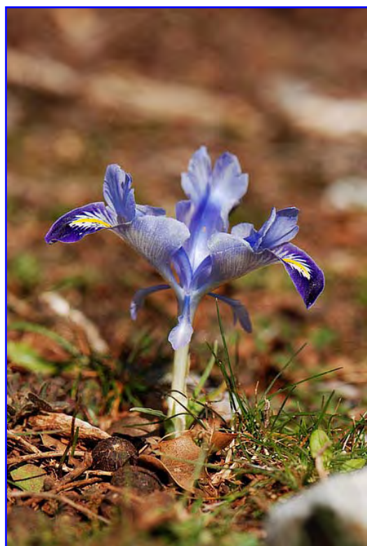
Iris stenophylla ssp. allisonii Gundogmus, SW Turkey

Propagating by seed is the best way, but sometimes it needs a long time because the seed germinates very irregularly. The seedlings are healthier in a mineral sowing substrate than in a humus rich substrate. Normally the seedlings start to flower after four years.