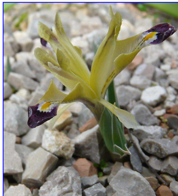
right Iris galatica