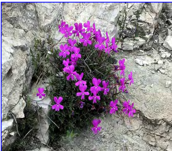
Viola cazorlensis in the wild