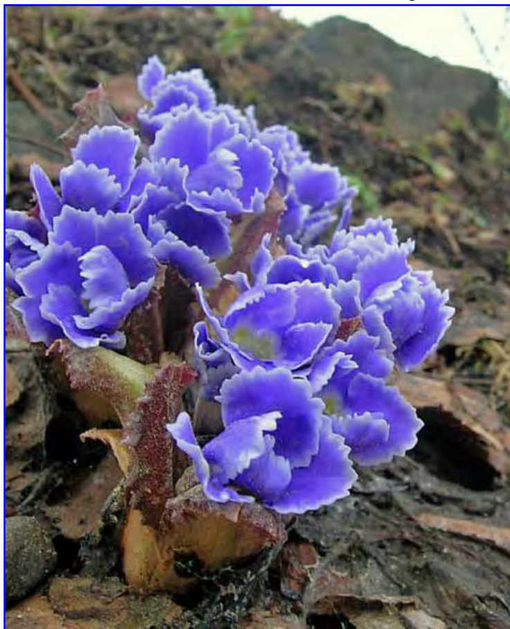
P. bhutanica in Tromsø garden of Arve Elvebakk

The cooler conditions of Tromsø botanic garden offers the possibility to grow these primroses in more open positions. The only problem is moist peaty substrate, which is too hot in full summer sunshine and heated roots will quickly rot.