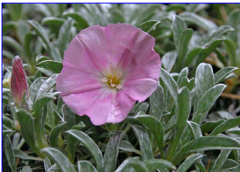
Convolvulus boissieri ssp. compactus v. suendermannii ZZ

All plants are seedlings. Last year I planted Convolvulus boissieri ssp. compactus from limestones of Bulgarian Ali Botusch Mts., which is distinct in character and was described as C. suendermannii but not generally accepted. It is surely good variety of the species and superb compact rock garden plant with satiny pink funnel form corolla.