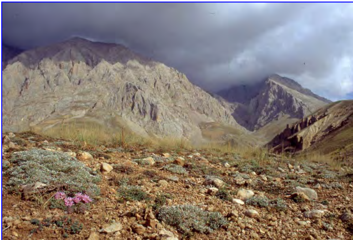
Steppe in Ala Dag with flowering Pterocephalus and cushions of Convolvulus .