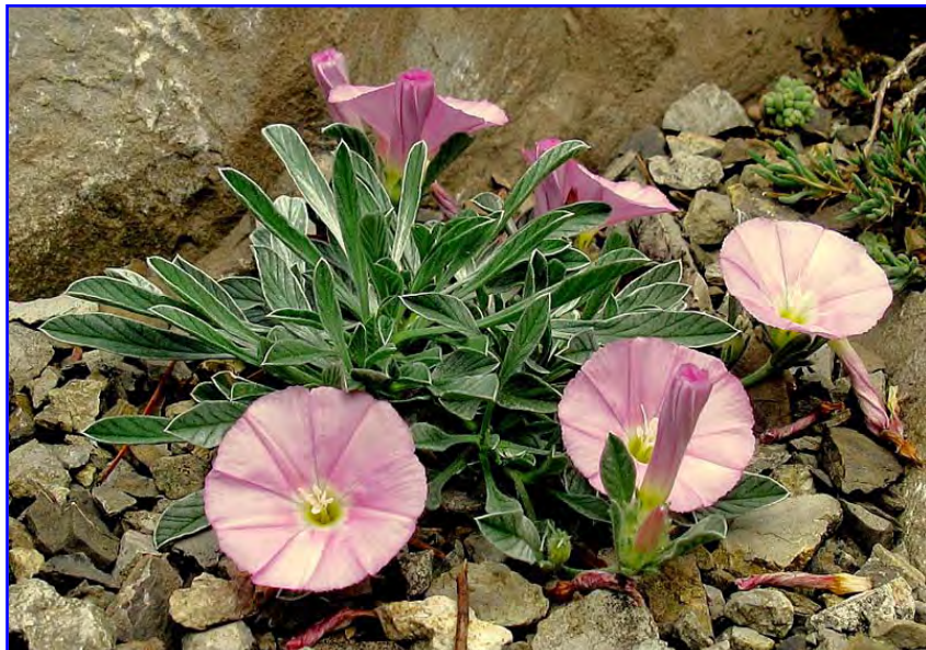
C. boissieri ssp. compactus var. suendermannii - plant in cultivation