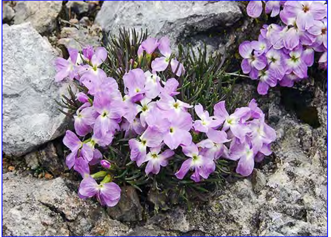
Solms-laubachia zhongdianensis Shika Mt. in Yunnan

Solms-laubachia linearifolia growing on Mt. Shika near Zhongdian in Yunnan