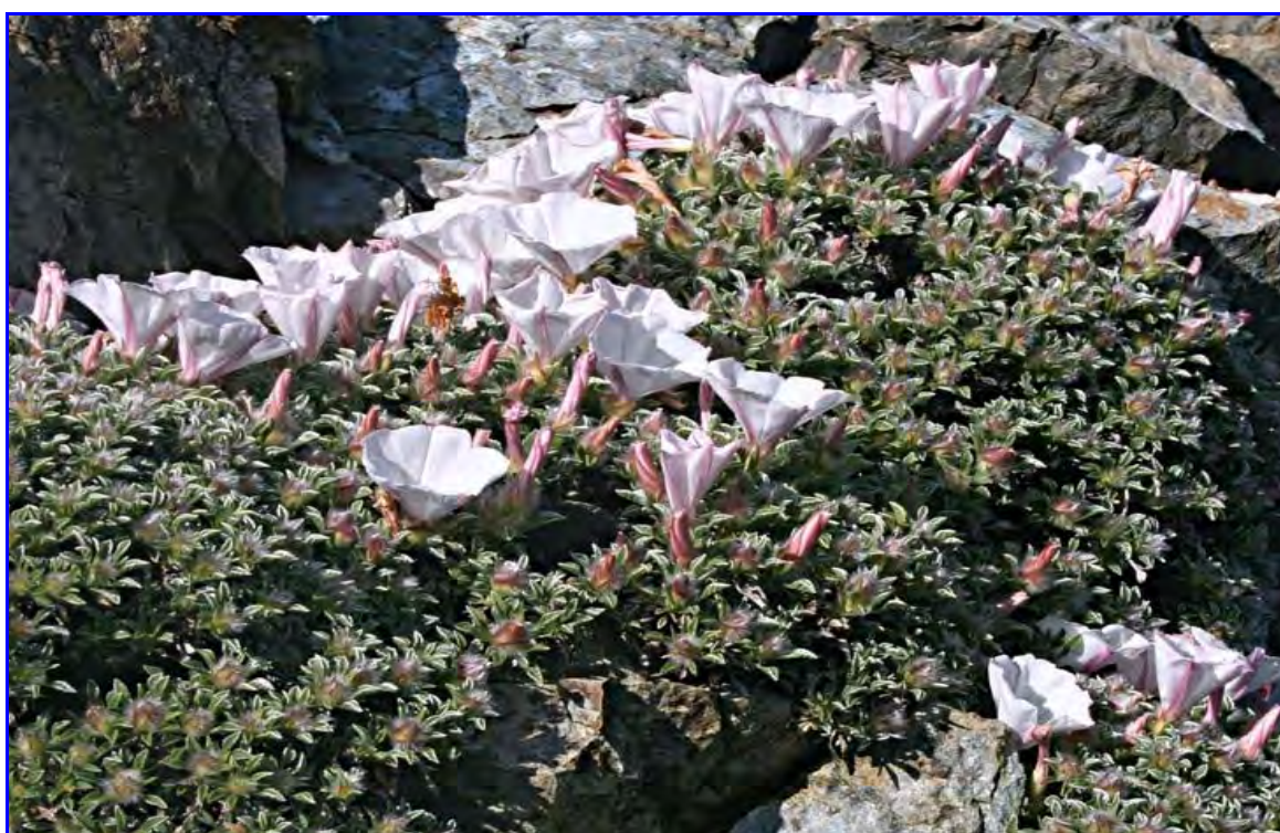
Convolvulus boissieri ssp. compactus , Albania