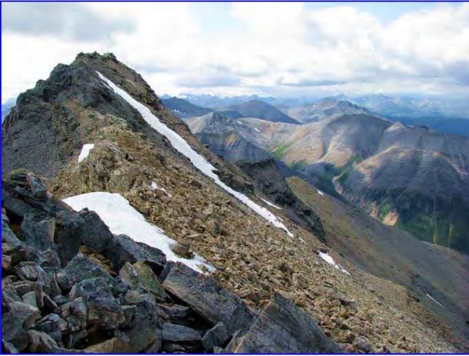
Mt. St. George, Stone Mountain