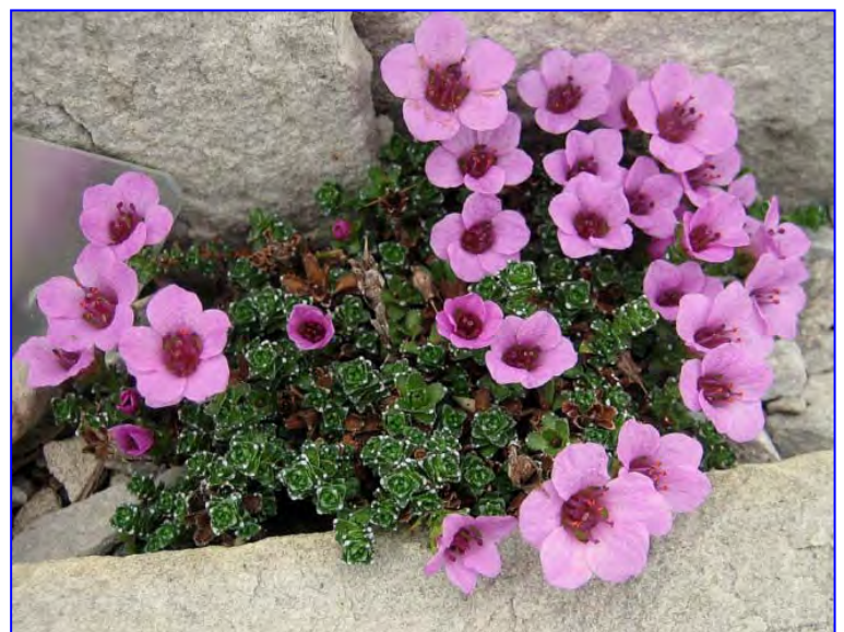
Saxifraga oppositifolia 'A.C.U.Berry'

We have 30 taxons of the Kabschia group. Since we have had to move many from their garden position into pots in the nursery during the repair of the collapsing section, we lost some in the process. Many of these kabschia are Lincoln Foster's hybrids. They are showing a rather slow increase in size, the successes for now are not yet clear. I will try this summer to make a better assessment of where we are with these and hopefully provide you with an update.