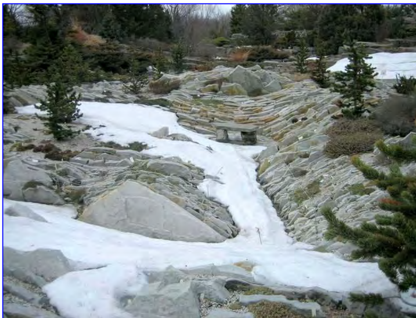
Garden in March 2009