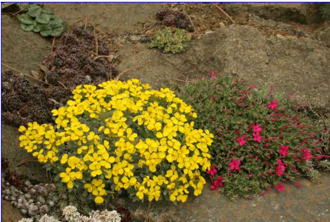
Fibigia triquetra and Phlox 'Gypsy Blood'

Fibigia triquetra , is a taller subshrub (up to 20 cm) and Degenia velebitica forms pulvinate cushions, both in full sun. Degenia is able to sow itself on our slope and we hope that a dense planting of Fibigia will bring the same results.