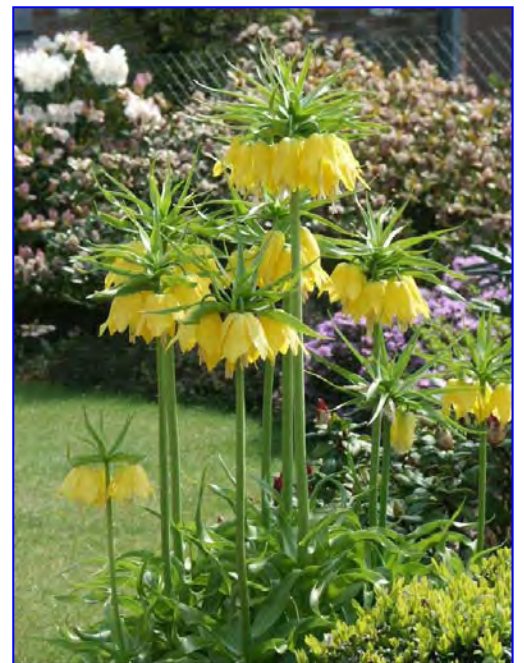
Yellow Fritillaria imperialis in the Belgian garden of Luc Gilgemyn .