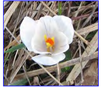
Crocus vernus Albus

Two more of Robin's photos from the Valais; a group of blue Hepatica at different stages of growth dimly lit in a rocky dip with leaf litter.