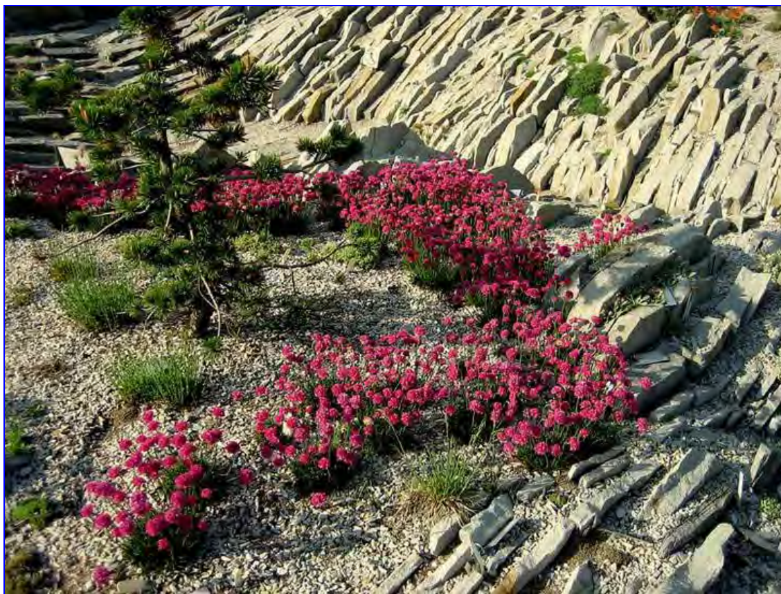
Armeria maritima 'Dussendorfer Stolz',

The pines have all survived, 22 of them. As for the plants, obviously there have been losses, as we suspected not all have adapted. Among the plants that have died are: Anemone trullifolia , Calceolaria biflora , Campanula tridentata , Colobanthus quitensis , some Delosperma and some cactus, Primula pulverulenta , Primula rusbyi , Salvia taraxacifolia , Castilleja sulphurea , Dionysia bazoftica , Physoplexis comosa , Primula bulleyana , Primula florindae and Carduncellus pinnatus after some 4 years.