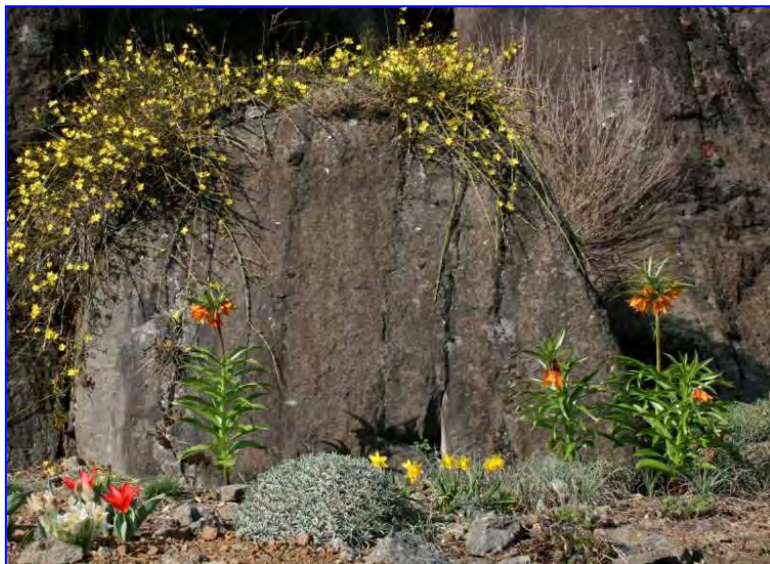
Fritillaria eduardii on the Beauty Slope

His story about this species in the wild is captivating (see his article for Fritillaria Group of the AGS). As you see our F. eduardii is yellow-orange and begins to flower in the middle of March (even in this hard year) at the same time as Crocus tommasinianus . The cliff still has stored heat at root level in winter and cool in summer.