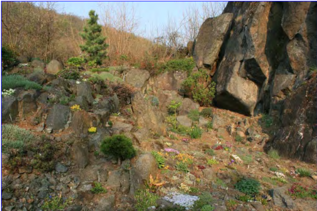
A cooler corner of the Beauty Slope