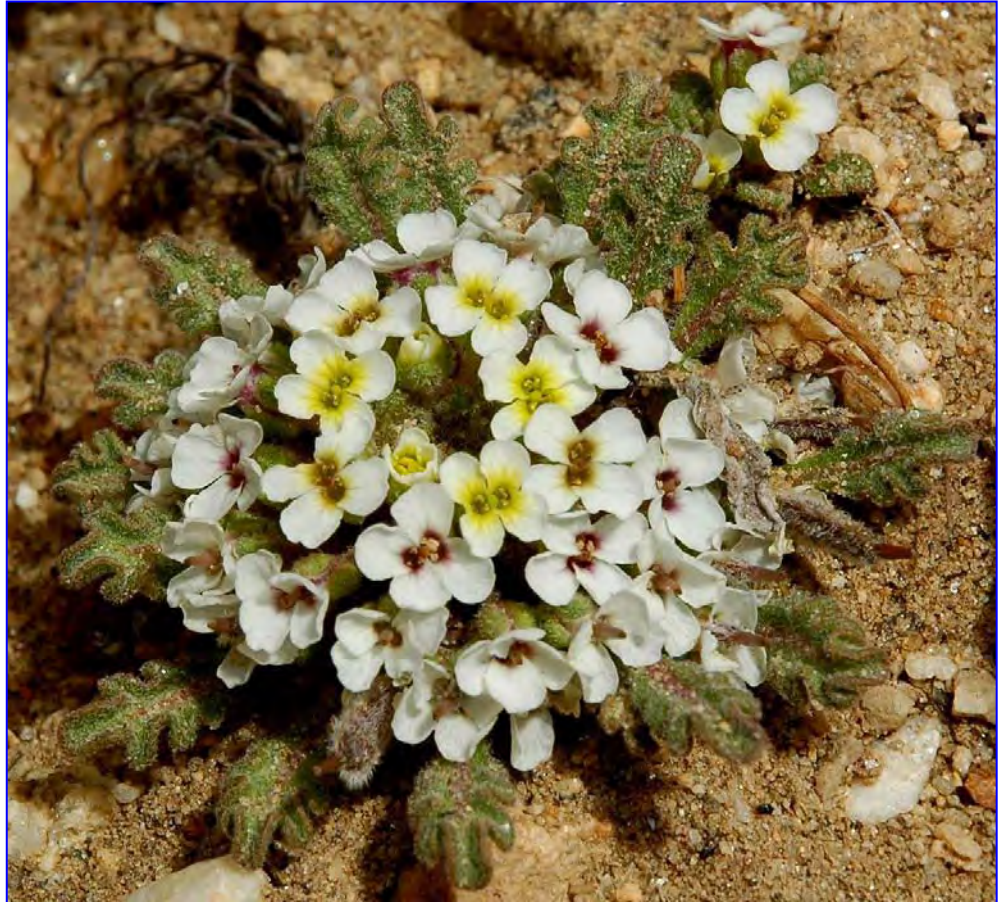
Solms-laubachia baiogoinensis close-up