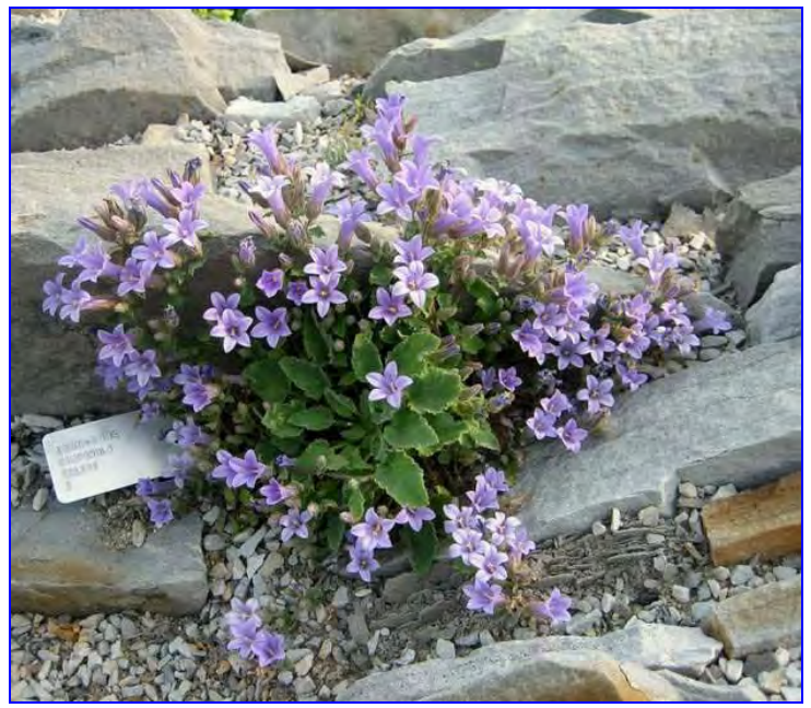
the biennial Campanula celsii