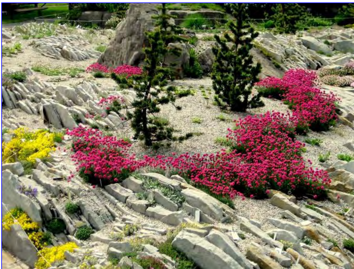
ROCK CREVICE SAND BED IN MONTREAL BOTANIC GARDEN

slippery geotextile at the steep slope. Canadian frosts, water and a road for trucks nearby (above) helped the movement of heavy layers of sandstone and sand. I learned something from this oversight.