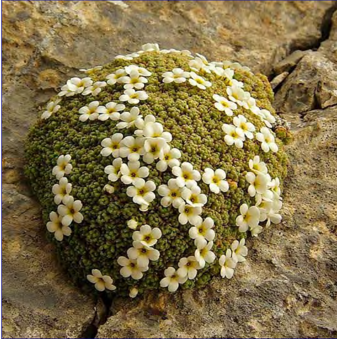
left: Androsace helvetica

tufa rock in the open garden. I saw a nicely sized plant in full flower in garden of my friend Jiri Novak in Pardubice (Czech Republic). In my climate (hot summers and wet winters) it's impossible to grow it in an alpine house, as the plants are totally out of character, and are also attacked by fungal infections and insects. I have one quite happy plant of E. nanum , which has given in the last few years only 1-2 stems with a couple of flowers on each, growing in my crevice garden built of silicate slate. Other plants are grown in my tufa troughs under the roof overhang; however they do not flower because there is too little light on eastern side of my house.