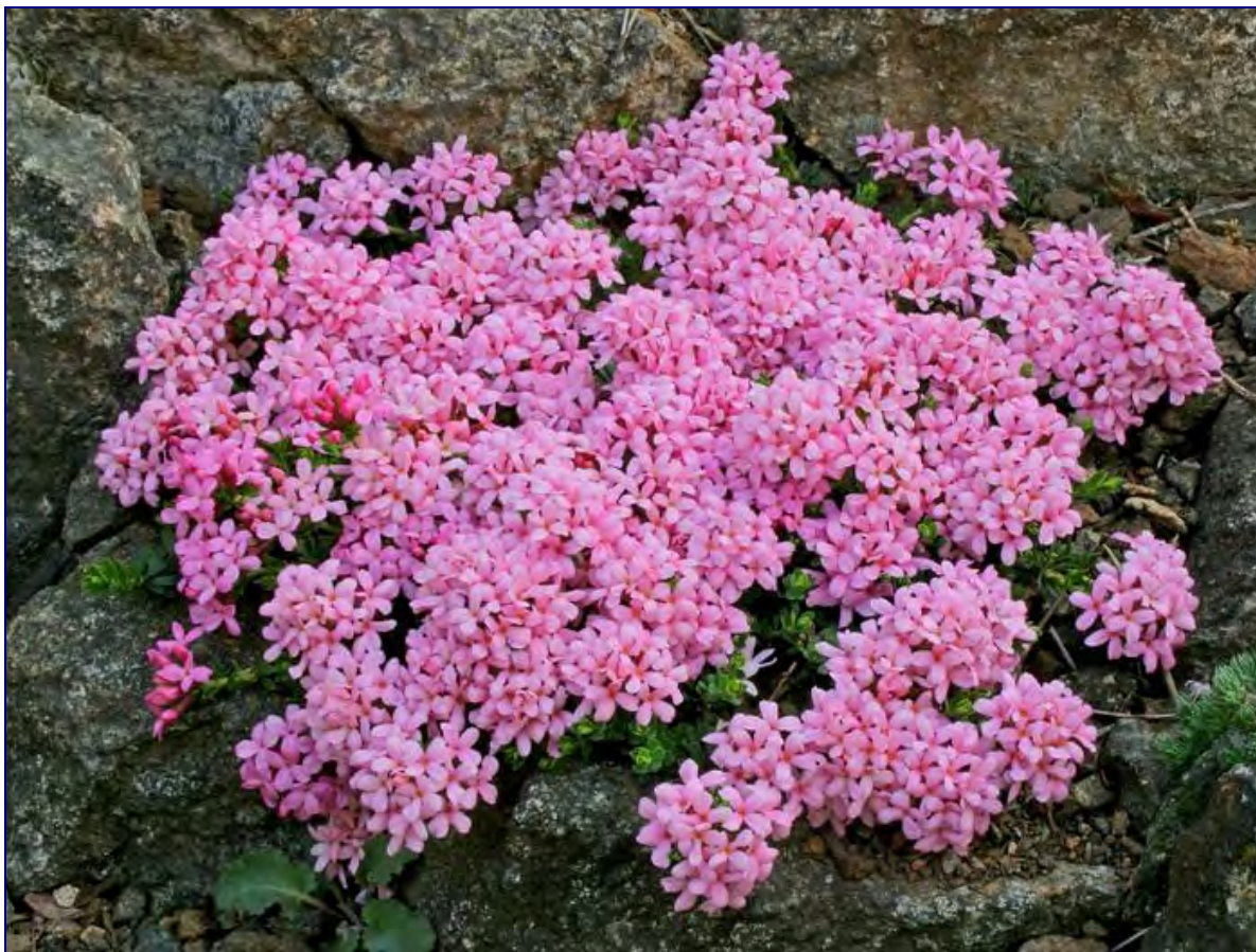
D. cneorum var. pygmaea 'Czech Song'

Diligently, drearily taking my tape measure to the copious dried material in the herbarium at Kew, I came up with variations (in mm) of from 6 x 2 to 29 x 3 for Austria, 8 x 2 to 12 x 4 for the Pyrenees (where the perianth tube can be as short as 5mm), 14-16 x 2-3 for Bohemia (perianth tube 6-11)...and at that point the project was abandoned, for it was very apparent that it was akin to chasing a rainbow's end. Are all the dwarfer ones to be given taxonomic status as var. pygmaea (this seems to be the way of the horticultural world at present), or must we hunt for wrinkles on the perianth tube before we can pronounce confidently?