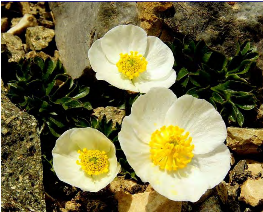
Left: Ranunculus seguieri

Ranunculus seguieri , very compact Thlaspi rotundifolium , Gentiana orbicularis and Androsace helvetica all grow on one side whereas Ranunculus glacialis , Primula minima and mats of Loiseleuria procumbens with hundreds of pink flowers are on the other side of the pass. On volcanic rocks Primula glutinosa with the most violet flowers of all European species proudly showed its 10cm high inflorescences. I've tried it several times in my lowland garden with no success. Cushions of Androsace alpina were closely bound to limestone rocks on steep northern ridges and attracted us with their white and pink flowers. The clumps were somewhat smaller than those in Swiss Alps but still pleasing to the rock gardener.