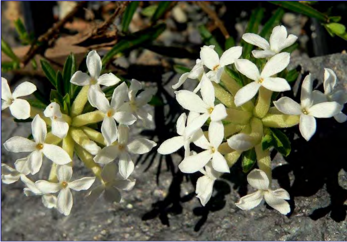
Daphne cneorum 'Snow Carpet'

Correvoon was exporting plants at this time, so his stock may well have been that which received an Award of Merit when exhibited in 1920 by Messrs Tucker (Oxon.). The 'white form' of the species currently grown is in line with this selection, forming a reduced but open mat with rather globular clusters of flowers terminating procumbent shoots clothed with oblanceolate, bluntish-tipped leaves 16x5mm. A spread of 60-100cm can be expected of a mature plant, whereas the so-called white form of var. pygmaea is perceptibly 'slower and lower growing'. One can trace the latter back to at least the 1960s, when Connie Greenfield (Epsom, Surrey) acquired her plant from an unknown source and later distributed material. A photograph of this appears in AGS Bulletin 227:58, and the plant shown is described as 'an even, low mound some 30cm in diameter and rising to some 10cm high, with the small clusters of eight to ten white flowers evenly dotted over the entire surface...'