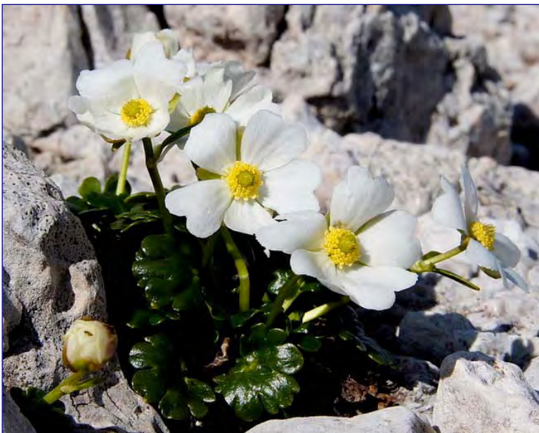
Left: Ranunculus alpestris

Primula tyrolensis found its home in a similar habitat, located in a safe north western position. The same species was in full bloom 800 metres higher up, showing intensive pink flowers over small rosettes. This Primula , almost as attractive as P. allionii , is easier outside in cultivation. In my climate it can be grown also in alpine house in a pot with very good drainage and occasional fungicide spray. Just 200 metres higher, not far away from San Martino, we saw hundreds of cushions of Eritrichium nanum growing on immense dolomitic boulders on huge screes.