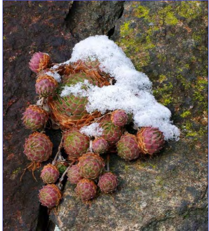
Above right: Sempervivum hybridum