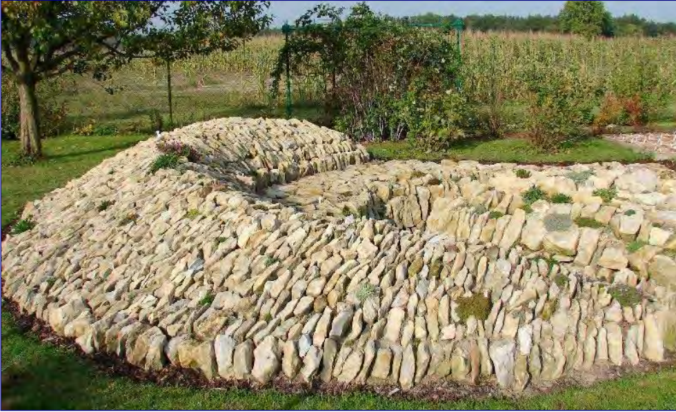
Left: eastern Ridge

There are steps into the two entrances to the gorge.