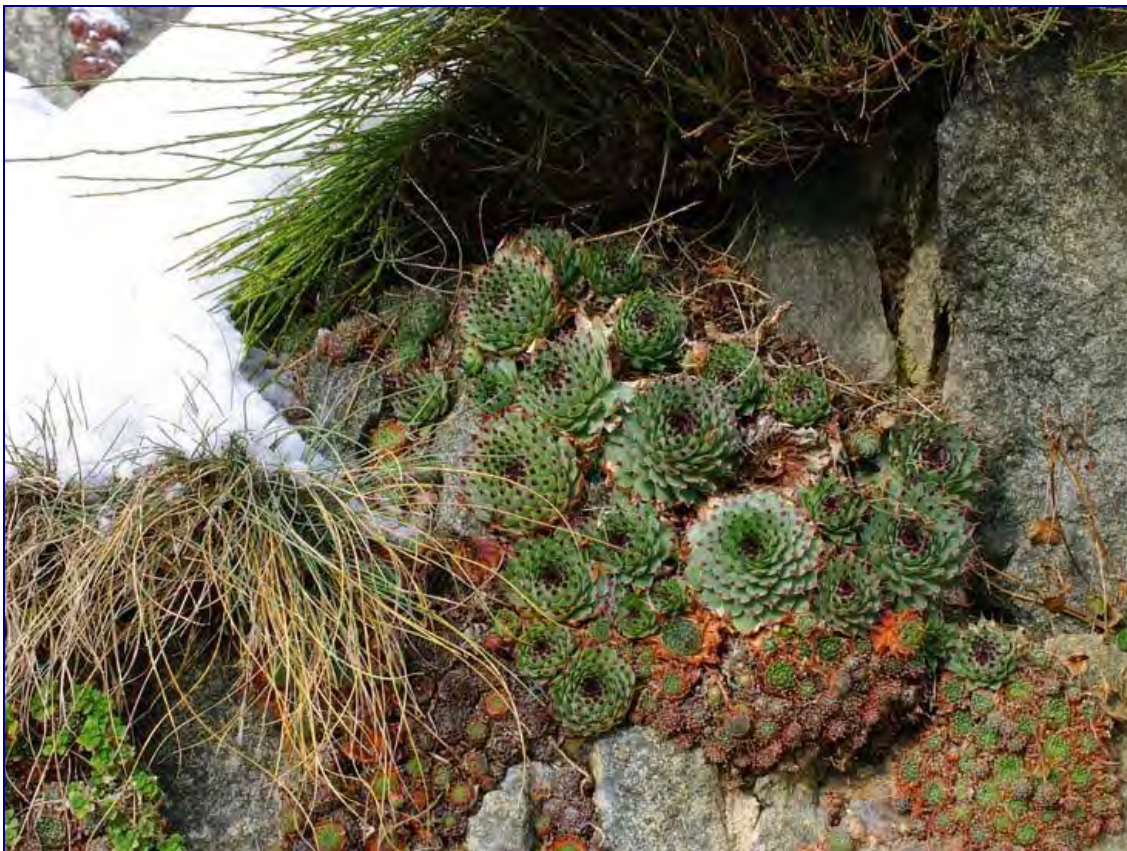
Solid rosettes of Sempervivum calcareum

If you are a Bohemian, you must be partly a happy ignoramus!