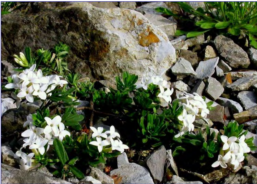
Left: Daphne cneorum var. pygmaea 'Alba'

Correvoon was exporting plants at this time, so his stock may well have been that which received an Award of Merit when exhibited in 1920 by Messrs Tucker (Oxon.). The 'white form' of the species currently grown is in line with this selection, forming a reduced but open mat with rather globular clusters of flowers terminating procumbent shoots clothed with oblanceolate, bluntish-tipped leaves 16x5mm. A spread of 60-100cm can be expected of a mature plant, whereas the so-called white form of var. pygmaea is perceptibly 'slower and lower growing'. One can trace the latter back to at least the 1960s, when Connie Greenfield (Epsom, Surrey) acquired her plant from an unknown source and later distributed material. A photograph of this appears in AGS Bulletin 227:58, and the plant shown is described as 'an even, low mound some 30cm in diameter and rising to some 10cm high, with the small clusters of eight to ten white flowers evenly dotted over the entire surface...'