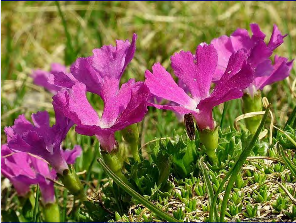
Left: Primula minima

One of the most unusual places was Passo di Selle (>2500m), which is easily accessible from Passo San Pellegrino. It arose between two different types of rock - volcanic and limestone, so you can see within in a very short distance both calcifuge and calcicole species.