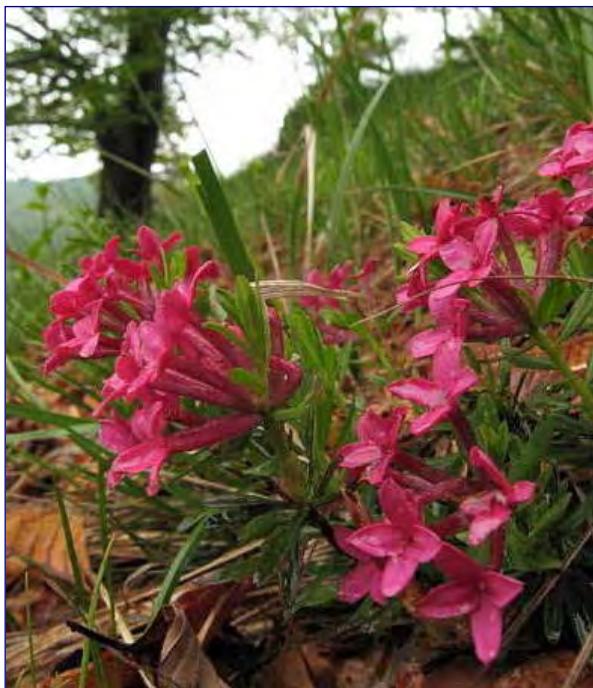
D. cneorum Dark form in Western Slovakia

But, checking on the exact terms of reference, published in New Flora and Sylva 7:275, I find that his diagnosis stipulates ' similis Daphne cneorum L. In omnibus partibus minor et perianthi tubo extrinsecus ruguloso '. The second qualifier, requiring that the tube of the perianth should be irregularly wrinkled over its outer surface, has been generally ignored subsequently, so too the proviso that the flowers should reach only 10 mm, rather than an average of 13 mm in diameter. (He also measured the length of the tube at 8 mm, as against 11 mm in 'typical' plants, though the editor did him no service in misprinting the former measurements as 8 cm, which would indeed be utterly remarkable.) He further circumscribed his variant as attaining a height of at most 6.5 cm, and being 'prostrate and compact', whereas ordinarily, he opined, D. cneorum has 'a loose and trailing habit forming a mass about 26 cm in height'. To round off, the leaves of his var. pygmaea