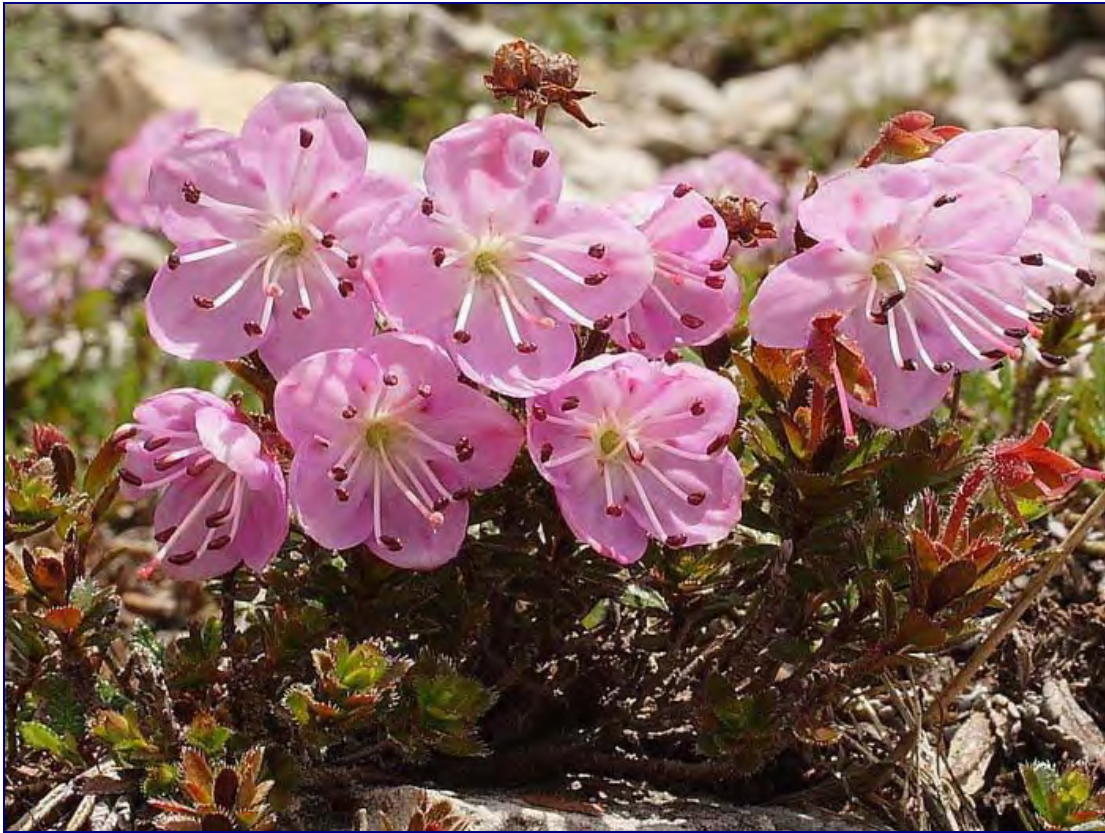
Rhodothamnus chamaecistus , a diminutive member of the family Ericaceae

most attractive campanulas, can be also grown on tufa rock in our gardens in northern or north-eastern exposures. Last spring my C. morettiana , a plant bought two years earlier in one of the German nurseries, gave me 5 big flowers.