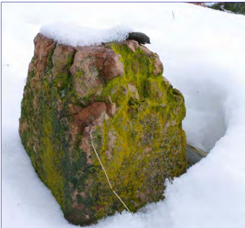
Left: eroded marble post

I felt a need to show our readers two different characteristics of this part of the Czech Karst protected area. So I took my monopod to support myself in slippery snow and to support my new camera with brand new lens (Pentax K 20D + 35 mm Macro Limited lens). Behind my rock garden area is pine forest with nice, slightly alkaline, dolerite outcrops forming 200 m long southern ridge.