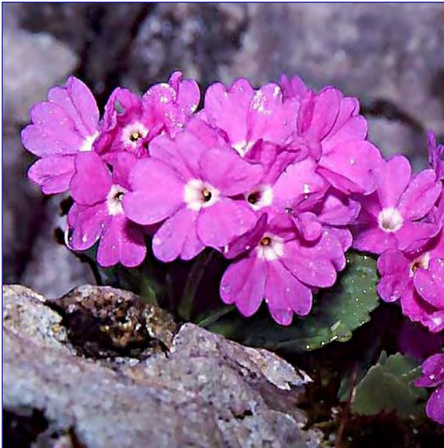
Left: Primula hirsuta subsp. valcuvianensis , detail.

denser indumentum formed of longer hairs on the leaves and in details of the calyx teeth, which are ovate in shape. The leaves are grey-green with pale edges. Chromosome count is 2n = ca. 62 , the same as Primula albenensis . The plant flowers in April and May.