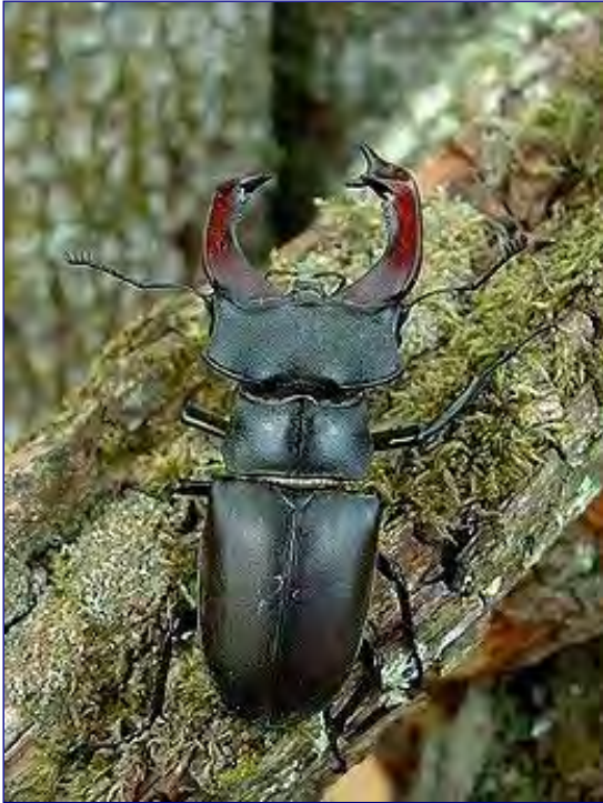
Above left: Lucanus cervus

This partly neglected extensive rock garden is fortunately not a part of the Natural Memorial Reservation called Beauty slope which is distant about 500 m east. This reservation comprises 20 hectares of steep stony steppe, in altitudes from 215 to 347m, well known for a green lizard, Lacerta viridis , the biggest Czech beetle Lucanus cervus , the rose coloured and pungent herbaceous Dictamnus albus , and shrubbery of Cornus mas with an intensive yellow spring show. Plenty species of butterflies can be seen here. The extremely steep slopes there are formed from acid grey slates and alkaline mudstones.