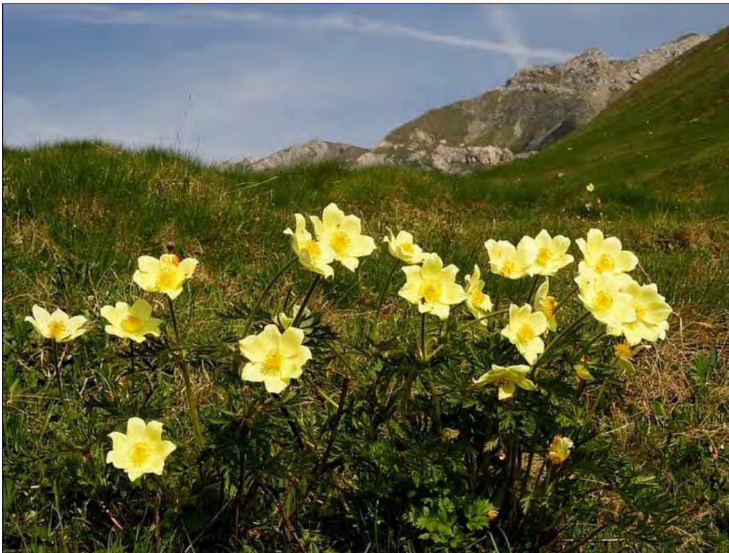
Left: Pulsatilla alpina subsp. apiifolia

The best option for it is a western or eastern side near the top of an exposed tufa rock, shaded somewhat with a net in the hottest summer days.