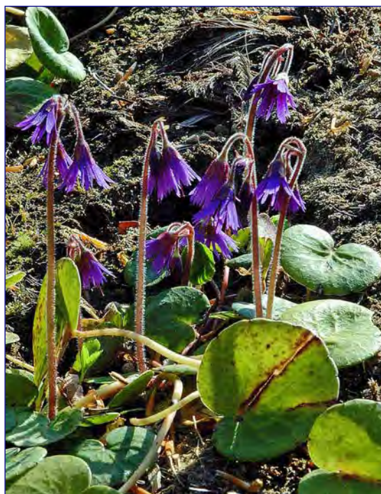
Far left: Shortia uniflora var. kantoensis , Honshu.