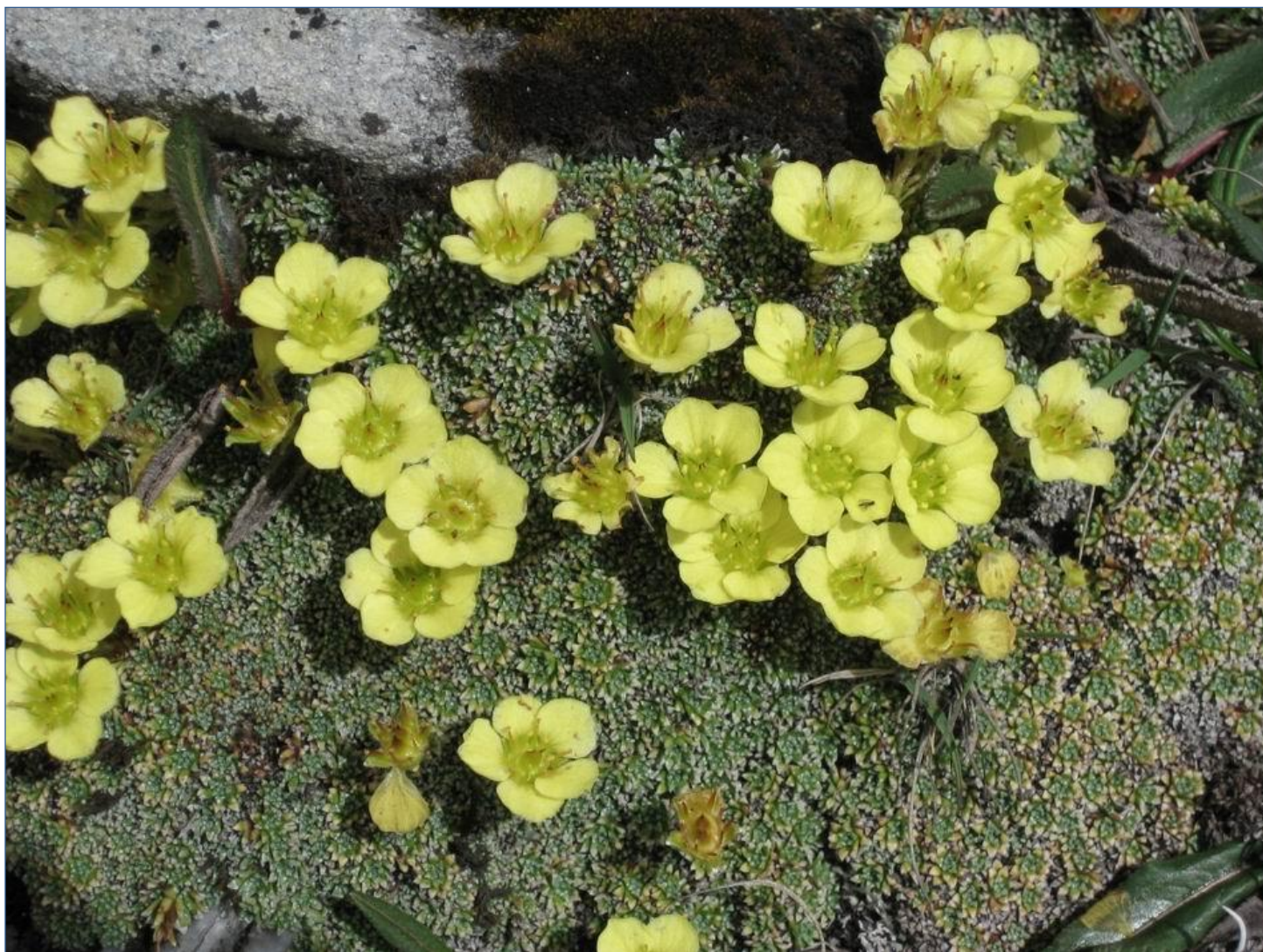
Saxifraga thiantha var. citrina

A flat damp area of pasture was carpeted with Primula calderiana , Caltha and a small white anemone. The skeletal-flowered Primula tenuiloba was widespread on a damp bank and Primula megalocarpa thrived. Once over the pass we descended to the lakeside where broad drifts of Primula sikkimensis var. hopeana ran down to its shore. Many of the creamy-white flowers had a very attractive rose-tinted corolla tube. Fluffy Eriophyton wallichianum and Corydalis meifolia ran around in the rockier scree areas, and in the steep lakeside pasture Pedicularis and the pink Ponerorchis chusua orchid made a pretty display with white Anemone rupicola amongst Cotoneaster . Dainty Primula atrodentata made a shy appearance. Further on, Meconopsis bella and a pink crucifer grew on the rocky slopes alongside showy yellow-flowered Saxifraga thiantha var. citrina . The steep slope on the other side of the valley was densely clothed with larger rhododendrons.