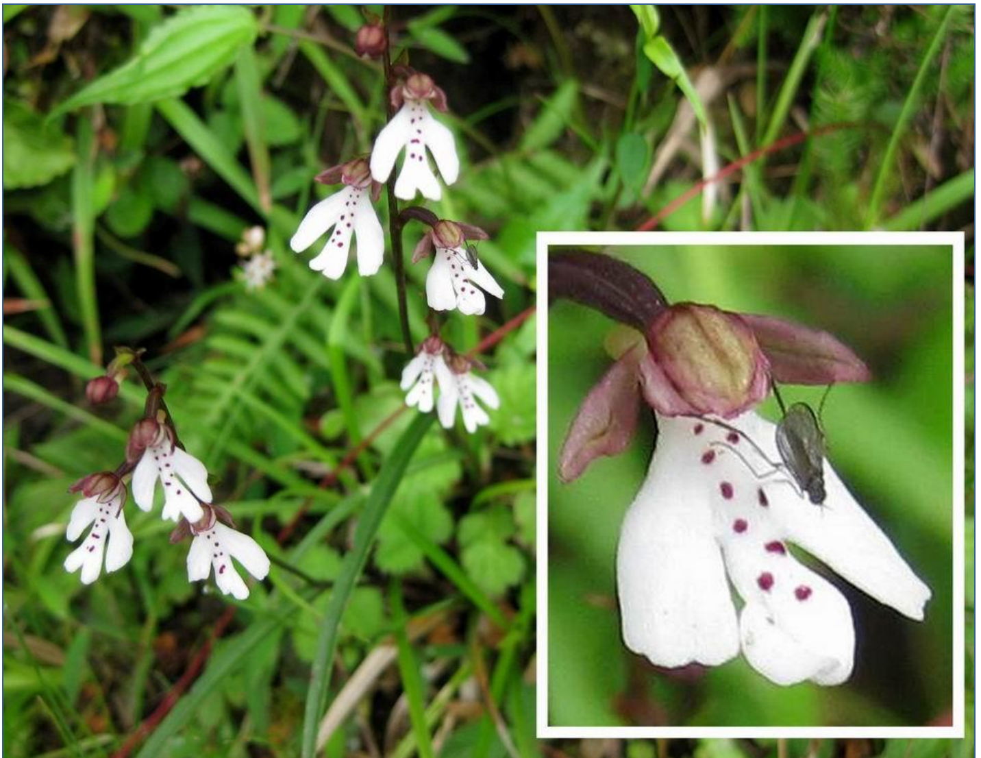
'Buttoned Ghost Orchid' Ponerorchis puberula syn. Amitostigma puberulum .

Flying in from Delhi over the Himalayas with the high peaks rearing through the clouds, and diving down to Bhutan's only airport in the beautiful Paro valley leaves a lasting impression. Few pilots are qualified to fly this route which suddenly sweeps down past steeply forested ridges. The wing tips almost graze the rooftops as the plane makes its rapid descent to what must be the most scenic airport to be found. Welcoming Bhutanese in their striking national costume placed Buddhist scarves round our necks in their traditional welcome and we were whisked off to the capital, Thimpu. The air was clean and clear and we drove through alpine scenes of little white houses scattered over the green valley flanks.