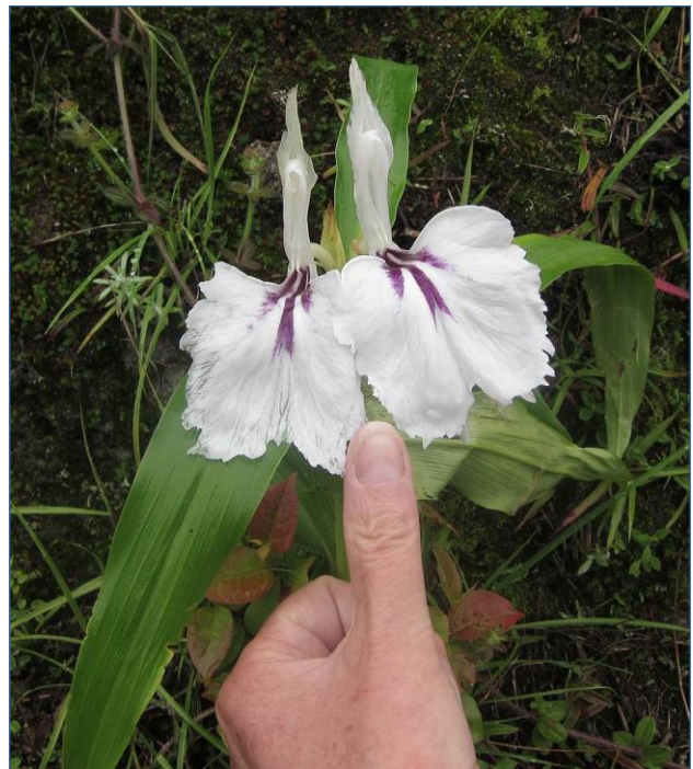
The "showy new" Roscoea