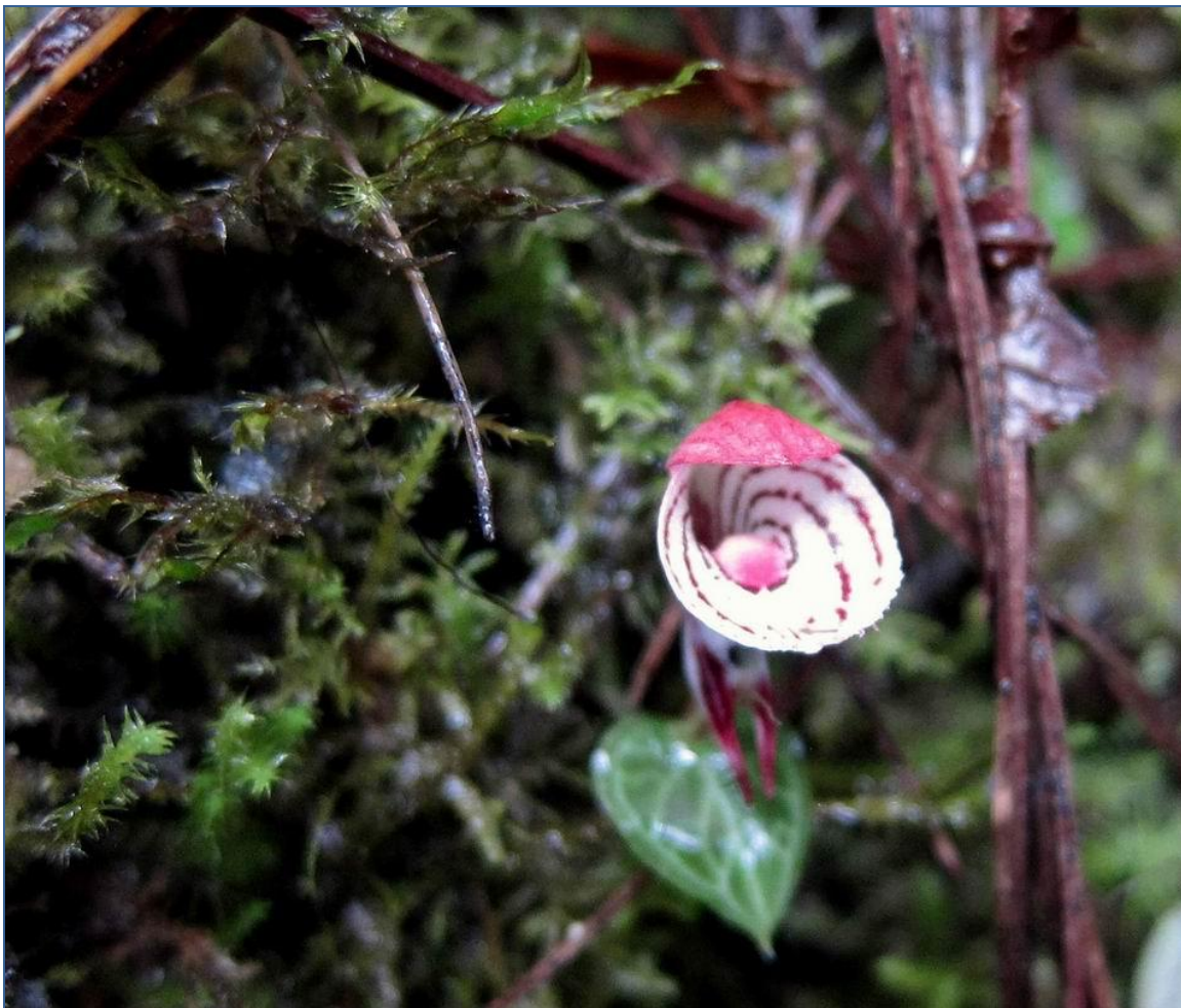
Corybas elegans – the tiny size of this can be seen by the scale of the moss

The seventh of July was our last trek day and it was dry. There was a relaxed atmosphere in camp and we walked at a leisurely pace downriver through mixed woodland to our finishing point at Dur. The horsemen had come across a large wild boar on this path the previous night but we just saw Arisaema