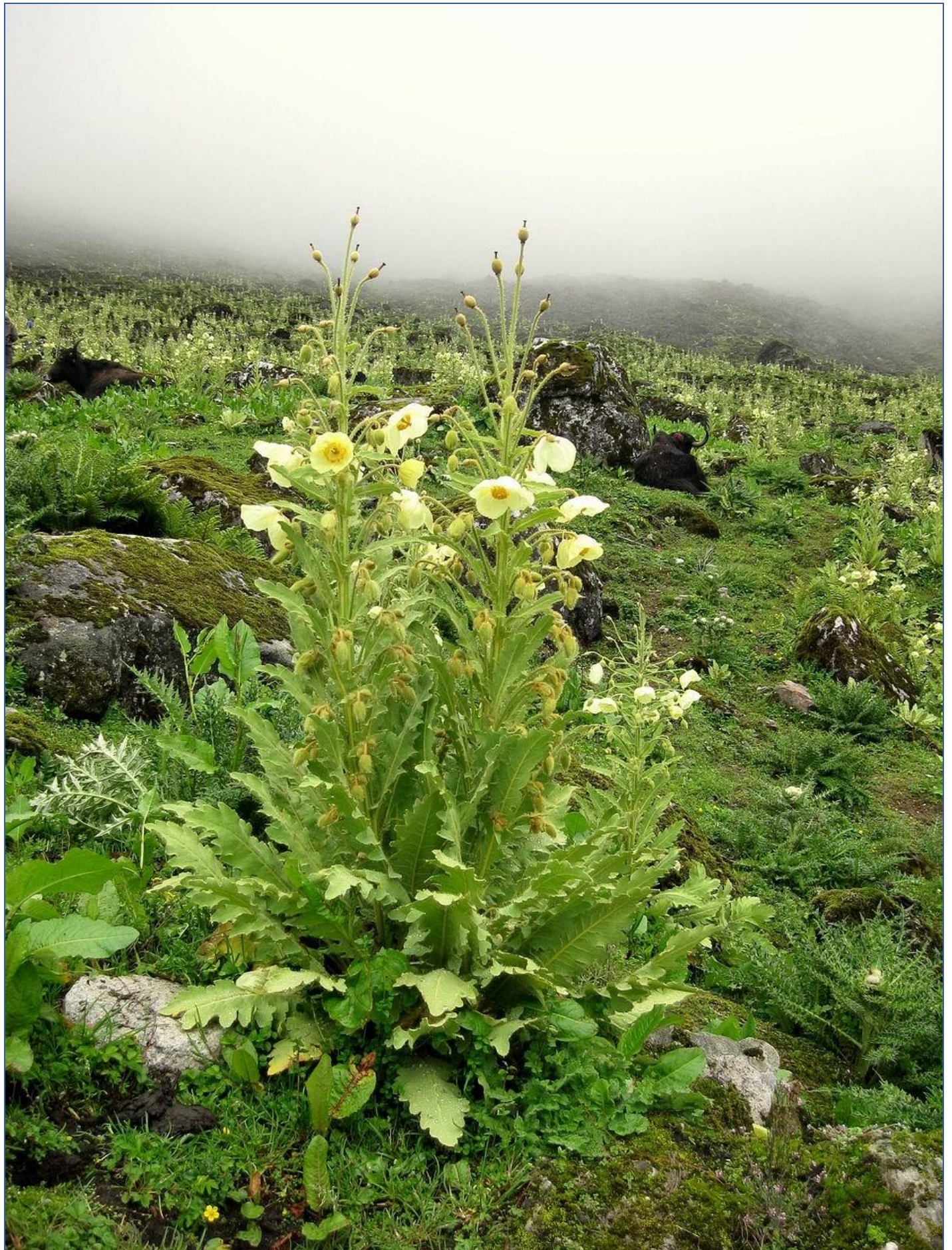
Meconopsis paniculata in profusion in the mist