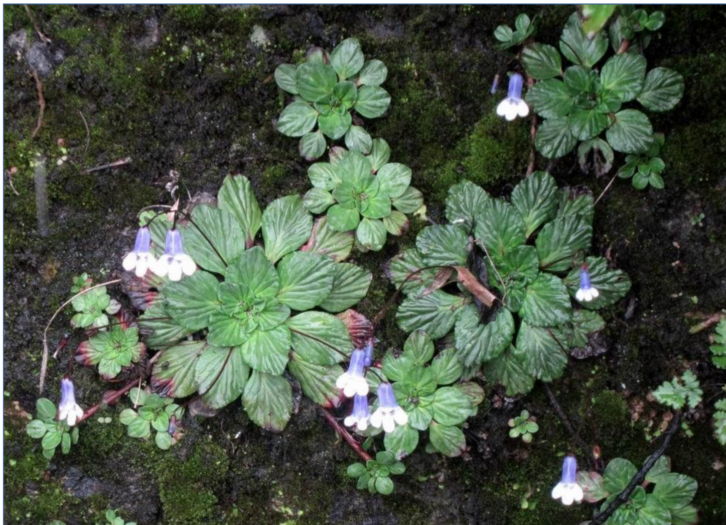
Corallodiscus species on the wet bank

Heading south we wound up and down valley sides amongst tropical vegetation. The slopes were very steep and the lush plants jostled for space. Plants I have only seen in heated glasshouses thrived – orchids, Hedychium and Costa . A charming little Corallodiscus was discovered running down a wet rock bank. Waterfalls gushed onto the roads and we were delayed by landslips.