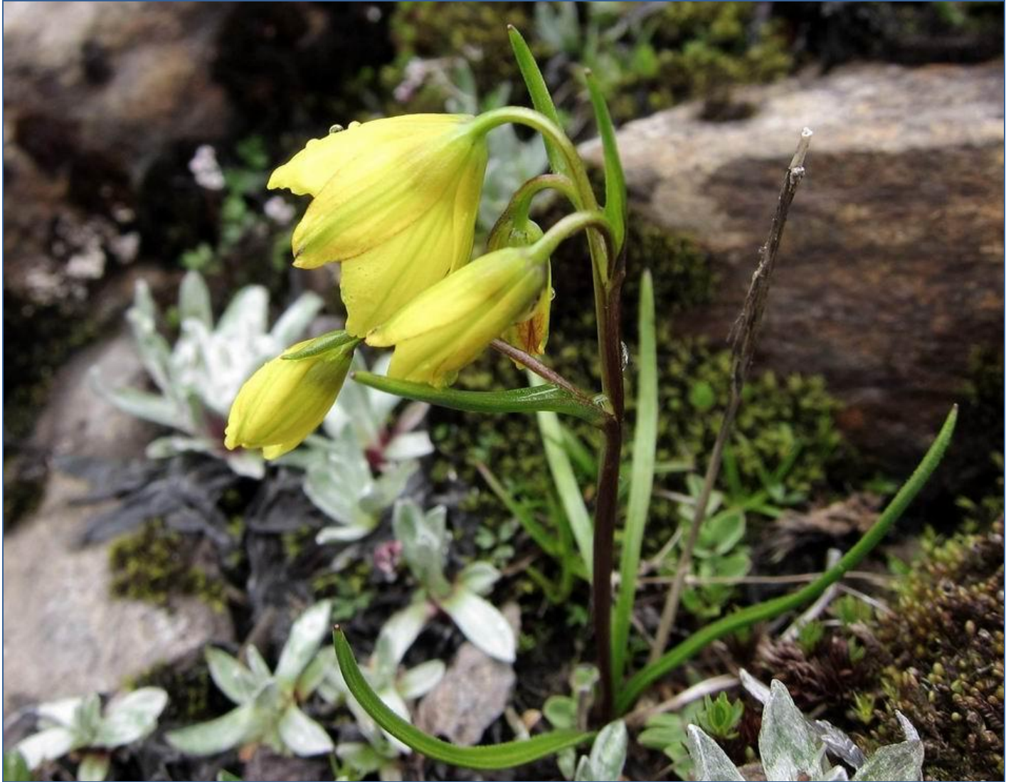
The banksides were dotted with yellow Lloydia flavonutans .

Lake Conch (in the shape of the revered conch shell used in religious ceremonies) was glass-like with a wash of Primula sikkimensis var. hopeana running down from the cliffs. A steep slope was once more home to P. umbratilis and saxifrages were common amongst the rocks. From the second pass we made a difficult and muddy descent down to the bridge to cross over and climb to the night's camp. An impressive clump of Saussurea obvallata grew amongst the rocks at the crossing.