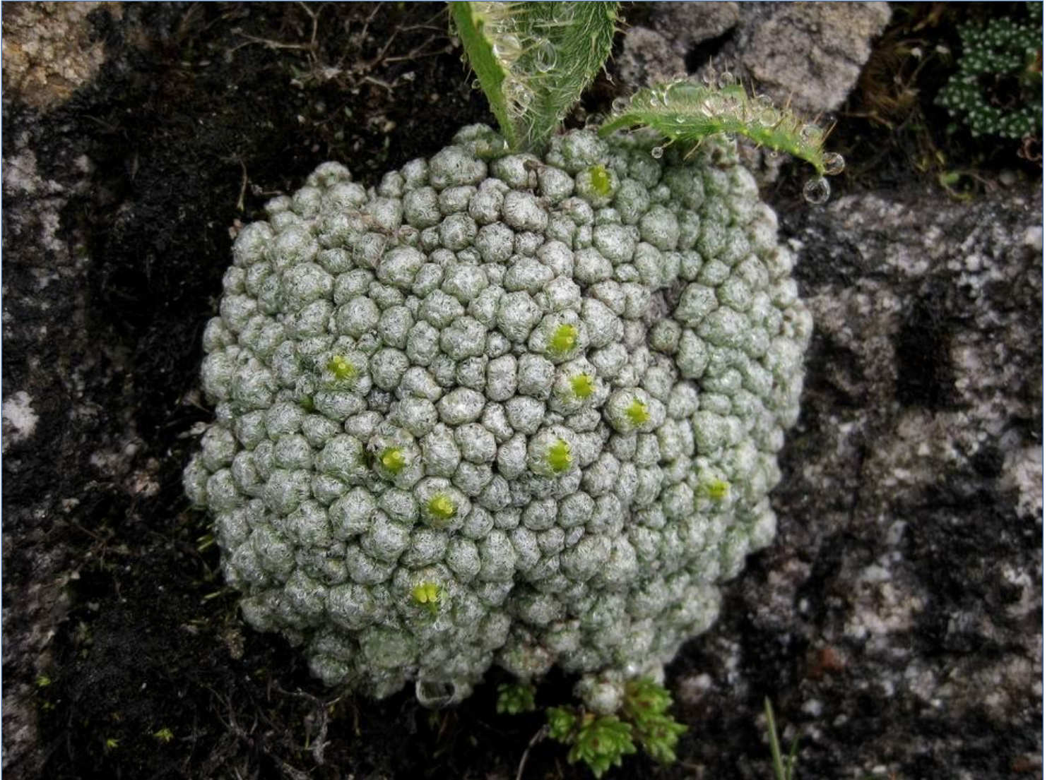
Saxifraga hemisphaerica (female form)

On the ninth day we set off watched by a group of blue sheep cavorting on the snowy crags. We made our way up the valley wondering if we were being watched by snow leopards. Elusive creatures, the elderly yak herder had only seen them four times in his whole life. We followed the stream upwards to cross extensive boulder fields with their tenacious rhodiolas, and consolidated screes with their rich populations of high alpine – Eriophyton , Meconopsis horridula , saxifrages and primulas. Very impressive specimens of the woolly snowball-headed Saussurea gossypiphora sheltered between rocks. An intriguing light-grey cushion with toothed incurved leaves grew between rocks nearby. This was Saxifraga hemisphaerica (female form); we never saw this plant again.