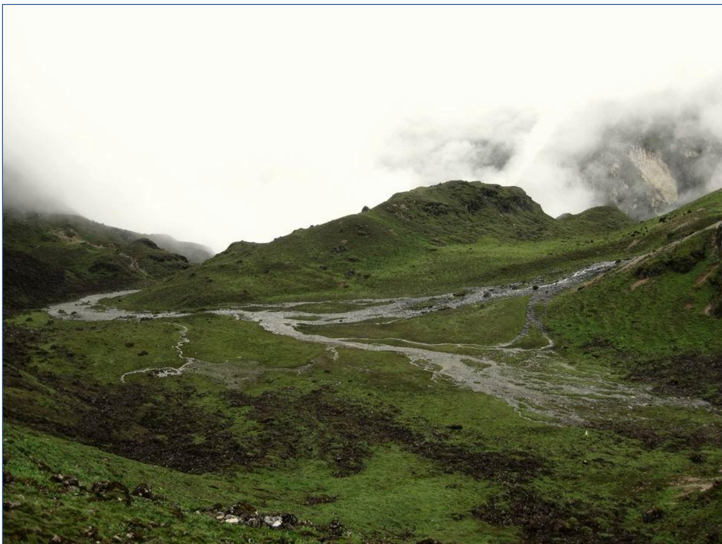
Across the Warthang basin

The population is small – around seven hundred thousand, of whom 65% are Buddhist of Tibetan origin. The remaining 35% are of Nepali origin and are Hindus, settled in the southern foothills. The country has one of the smallest economies of the whole world and Gross National Happiness takes precedence over Gross National Product. It is still very much rural with 69% of the population involved in agriculture working 8% of the land. Sheer inaccessibility coupled with low population and the Buddhist reverence for Nature have brought Bhutan unspoilt into the 21 st century with 72% of its land still under virgin forest. As such it remains a mecca for botanists, virtually unchanged since Ludlow & Sherriff explored the valleys last century.