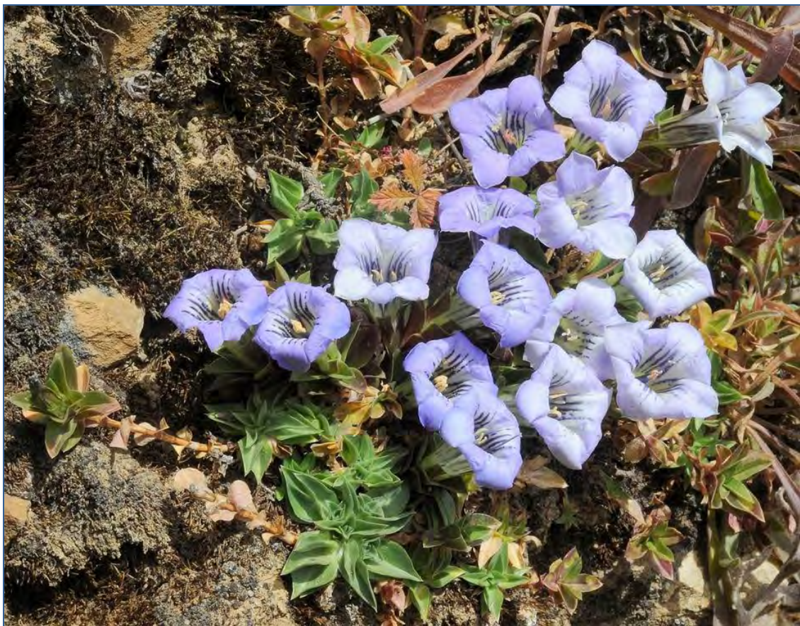
Gentiana stipitata subsp. elegantissima

This new subspecies grows at alpine slopes up to Litang at an altitude or 4700m.