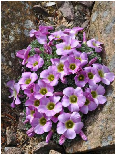
Oxalis enneaphylla 'Kila 19' in the garden of Kirstin and Lars in Herskind.

O. enneaphylla is selfsterile, so two plants are required to get a seedset. We have never covered Oxalis enneaphylla in the 20 years we have grown it. The temperature in Denmark has several times over these years been below -15C and sometimes below -20C.