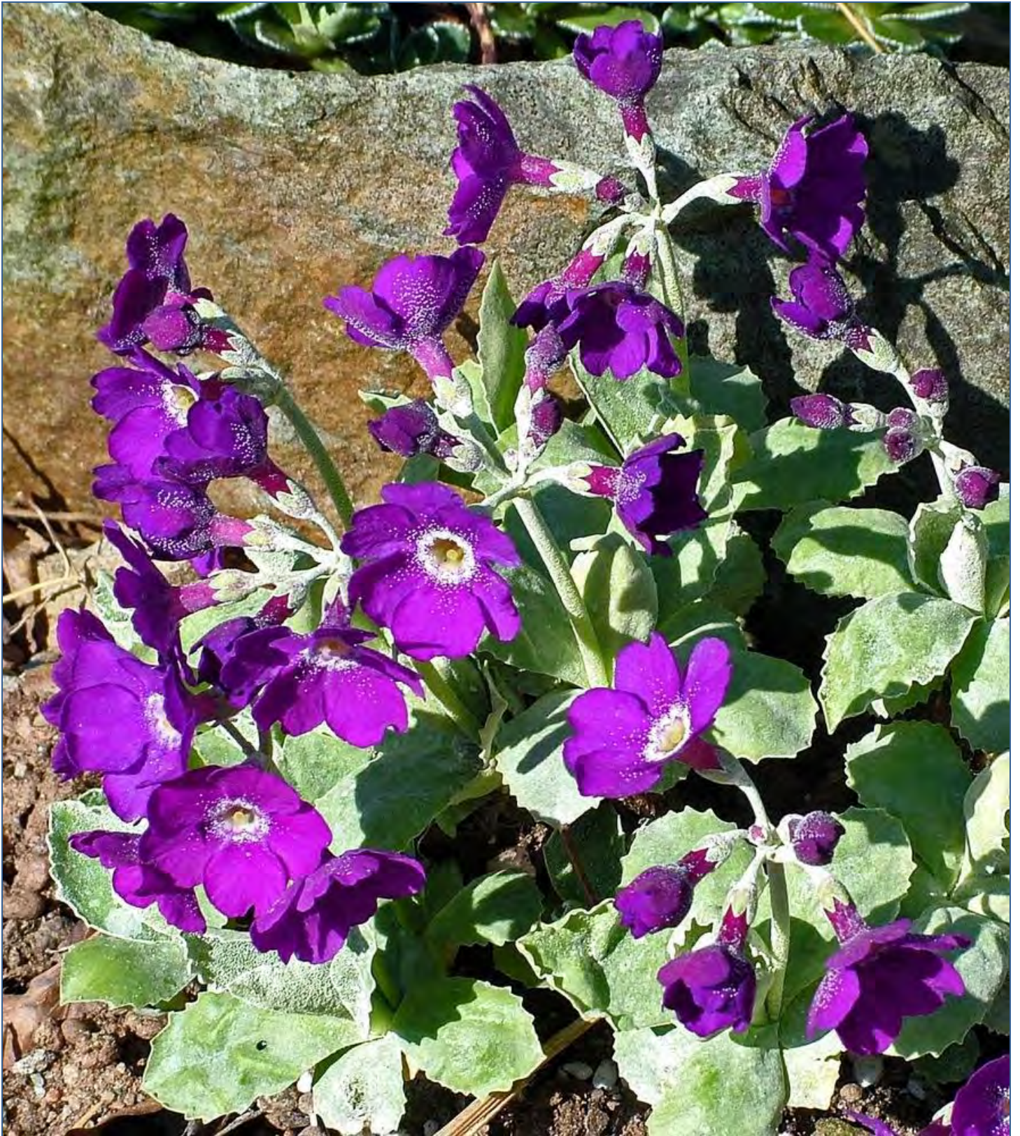
Primula marginata 'Beamish Variety' close-up at Bod Hyfryd