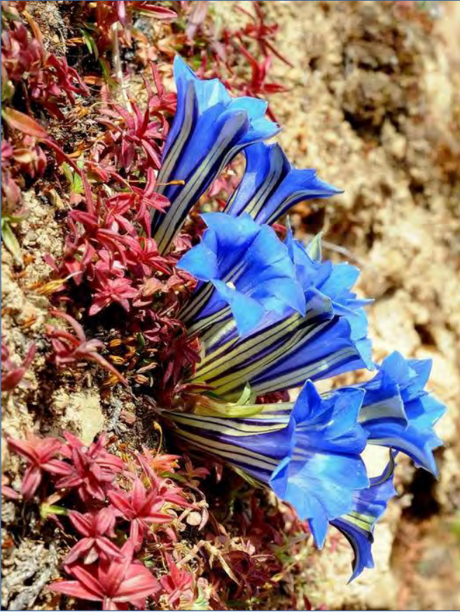
Gentiana alorum subsp. alorum