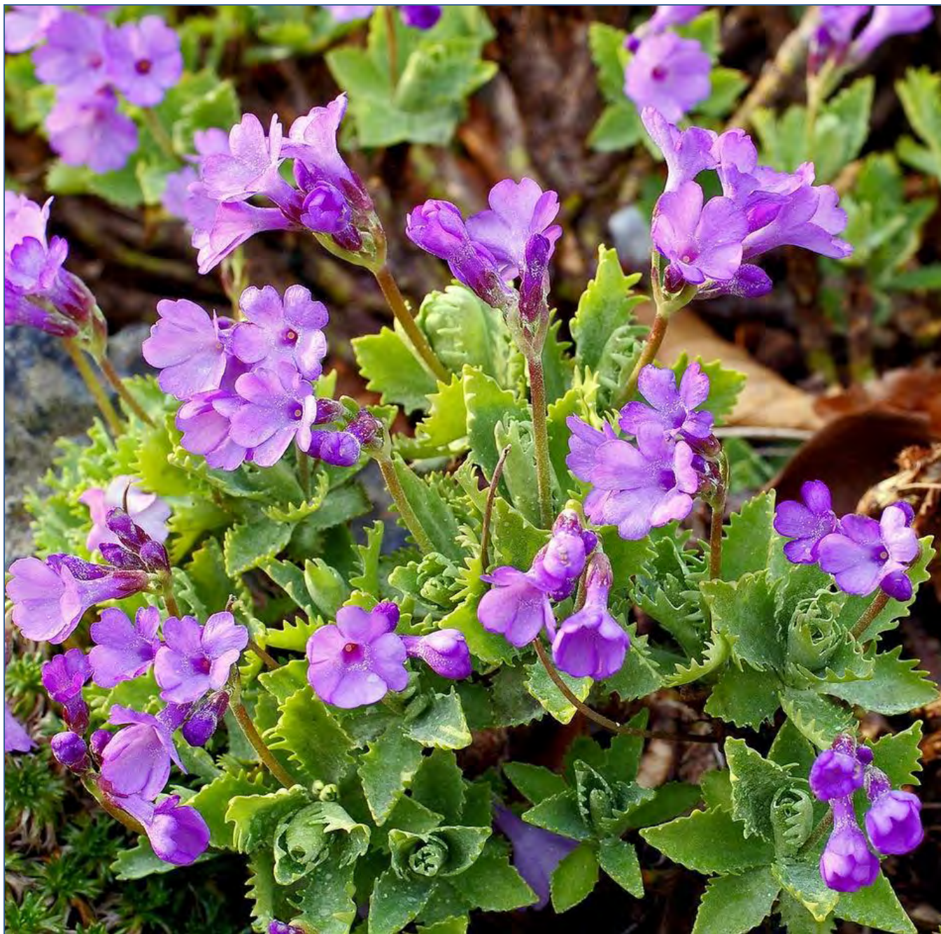
Primula marginata 'Napoleon'

Primula marginata from the south west Alps is one of the best European primulas for any garden, being tolerant of a wide range of soil and climatic conditions, even though it is strictly restricted in the wild to limestone, usually in rock fissures or on grassy rock ledges. It is a very variable plant, both in the size, form, serration and waxy covering (farina) of its leaves, and in the shape and colour of its deliciously scented flowers. P. marginata 'Napoleon' is one of the best forms, the attached photograph showing off its merits. It is more compact than many selections (some sprawl in an untidy fashion), with more waxy leaves and numerous clusters of soft lilac flowers. It was given to me by its discoverers, Henry and Margaret Taylor, who found it growing in an area of fortifications in the Maritime Alps which were made by Napoleon Bonaparte's army almost two centuries ago. I wonder if any of those troops, holed up in the mountains and sick for home, waiting for orders to advance or retreat, noticed these delicate scented blooms?