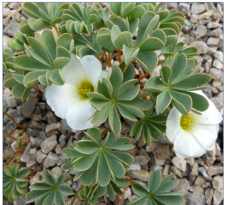
Above: O. enneaphylla 'Patagonia'