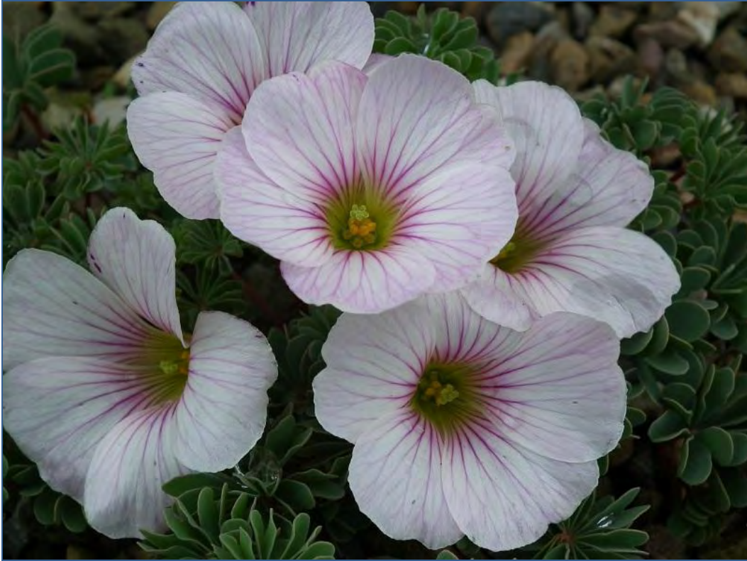
Oxalis enneaphylla with dark veins, from Luc Gilgemyn

More on Oxalis enneaphylla : from the pages of the SRGC forum, here are some variations on Oxalis enneaphylla from the gardens of our members.