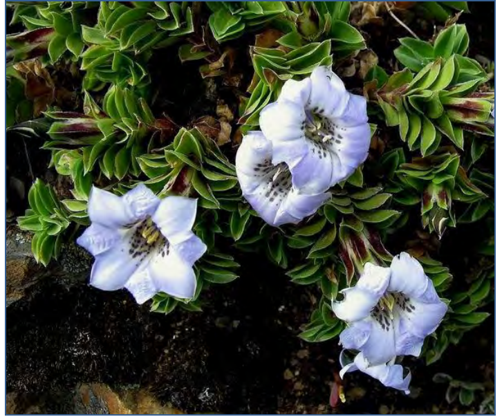
Gentiana stipitata subsp. elegantissima