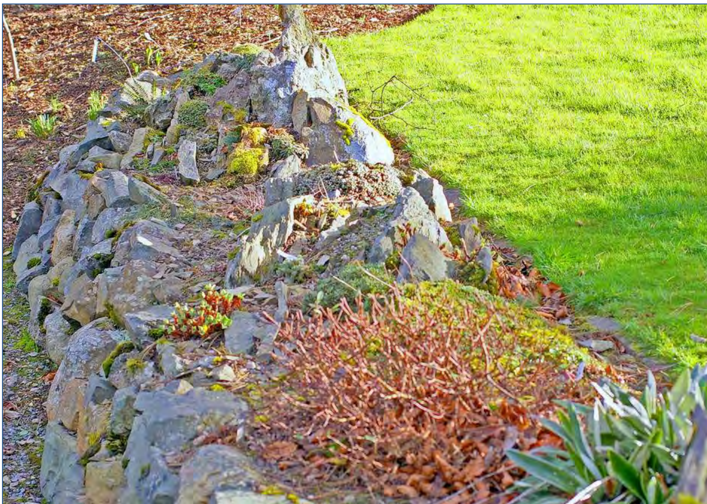
Raised crevice beds in winter

Let me tell you that my garden is located on a steep north-facing slope 1km from the sea and 150m above sea level in a country that is renowned for wind and rain, and you will appreciate that the chief requirement of the rock building was that it was firm, and of the compost that it was well drained, using about half sharp grit by volume, the other half being my garden soil, which is silty, stony loam. This mixture has proved to be a little too sticky for some plants (notably Kabschia saxifrages and dwarf dianthus), but just right for others, among which are European primulas. They have been particularly happy in a crevice garden built above a low retaining wall with a sloping grass lawn above that provides a source of moisture seepage.