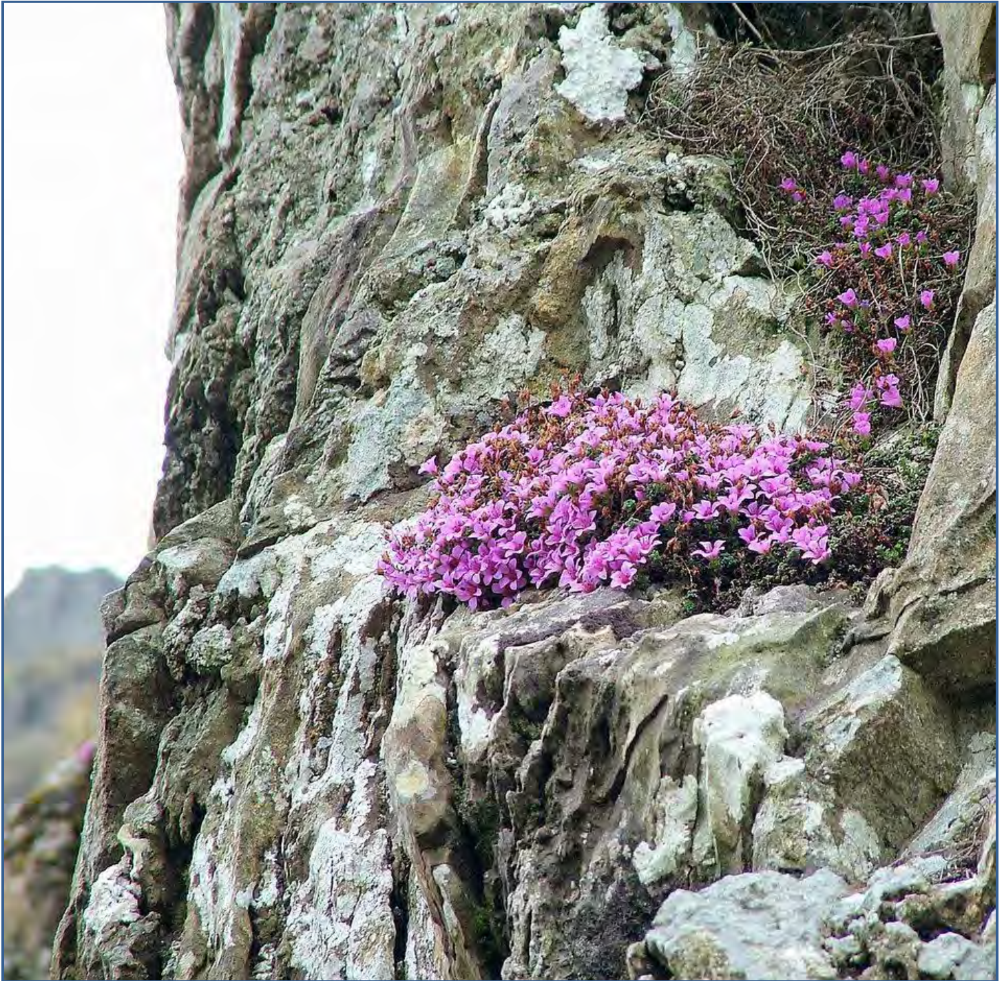
Saxifraga oppositifolia in Cwm Idwal

I shall talk here chiefly about a few European primulas among the range that I grow, but there are of course many other plants in the crevice beds, including several unusual celmisias and various other New Zealanders, all of which revel in our wet and windy climate. While as mentioned earlier, Kabschia saxifrages have generally not been successful, doing much better in one of my other crevice beds with even better drainage and more light, Saxifraga oppositifolia , which occurs wild in the mountains a few kilometres away, loves the moister, slightly shaded crevice beds and I have it in several forms from as far apart as Iceland, Scandinavia, France and Wales.