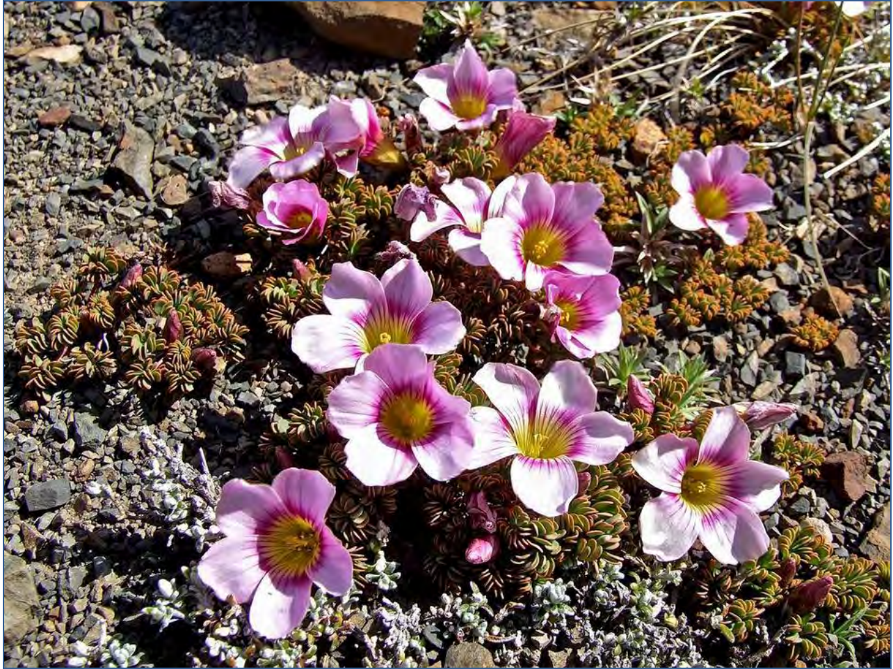
O. enneaphylla on the Patagonian steppe