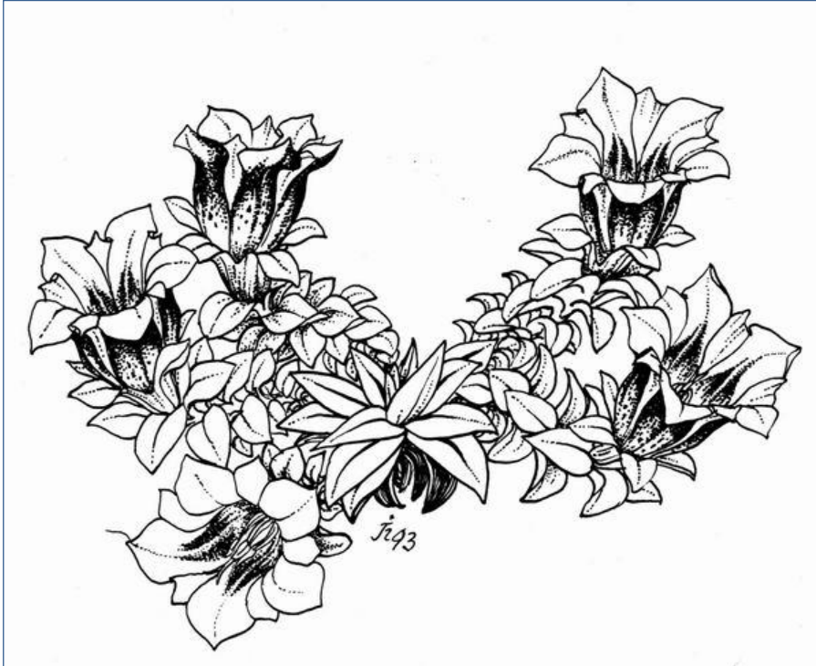
G. stipitata subsp. stipitata

After a few field trips into China we described two further Gentians from the section Monopodiae.