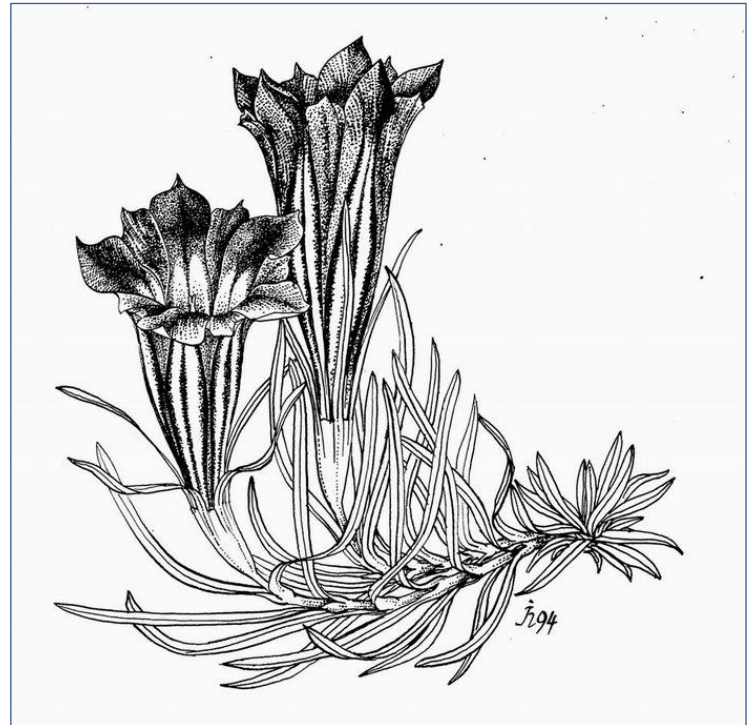
Below: Gentiana oreocharis