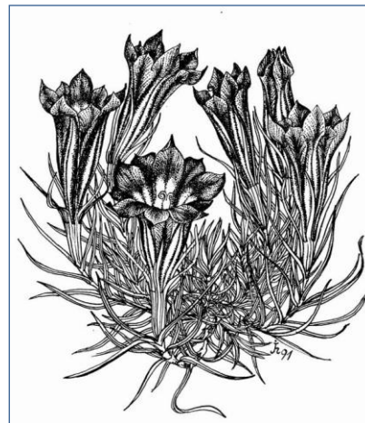
Left: Gentiana lawrencei