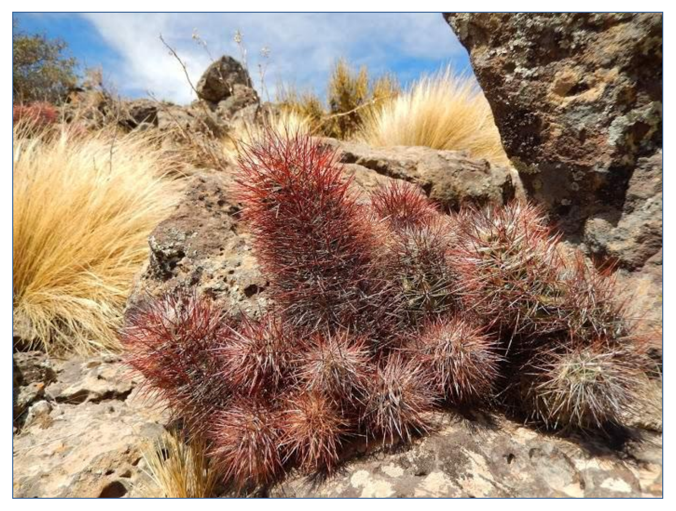
Austrocactus on La Meseta Somuncurá

Next we travelled to the Meseta Somuncurá near Valcheta, 500 km east of Bariloche. It is known for being one of the hottest and cold areas in the steppe. It is a remote and rarely visited high massif plateau known for several endemic species of animals and plants.