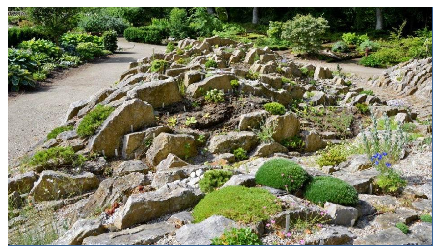
View from the planting area "Asia" to "Europe"

Before the project was set in motion, we had no experience of cultivating plants in sand, which of course does not contain any significant amount of nutrients. As the crevice bed is reserved for alpine plants, it was essential to create perfect drainage, since in Denmark we very often have rainy autumn and winter weather. As an added bonus the sand and the perfect drainage prevents the frost from moving the stones from each other which could be the risk if using other growing media such as compost/mulch. Over the top, 3cm of crushed rock is laid, partly to prevent evaporation and partly to keep plant rosettes free from constant moisture. This also has the advantage that seeds from weeds cannot easily root in it, and birds are not able to dig in it.