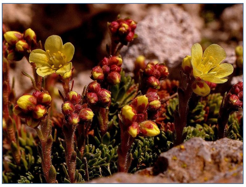
Above: Saxifraga 'Yellow Rock' Left: Saxifraga 'River Thame'

With the English <u>Allendale hybrids</u> of Saxifraga we were more careful because they have more Himalayan blood in their small thirsty bodies with heavy lime incrustation on their tiny leaves. Because of this they were accommodated in fissures between peat block. One good result of this experiment is visible in the sweetly blooming Saxifraga 'Allendale Hobbit' .