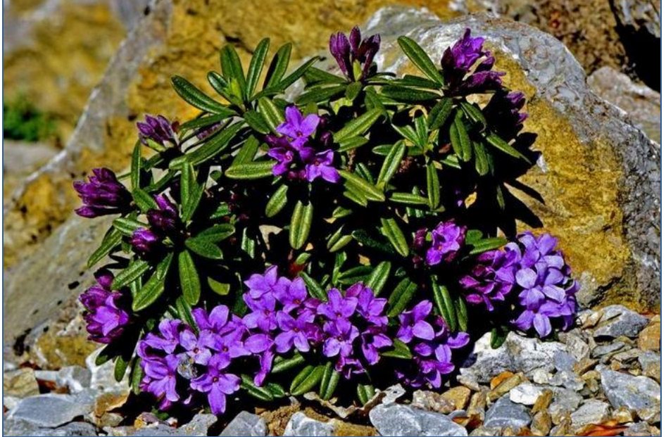
Above: Daphne x susannae 'Lawrence Crocker' Left: Daphne calcicola 'Sichuan Gold'