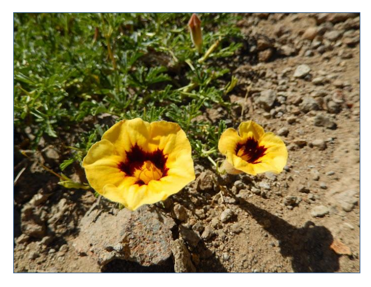
Above: Argylia bustillosii seen below Las Leñas Right: Schizanthus grahamii near Las Leñas

In Mendoza we stayed at the famous Las Leñas ski area where we saw Rhodophiala rhodolirion .