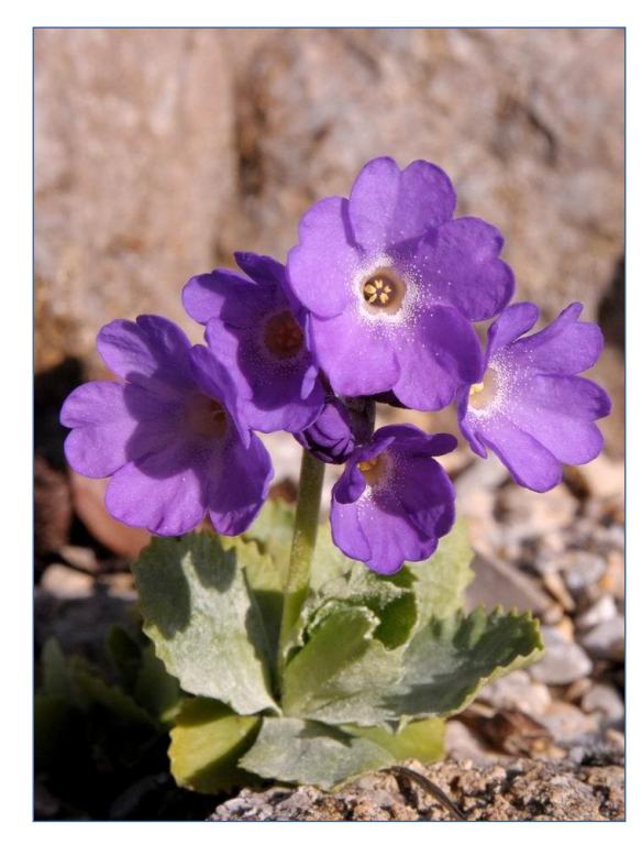
[Ed.: The use of 'Wolkei' may perhaps be a mis-nomer – there is a Primula x wockei ( P. x arctotis x P. marginata , sometimes known as Primula marginata 'Wockei']