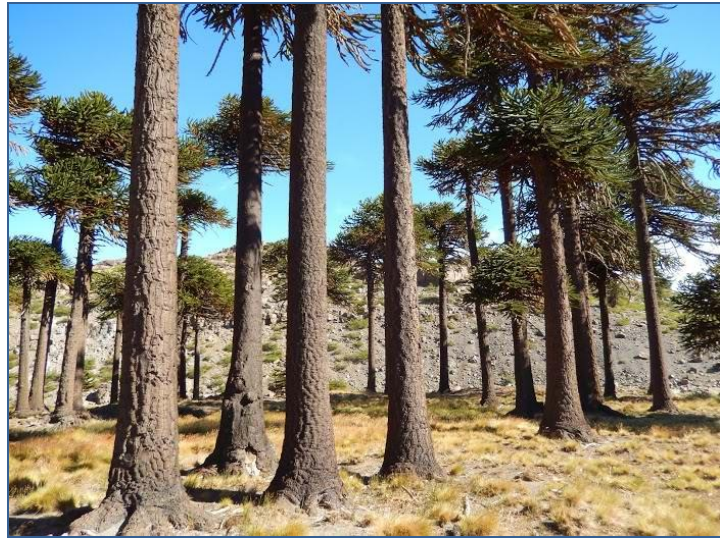
Araucaria araucana near Volcán Copahue