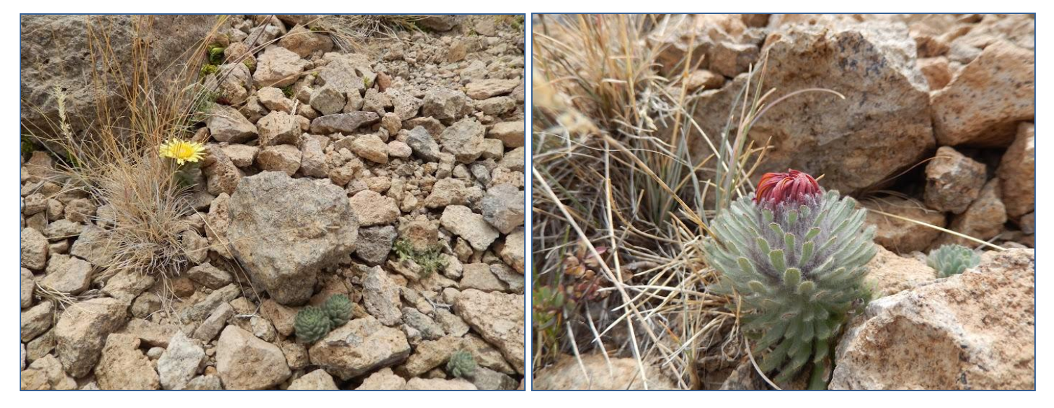
Chaetanthera villosa, yellow form

We continued north to Volcán Domuyo and went to the end of the road where we saw the Chaetanthera villosa . Yellow forms are found here.