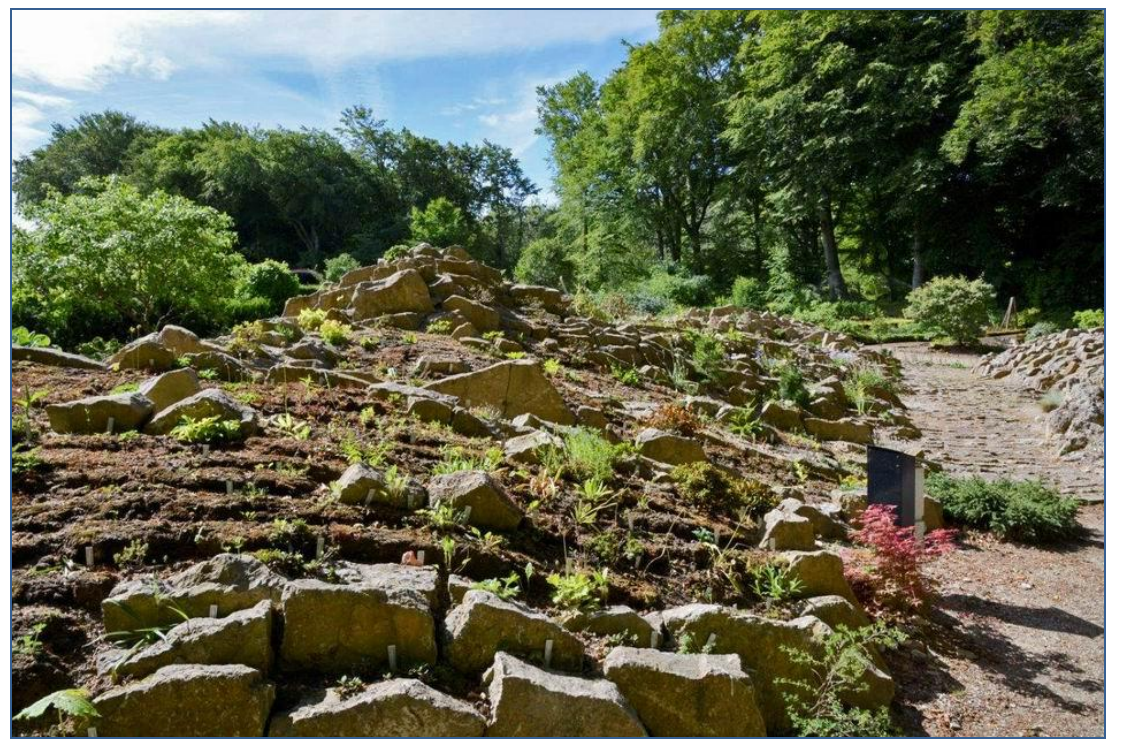
Field of peat bricks