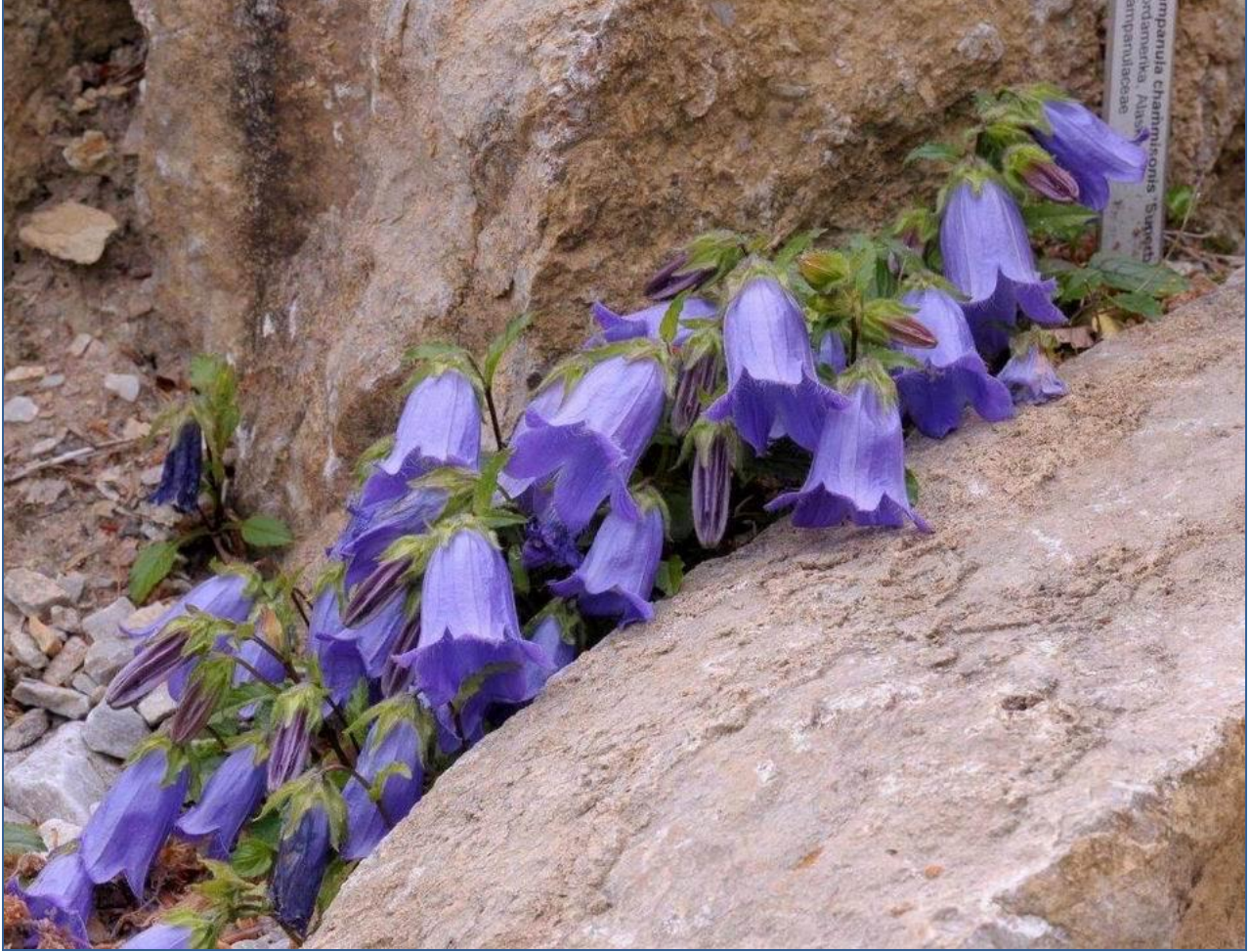
Campanula chamissonis 'Superba'

which was known as C. pilosa 'Superba' in the golden times of great plantsman Jack Drake. It differs from the typical Japanese species with much longer flower trumpets, but its natural taste for wet soil is the same.