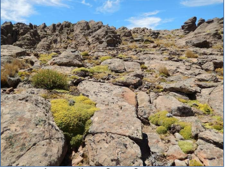
Laretia acaulis on Cerro Corona

After returning to Bariloche we drove north to Neuquen and Volcán Copahue: this area is well known by flower enthusiasts and features a smoking volcano, Araucaria forest and interesting alpines.