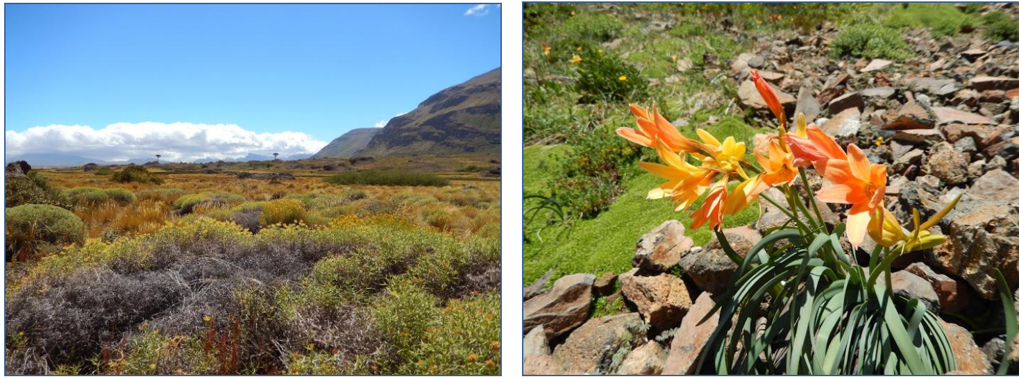
Steppe and Rhodophiala araucana near Volcán Copahue

After returning to Bariloche we drove north to Neuquen and Volcán Copahue: this area is well known by flower enthusiasts and features a smoking volcano, Araucaria forest and interesting alpines.