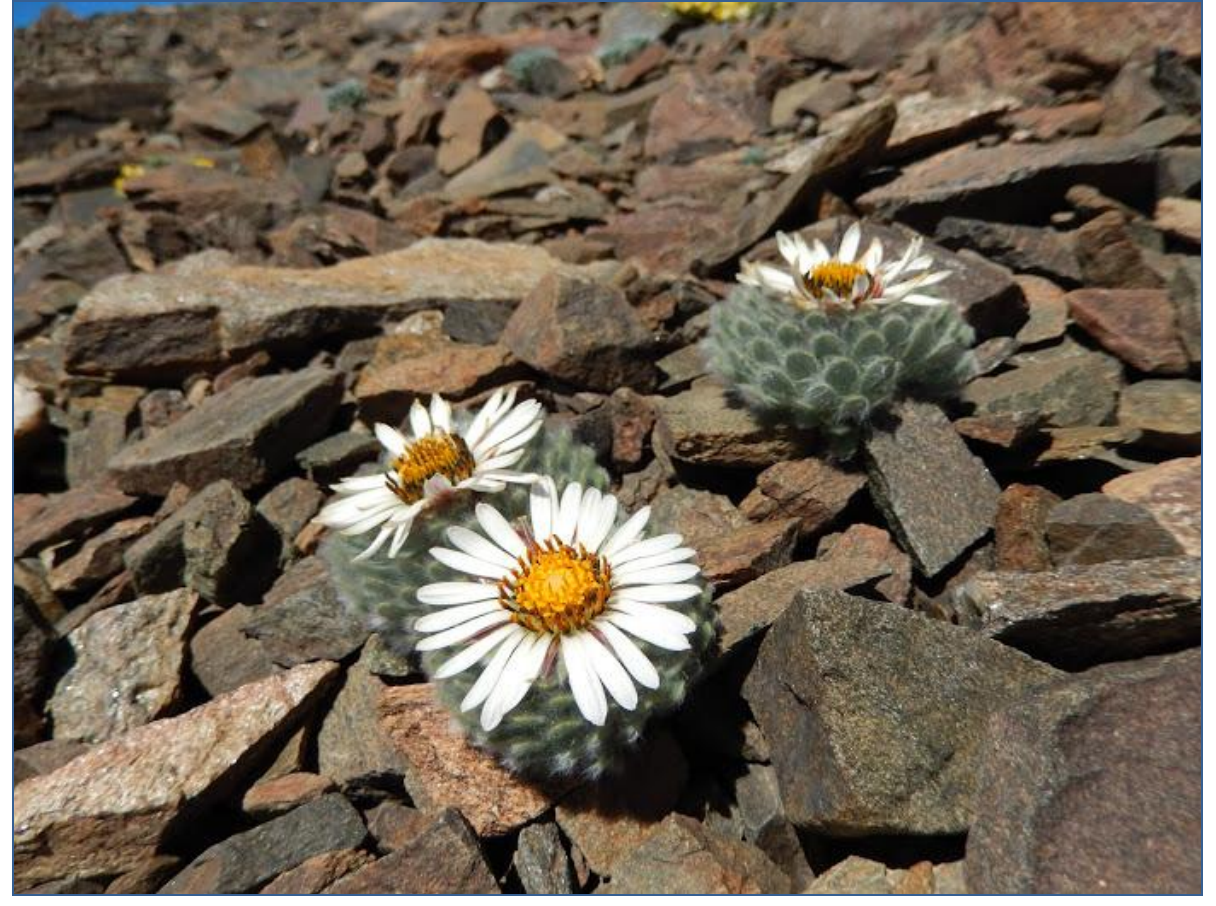
Above: The white form of Chaetanthera villosa is found here. Below: Nassauvia lagascae var. lanata is also a specialty here on Cerro Chauluallco.