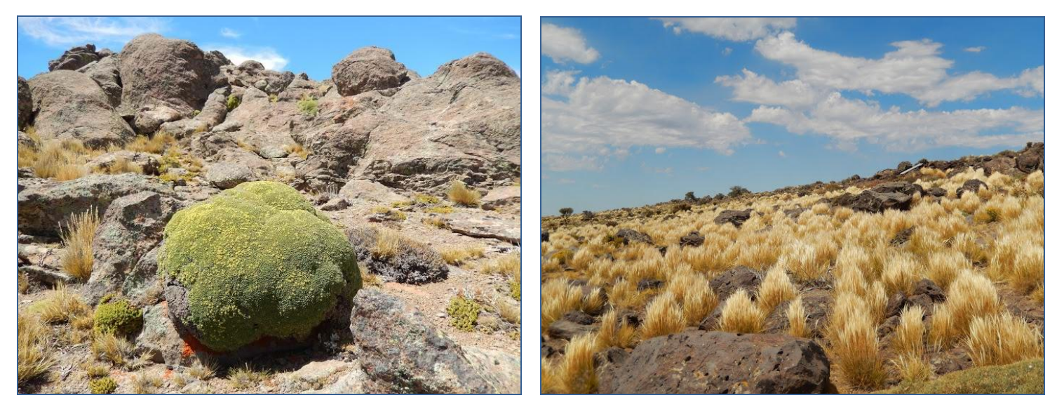
Azorella aff. madreporica and Stipa humilus on Cerro Somuncurá

We climbed Cerro Corona the highest mountain on the Plateau and encountered an alpine-like flora found in the Andes almost 500km to the west.