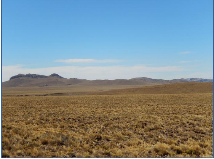
Cerro Corona on Meseta de Somuncurá