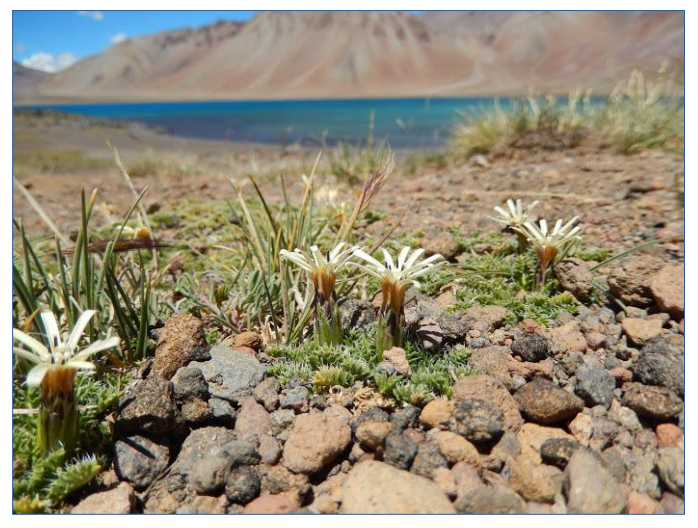
Perezia pilifera (above) and Tarasa humilis (below left) near Volcán Maipú and Laguna del Diamante Below, right: Tropaeolum polyphyllum at Passo Cristo Redentor

Continuing north we took a break from driving our own vehicle and joined a tour to Volcán Maipú, an amazing place with a 5000m+ volcano sitting in a megacaldera of an extinct super-volcano. We saw many high alpines here.