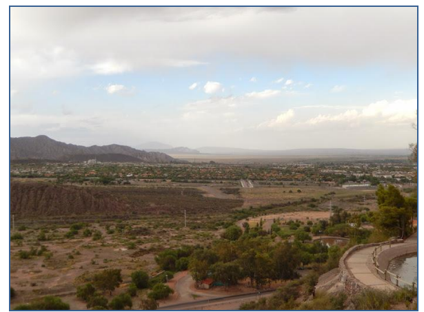
Looking north from Cerro Gloria west of Mendoza city