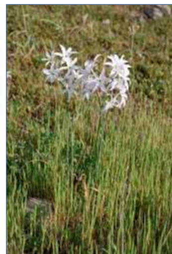
Right: fig.8 Leucocoryne ixioides , the first species we see in flower on the pass, and the nearest to us. 1 October 2015. (JMW)