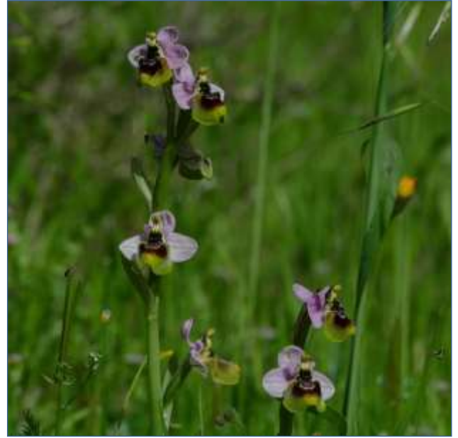
Ophrys neglecta : (means forgotten, neglected, easy to overlook) was a

subspecies of Ophrys tenthredinifera years ago, but now it is a taxon on its own. The most important characteristic to keep in mind, is its size. Very small and thickset, many flowers together at the top of the plant. Another feature: the shoulders are raised. The third distinguishing mark: there is a very prominent tuft of reddish hairs above the appendage.