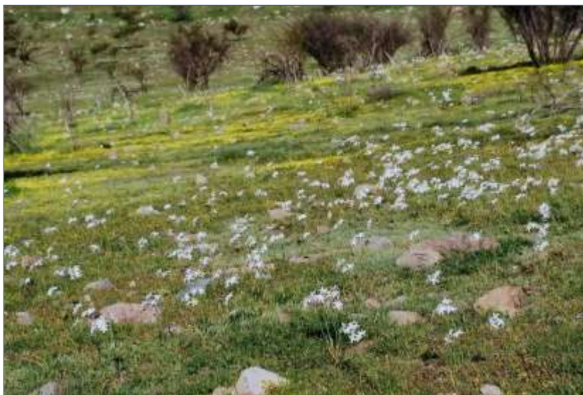
Left: fig.6 T'is a pity the showy Oxalis laxa is an annual. Even so, it might have a place in cultivation. If so, well worth a try from seed. 20 Sept 2014.