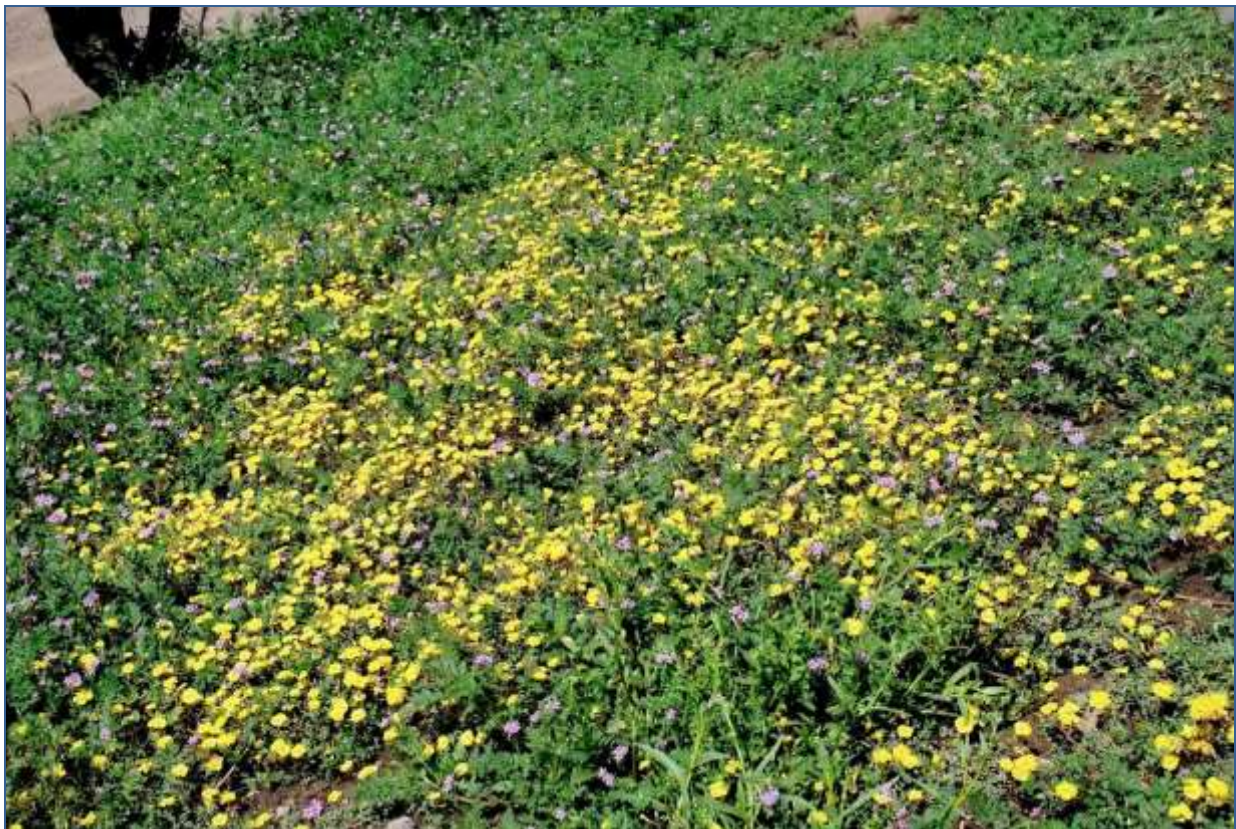
fig.36 A fine, healthy colony of an attractive oxalis , apparently not intimidated by an invasion of Erodium cicutarium . 24 Oct 2015. (JMW)

accounts. The first is the twinned pair of pointed peaks perched to the west on top of the northern high ridge of the Cordón de Chacabuco [fig. 39]. The other is the nature of the terrain [figs. 39, 40] where the long-lost species rediscovered by Carlos, Viola chamaedrys , grows [figs. 40, 41].