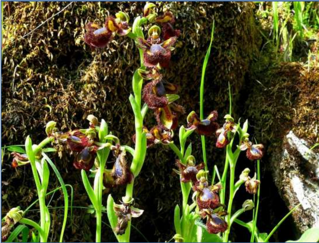
Ophrys speculum also occurs on Sardinia.