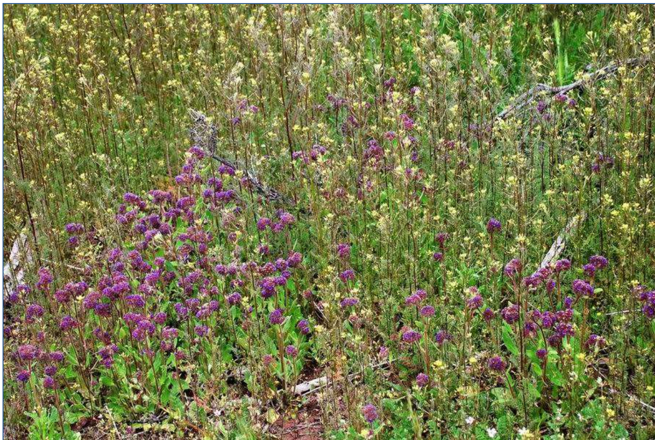
fig.44 Vigorous colonies of Phacelia brachyantha and Descurainia erodiifolia appeared in part of a lower patch during a favourable rainy season. 27 Oct 2015.

packed stand of Phacelia brachyantha and Descurainia erodiifolia in our photo [fig. 44]. There are two main patch centres, one lower down by the Onel farmsteads, which is the first we encountered - where Carlos found the violas, and another group higher up to the north.