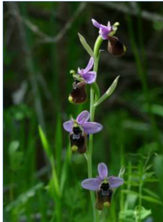
These four images: Ophrys normanii