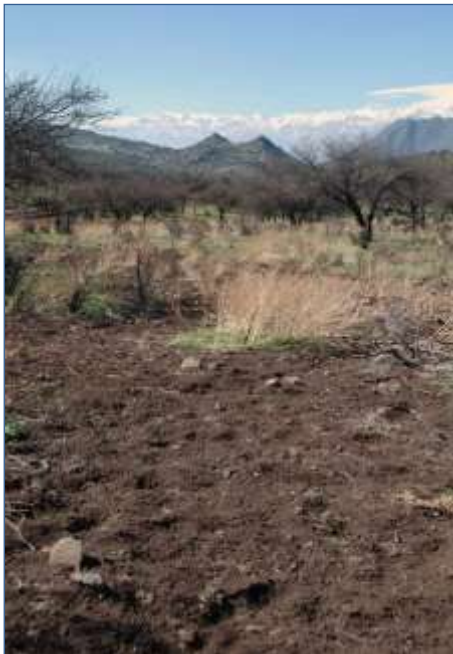
Below: fig.39 Viola chamaedrys site with its rather suggestive and distinctive landmark, a pair of tors, silhouetted against the distant Andes. 26 Aug 2013. (JMW)