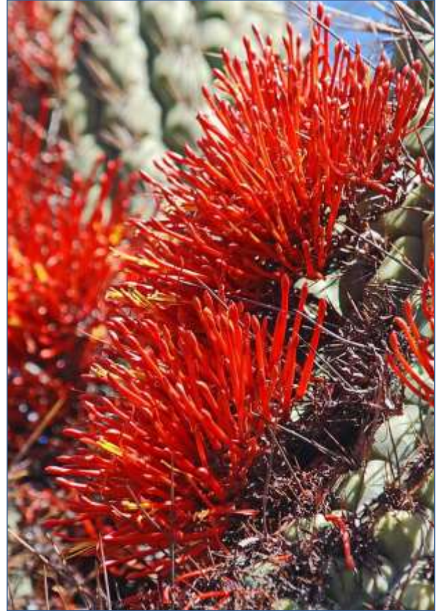
Left and above: fig.71 The uninformed think these are cactus flowers. In fact Tristerix aphyllus parasitises Echinopsis chiloensis . [El Guayacán, Valparaiso Region.] 18 Feb 2011. (JMW)