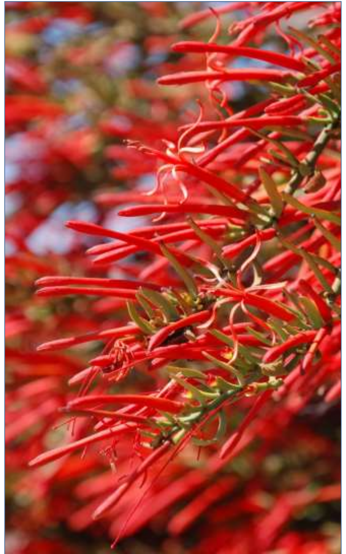
Above: fig.77 Scarlet mistletoe flowering is timed to refuel firecrown hummingbirds on their seasonal migration flight to overwinter on the Pacific coast. 24 May 2012. (JMW)