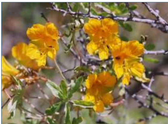
fig.54 A pollinator's eye view of Tropaeolum looseri flowers. 17 October 2015. (JMW)