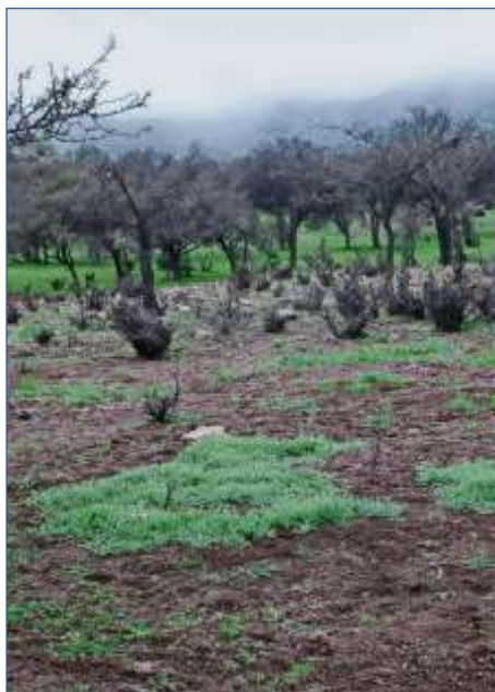
fig.42 Our first view of remarkable, extensive carpets of primary sterile foliage of our new Alstroemeria piperata on barish patches. 1 Oct 2015. (JMW)

Both the viola genus and fritillary butterfly lineages began and evolved here, towards the tip of what is now South America. An interesting mutual arrangement developed between the two early on in their histories. Violas produce nectar which attracts the adult insect, here in the form of Yramea cytheris , to pollinate it [fig. 41], but the caterpillars of the butterfly now feed discriminately on viola foliage and nothing else. Thus both benefit from the symbiosis, which has spread across the world as the viola line dispersed, diversified, and spread up and across the Northern Hemisphere. However, due to the asynchronous timing of viola anthesis and butterfly emergence there, pollination became impossible and the relationship became completely one-sided!