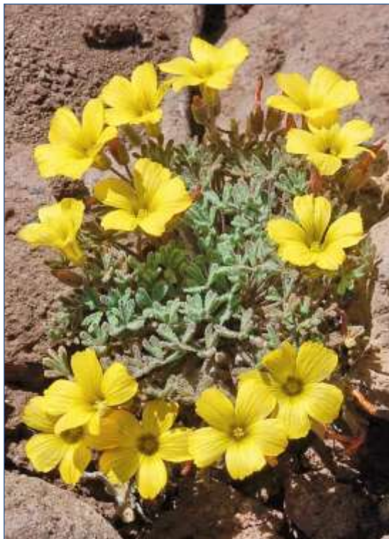
fig.45 The undescribed Oxalis ranchillos of the lower patch systems, one of three or four new species there. 20 Dec 2015. (JMW)

Although the higher area contains a greater floral diversity, of the three or four previously undescribed species we have identified at these patches, all but one are found nowhere but on the lower set we first explored. Prime amongst them after the dwarf yellow alstroemeria is the very neat, large-flowered little annual oxalis we recorded early on, further back down the road [fig. 36]. Unbeknown to us then, when we later came upon the second population at Los Ranchillos, our investigations showed it to be new to science, and accordingly we have given it the intended epithet of Oxalis ranchillos [figs. 36, 45, 46]. A striking wasp-mimic, the fly Mitrodetus dentitarsus [fig. 47], found it as attractive as we did, but for its nectar rather than any aesthetic appeal. This same insect was observed in considerable quantities at the upper patch site visiting Alstroemeria piperata .