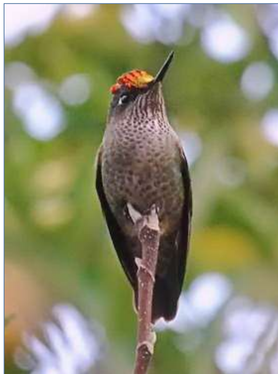
Right: fig.76 'See my splendid crest.' A green-backed firecrown, Sephanoides sephaniodes, one of many overwintering at our home, poses for his portrait. 24 May 2012.

Returning enthusiastically to those end-of-summer, February and March flowering mistletoes, we come to one of the more conventional species which attaches itself to trees. Ligularia cuneifolia [figs. 75, 78] looks like nothing more than small glowing fires on its host and is widespread over the entire Chacabuco area, since its main 'victim' is the dominant savannah acacia, Vachellia caven [e.g. figs. 38, 39, 42, 75]. Another interesting mutual symbiotic relationship is involved here. Other than the infrequent giant hummingbird, Patagona gigas , with its drabber coloration and slower wingbeats, we have the common little green-backed firecrown, Sephanoides sephaniodes here in central Chile [figs. 76, 77]. With its constant need for energy-providing nectar fuel, this frenetically active aerobat follows the seasonal native flowering from the coast in winter to the Andes in winter, and back. Unless it finds suckers like us along the way, willing to provide it with sugar water all winter long, that is! All 'conventional' flowering has finished by the time it no longer finds flowers in the mountain to provide it with nectar. But for the benefit of both, the mistletoe has evolved a classical scarlet, hummingbird-adapted flower , tubular and full of sweetness [fig. 78], which flowers just when needed by the birds, and sustains them during their migration to the milder and still flowery Pacific coast.