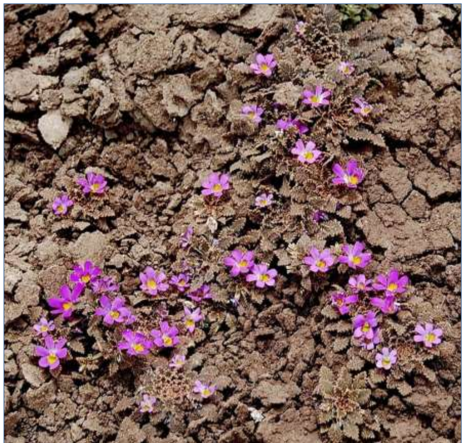
Right: fig.40 Viola chamaedrys in characteristic bare patch terrain showing a typically fractured dry surface layer. Lower station. 27 Oct 2015. (JMW)