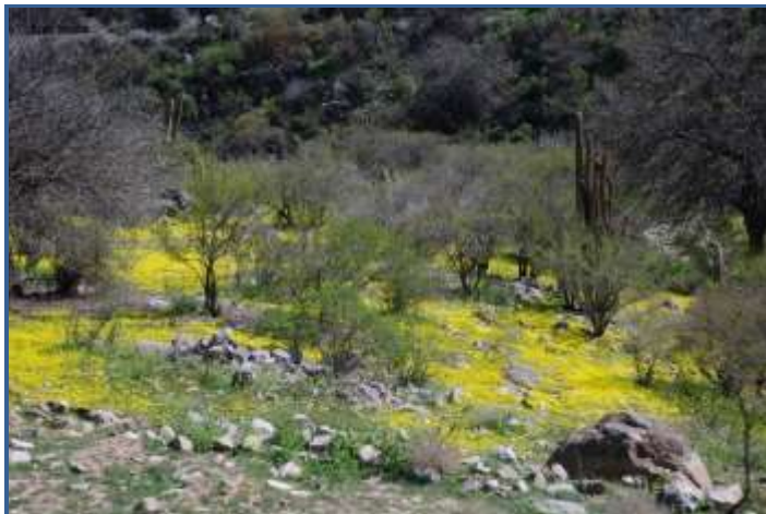
Left above: fig.4 In good years early spring awakens for us with swathes of Leucocoryne odorata and Oxalis laxa seen from the road as we drive up the pass. 1 Oct 2015.