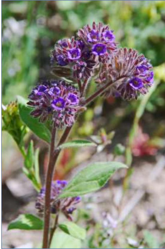
fig.35 Phacelia brachyantha , scattered overall at the pass, shows clearly why it was transferred to Boraginaceae from Hydrophyllaceae. 21 Oct 2015. (JMW)

The purple cymes of Phacelia brachyantha [fig.35] decorate the landscape here and there throughout the pass area, either individually, or as large colonies, when suitably impressive. A large patch of showy, dwarf yellow oxalis caught our eye during early visits [fig. 36]. It seems to be competing on level terms so far with an invading horde of catastrophically introduced Erodium cicutarium . Just as Tropaeolum azureum had been the plant to attract our common southern painted lady [fig. 16], so one of the flower-packed stands of the almost white composite Moscharia pinnatifida drew the much rarer Vanessa terpsichore , known as Philippi's painted lady, for us [fig. 37].