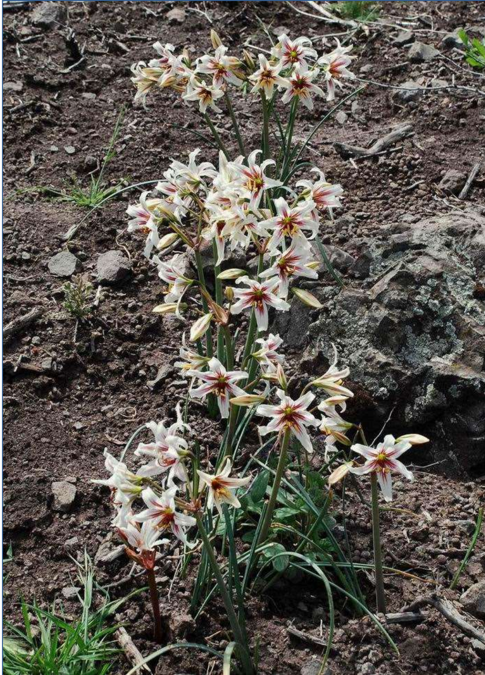
fig.18 What bulb-growing enthusiast wouldn't want to lay their hands on spectacular Placea arzae ! 22 Oct 2015. (JMW)

in flower at the very time the religious pilgrimage passes through, and to grow where many participants camp or stop to take a bite to eat. No need to comment further except to say the only possibility to get a photo of it there is before that event! We've tried on a couple of occasions to establish it in our nearby garden, providing apparently similar soil conditions, lighting and watering: but it has proved a temperamental blighter, which flowered for us grudgingly and then gradually petered out. Perhaps the finest growers in our plant societies might have better luck.