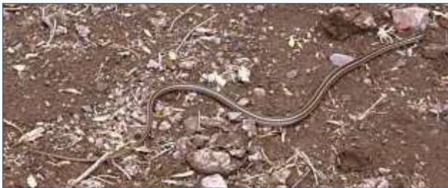
Left: fig.32 Exit stage right Philodryas (syn. Dromicus ) chamissonis , liberated at Chacabuco after entering our house and scaring the wits out of Anita. 20 Jun 2002.

A bridge over a dry wash at the low point near where the road begins, which is actually paved for a very short distance, holds another ineradicable memory for us. Anita suffers from ophiophobia, an irrational fear of snakes. Of course, such phobias almost invariably lead to encounters with the object of dread! In mid-June 2002, the height of what passes for winter here; we were indoors in the warm, when Anita let out a strangled scream. "There's a snake in the house! It came out of the kitchen and slid along the hall behind the woodstove." Of course, I supposed the poor dear was suffering from some kind of hallucination. A snake? We'd never seen one in central Chile, let alone in the garden. To humour her I made a show of examining the small gap behind the stove, and the metal plate that it is mounted on, which is just proud of the floor. And yes, I saw the tip of a snake's tail, no less! Well it took us all hell to winkle it out unharmed. I grabbed it by the tail (Chilean snakes can't bite humans anyway), eased it gently out from under the plate, and popped it into an empty plastic dustbin. Cutting a long story short, we decided to release our Philodryas (syn. Dromicus ) chamissonis [fig. 32] at the pass, where it would find plenty of large insects, spiders, small lizards and birds' eggs to eat. We chose a spot beside the bridge, so it could take cover and not itself become prey for a hungry short-tailed eagle hawk [fig. 33].