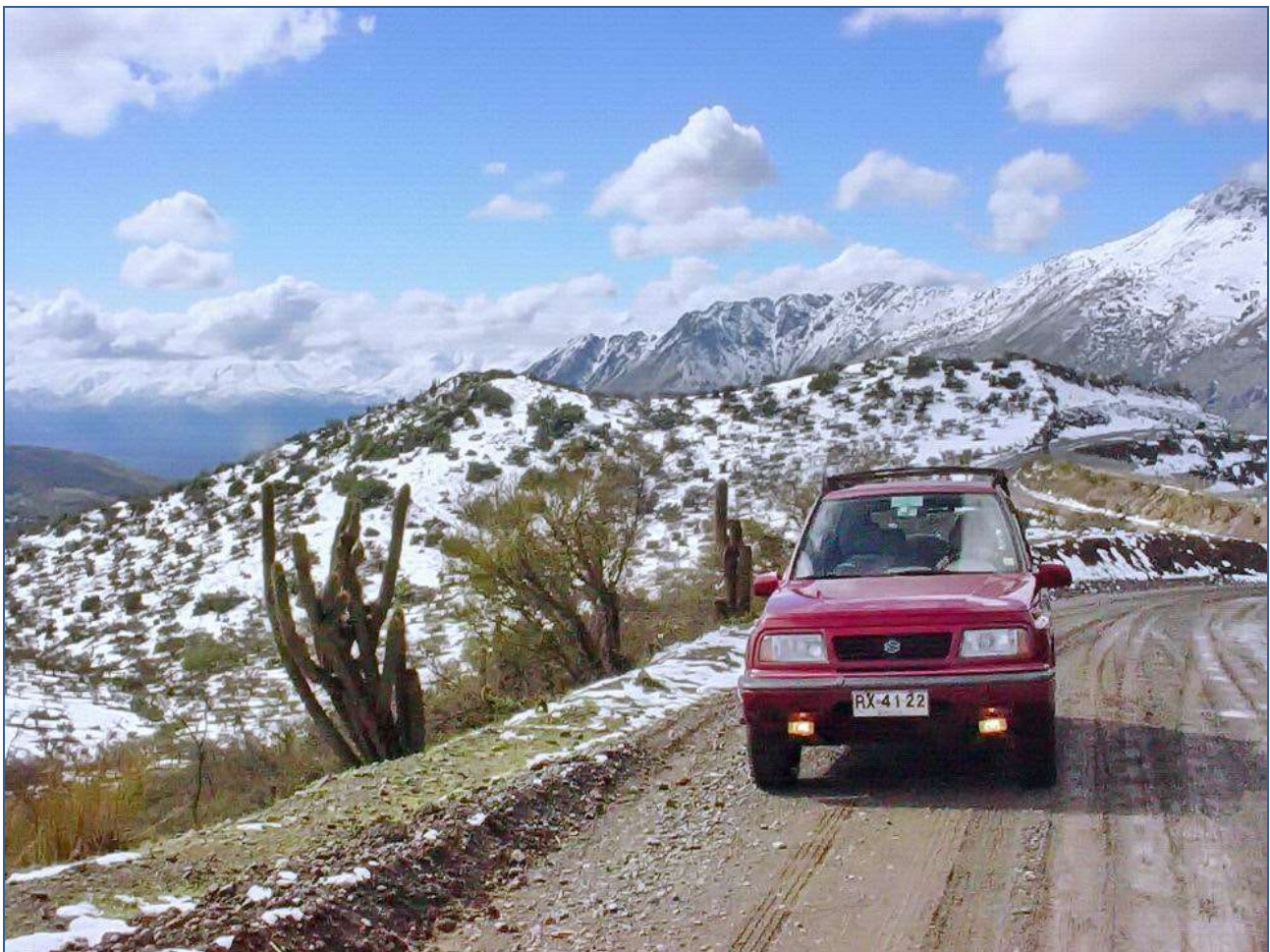
fig.9 The crown of the Chacabuco Pass after a snowy night during the equivalent month to Feb in the Northern Hemisphere. 15 Aug 2009. (ARF)

The panorama is dominated from early September to the beginning of October by the prolific yellow of Oxalis laxa [figs. 5, 6], and the scented white stars produced in clustered umbels by Leucocoryne ixioides [figs. 7, 8]. These reach their zenith beside the present main road just before the main floral show begins on the old route after the turn-off to the right by the casino, a square, glass high-rise which looks as though it's been plonked there from the centre of some city! In fact the upper pass is occasionally even covered then by short-lived snows [fig. 9].