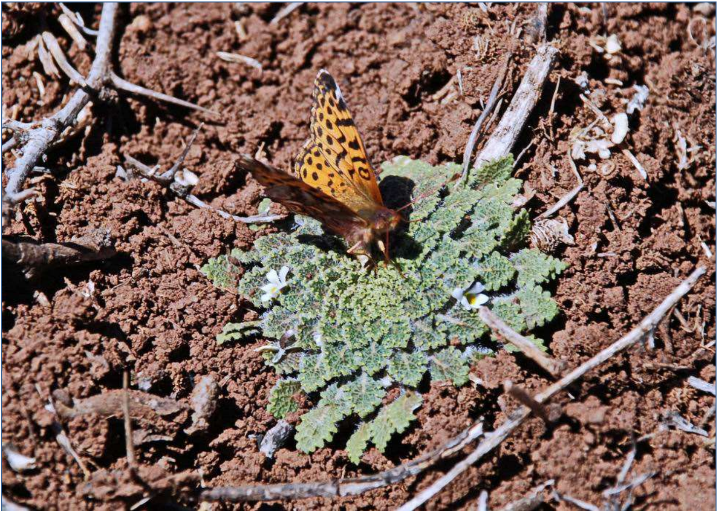
fig.41 A quite rare white Viola chamaedrys and mutualist fritillary, Yramea cytheris , exclusive to viola, which it pollinates and its larvae eat. 23 Sep 2013. (JMW)