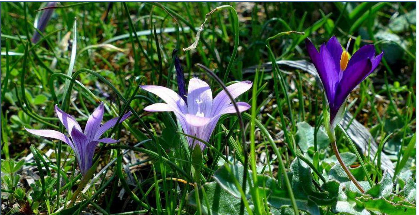
Left to right – Romulea ligustica , R. x limbarae and R. requienii