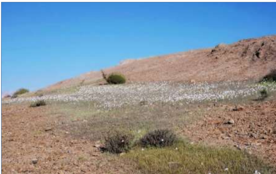
Left: fig.73 The adaptable Leucocoryne odorata seen on a high, stony barren here, flourishing en masse just as it does in grassy springtime meadows. 6 Oct 2014. (JMW)