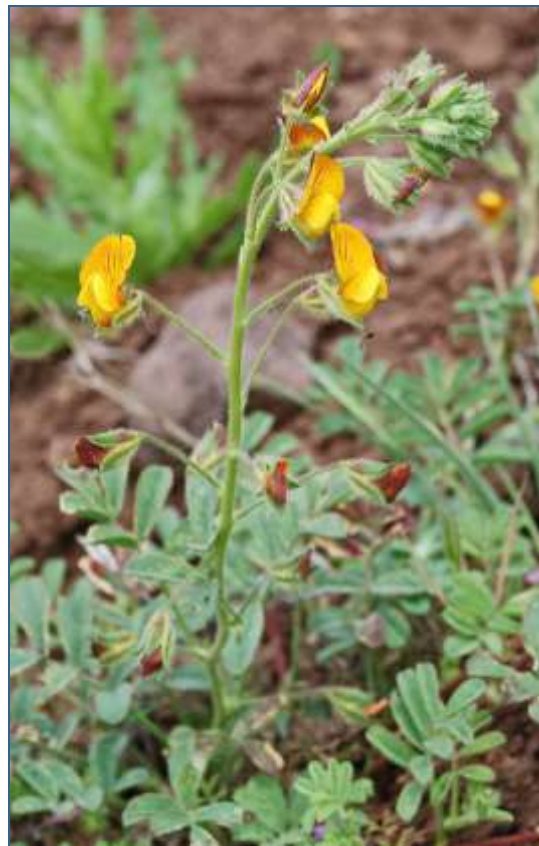
Above left: fig.48 Another of our Los Ranchillos novelties from the lower patches, the extremely rare annual Hypochoeris terra-mortuis (description in preparation). 24 Oct 2015. (JMW)