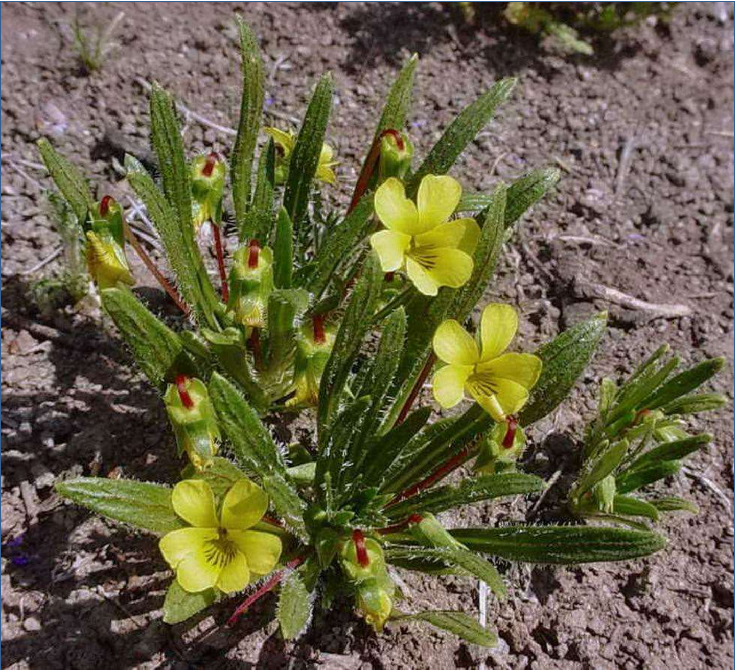
fig.10 When any snow and other serious winter weather is past, the little annual rosulate Viola pusilla is the first to brighten the pass-top.16 Sep 2004. (ARF)