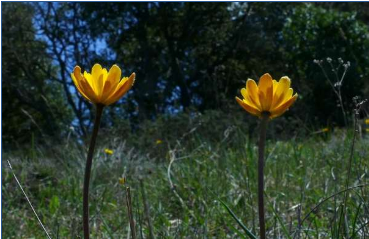
Anemone palmata on Sardinia

Cover photo: Tristerix aphyllus, one of the scarlet mistletoes in Chile