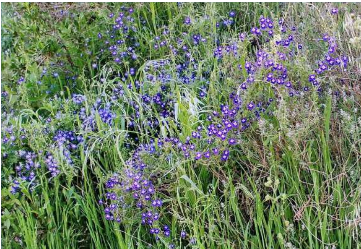
fig.14 Tropaeolum azureum (F&W 11700) is seen on hills and in the hedgerows all around us, to our unbounded delight. 15 Oct 2008. (JMW)

Above right: fig.13 Tropaeolum tricolor , another hummingbird pollinated species, and the most successful of its section, ranges from Antofagasta to Los Lagos - 2000+ km! 23 Oct 2010. (JMW)