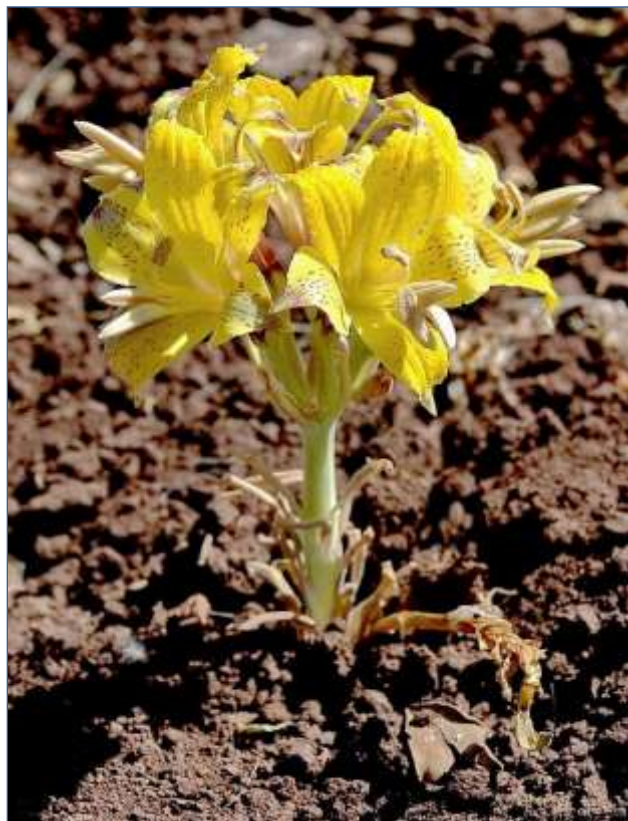
fig.43 The pride and joy for us of the Los Ranchillos patch locations, our new Alstroemeria piperata . 19 Nov 2014. (JMW) Full details are published in June's IRG .

In that paper we also described and explained the unique and highly localised exclusive habitat of the viola , the alstroemeria and a few others [figs. 39, 42]. Suffice it to repeat in outline here that it consists of several clusters of almost impenetrable red or dark-coloured iron clay, which resists permanent establishment of all vegetation except the very few species which have specifically adapted to it, and which grow nowhere else. There is no record of these land islands, or patches as they are known scientifically, anywhere other than within the radius of a very few kilometres at Los Ranchillos. The local pastoralists call them tierra muerta (dead land) due to their generally bare and apparently unproductive aspect. However, during seasons of exceptional rainfall and occasional snows, the clay may become sufficiently malleable and moist to allow temporary 'explosions' of vigorous annuals, such as the tightly