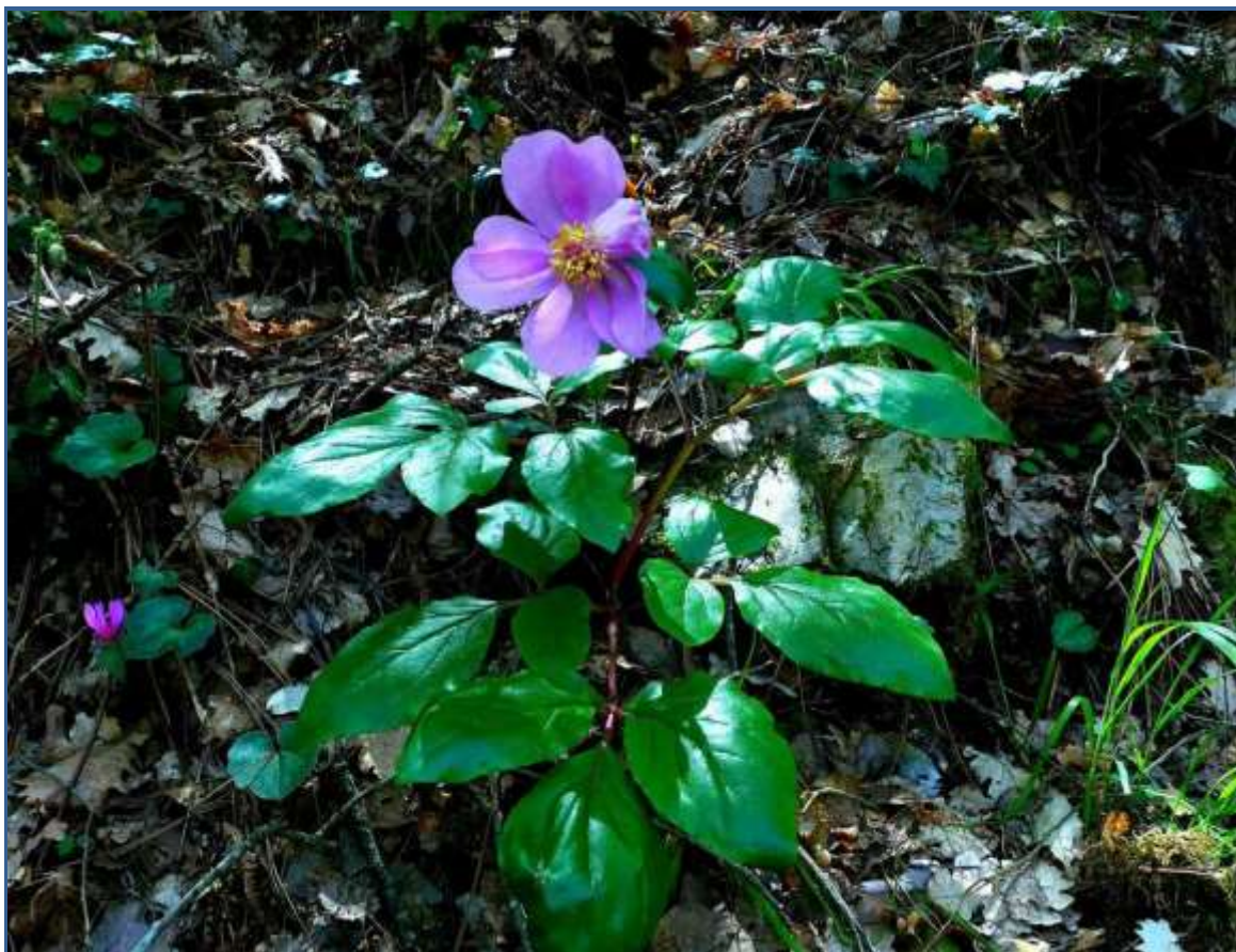
In the same habitat, in the mountains of the Gennargentu, we perceived between the trees a glittering of pink, It seemed to be a paeony. Just one individual, hit by the sun: Paeonia mascula .