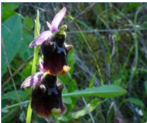
All on this page: Ophrys chestermanii