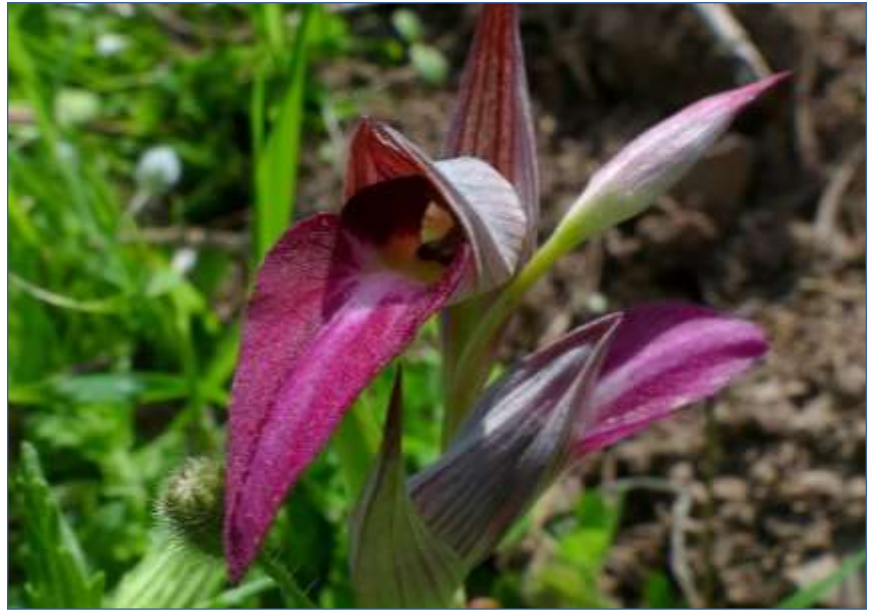
Right: Serapias lingua

Serapias parviflora The lip is small and is turned back to the stem.