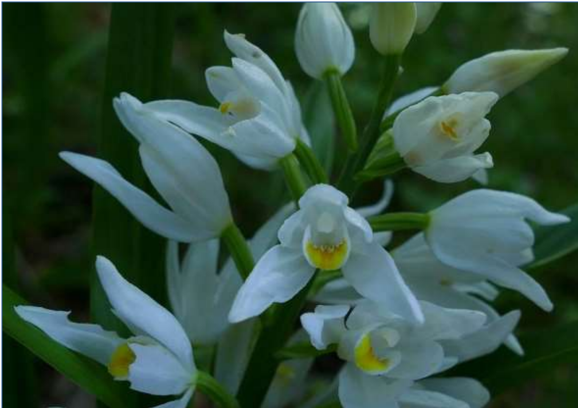
Cephalanthera longifolia , a pure white species, grows in many parts of Europe. The white lip is yellow at the end. This orchid is an elegant one and its appearance is impressive.