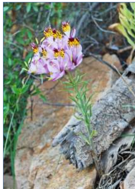
Above left: fig.21 A well-filled individual inflorescence of Olsynium scirpoideum photographed nearby at another time and place. 28 Sep 2014.