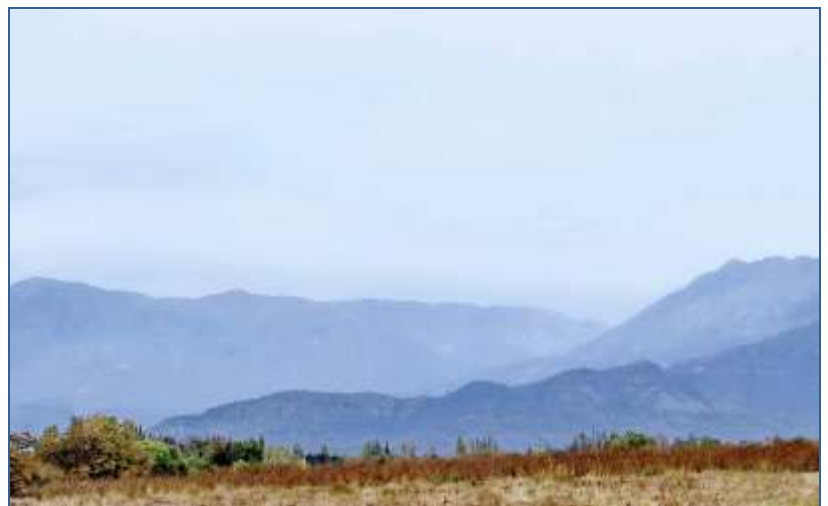
fig.3 The Chacabuco Pass as seen from our garden. It lies to the south and we have to cross it on our way to and from 'The Big Smoke', Santiago. 12 May 2013. (JMW)

God, briefly and Mammon permanently, make their presence felt where the flowers grow. Without doubt the elimination of the vast majority of road traffic greatly benefits the flora and fauna of the original and only former pass and its surrounds. Even so, once a year a religious pilgrimage on foot takes place from Santiago to the sanctuary of a local saint at the northern base of the pass. It crosses over via the old historic Chacabuco thoroughfare. Thousands of young people participate in the trek, which takes place in October, at the height of the flowering season. Although the organizers have recently - and at last - taken responsibility for clearing up the eyesore of discarded 'holy' rubbish, it isn't difficult to imagine the temporary damage of trampling and picking involved. Also on our side of the pass is a recently constructed high-rise casino. However, apart from being a bit of a blot on the otherwise scenic landscape, it and its addicts keep themselves very much to themselves.