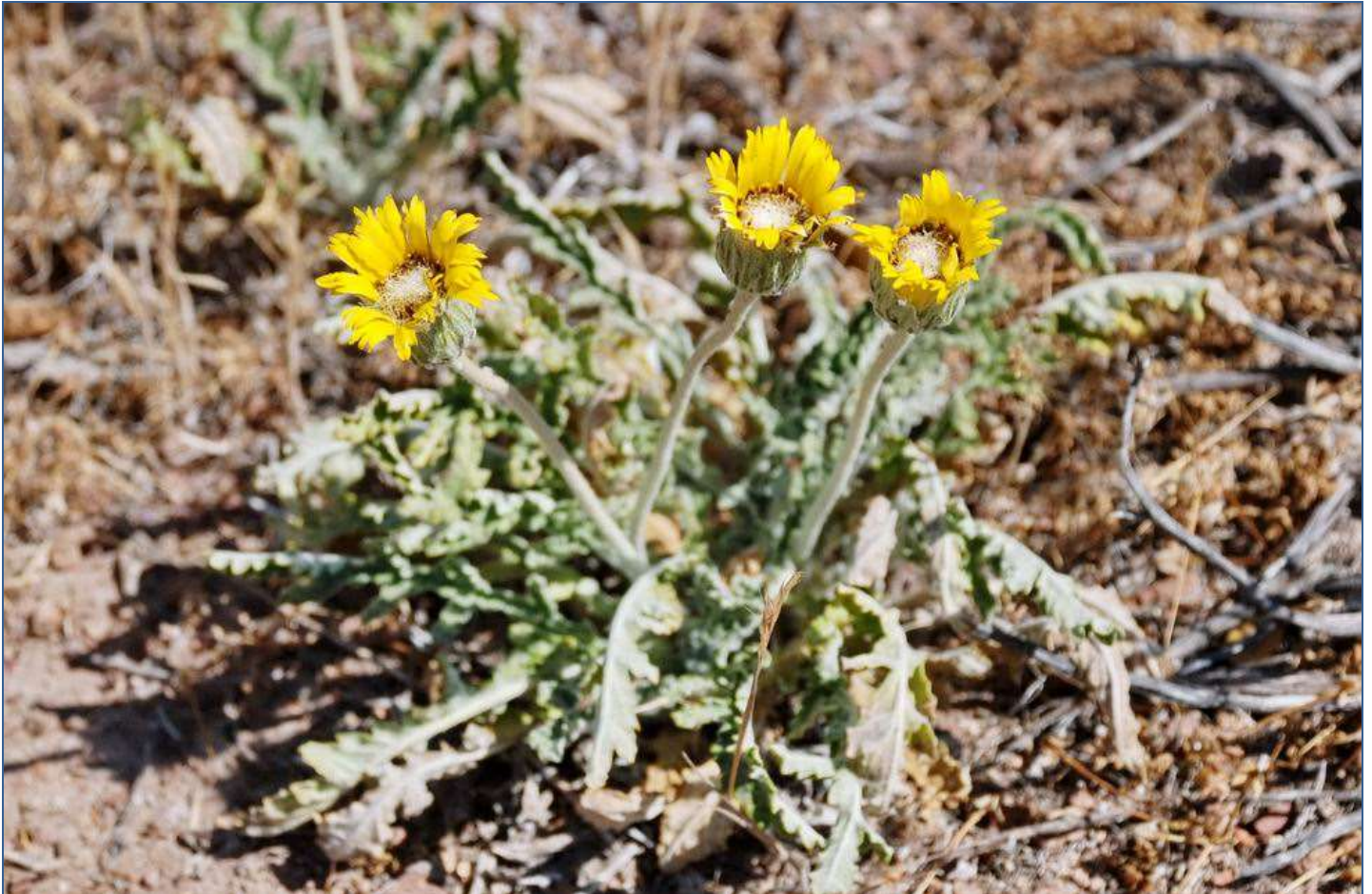
fig.59 Trichocline aurea , seen just once in the upper patch area, comes close to giving Gazania a run for its money. 19 Nov 2014. (JMW)

Thanks to friend ' Cotello ', who is one of the two related Los Ranchillos herdsmen, and head of the Astargo family [fig. 55], we were allowed to drive on an aerial maintenance track via its usually padlocked entrance on his land, which led up to the higher patch systems. We stop for a chat at their house and farmyard whenever we visit or pass, and it was thanks to this we spotted the common Chilean stick insect, Bacunculus phyllopus [fig. 56], moving stealthily through the roadside dry grass on its six stilts.