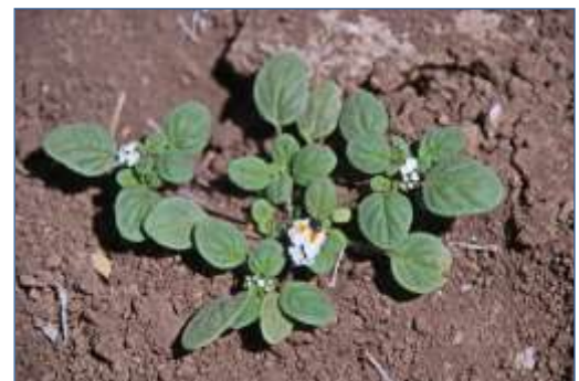
From left above: figs 60 -11 Dec 2015; 61 -19 Nov 2014; 62 -11 Dec 2015; 63 -17 Oct 2014. (JMW)