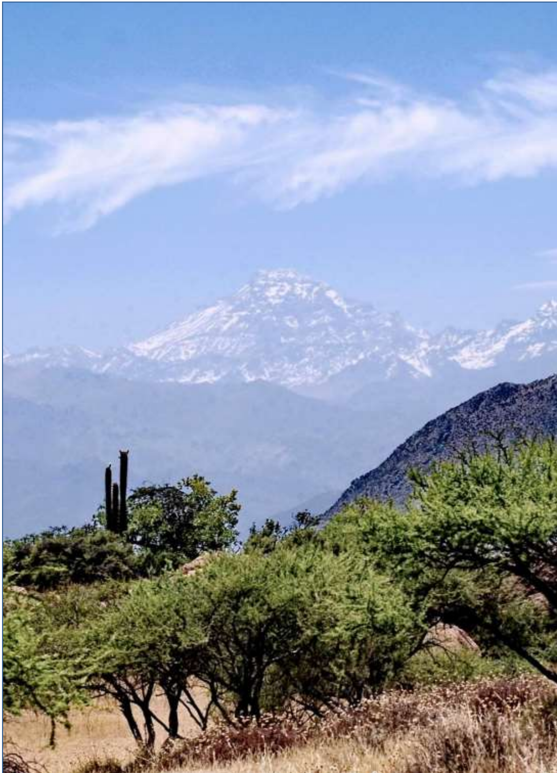
fig.81 Seen from Los Ranchillos - Mount Aconcagua , loftiest Southern Hemisphere peak and focal point from high, clear ground where we live. 29 Dec 2015. (JMW)

It is not hard, therefore, to imagine the traumatic impact when we received out of the blue an e-mail informing of his sudden and unexpected death while we were over in England staying at Hastings with our daughters during September 2015. There had seemed such an exciting and productive future ahead working with him too. After we returned to Chile, an informal open-air remembrance meeting was arranged in November by his family, together with his many friends and admirers, especially fellow lovers of natural history. He was a fine photographer, who frequently posted interesting shots on the Internet. Appropriately, the event was held at Los Ranchillos, the focal point of his achievements, and a small pyramidal cairn of rocks was erected there as a perpetual reminder.