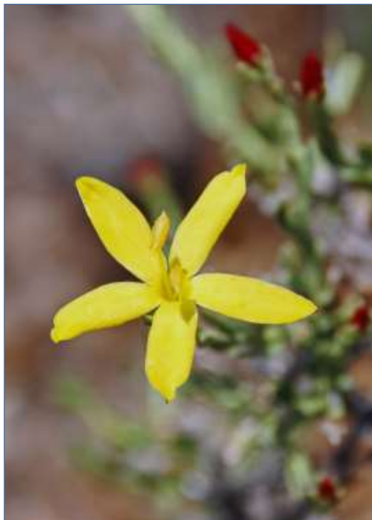
Left: fig.74 Menodora linoides. Well worthy of the apt pun its genus name suggests - 'Men adore her' 30 November 2014.