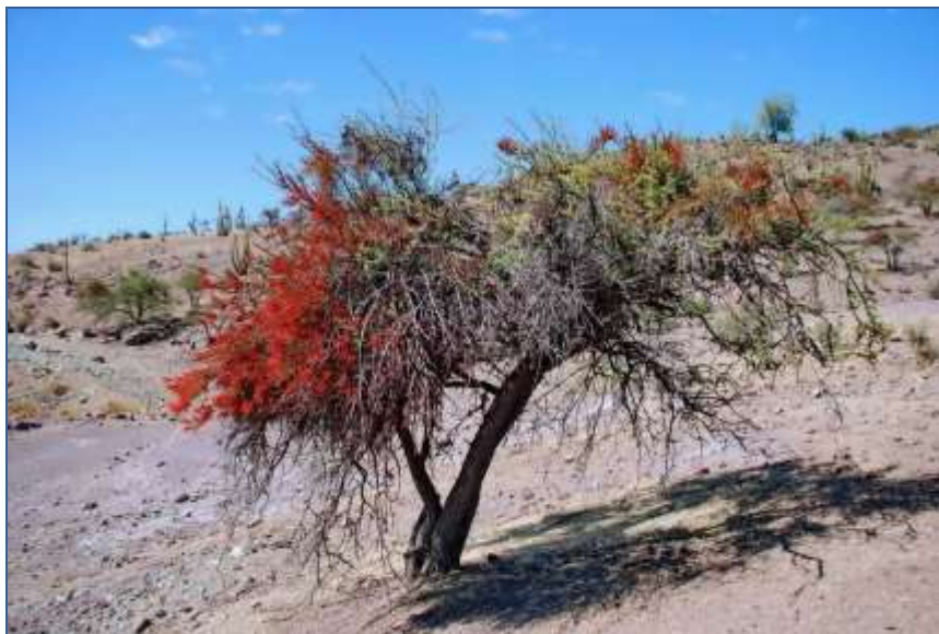
Above right: fig.75 Ligaria cuneifolia, another spectacular scarlet southern mistletoe genus, on a moribund Vachellia caven. [Near Rungue, Valparaiso Region.] 18 Feb 2011.

Returning enthusiastically to those end-of-summer, February and March flowering mistletoes, we come to one of the more conventional species which attaches itself to trees. Ligularia cuneifolia [figs. 75, 78] looks like nothing more than small glowing fires on its host and is widespread over the entire Chacabuco area, since its main 'victim' is the dominant savannah acacia, Vachellia caven [e.g. figs. 38, 39, 42, 75]. Another interesting mutual symbiotic relationship is involved here. Other than the infrequent giant hummingbird, Patagona gigas , with its drabber coloration and slower wingbeats, we have the common little green-backed firecrown, Sephanoides sephaniodes here in central Chile [figs. 76, 77]. With its constant need for energy-providing nectar fuel, this frenetically active aerobat follows the seasonal native flowering from the coast in winter to the Andes in winter, and back. Unless it finds suckers like us along the way, willing to provide it with sugar water all winter long, that is! All 'conventional' flowering has finished by the time it no longer finds flowers in the mountain to provide it with nectar. But for the benefit of both, the mistletoe has evolved a classical scarlet, hummingbird-adapted flower , tubular and full of sweetness [fig. 78], which flowers just when needed by the birds, and sustains them during their migration to the milder and still flowery Pacific coast.