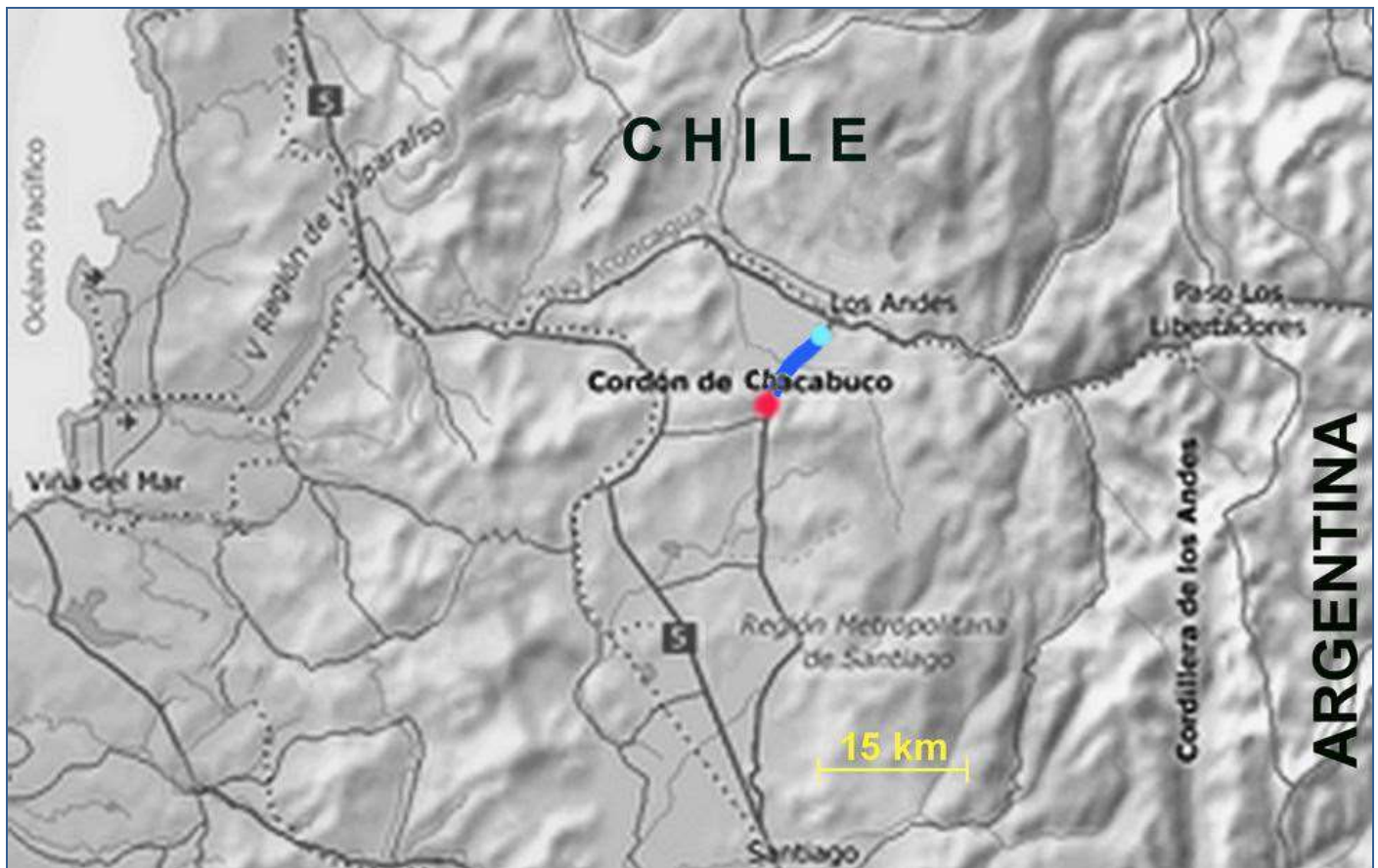
fig.1 The geographical setting in central Chile. Pale blue circle our home. Red circle, the Chacabuco Pass.

But for the convenient road tunnel cut under the former Cuesta Chacabuco pass we should be soaking up much more of the flora described here each time we drive to Santiago and back from our Chilean home. As it is, nowadays the old winding, scenic higher route is only used by a small trickle of vehicles on business whose drivers want to avoid the main highway toll, as well as high-day and holiday folks wayside picnicking. Those such as us with an interest in the natural history up there make planned visits for that purpose.