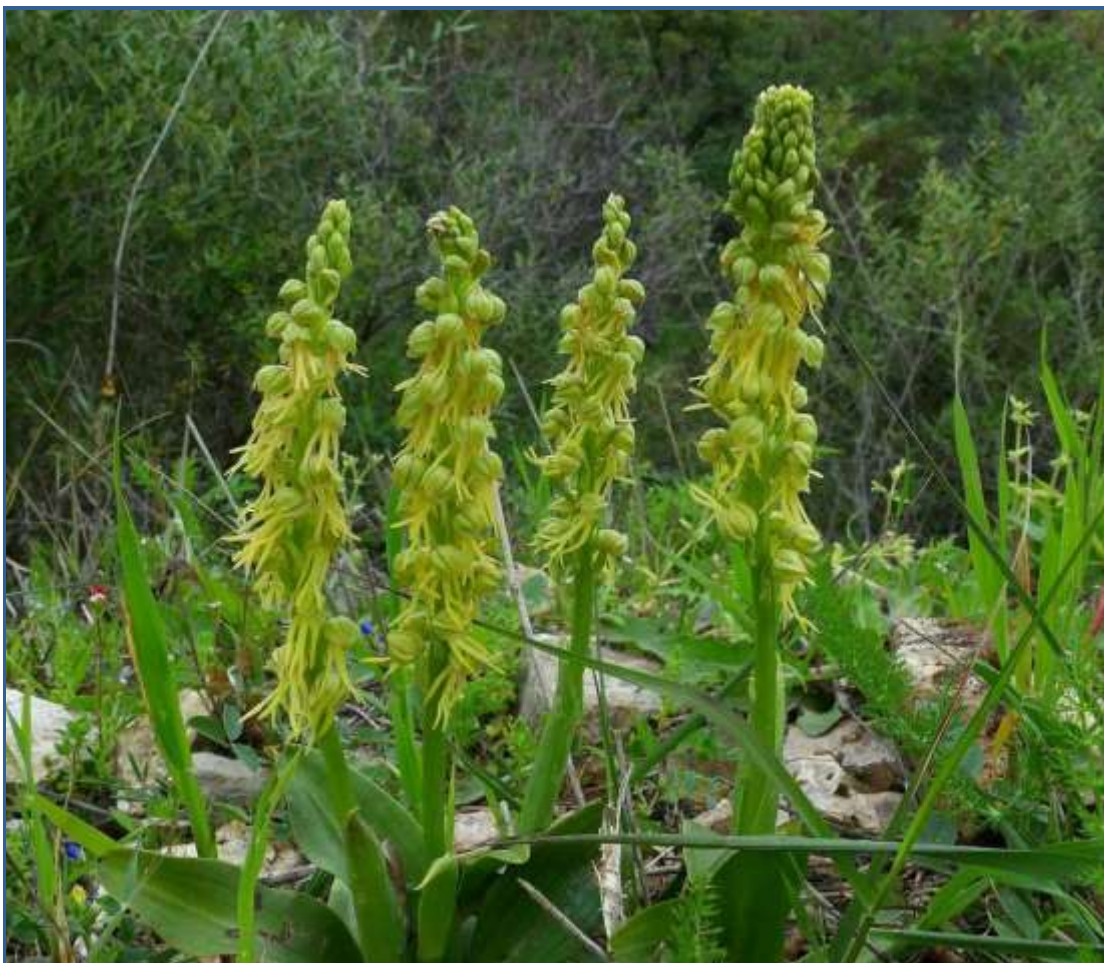
Orchis anthropophora is not easily confused with other species.