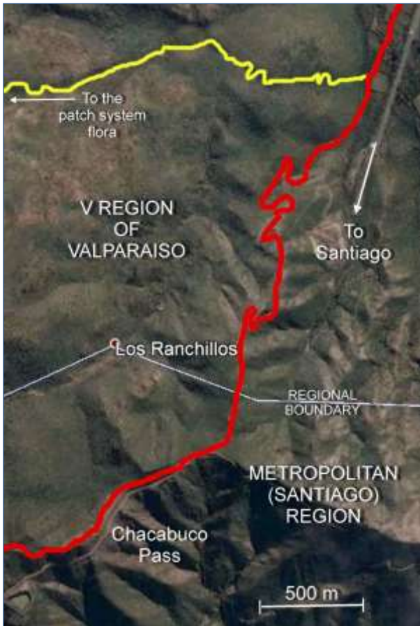
fig.2 A map of the pass sector. Its high-point lies ca. 1.75 km to the SW of the regional border, just within the Santiago zone and slightly beyond lower LH corner.

The crown of the pass (1300 m) is 530 m above us and a mere 13 km (eight miles) further to the SSW as the condor flies (sorry - no crows in Chile!) [figs. 2, 3] In fact the earliest springtime floral interest actually begins much nearer to us, at around half that distance, where the steady drive up the pass begins [figs. 4-8].