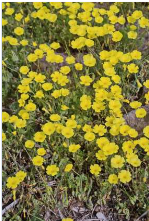
Right above: fig.5 A dense carpet of Oxalis laxa following a rainy (El Niño) winter. 7 September 2014. (JMW)