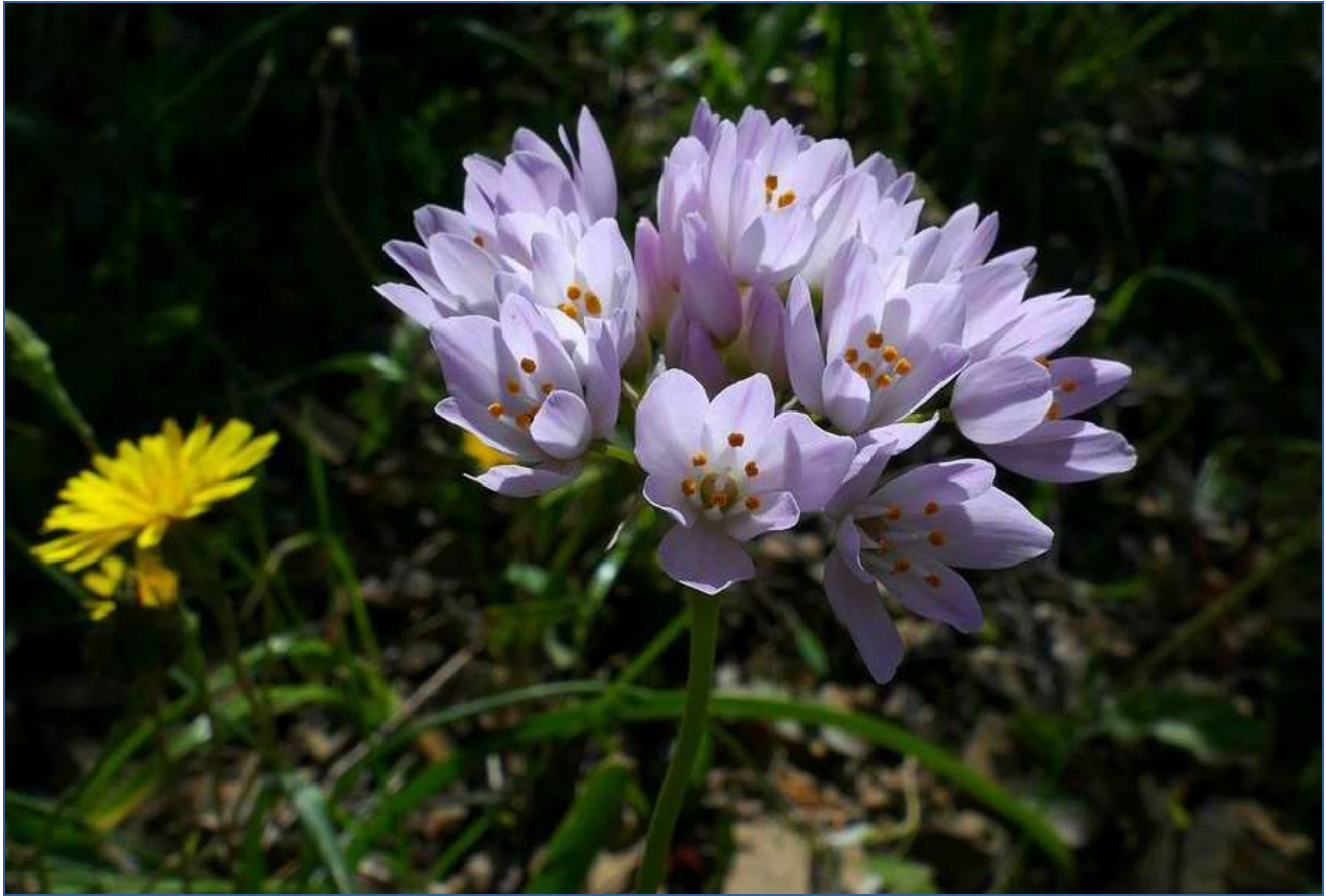
Allium roseum , which we found only once. Perhaps an early flowering one.