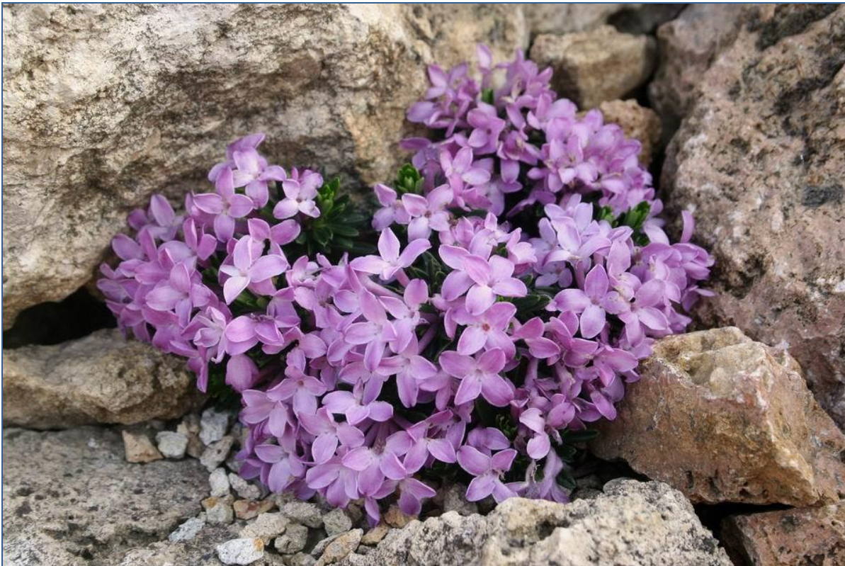
Daphne arbuscula is a neat dwarf evergreen shrub to 15cm tall, with narrowly oblong, glossy dark green leaves to 18mm long and deliciously fragrant pink flowers borne in cluster in spring. In the Thymelaeaceae, it is endemic to Slovakia. Grows mostly on southern sunny rocky slopes with limestone, at an altitude of 800–1300 m.