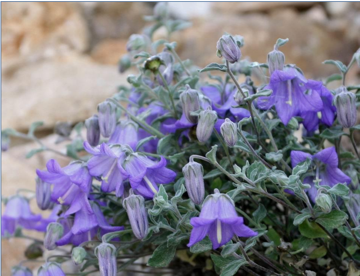
Campanula cashmeriana can achieve a height of 20cm and a spread of 20cm after 2-5 years in a gritty well-drained sunny position. From the Himalyas.