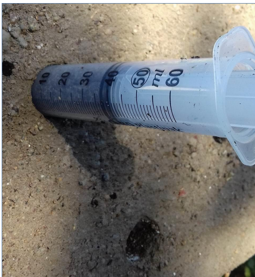
60ml Syringe injecting mix into the trough wall.