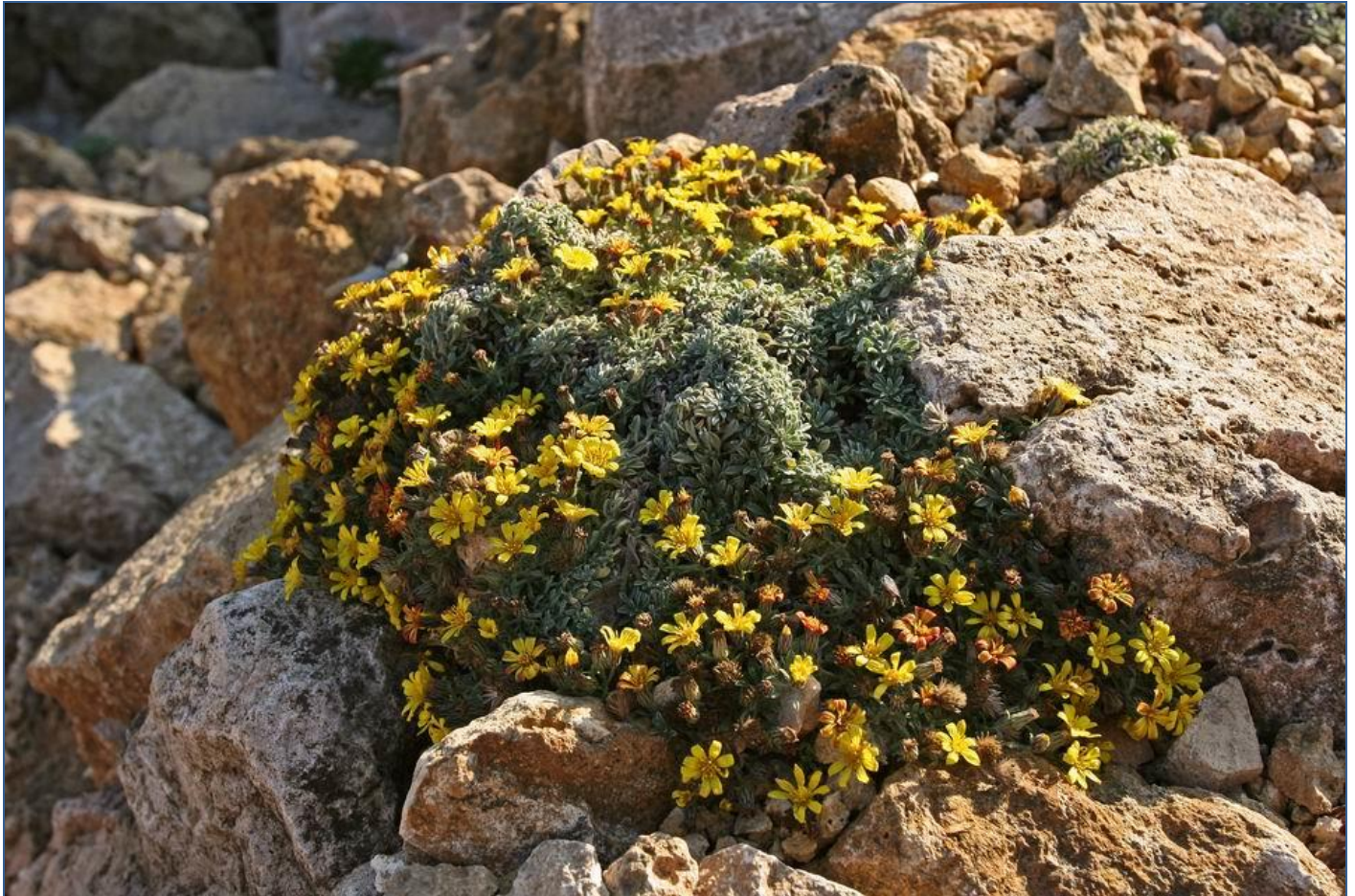
Heterotheca jonesii From southern Utah, this rare North American species of flowering plant in the Asteraceae Prostrate mats of woody stems clothed in hairy grey-green leaves. The clear yellow aster flowers are often borne over a long period.