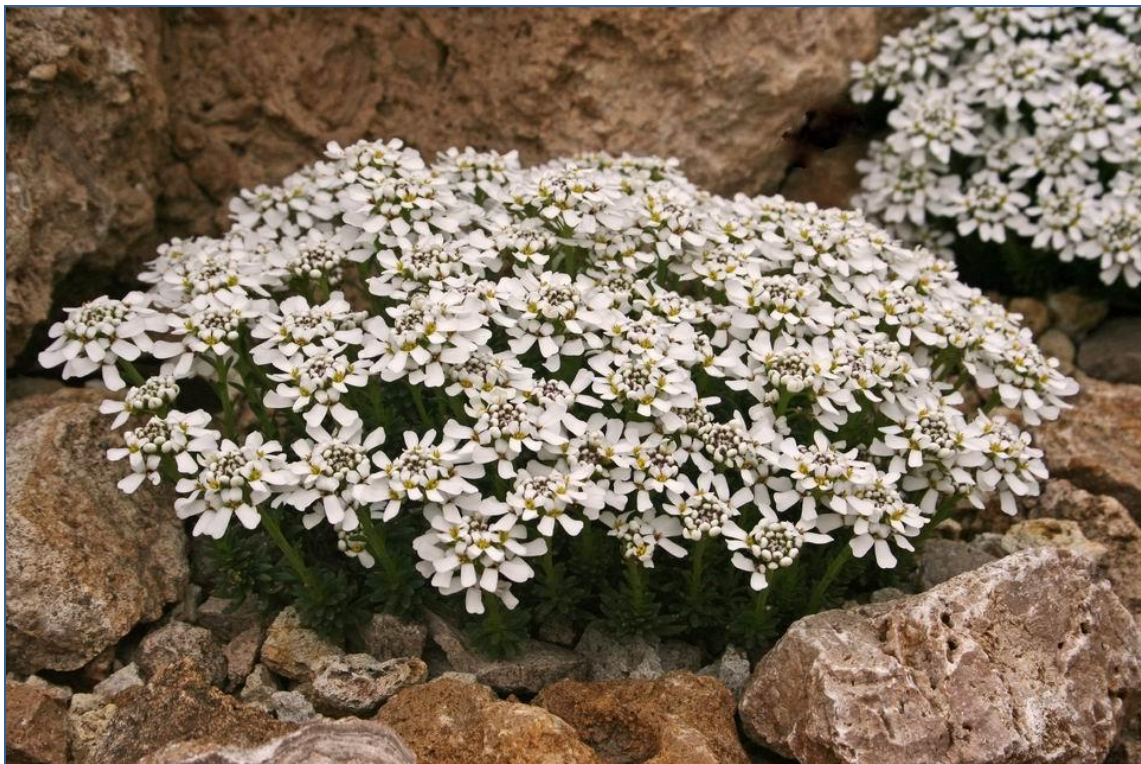
Iberis saxatilis is a shrubby low-growing, spreading mound. It is native to France, Switzerland, Italy, the Balkan Peninsula, and the Crimean Peninsula.