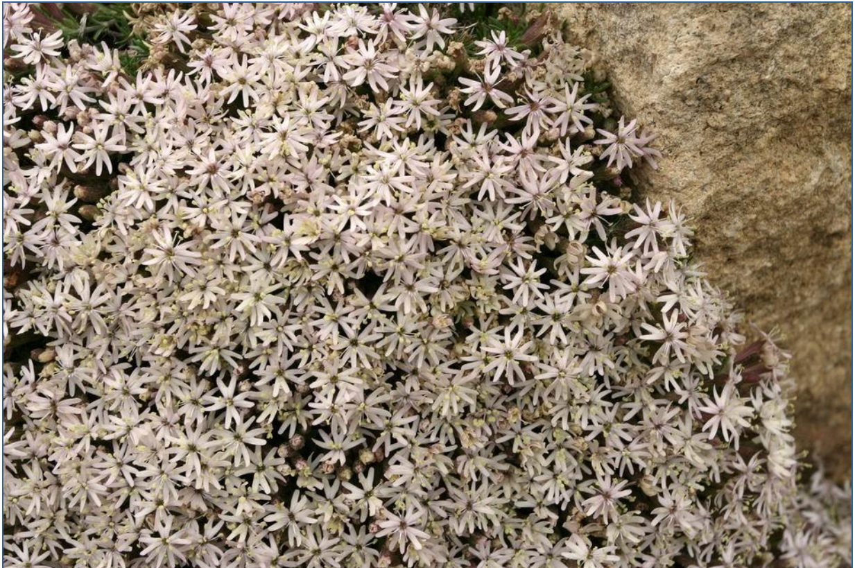
Close up of Silene bolanthoides

Silene acaulis , in the Carophyllaceae, found widely across the northern hemisphere, is an evergreen, compact, cushion-forming perennial to around 5cm high with tiny, linear, bright green leaves. Its spring flowers are pink, or occasionally white, as here, and often have notched petals.