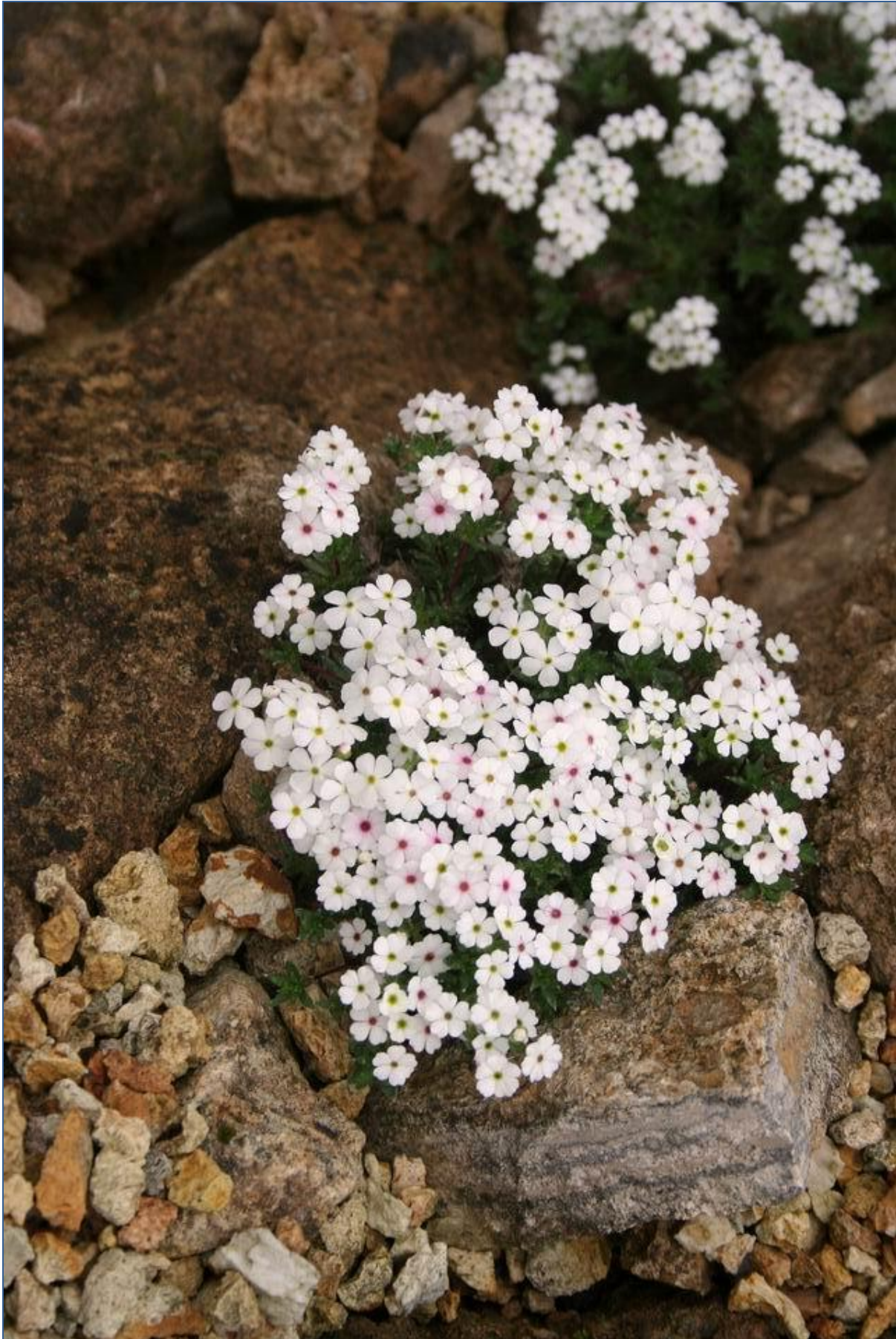
Androsace barbulata - mat-forming perennial with tufts of woody stems, grey leaves, white flowers. Flowering stems 3-6 cm tall. Primulaceae. Distribution: Caucasus, 1400-3000 m above sea level on rocky slopes, rocks, screes.