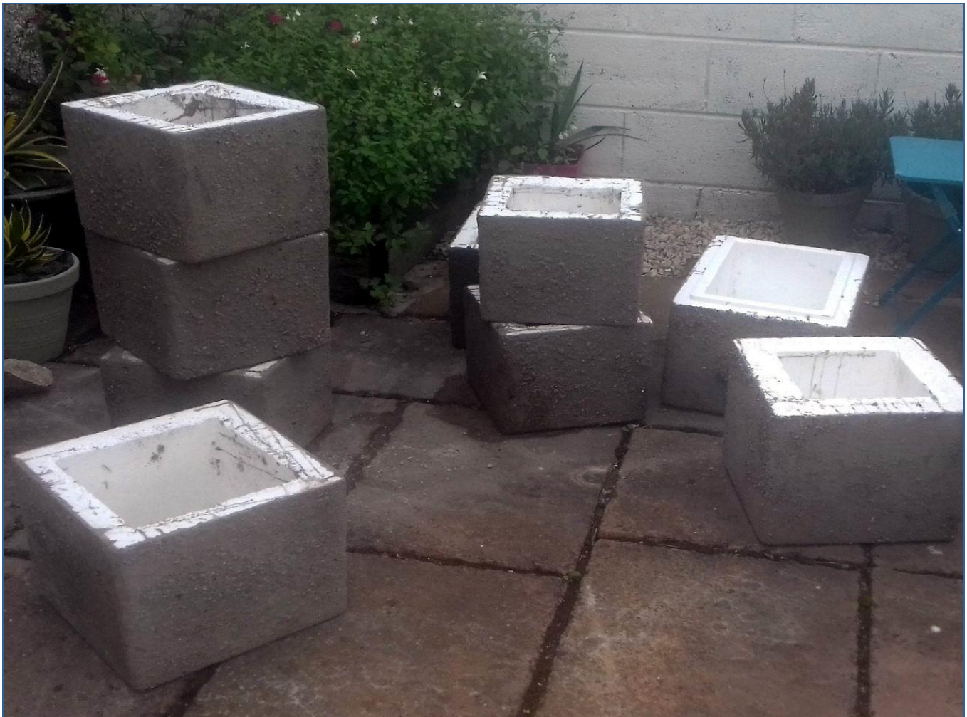
Partially prepared boxes

In order to stabilise the tower so it wouldn't fall-over a hole was dug and a concrete plinth pored to match the dimensions of the bottom trough, a length of angle iron and a 33mm plastic pipe (with small holes drilled to help with watering) were set into the centre of the plinth to add structural stability. The majority of the base of each trough was removed so that the trough could be treaded over the angle-iron and pipe into place and also to make the inside of the structure one continuous tube of planting mix so that water could penetrate down through the structure. PVA adhesive was used to glue the first trough to the concrete base and subsequent trough layers to each other.