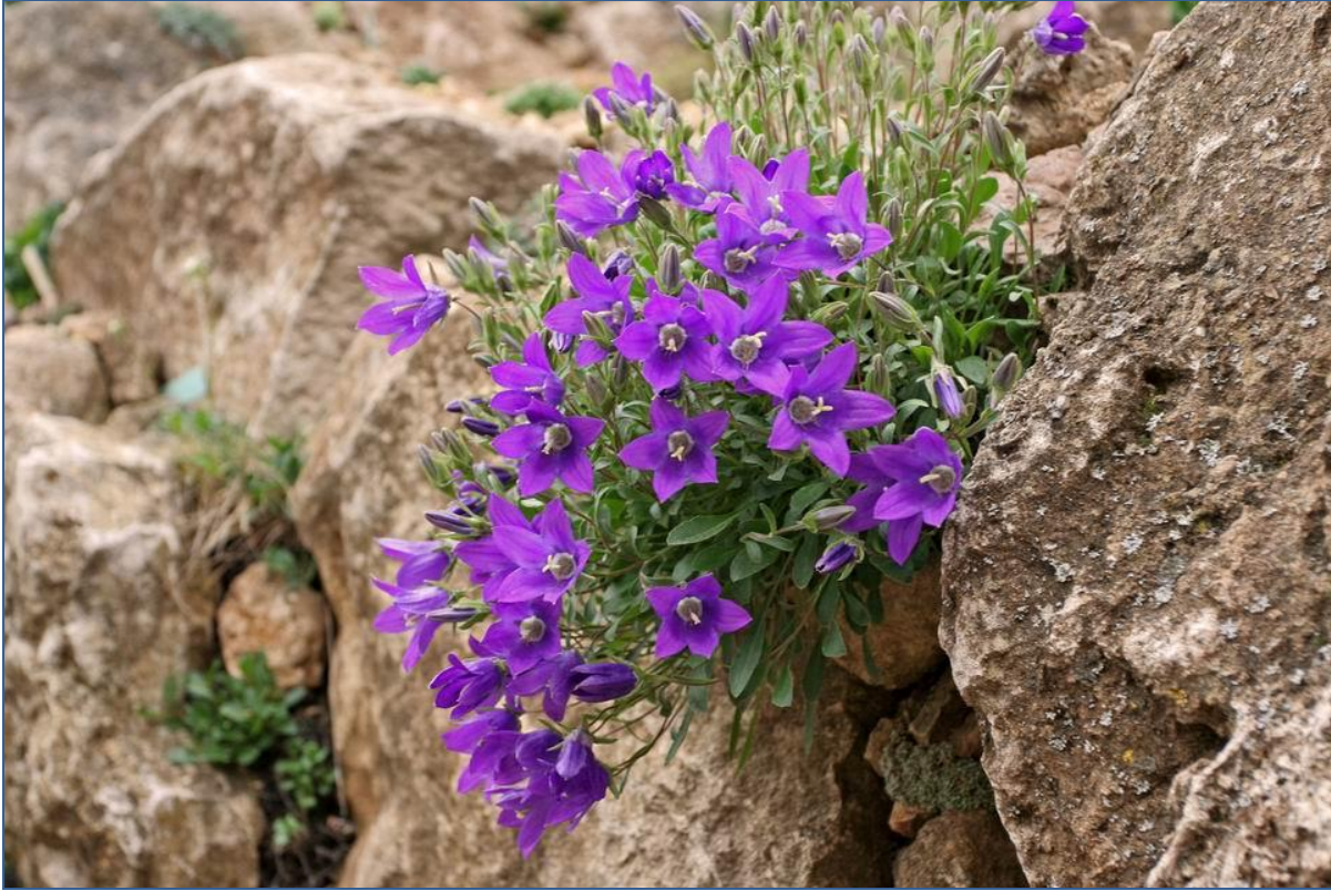
Campanula anomala from the Russian Federation is tolerant of various climate zones. Oval green leaves with crimped edge. Purple/blue flowers in typical bell shape emerge on the ends of the stems.