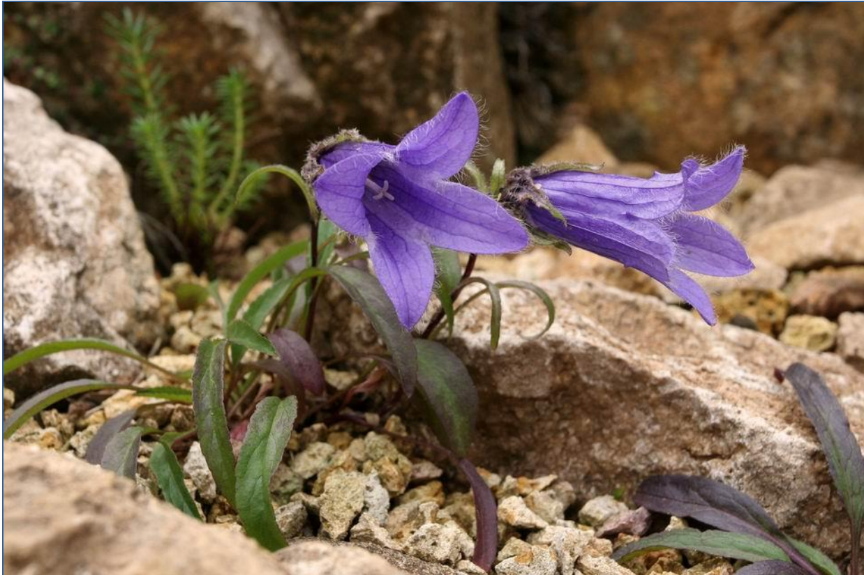
Campanula dasyantha Bieb. synonym Campanula pilosa Pall. Ex Roem & Schult. Comes from Japan in the alpine zone on rocky slopes and crevices. It can often be confused with Campanula chamissonis , but differs in its acute, pubescent, narrow basal leaves.