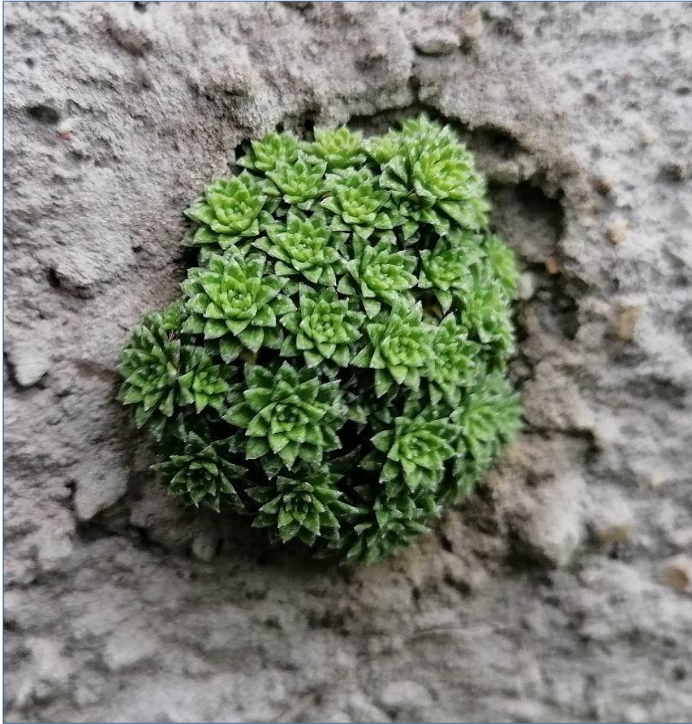
Saxifraga karacardia : porophyllum saxifrages have generally filled out the original 30mm planting hole within the first 6 months.