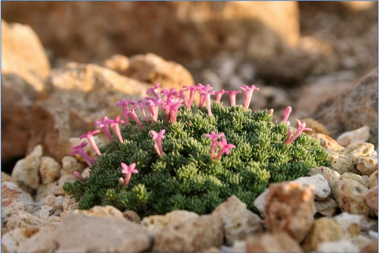
Asperula sintenisii Rubiaceae. From 1800-2500 m above sea level; grasslands, rocks on East Aegean Islands of Greece and Turkey. Subshrub mat-forming up to 5 cm tall. Flowers small, pink. in spring-summer.