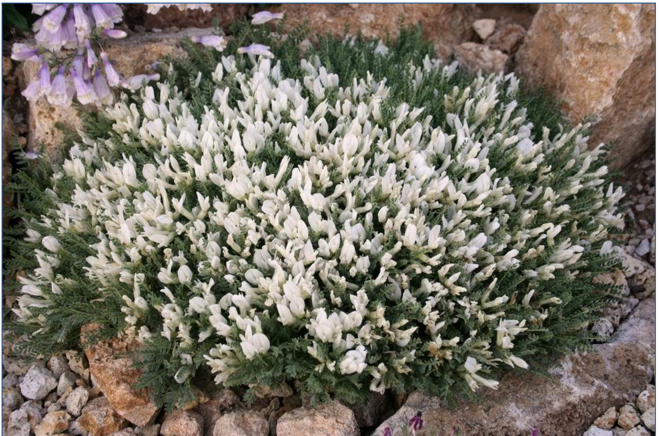
Astragalus angustifolius Fabaceae. A sub-shrub from Turkey, this form with white flowers.