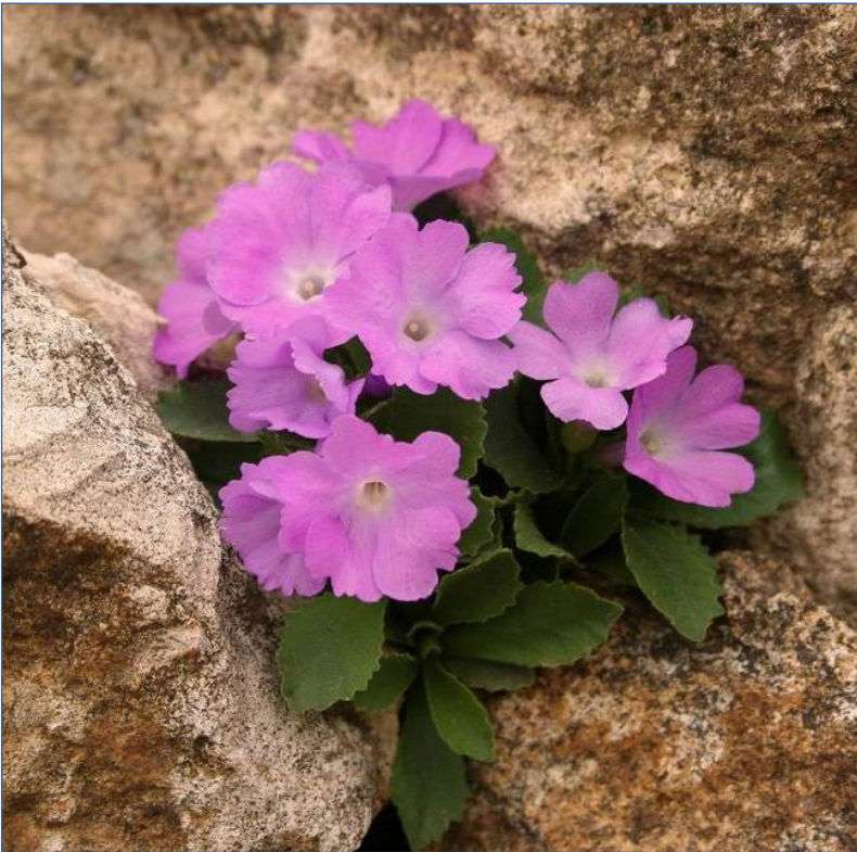
Primula x marginata

Primula farinosa is a small short-lived perennial in the family Primulaceae, native to Northern Europe and northern Asia. It thrives on grazed meadows rich in lime and moisture. Typical of wet, usually spring-fed, calcareous flushes. Grows 5–30 cm, stem leafless, hairy, scape also with glandular hairs and a mealy appearance.