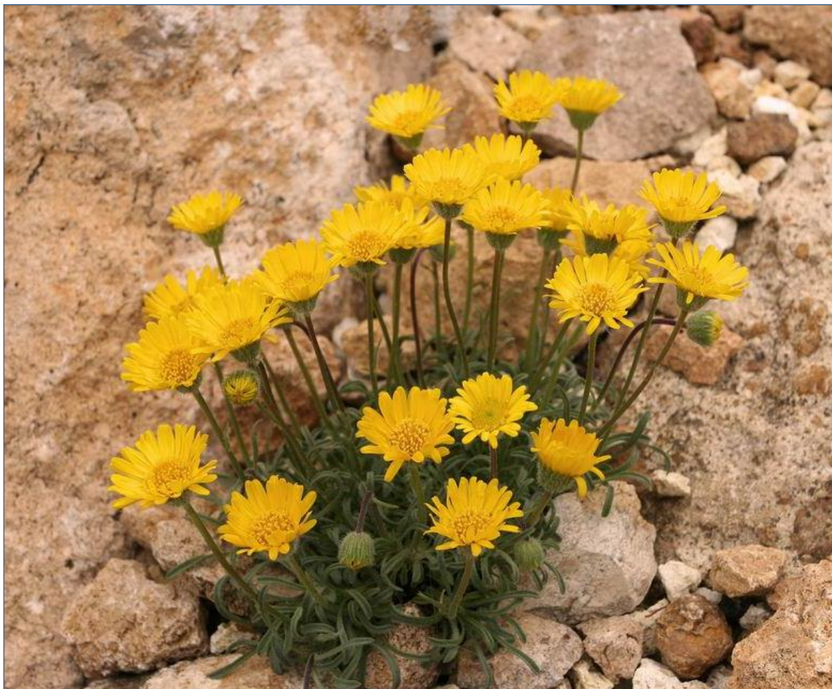
Erigeron chrysopsidis - a North American species of flowering plants in the daisy family from south-eastern Washington, Oregon, extreme northern California, northern Nevada and Idaho. Very narrow basal leaves in tufts, covered with hairs

Gentiana alpina 'Iceberg' - small, shining incurving leaves forming rosettes, flowers in May, June. Granitic Alps. Gentiana acaulis/ alpina and G. kochiana need a semi-sunny spot.