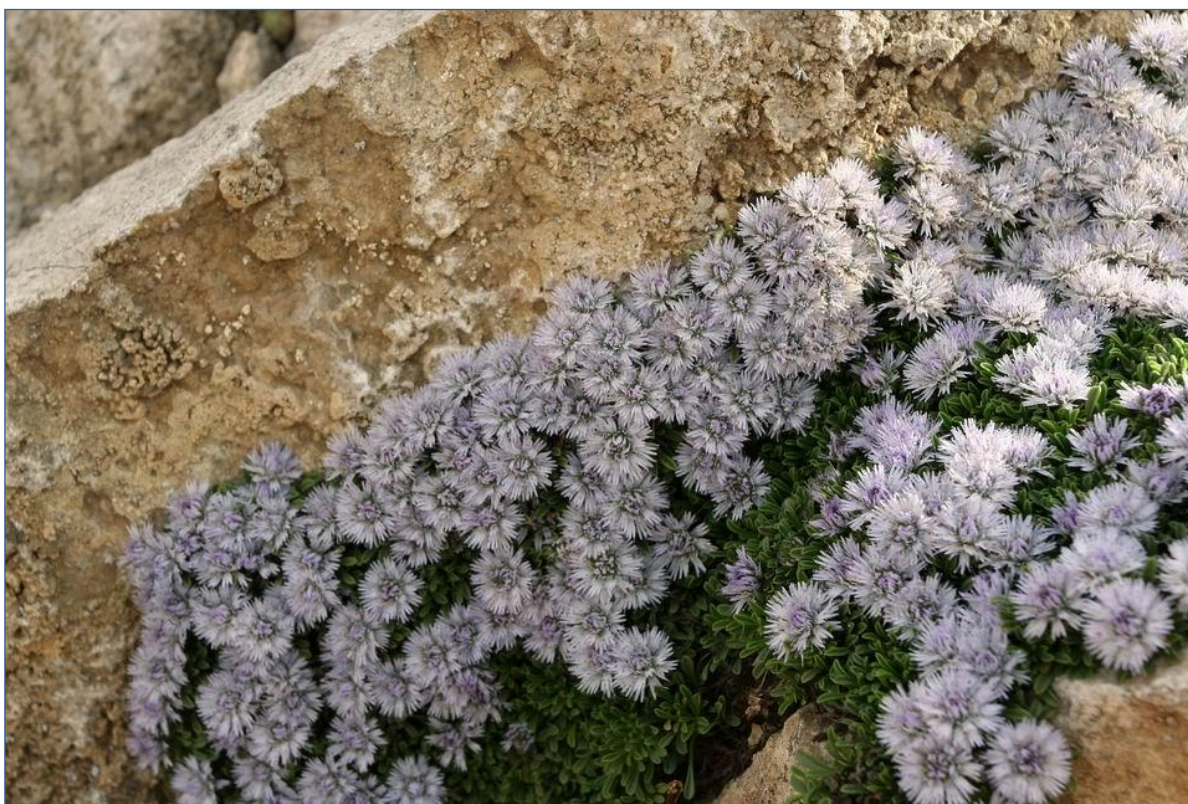
Globularia repens is from mountains of SW Europe. The main stems of this perennial (ca. 2-4 cm tall) get woody with age. Leaves are evergreen. Flowering stems short with inflorescences 1-2 cm across.