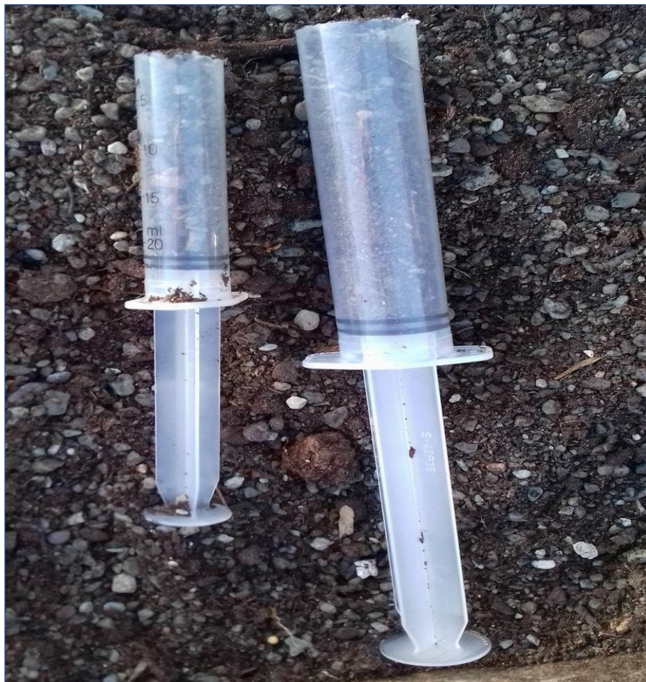
20ml and 50 ml syringes with the tops removed for planting.