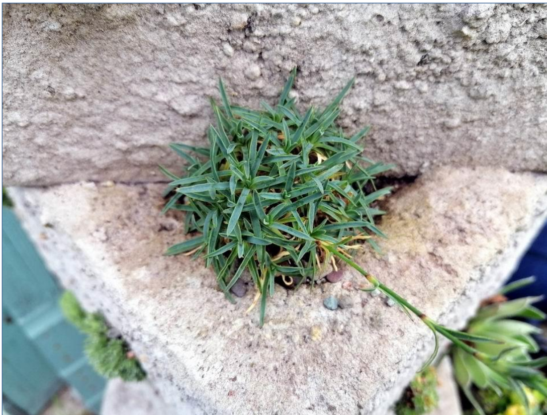
Dianthus haematocalyx subsp. ventricosus growing on a "ledge"