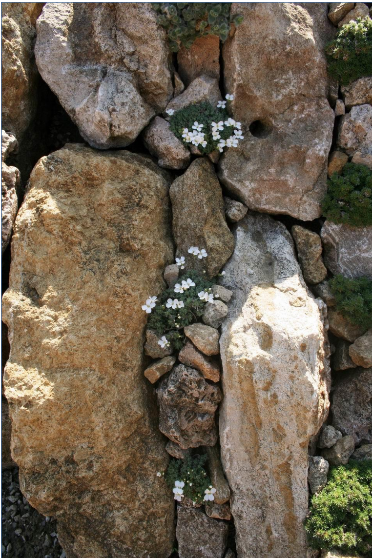
Arabis bryoides Cruciferae. From Greece, Balkan Peninsula. Mat-forming plant from limestone cliffs with soft hairy tiny leaves and white flowers on 2.5 cms stems during April-May.