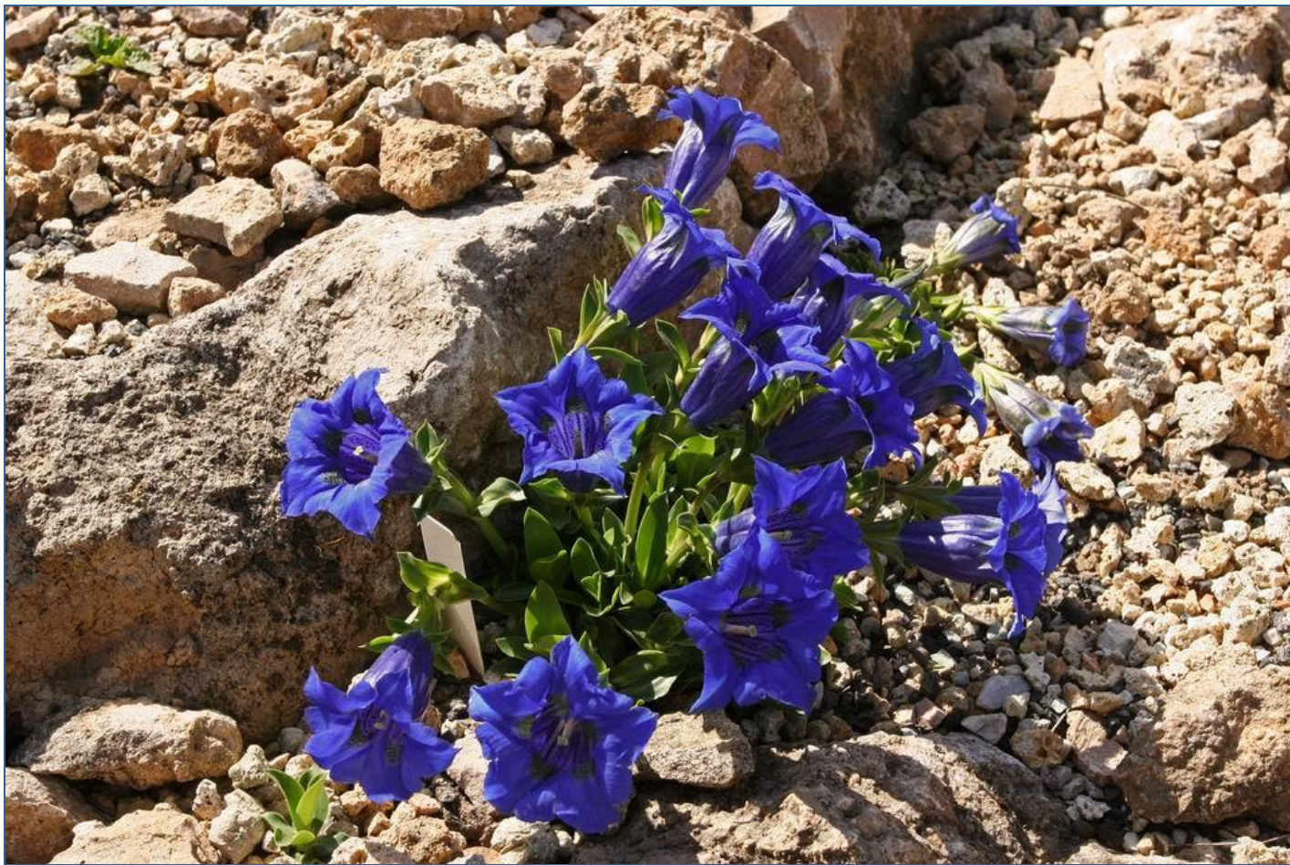
Gentiana ligustica from the Maritime and Ligurian Alps, 1650-2000 m above sea level on grassland. Leaves oblong-ovate. Flowers in May-June, 60 mm long, 40 mm diameter, blue, spotted green inside tube.