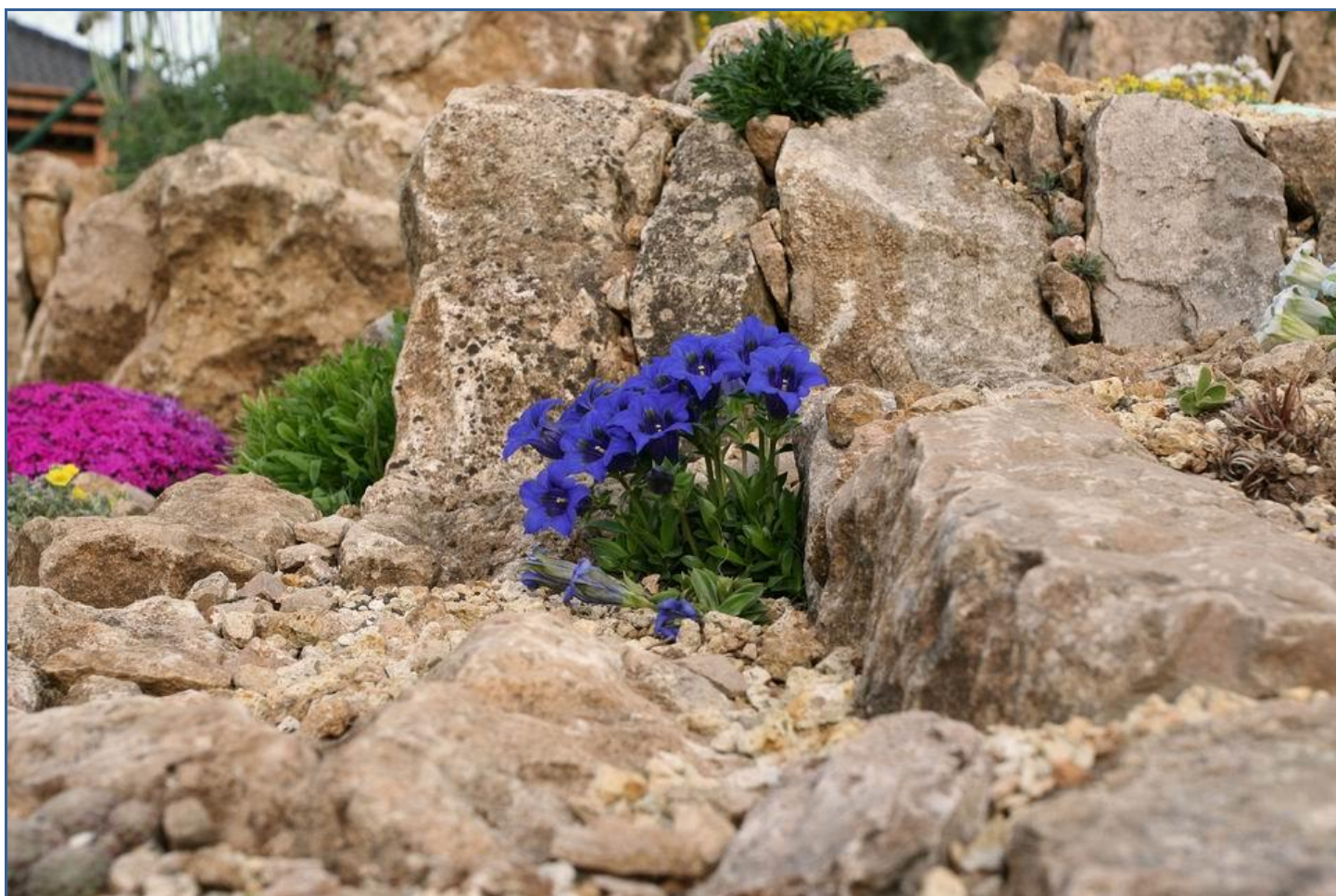
Rockwork and plants

I admit that I often struggle in the aesthetic with the collecting side of things. The aesthete prefers to plant a few species in large groups on the whole rock, as it is in nature. On the other hand, the collector is one who wants to have as many plants as possible on the "Noah's ark" of rock gardens. The rock garden is designed to have different growing habitats. It is built in the form of a gorge, where the side walls of the layers are oriented to the northeast. As the side walls of the wider layers are quite high, this passage is sufficiently shaded over lunch time and is therefore suitable for cooler plants from the mountains. The opposite, more or less southern side or aspect, in turn, is better suited to thermophilic species. Gradually, as I build the rock garden, I continuously plant it and evaluate the selection of plants.