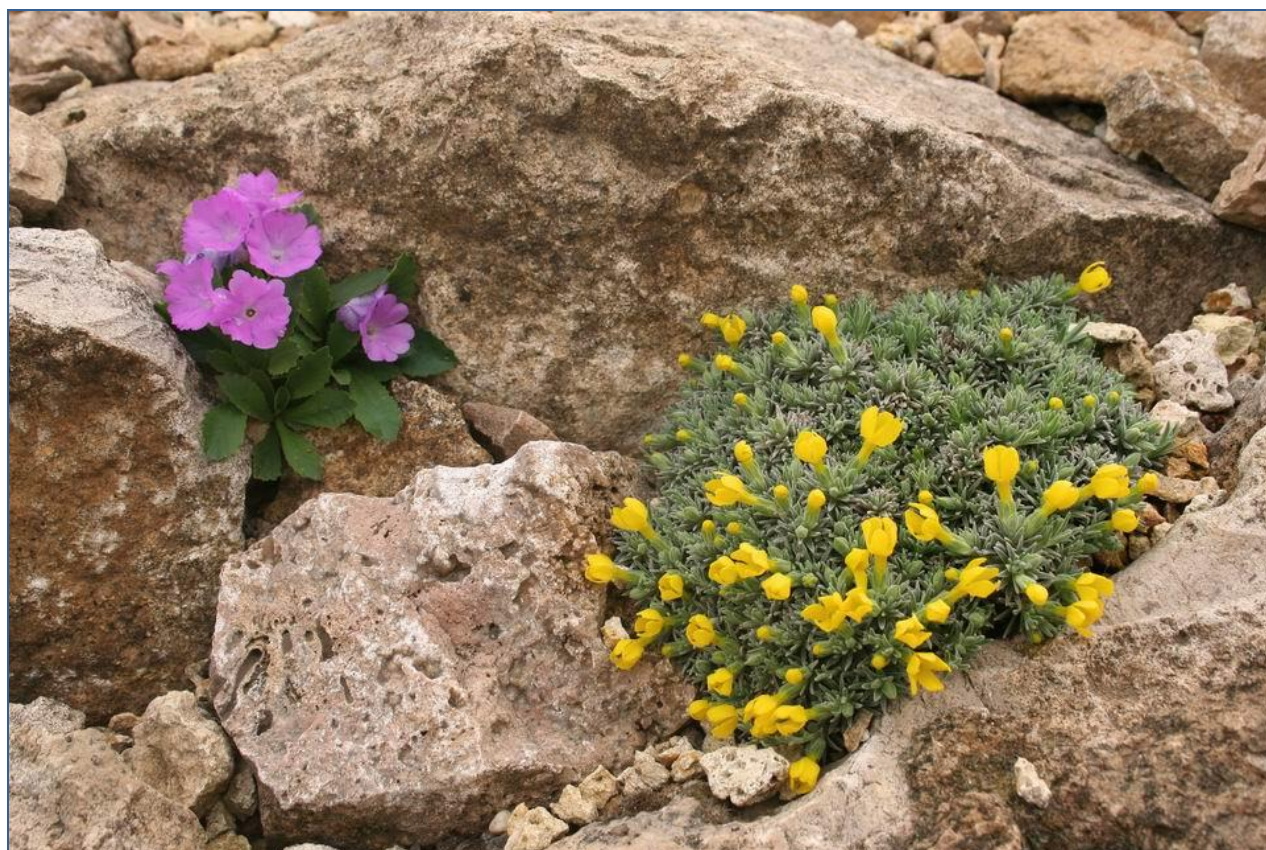
Two plants in the Primulaceae - Primula x marginata and Androsace vitaliana .