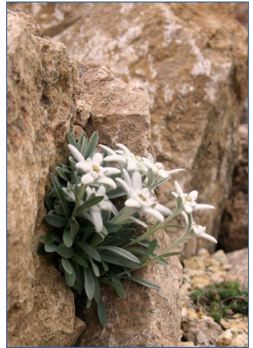
Leontopodium nivale is a hardy perennial which prefers rocky

limestone places at about 1,800–3,000 metres altitude in the European alps. The plant's leaves and flowers are covered with white hairs, and appear densely tomentose. Famously known as Edelweiss, flowering stalks, seen between July and September, can grow to a size of 3–20 centimetres in the wild, or up to 40 cm in cultivation. Each bloom consists of around six small yellow clustered florets (5 mm) surrounded by woolly white bracts.