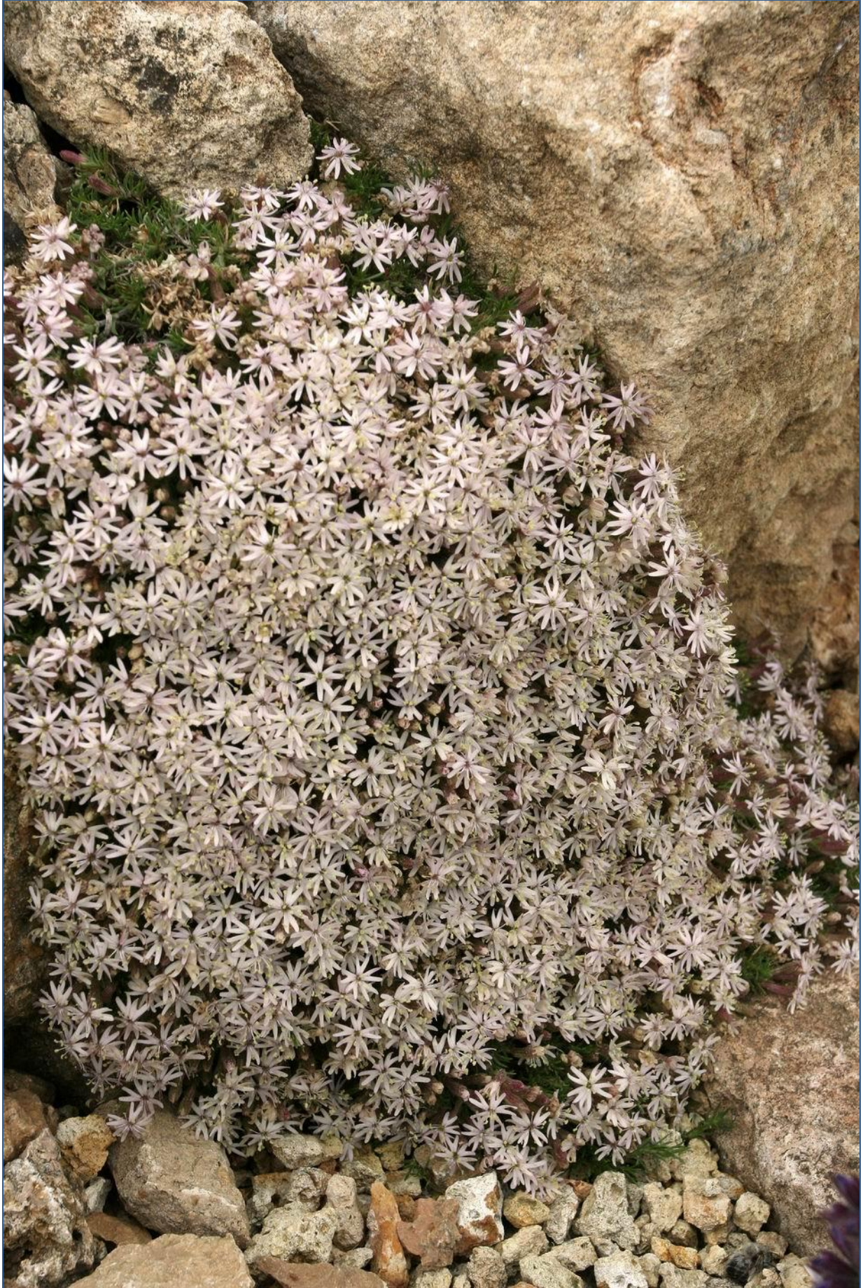
Silene bolanthoides is a floriferous endemic species from Kazdagı (Mt. İda), Canakkale-Balıkesir, Turkey. Plant height less than 5cm, flower size around 2.5cm.