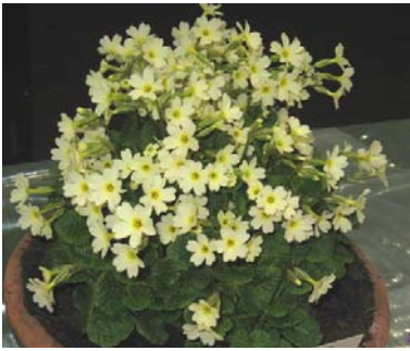
Primula elatior ssp pseudoelatios