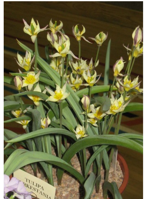
These photos are of a mixture of plants mainly from section B and C. Some crackers here! And a song 'Tulips from Hexham Show'