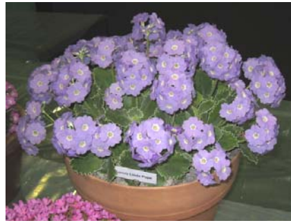
Primula 'Linda Pope'