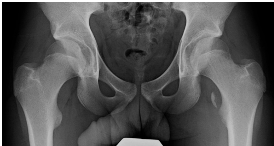
FIGURE 1: Anteroposterior pelvis radiograph of the patient with a significantly displaced avulsion fracture of a left lesser trochanter

All cases were treated with nonoperative treatment modalities, consisting of discontinuation of the patient's sport in all cases and formal physical therapy in 18 (60%) cases. Weight-bearing status at the initial time of treatment included weight-bearing as tolerated (WBAT) in 17 cases (57%), partial weight bearing (PWB) in 9 cases (30%), toe-touch weight-bearing (TTWB) in 2 cases (6.67%), and non-weight-bearing (NWB) in 2 cases (6.67%). The average treatment duration was 30.7 days (range 21-60 days). Radiographic assessment (Figures 1 and 2) demonstrated an average fracture displacement of 5.1 mm (range 0-17 mm).