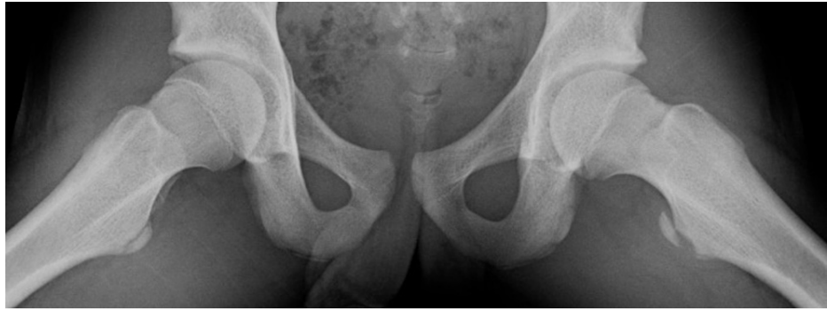
FIGURE 2: Frog-lateral radiograph demonstrating displaced avulsion fracture of the lesser trochanter

All 30 athletes returned to their sport (100%), with the average time to return to the sport being 78.3 days (2.5 months, range). Throughout the follow-up period, there were no diagnoses of a delayed union based on the radiographic review (Figure 3).