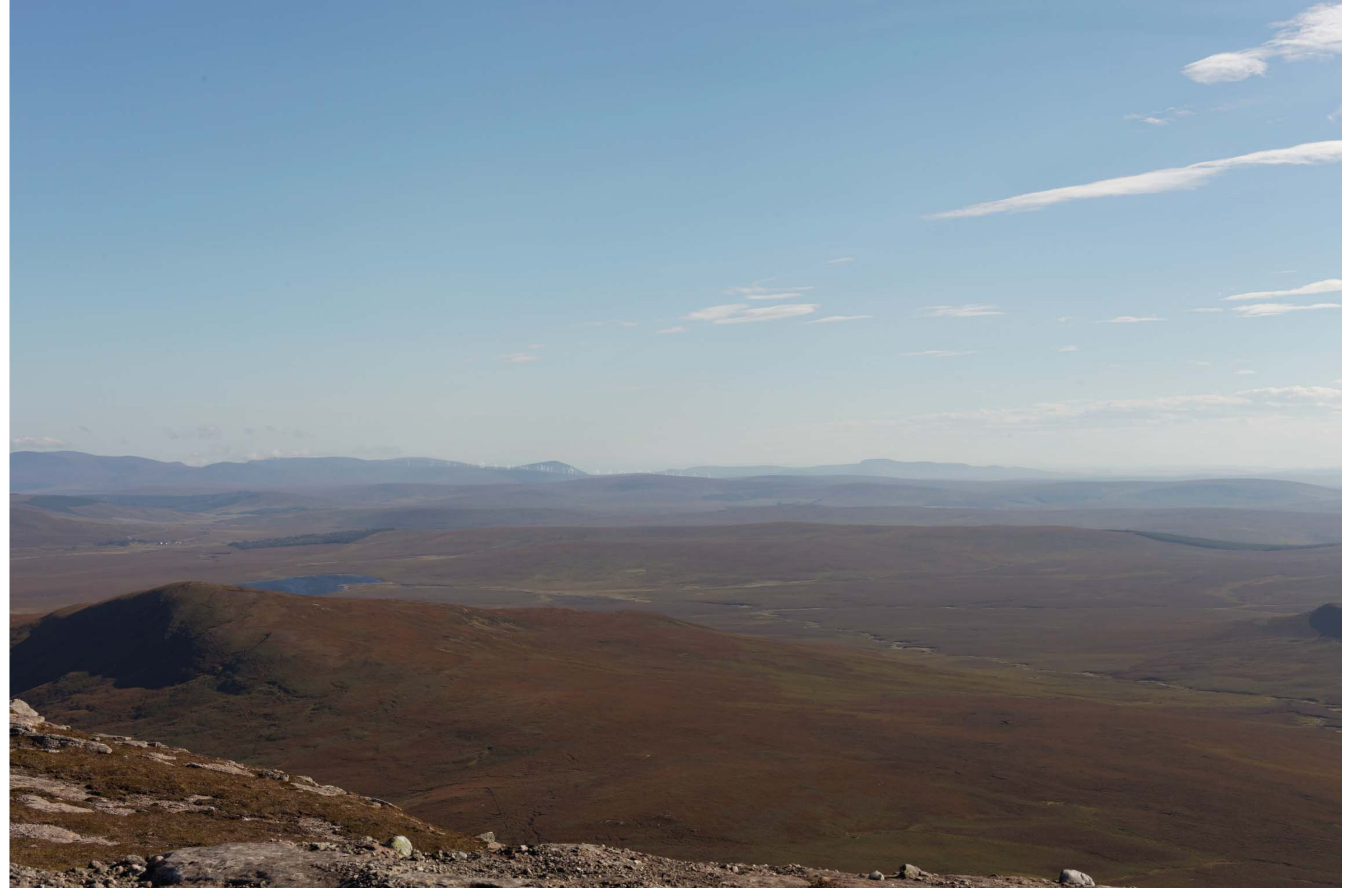
Viewpoint 17: Ben Griam Beg