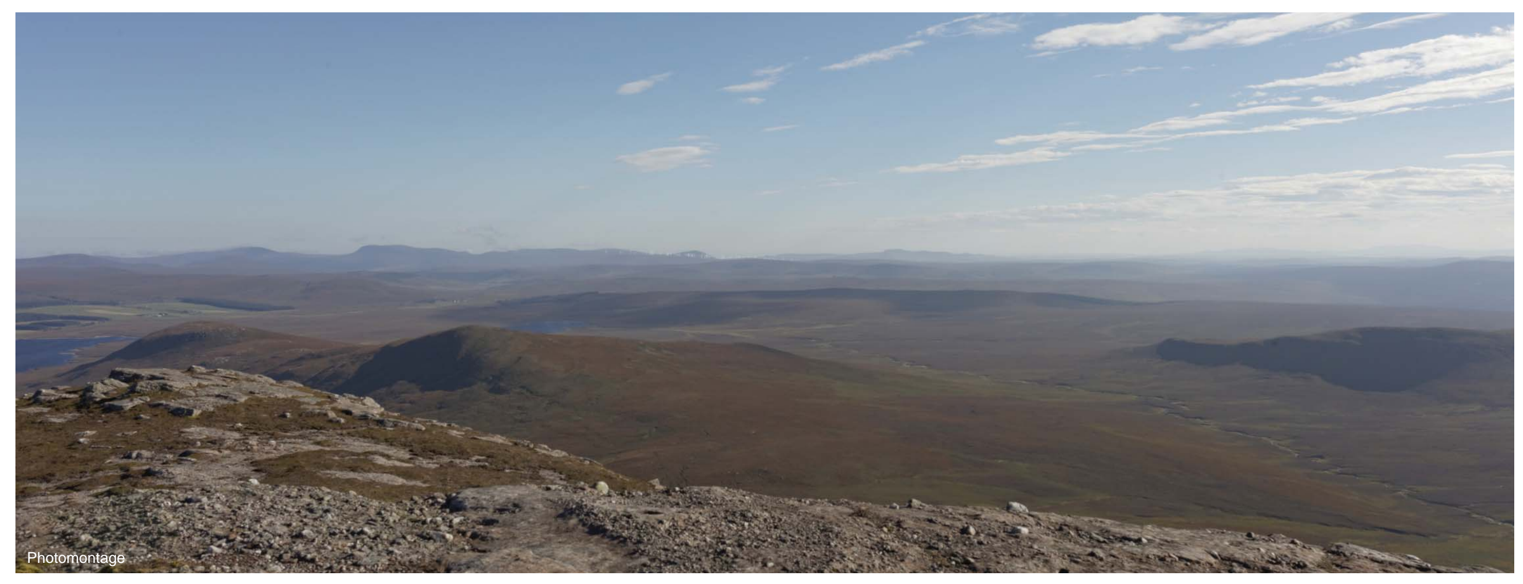
Viewpoint 17: Ben Griam beg