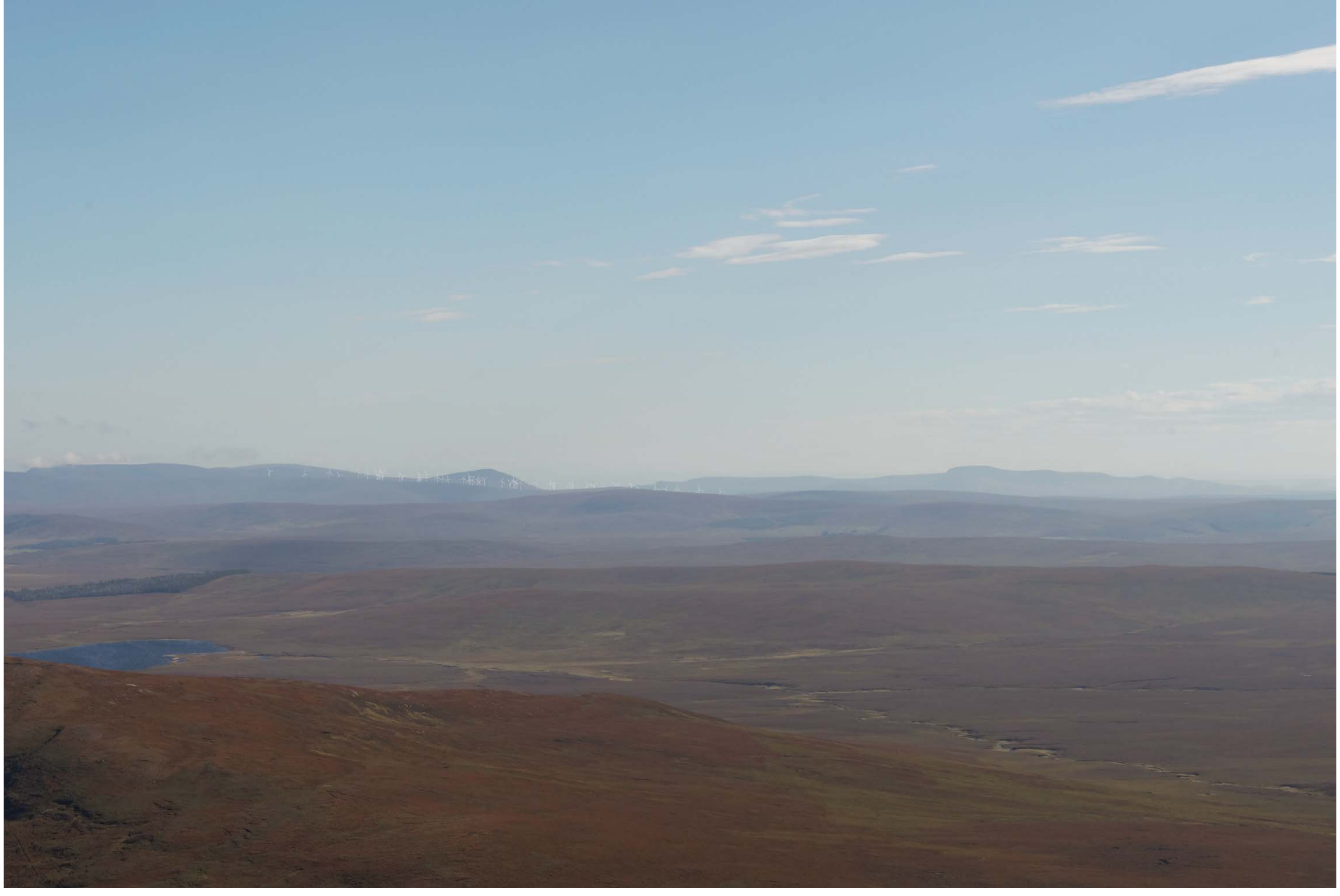
Viewpoint 17: Ben Griam Beg