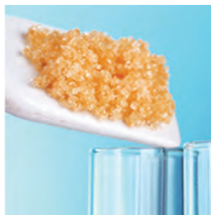
Lyophilized (Freeze-dried extract)