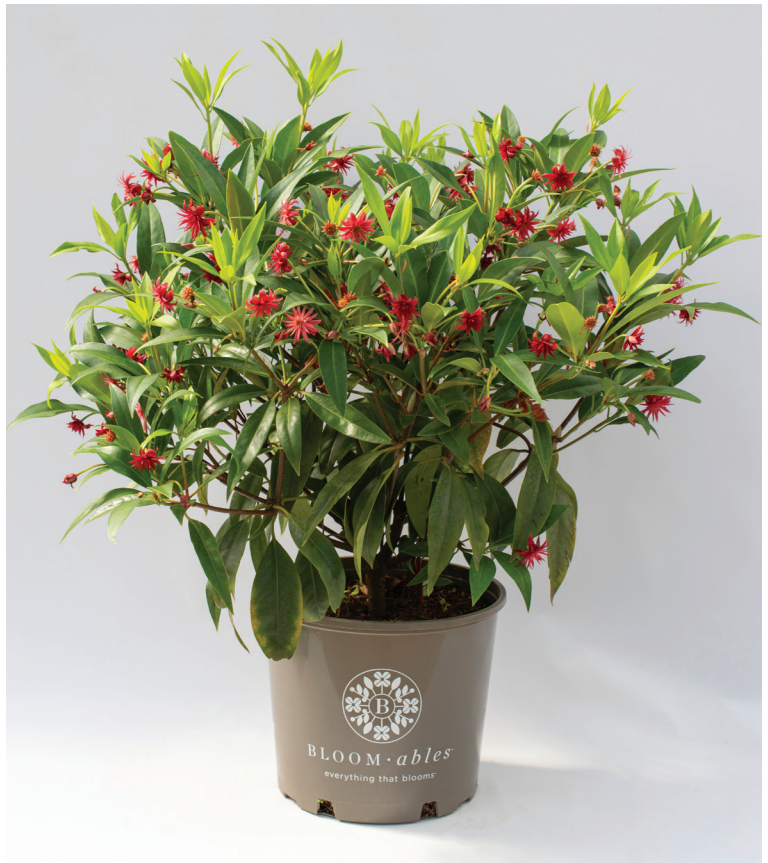
Fig 1: Finished container.