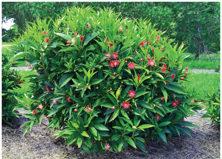
Fig 2: Landscape habit.