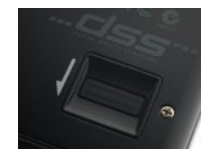
Biometric Scanner (DS-5000iD)

The DS-5000 was developed with feedback from professional users to improve their workflow.