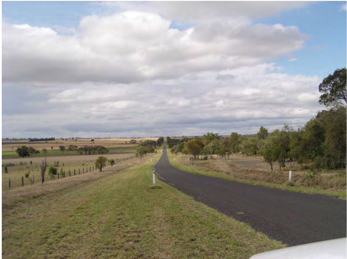
Figure 4-1 Typical view of the study area – cleared grazing and agricultural lands

major communities of the study area, the Bowen Basin coal measures that extend south to Theodore and the mineral lease areas located around Cracow.