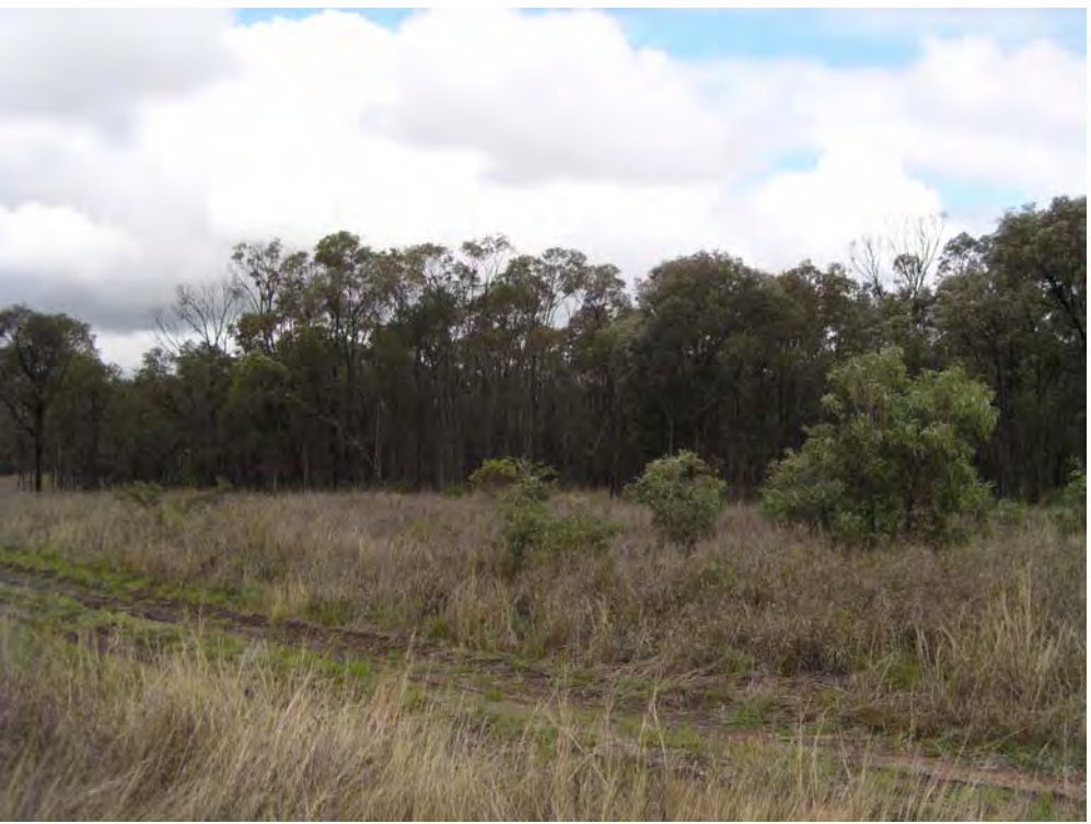
Figure 4-5 Area of Brigalow found in the road reserve of the Leichhardt Highway