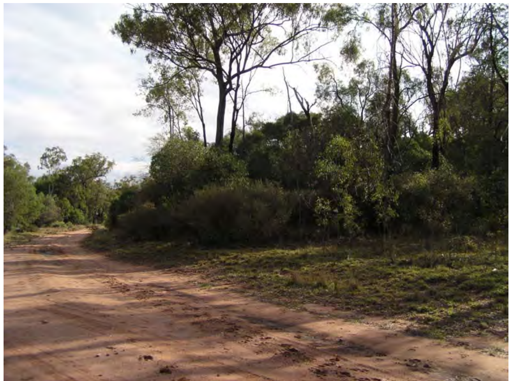
Figure 4-4 Section of Semi-evergreen vine thicket found in the study area