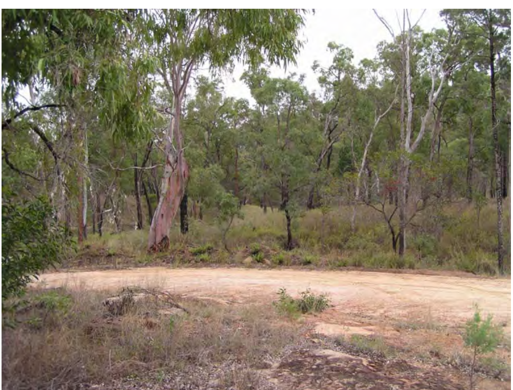
Figure 4-3 Eucalypt woodland with cypress in the Gilbert Range area