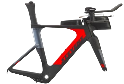
► Carbon Fire-Red

Custom bike incl. special options. Further details see stevensbikes.de/custom