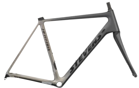
> Slate Grey