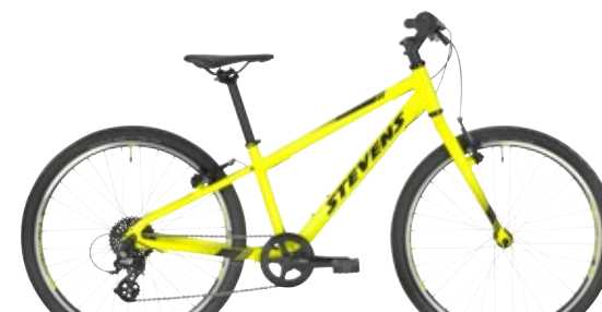
▶ 24" // Neon Yellow