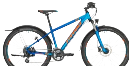
› 27,5" // Deep Sea Blue