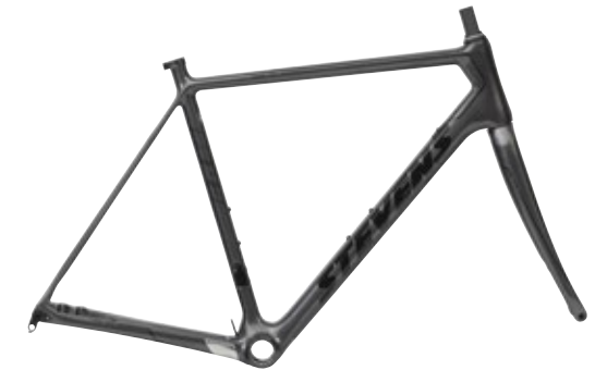
> Phantom Grey