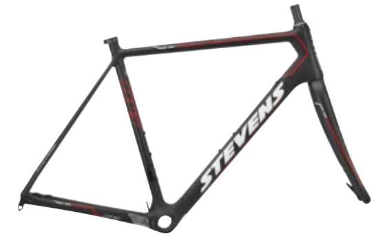
> Ink Black