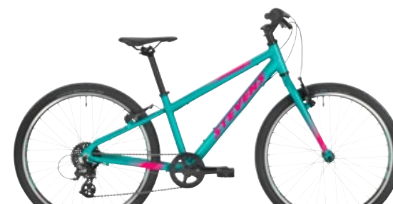
▶ 24" // Bright Turquoise