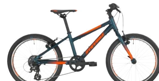
▶ 20" // Moonlight Blue