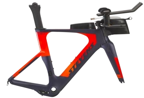
► Deep Violet