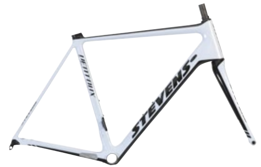
> Carrara White