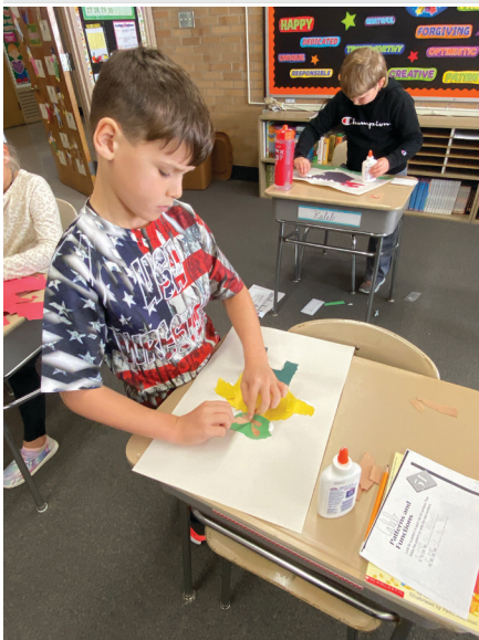
The 3rd and 4th graders tore paper to create shape monsters.