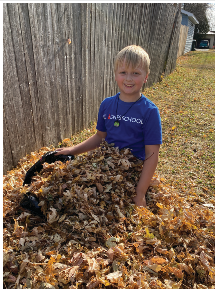
St. Agnes students provided service to our neighbors during our annual Workathon.