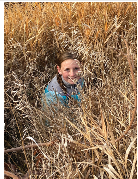
Grades 2-6 visited Prairie Wetlands. We made observations about our environment and collected seeds.