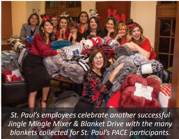
St. Paul's employees celebrate another successful Jingle Mingle Mixer & Blanket Drive with the many blankets collected for St. Paul's PACE participants.

Thunder and lightning and rain, OH MY! Our 4th annual Jingle Mingle Mixer & Blanket Drive may have started with an ominous beginning, but it proved to be a rousing success!