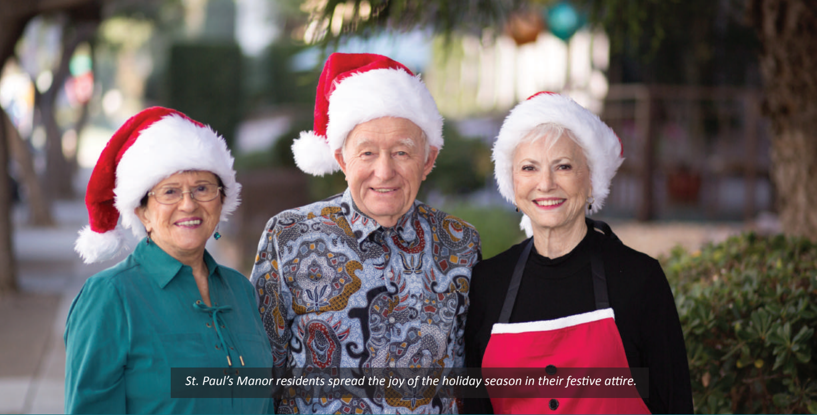
St. Paul's Manor residents spread the joy of the holiday season in their festive attire.