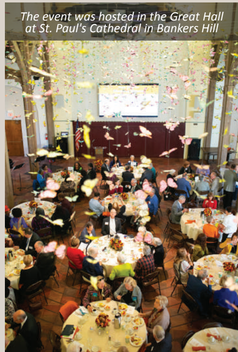
The event was hosted in the Great Hall at St. Paul's Cathedral in Bankers Hill