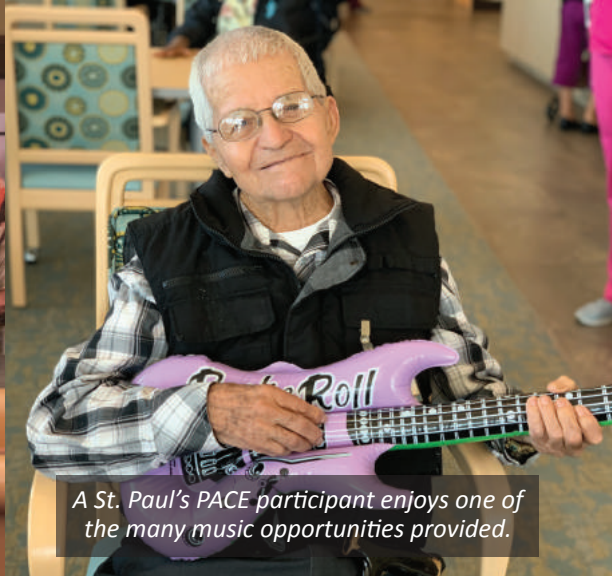
A St. Paul's PACE participant enjoys one of the many music opportunities provided.