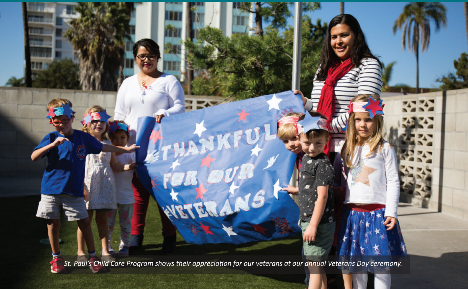
St. Paul's Child Care Program shows their appreciation for our veterans at our annual Veterans Day ceremony.