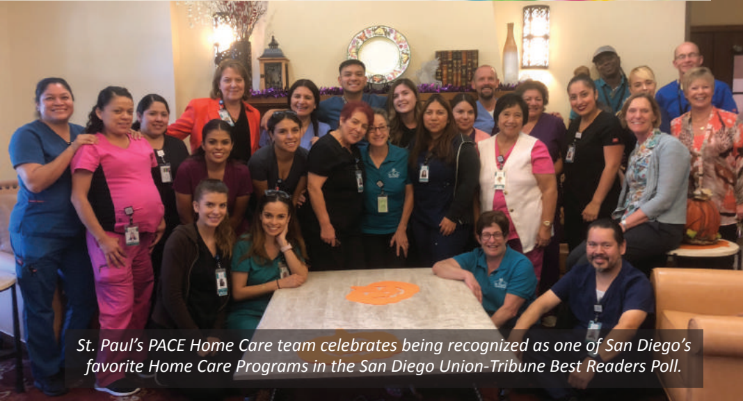
St. Paul's PACE Home Care team celebrates being recognized as one of San Diego's favorite Home Care Programs in the San Diego Union-Tribune Best Readers Poll.