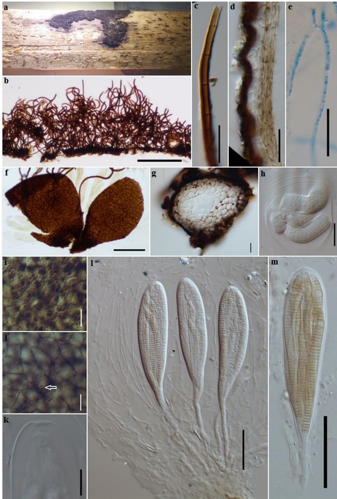
Fig. 1 – Kamalomyces polyseptatus (AMH-9968 Holotype). a Colony on host. b Vertical section of subiculum. c Hypha d Peridium. e Pseudoparaphyses. f, g Ascomata. h Transverse section of asci. i Peridium textura angularis . j peridium layer with monk pores. k Ascus with apical chamber. l-m Asci. Bars – b = 200 \mu\text{m} , f = 100 \mu\text{m} , l, m = 50 \mu\text{m} , c-e, h, k = 20 \mu\text{m} , g, i, j = 10 \mu\text{m} .