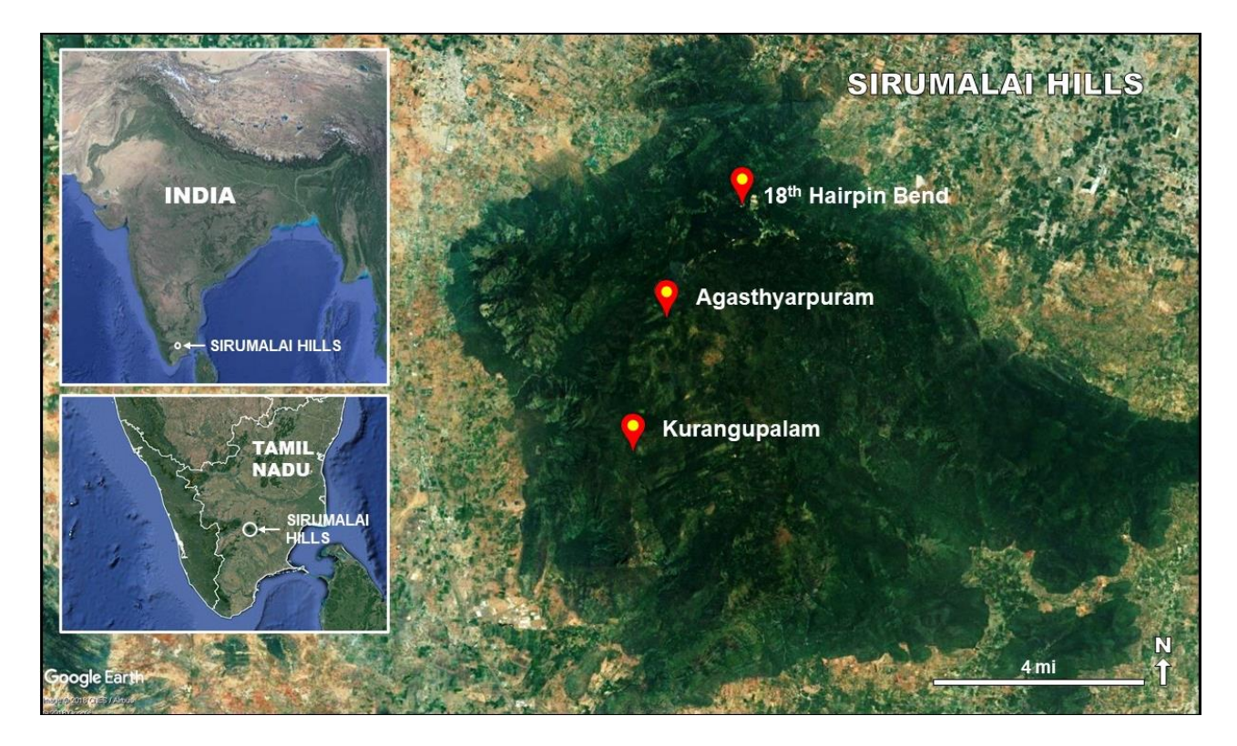
Fig. 1 – Map showing the lichen collection sites in Sirumalai hills. The top left panel of the map shows the location of Sirumalai hills within India. The bottom left panel is the enlarged portion of southern India showing the location of Tamil Nadu state and Sirumalai hills.

hottest in the hills and temperature range between 28°C to 40°C. The temperature drops significantly during winter and range between 10°C to 18°C. The months from February to August are mostly dry with occasional showers in April and May. There is a little rainfall in September, followed by the heavy showers of the north-eastern monsoon from the middle of October till the end of December. The average annual rainfall in the region is 120 to 132 cm, while the relative humidity varies from 30% to 80% (Karuppusamy 2007, Santharam et al. 2014). The area is characterized by disturbed scrub forests cover on lower hills, the dry deciduous forest at midelevation, and semi-evergreen forests at the higher elevation. The slopes of these hills can also be covered by savannah grassland. There have been frequent studies in this region on higher plants, including both medicinal and ethnobotanical plants. Sankar et al. (2009) reported a total of 85 plant species as new records for the Sirumalai hills, while Karuppusamy (2007) listed 90 species of medicinal plants used mainly by the 'Paliyan' tribes dwelling in the area. The altitudinal gradient, rich flora and fauna in the Sirumalai hills, indicates the possibilities of harbouring the luxuriant growth of lichens. Therefore, we surveyed this area to document its anticipated high lichen diversity.