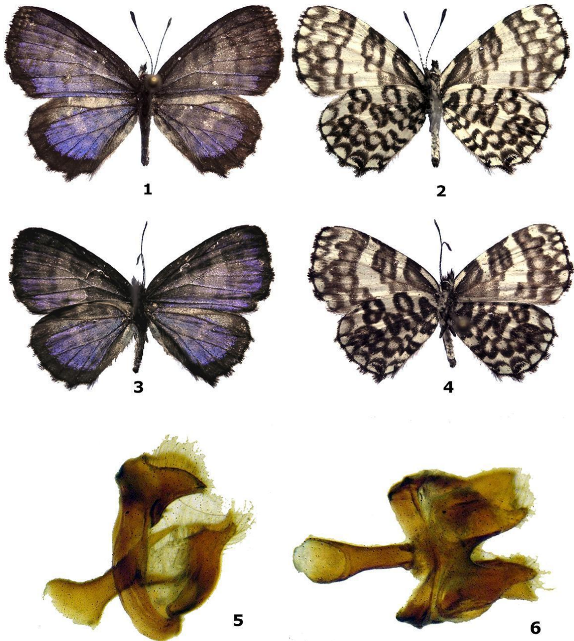
Fig. 1-6. Adults and male genitalia of Thaumaina aquamarina spec. nov.

Fig. 1. Holotype, KSP12360, upperside; Fig. 2. Holotype, KSP12360, underside; Fig. 3. Paratype, KSP12361, upperside; Fig. 4. Paratype, KSP12361, underside; Fig. 5. Paratype, KSP12359, male genitalia in lateral view; Fig. 6. Paratype, KSP12359, male genitalia in dorsal view.