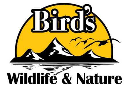
Bird's Wildlife & Nature & Sunrise Birding LLC