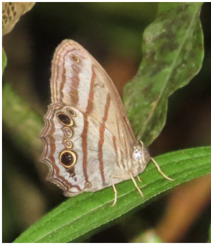
Blue-gray Big-eyed Satyr

Many thanks to everyone that contributed to this list. Please accept apologies for any omissions as I know many more things were seen especially insects.