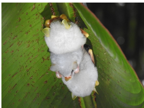
Honduran White Bats