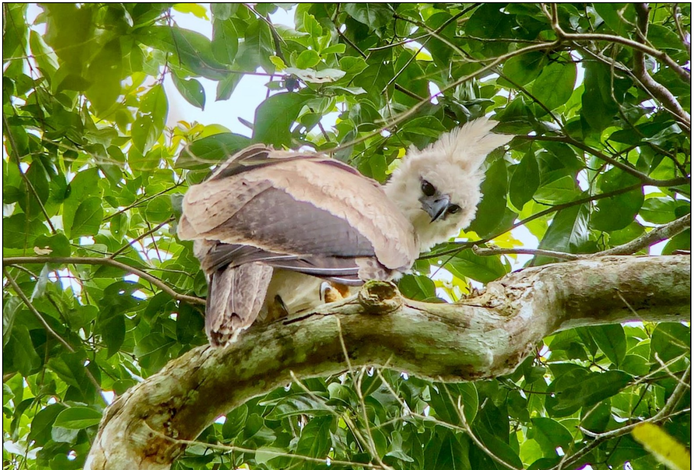
Photos: Birding the forest, Snowy-bellied Hummingbird, Harpy Eagle!