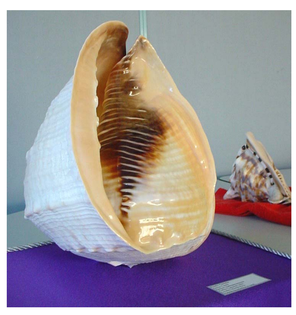
Huge Gem Cassis madagascariensis Florida Keys Sydney Shell Club - Shell of the Show 2004

(To be fair to all the Shell Show exhibitors, and to those who missed the show, it would not be appropriate to have just print this issue in black and white) Sorry for the delay.