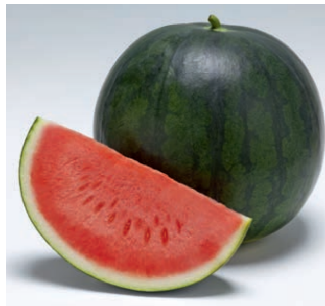
Serenade F1 (T-107)

Description: Seedless watermelon for the early cultivation. Especially recommended for the greenhouse production. Good shelf life and transportability. Excellent internal crispy structure with high brix. Serenade F1 can be combined with strong growing rootstock varieties.