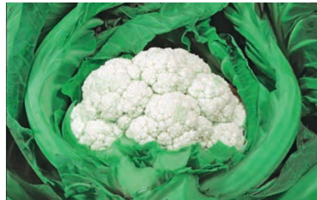
Snow March F1