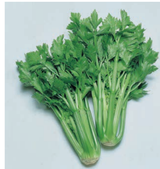
Top Seller F1