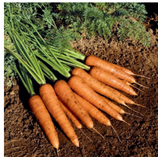
Fire Wedge F1

Description: High yielding variety. The excellent colour (internal and external) makes the variety suitable both for fresh- and processing market. Recommended for moderate climate conditions.