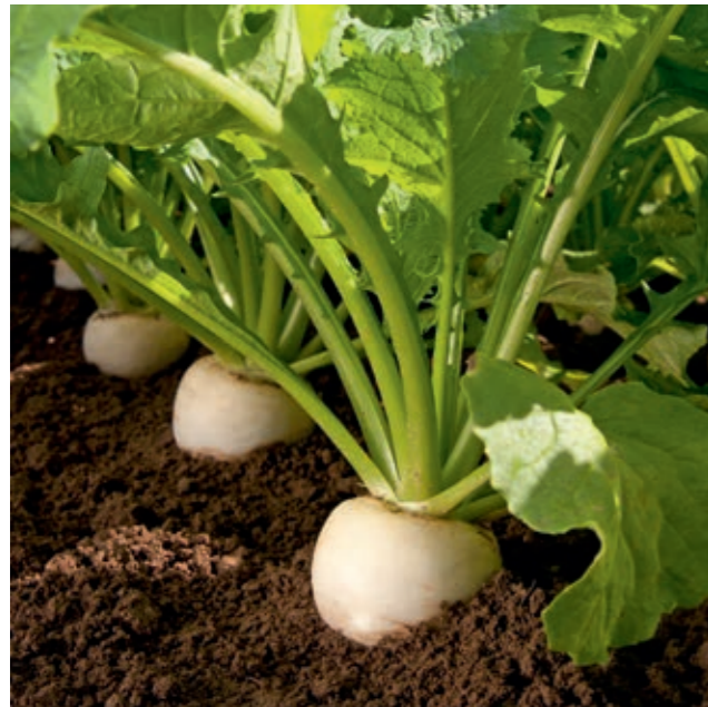
Natsu Komachi F1

Description: Semi-long leave type. Suitable for early cropping period. Resistant to bolting. 5 cm diameter, globe root shape.