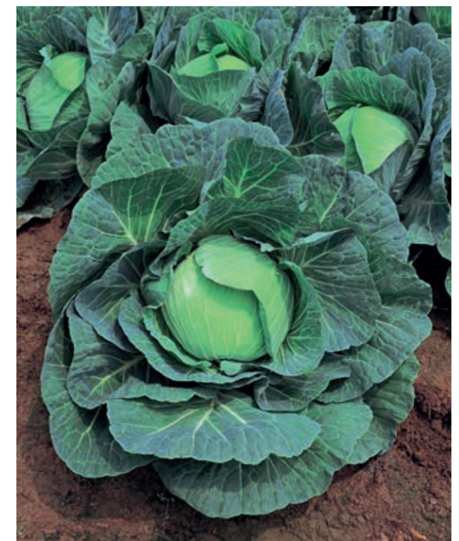
Green Rich F1

Description: Bright green flat cabbage. Fast and vigorous grower. Strong against cracking. Recommended for fresh market and early processing.