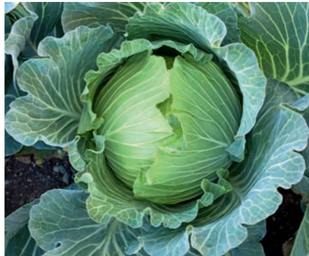
Green Lunar F1

Description: Easy growing variety. Semi flat with bright green colour. Strong against bolting. Uniform grower. Anthocyanin free under cold temperature. Excellent field stand ability. Also recommended for overwintering in moderate areas. Suitable for winter crop.