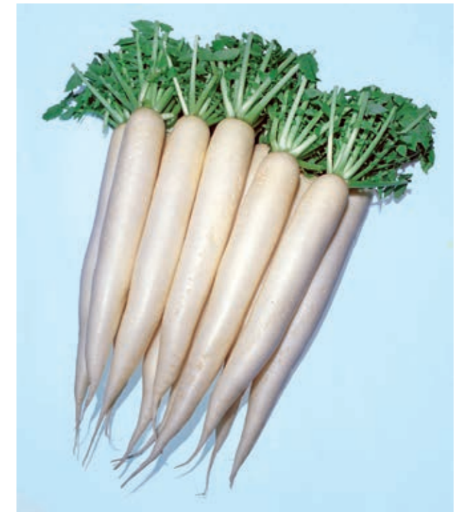
April Cross F1