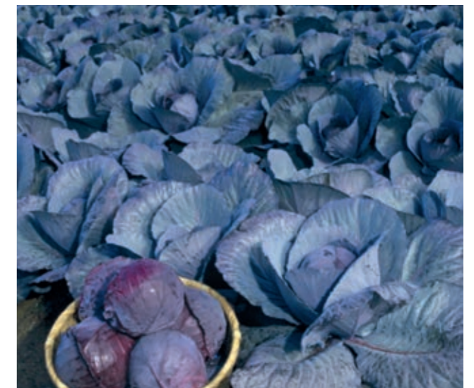
Ruby Perfection F1

Description: Highly productive. Easy grower with a very solid head. Strong against cracking. Attractive dark internal colour.