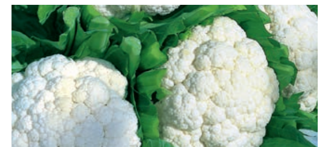
Snow Crown F1

Description: Easy grower for Southern Europe. Nice white curd with excellent quality. Performs well under various conditions. Semi dome shape.