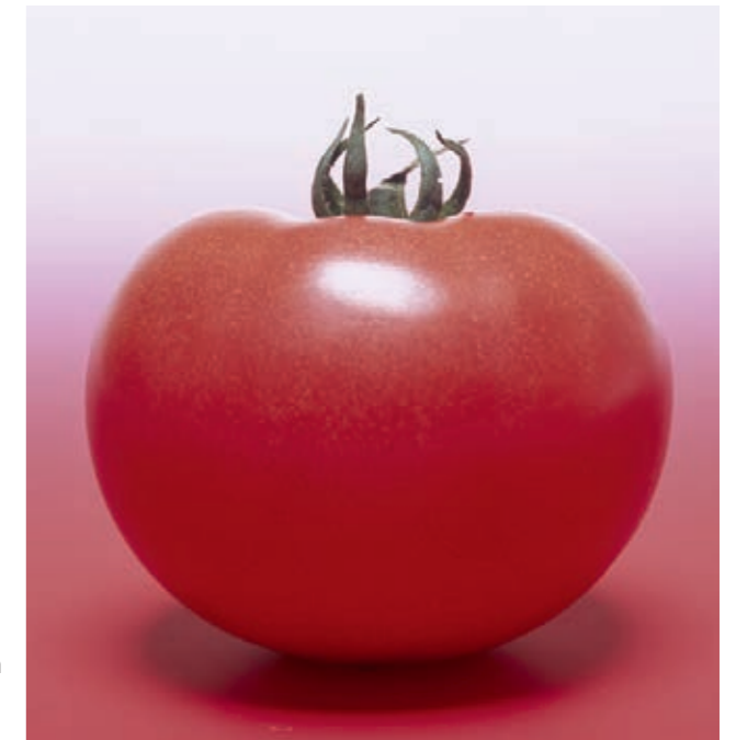
Pink Treat F1 (TEX2721)

Description: Pink Treat F1 is an early pink tomato variety with slightly flattened fruits with smooth ribbed shoulders. Internally the fruits are multi loculars (real beef). Pink Treat F1 colours very easily and quickly. The fruits are deep pink and uniform in colour, throughout the whole fruit. The wall of the fruit is medium thick making the variety suitable for transportation. The internal quality is delicate of texture and taste. The variety combines sweetness with a light acidity making it an example of Umami taste experience. The plant is well balanced with medium long internodes and a semi open character. It produces clusters of 4-5 fruits that are suitable for loose harvest only. The first 3 clusters have averagely 3 fruits with weights' up to 250 grams.