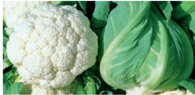
Snow Prince F1

Description: Late variety with nicely dome shaped curd with pure white colour. Very good texture.