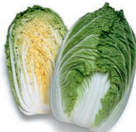
Orient Surprise F1

Description: Very uniform variety with attractive internal yellow colour. Bolting resistant. Suitable for the early open field- and summer production. Orient Surprise F1 is fast filling, produces the perfect weight for the fresh market and is easy to harvest. Strong against tipburn and pepper spot.