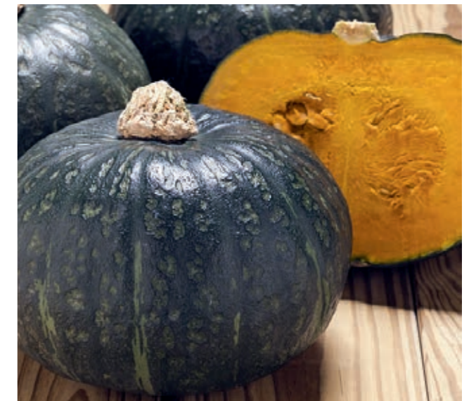
Constanza F1 (TI-151)

Description: High quality pumpkin with wide adaptability to various growing conditions. Excellent structure with sweet taste. Good shelf life.