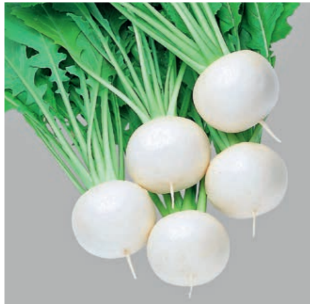
Fuku Komachi F1

Description: Round shaped turnip with high uniformity. Suitable for main season with high yielding capacity. Strong against high temperatures.