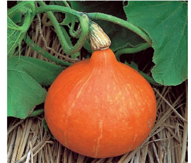
Uchiki Kuri F1

Description: Very attractive deep orange pumpkin. Very vigorous grower and highly productive. Recommended for kitchen use but also for decoration purpose.