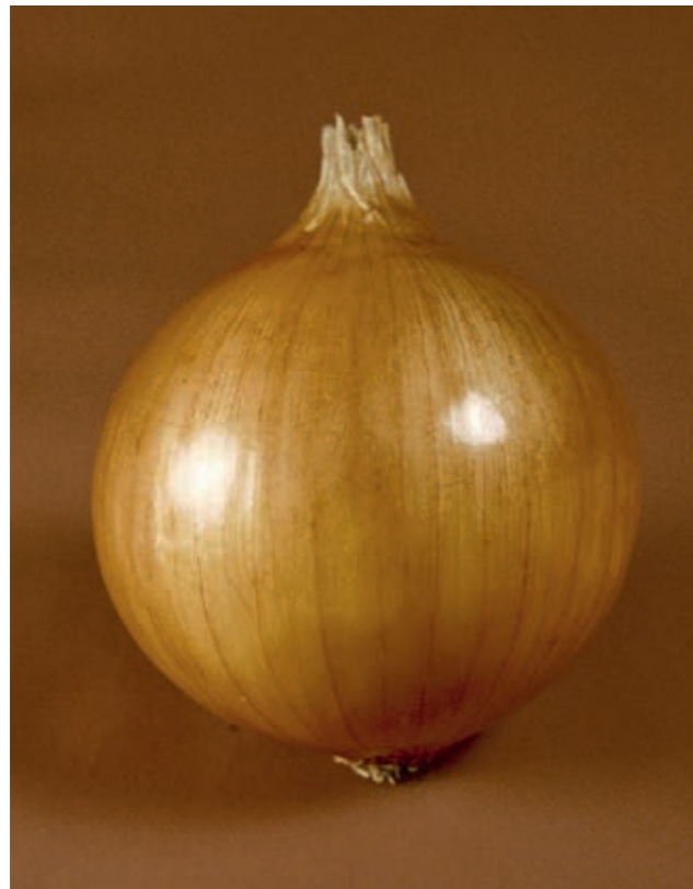
Tough Ball F1

Description: Tough Ball F1 is a fast growing variety with dark green foliage. The bulbs are round to high round with a thin neck. The flesh is firm and the skins are strong with a yellow brown colour. Tough Ball F1 is a high yielding variety and can be used for sowing at lower density.