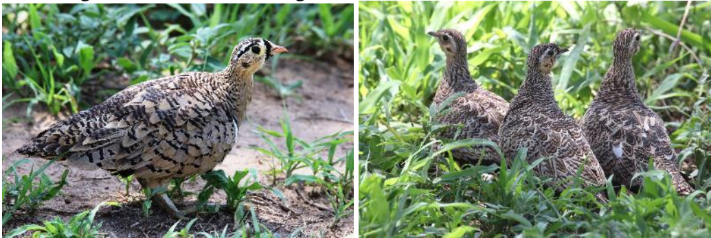
[ Rock Dove Columba livia domest. ]

1 Mediterraneo Hotel, Dar es Salaam 30 Nov. Widespread in towns and villages throughout.