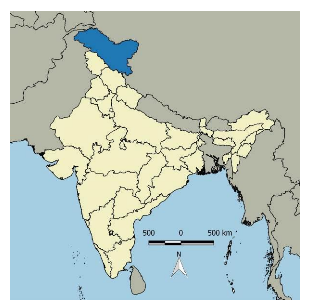
Figure 2. India map showing the Ladakh region

Sahi et al. , (1996) reported the presence of Cyrtodactylus montinum , C. lawderanus , Scincella himalayanum , Elaphe hodgsoni and Ptyas mucosus in their checklist for Jammu and Kashmir. However, none of those species have been reported from Ladakh in the survey conducted by WII and USFWS in 1999–2000 or