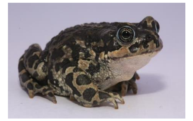
Figure 1. The single amphibian species recorded from Ladakh, Bufotes latastii

maintained. In an effort to fill this knowledge gap, a rapid herpetofaunal assessment survey was conducted during March–September 2019. The survey formed a part of a larger ecological study in the region by the Department of Wildlife Protection, Leh, UT Ladakh.