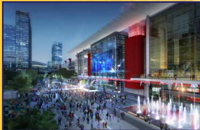
George R. Brown Convention Center

The George R. Brown Convention Center opened in downtown Houston on September 26, 1987. The world-class convention campus has undergone two major expansions, growing the facility to 1.8 million square feet. Two connected hotels were added along with Avenida Plaza , an outdoor pedestrian-friendly event and leisure space featuring restaurants, retail, and free live entertainment. Conference Exhibits will be located in Hall B3 of the Convention Center.