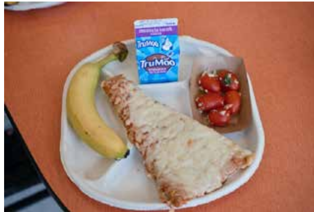
One of our lunches on Plastic Free Lunch Day!

Dallas ISD school cafeterias already use biodegradable and compostable trays and plates. The use of these items prevents millions of environmentally harmful plastic or Styrofoam plates and trays from being dumped into landfills. The elimination of dish machines in Dallas ISD school kitchens saves millions of gallons of water annually and keeps dish machine wastewater from entering drainage systems. Finally, Dallas ISD purchases many fresh Texas-grown seasonal fruits and vegetables, which reduces transportation costs and emissions, compared to purchasing the same items from out-of-state growers and vendors.