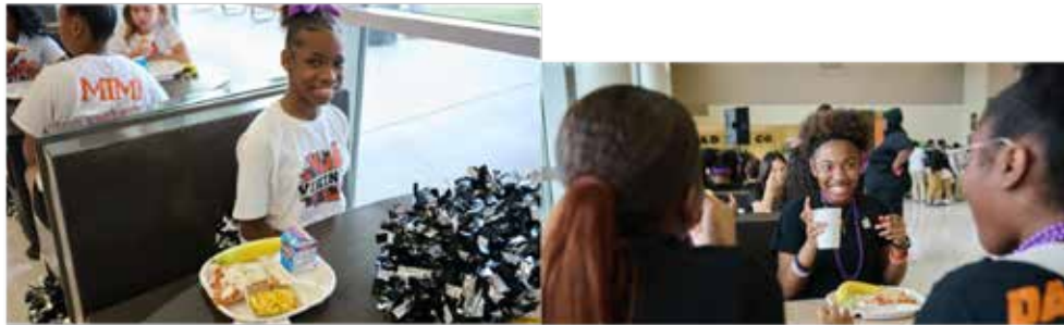
Students at Billy Earl Dade enjoy a delicious and nutritious plastic-free school meal.