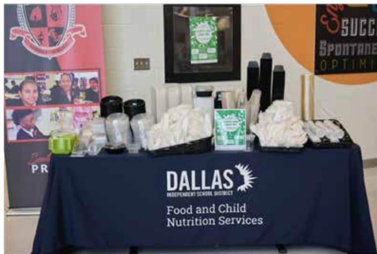
Amount of plastic that was saved during one Lunch period.