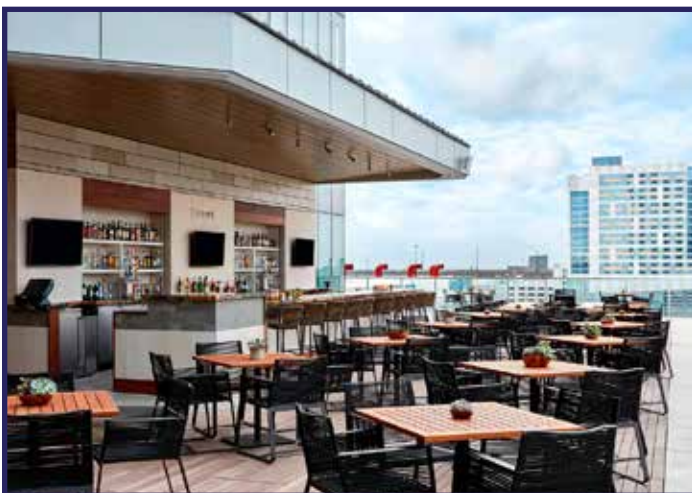
High Dive poolside restaurant at the Marriott Marquis Hotel