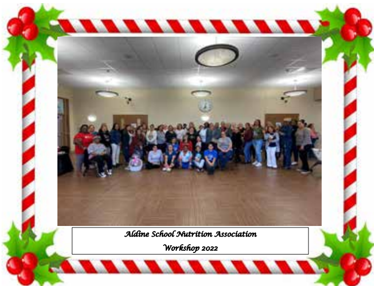
Aldine School Nutrition Association Workshop 2022

We had a successful TASN workshop in December, and taught classes over basic nutrition, HACCP planning, workplace safety, and teamwork. We continued our tradition of selling World's Finest Chocolate throughout the fall semester. We ended the year with our annual Christmas party.