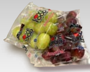
Single Serving Fruits / Veggies