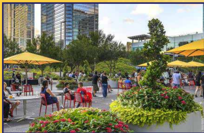
Avenida Plaza Houston

If you opt to call to make your reservation, make sure to mention you're attending the TASN Annual Conference in order to receive the TASN rate.