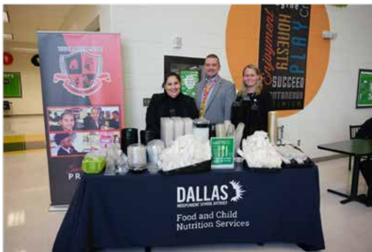
Dallas ISD had the pleasure to enjoy the visit of one of the administrators from the Texas Department of Agriculture.