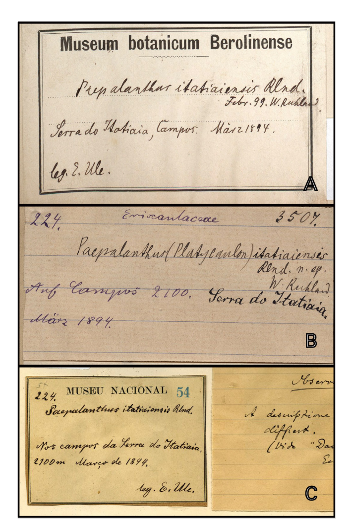
Fig. 4. Labels of different duplicates of a collection of Paepalanthus itatiaiensis . A, Unnumbered sheet at B; B, The HBG specimen with both the provisional and the official number; C, Only the provisional number is annotated on the sheet at R.

For example, one specimen of Paepalanthus itatiaiensis Ruhland (1903) collected by Ule, is not numbered, but includes information pertaining to the collection site and date, all written in Ruhland's hand (Fig. 4A), plus his original drawings and descriptions. In the protologue, Ruhland (1903) gave such information, but cited the examined specimen as "Ule s.n.?". In contrast, at HBG, there is a specimen of P. itatiaiensis numbered Ule 3507 , which also has the same dates and site descriptions as the specimens at B, all written by Ule, and the species name annotated by Ruhland (Fig. 4B). There is a duplicate of this collection at R, not seen by Ruhland, on which Ule wrote complete collection information, but used only his provisional number (Fig. 4C). All these specimens of P. itatiaiensis at B, HBG, and R also are morphologically quite similar, even though the specimen at B is a fragment, presumably removed from the HBG specimen. Thus, in the case of P. itatiaiensis , the three specimens of each held in B, HBG, and R can be unambiguously