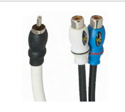
Marine/Powersports RCA Female Y Connector