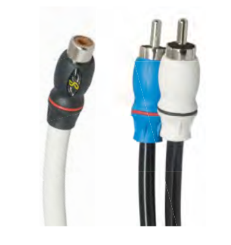
Marine/Powersports RCA Male Y Connector