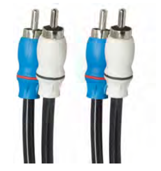
Marine/Powersports RCA 0.5m