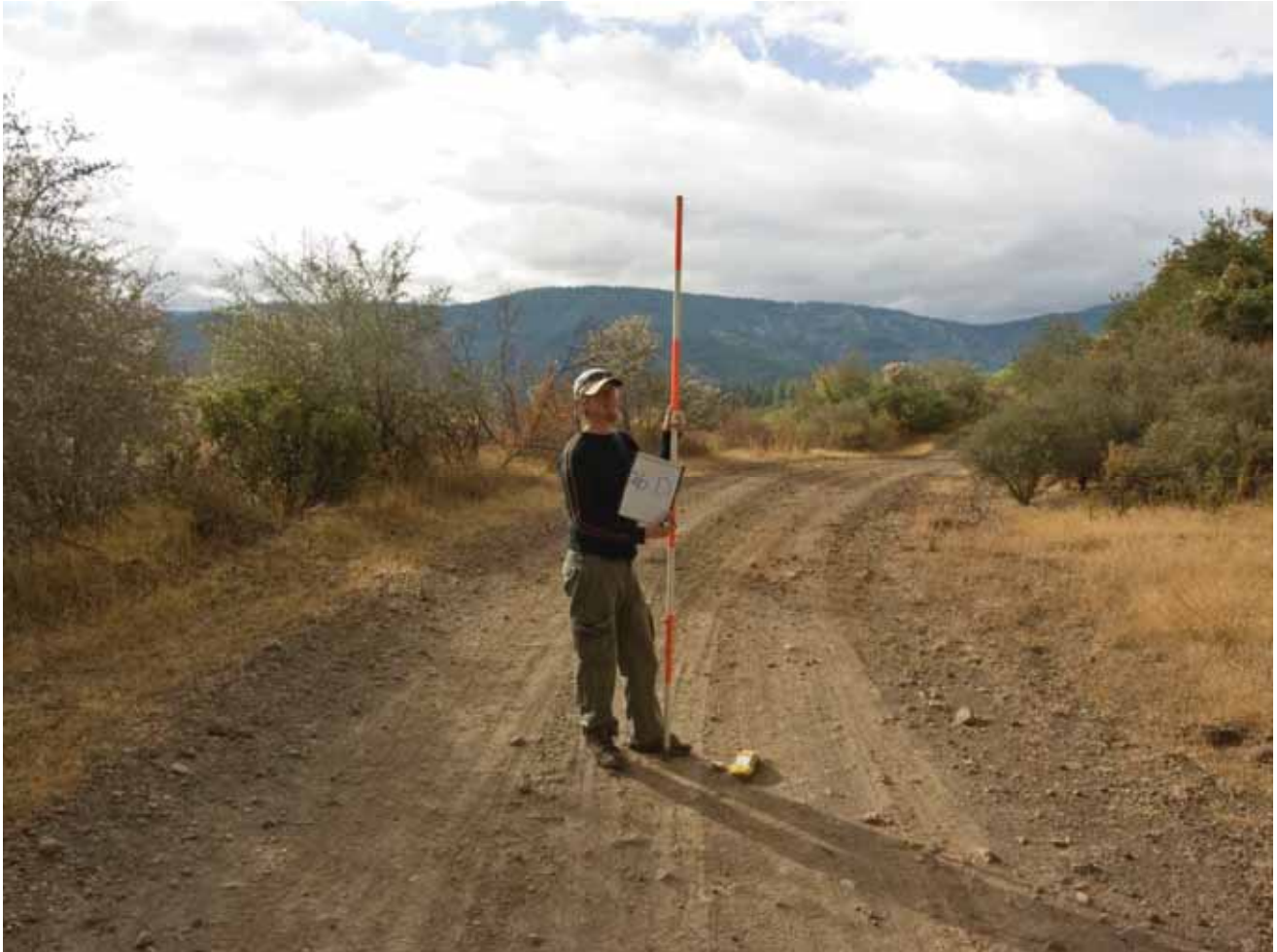
Photo 12: Example of eastside chaparral through which Ponderosa Way passes within the Phase I and Phase II project area. This photograph was taken in the Phase II project area