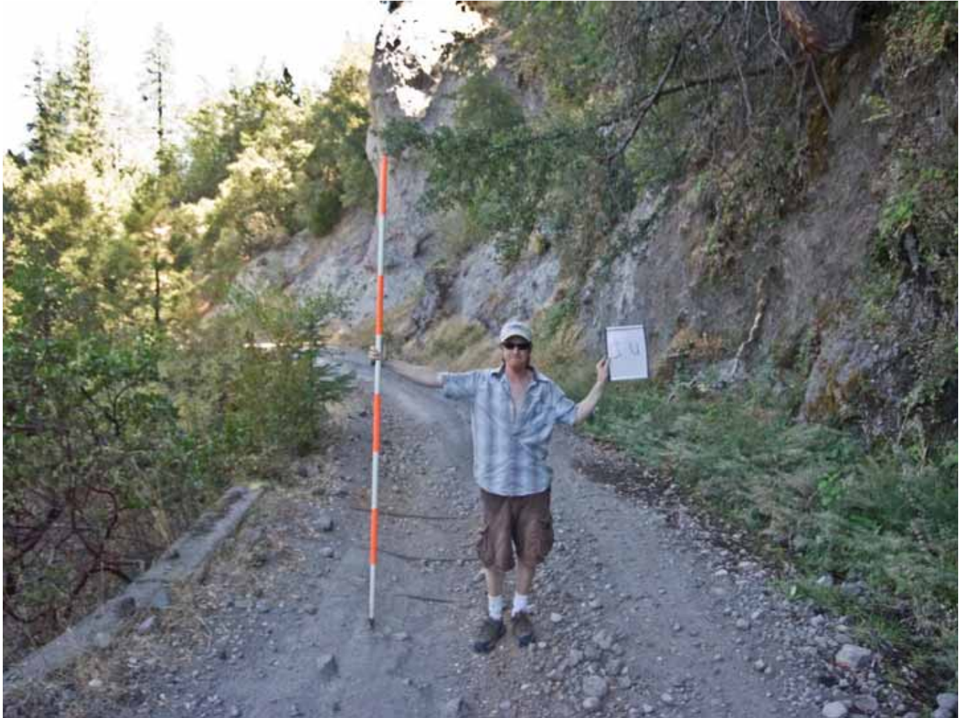
Photo 5. Unstable road fill behind cement retaining wall that is attached to a rock face with rebar. A portion of the rebar has become exposed due to traffic wear on the road bed and subsequent erosion of road fines during rain events. If the rebar separates from the rock face, the retaining wall could fall into the adjacent canyon spilling road fill into stream channels below and effectively severing Ponderosa Way.