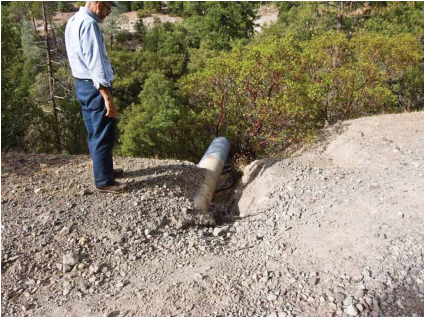
Photo 10: 12” culvert with crushed and blocked inlet. As storm flows fill the inlet and pass across the road prism, they pick up sediment from up slope areas along with road surface fines before passing over the road edge. When operational this “shot gunned” culvert pipe spills water approximately 3’ to an eroded area directly below the pipe outlet. These combined sediment sources are carried downslope into adjacent stream channels.