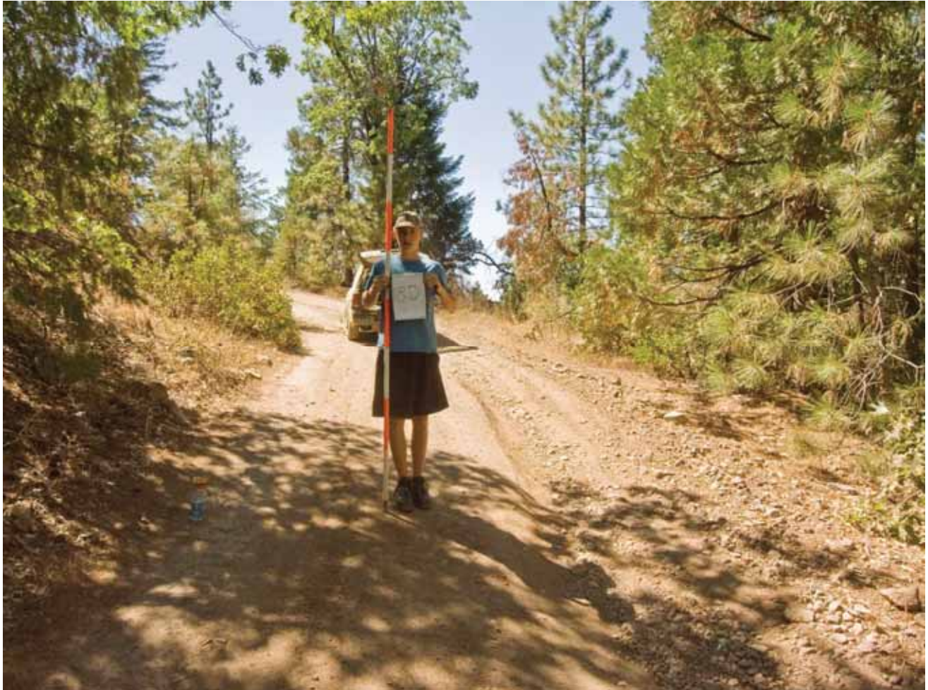
Photo 7. Uncontrolled winter traffic and fine roadbed material have resulted in significant rutting along various Ponderosa Way road segments within the Phase II Project Area. Lateral surface flows have exacerbated roadbed erosion and delivery of fine sediment into stream channels.