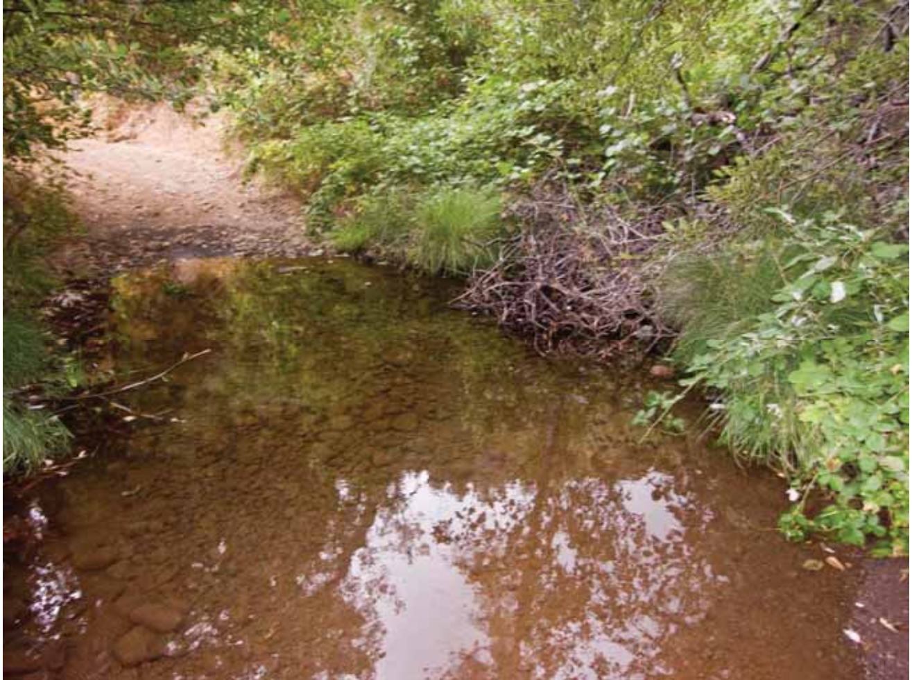
Photo 8. Clogged and undersized culvert has led to uncontrolled surface flows and the creation of a primitive stream crossing. The crossing has under sized rock and generates a considerable amount of sediment during vehicle passage which makes its way into the stream channel.