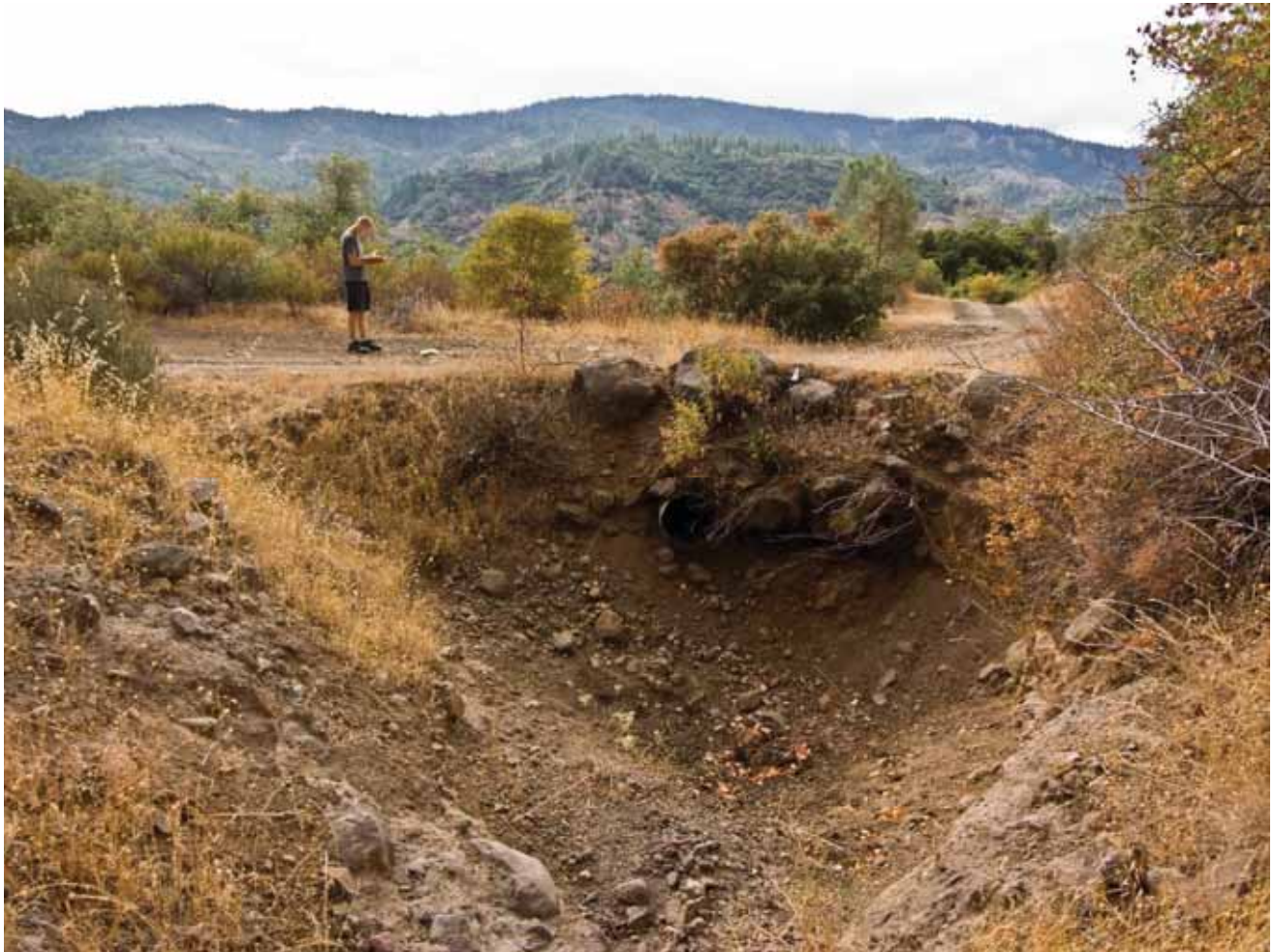
Photo 9. Unlined culvert inlet currently allows storm flows to cut at road fill and the road's surface. This material is carried down slope into tributary channels of anadromous fish streams located within the Phase II project area.