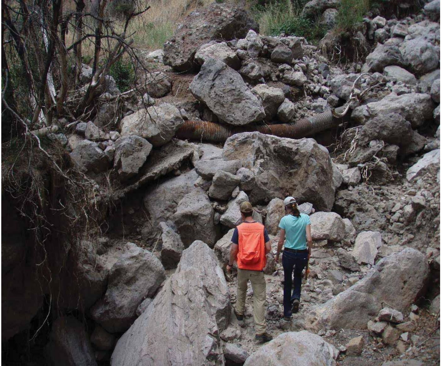
Photo 3. Stream crossing has been washed out by debris flow. Throughout the Phase I project area undersized culverts have been plugged by debris with stream crossings becoming overtopped. The stream crossing road fill prism then washes out from downcutting and headward migration.