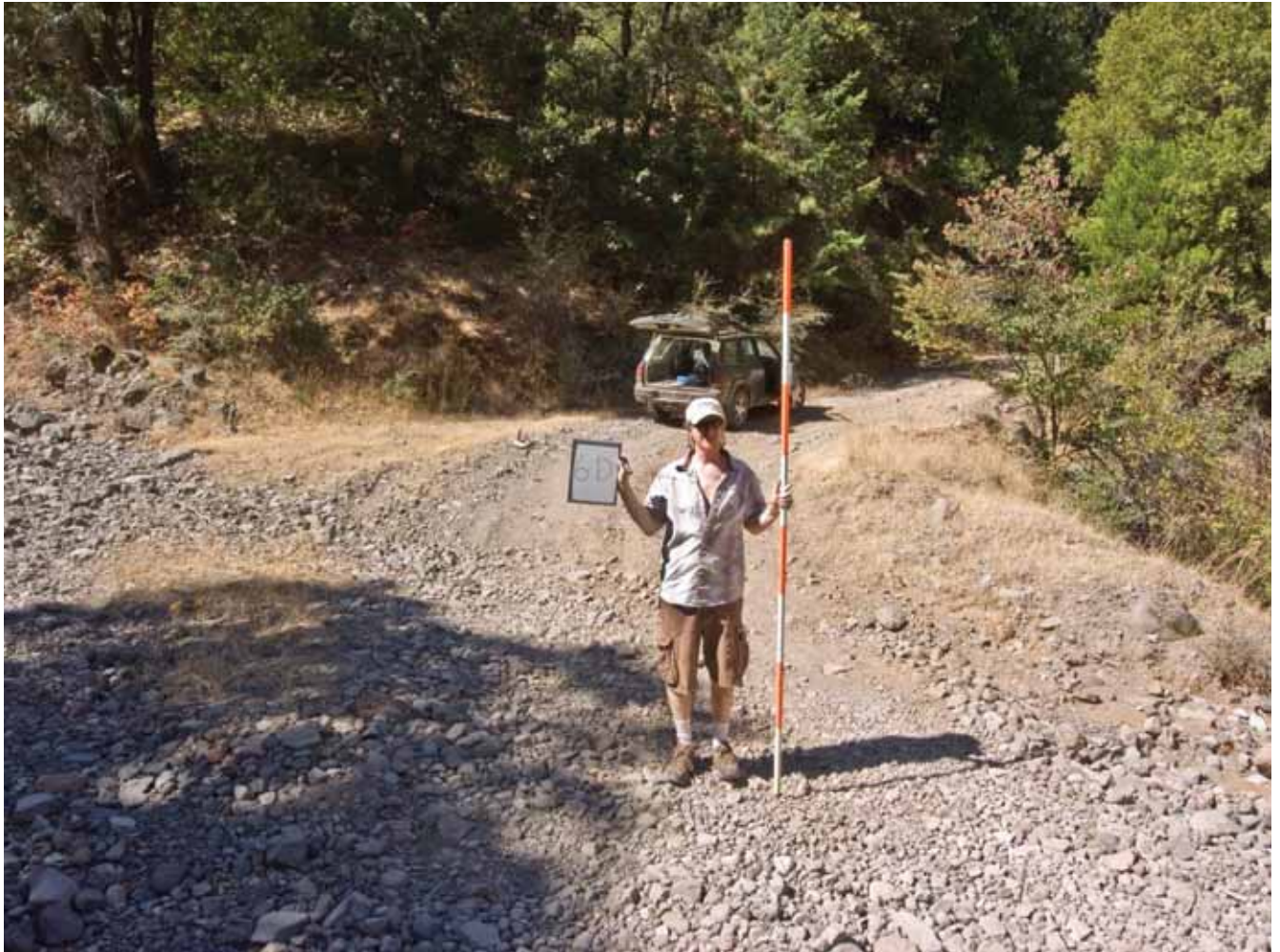
Photo 6. Example of primitive low water crossing at an intermittent stream found along Ponderosa Way. The Crossing consist of rocks placed in the road cut that have been created by stream flows. These crossings provide no control of stream flows being delivered from the adjacent stream channels and rocked areas do not protect the entire portion of the road surface that is inundated during storm flows. As result significant amounts of sediment make their way into this tributary to Deer Creek’s mainstem.