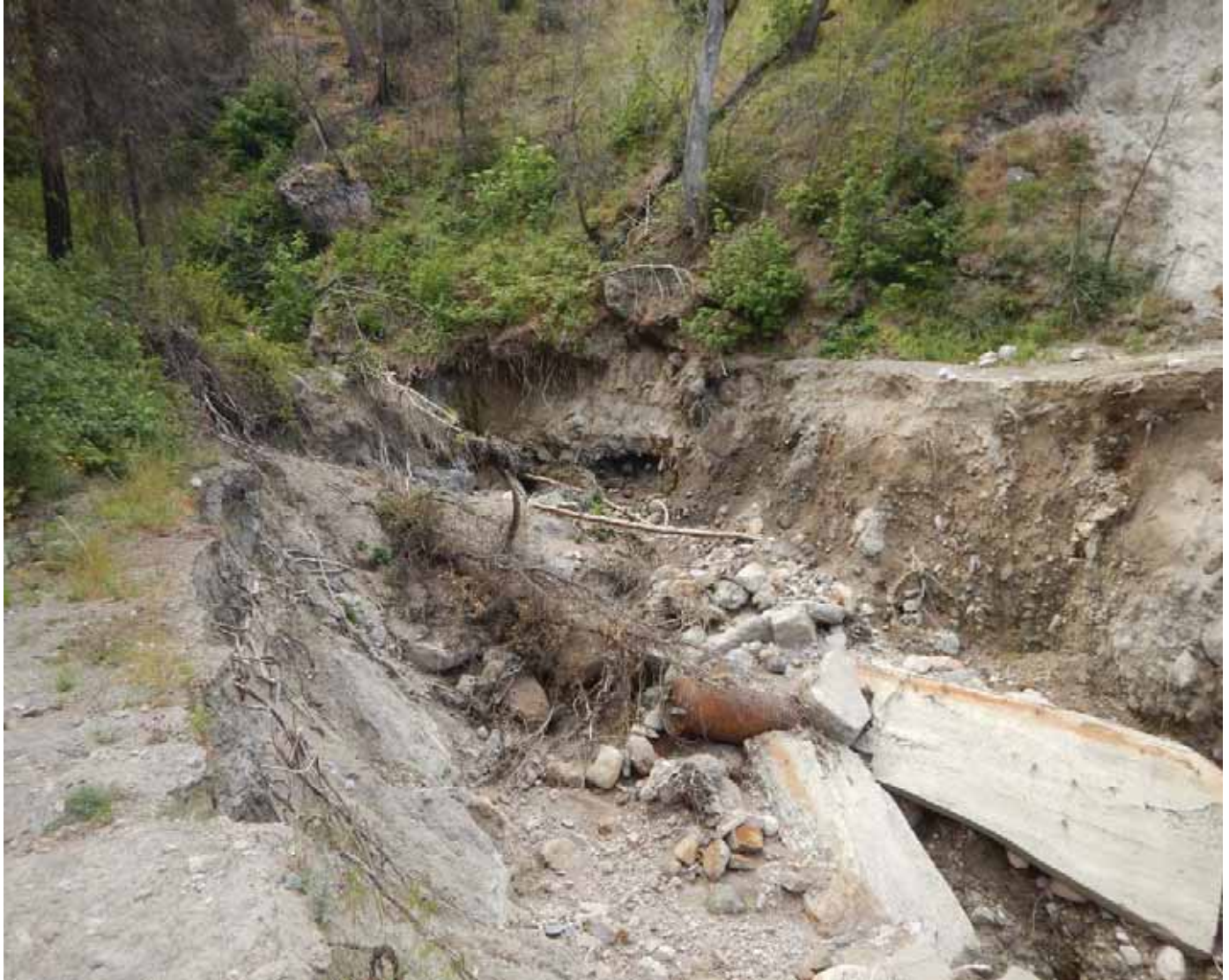
Photo 2. Example of large scale erosion and sediment flows at stream crossings within the Phase I project area.