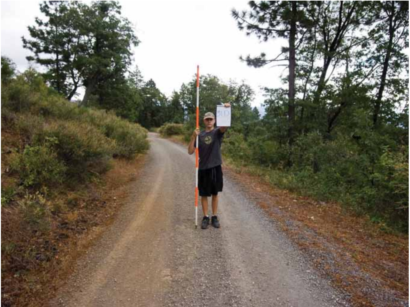
Photo 13: Example of eastside low elevation mixed oak/conifer forest through which Ponderosa Way passes within the Phase I and Phase II project area. This photograph was taken in the Phase II project area