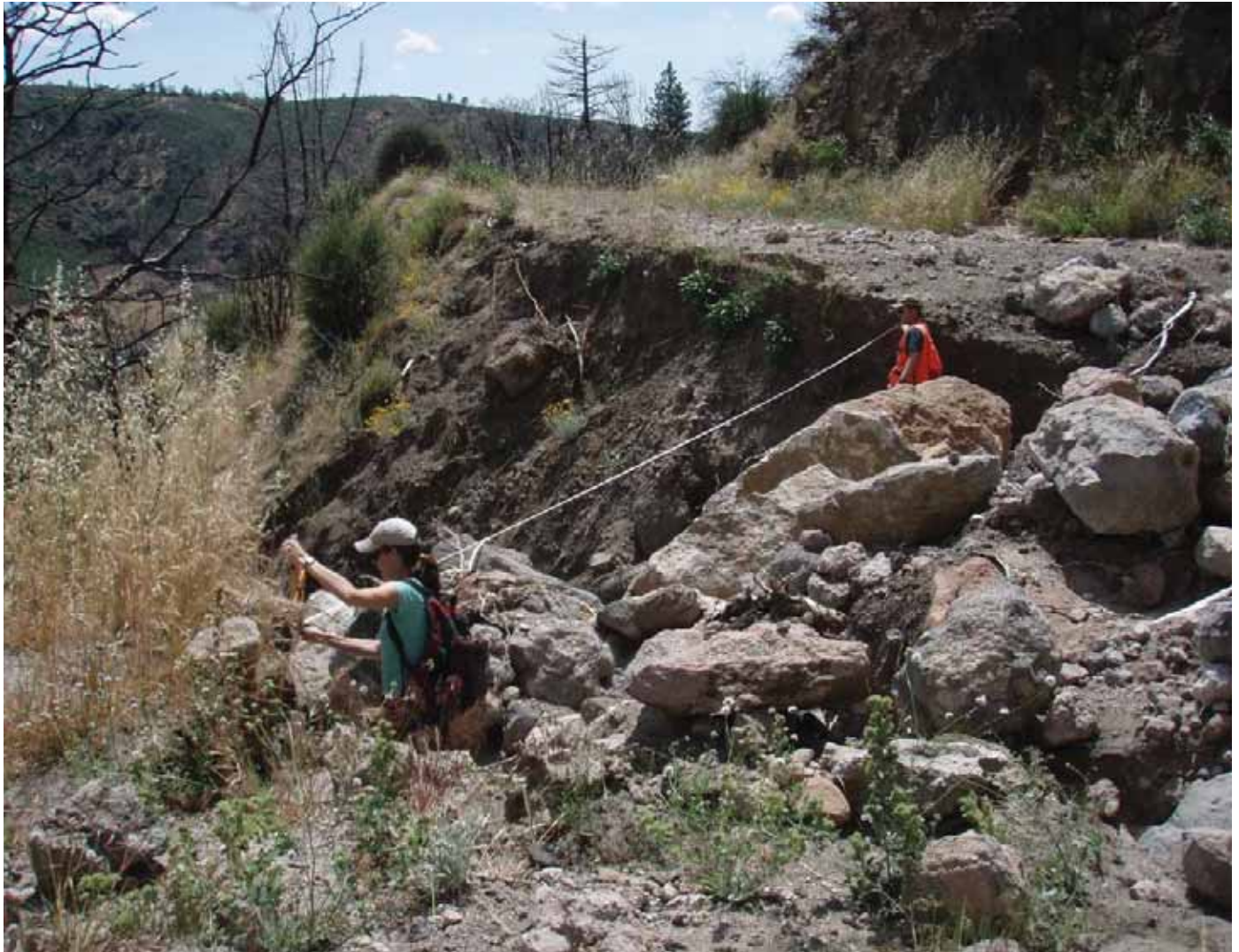
Photo 4. Large portion of outboard road slope eroded from overtopped stream crossing.