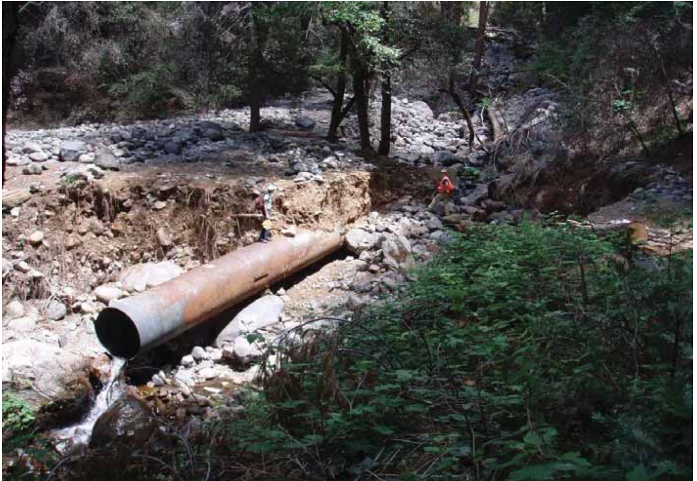
Photo 1. Stream crossing has been washed out by debris flow exposing the crossing culvert. Note geologists for scale.