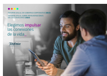
CORPORATE GOVERNANCE REPORT AND REPORT ON REMUNERATIONS