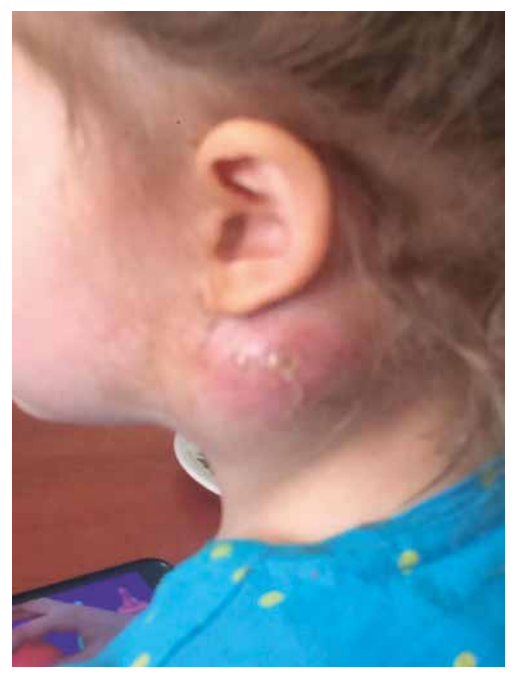
FIGURE 1. Persistent left-sided lymphadenopathy with erythematous overlying skin and abscess-like formation after first surgical intervention