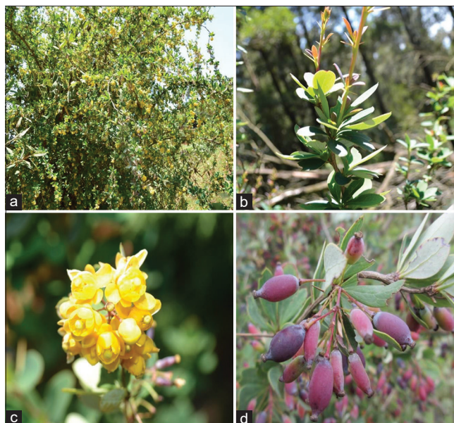
Figure 1: (a) Habit of Berberis tinctoria , (b) leaves, (c) flower, and (d) fruit

B. tinctoria is an evergreen shrub; endemic to South Western Ghats, predominantly found in the higher altitude of The Nilgiris, Tamil Nadu, India. [17] Figure 1 shows the habit of the plant which is in variable size and form, often 1–2 m high,