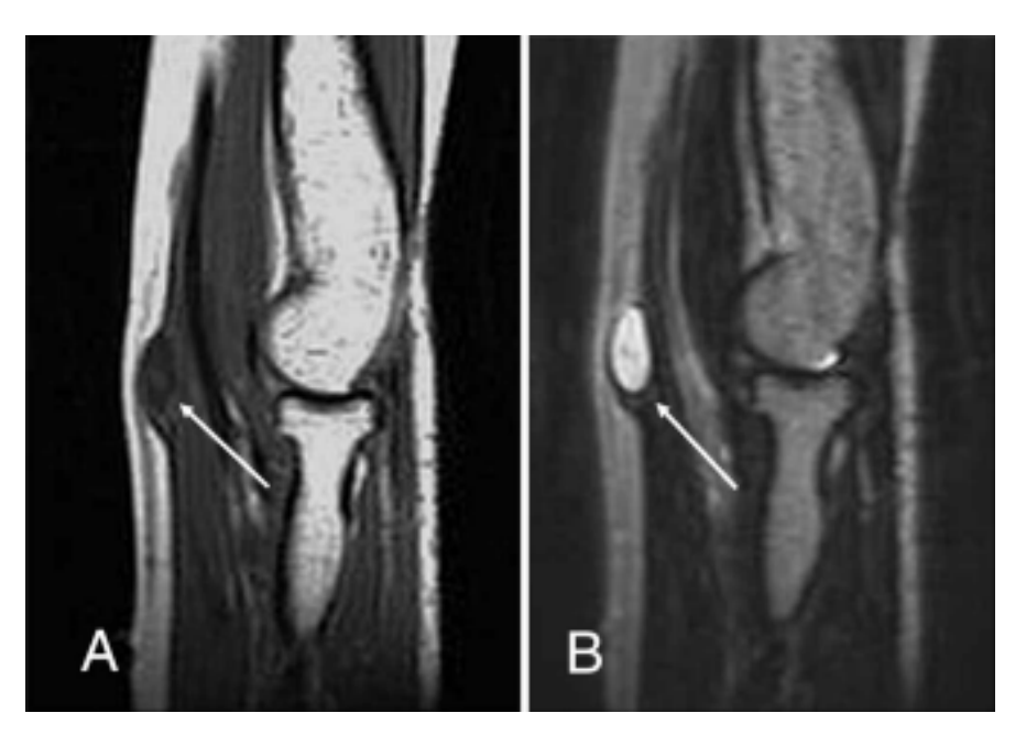
Fig. 1 A) Sagittal T1- weighted B) T2-weighted, MR images revealing a small well-defined elliptical shaped cystic lesion with internal content located in the periphery of the pronator muscle (arrows)